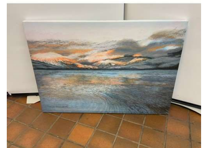
128. V - SUNLIGHT THROUGH THE OAK TREE CANVAS RRP £38