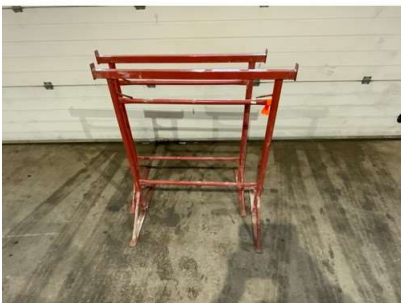
151. V - 2 X BUILDERS TRESTLES