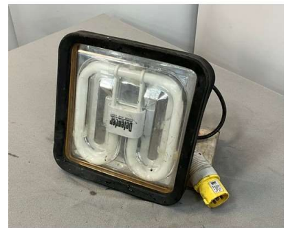
39. V - 110V DEFENDER SITE LIGHT