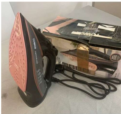
52. V - TOWER CERAGLIDE ULTRASPEED STEAM IRON MODEL T22013