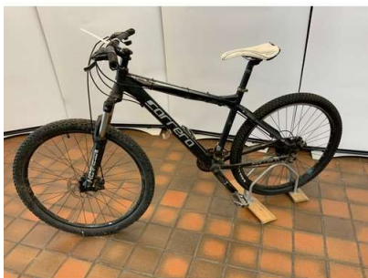
3. V - BLACK CARRERA VENGEANCE LIGHT WEIGHT ALUMINIUM FRAME 24 SPEED WITH 27.7 INCH WHEELS MOUNTAIN BIKE - COST NEW £385 (9623)