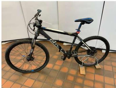
142. V - GREY WHITE CARRERA VENGEANCE 6061 T6 ALUMINIUM FRAME MOUNTAIN BIKE - COST NEW £360 (9619)