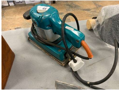
35. V - WULF BELT SANDER