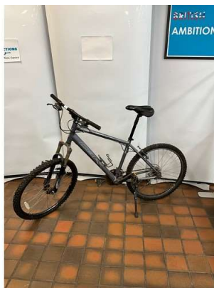
5. V - GREY CBR COMFORT (9674)