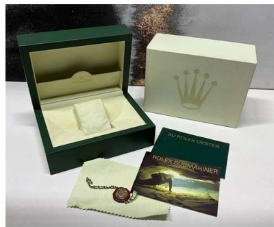
188. V - ROLEX OYSTER SUBMARINER WATCH BOX (9551 1834)