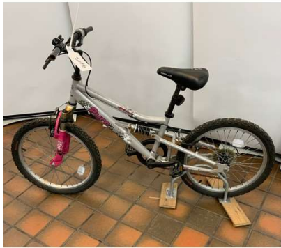
1. V - GREY / PINK APOLLO PURE CHILDS BIKE, 16 INCH WHEELS (9673)