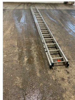
146. V - 14FT EXT ALU LADDER