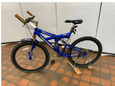
141. V - TOREADOR MARS SPORTS BIKE WITH 26' wheels (9605)