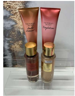
107. V - 4 X VICTORIA SECRETS ITEMS - 2 X 250ML BODY MIST, 2 X 236ML LOTION PEPRUME - TOTAL RRP £72 (9681)