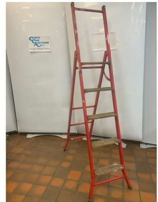
158. M - RED 5 STEP LADDER SERIAL NO 910547180 RATING 95KG