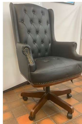
59. M - NEW DIRECTORS CHAIR RRP £200+