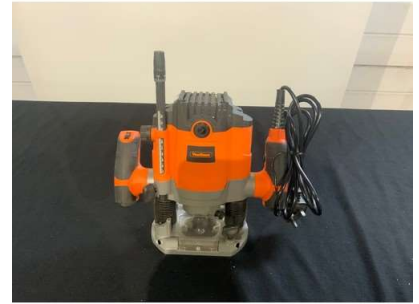
38. M - VONHAUS 240V WOOD ROUTER 3500019 RRP £79.99