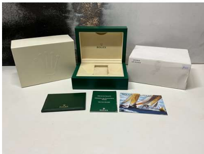
185. V - ROLEX YACHT MASTER WATCH BOX & BOOKS (9551 1922)