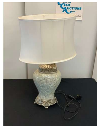
80. M - MIRROR EFFECT TABLE LAMP