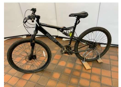
10. V - APOLLO GRADIENT ALUMINIUM FRAME CROSS COUNTRY BIKE WITH 27.5" WHEELS - COST NEW £285 (9613)