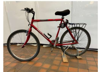
9. V - RED RALEIGH FIREFLY MOUNTAIN BIKE WITH 26" WHEELS (9608)