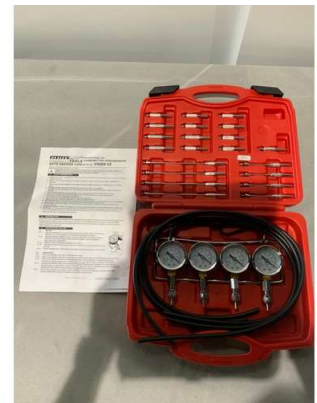
40. M - SEALEY CARBURETTOR SYNCHRONIZER VS209.V2 RRP £131.74