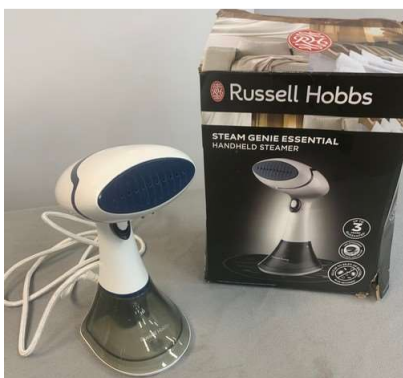
53. V - RUSSELL HOBBS HANDHELD STEAMER 1600W MODEL 25591