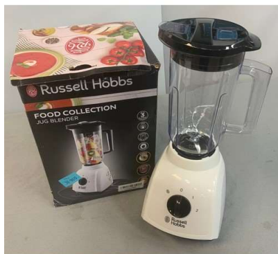
57. V - RUSSELL HOBBS FOOD BLENDER MODEL 24610 400W