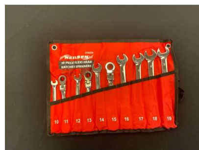
19. V - 10PC FLEXI-HEAD COMBINATION RATCHET SPANNER SET