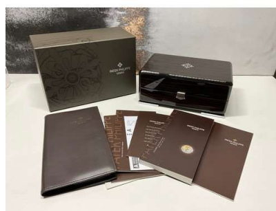
189. V - PATEK PHILIPPE CALIBER 324 WATCH BOX COMPLETE WITH MANUALS (9551)