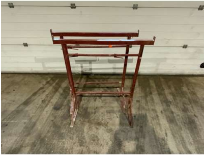
149. V - 2 X BUILDERS TRESTLES