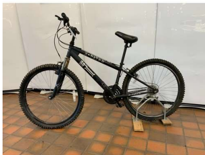
144. V - APOLLO X RATED TEEN DIRT MOUNTAIN BIKE WITH 26" wheels (9616)