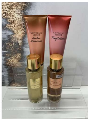
105. V - 4 X VICTORIA SECRETS ITEMS - 2 X 250ML BODY MIST, 2 X 236ML LOTION PEPRUME - TOTAL RRP £72 (9681)