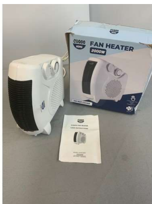
56. V - CUQOO FAN HEATER 2000W MODEL DYN12000