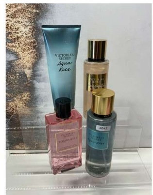
118. V - 4 VICTORIA'S SECRET ITEMS - 2 X 250 ML MIST, 1 X 236ML LOTION PERFUME, 1 X 250ML PERFUME - TOTAL RRRP £76 (9681)