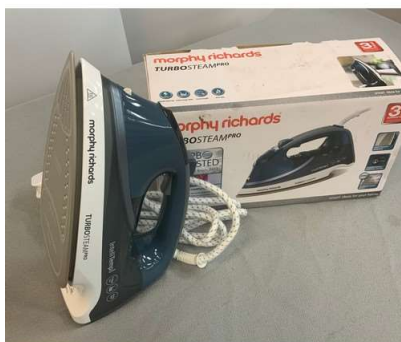
77. V - MORPHY RICHARDS TURBO STEAM PRO 3100W IRON MODEL 303131