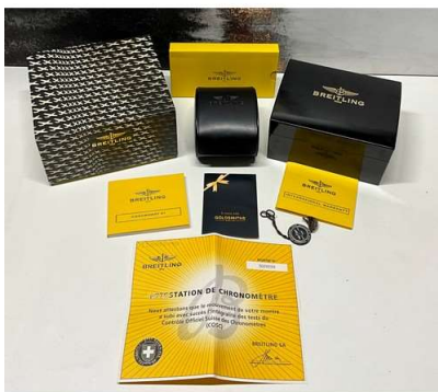
184. V - BREITLING WATCH BOX AND PAPERS (9551 1752)