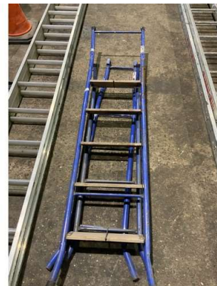
147. V - 5 TREAD STEP LADDER