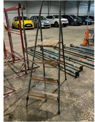
157. V - 3 TRED STEP LADDER