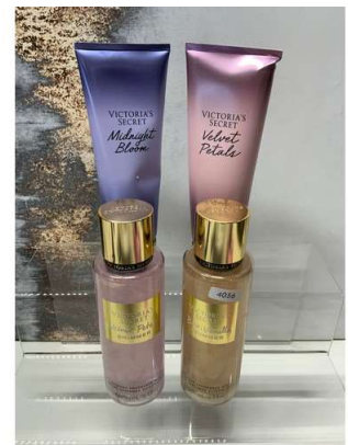
108. V - 4 X VICTORIA SECRETS ITEMS - 2 X 250ML BODY MIST, 2 X 236ML LOTION PEPRUME - TOTAL RRP £72 (9681)