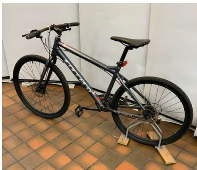
2. V - GREY CARRERA SUBWAY ONE MOUNTAIN BIKE, 27 INCH WHEELS- RRP £276 (9670)