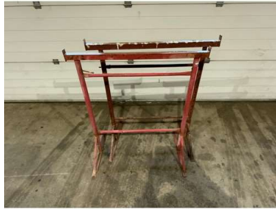
153. V - 2 X BUILDERS TRESTLES