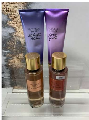
106. V - 4 X VICTORIA SECRETS ITEMS - 2 X 250ML BODY MIST, 2 X 236ML LOTION PEPRUME - TOTAL RRP £72 (9681)