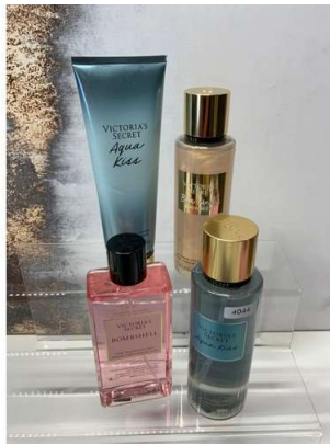
123. V - 4 VICTORIA'S SECRET ITEMS - 2 X 250 ML MIST, 1 X 236ML LOTION PERFUME, 1 X 250ML PERFUME - TOTAL RRRP £76 (9681)