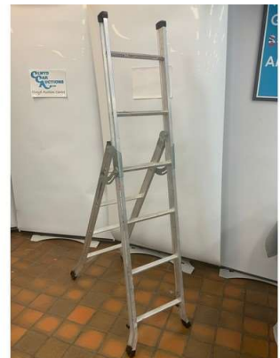
159. M - ABRU WERNER 3 WAY COMBINATION LADDER MAX LOAD 95KG BATCH NO W060133