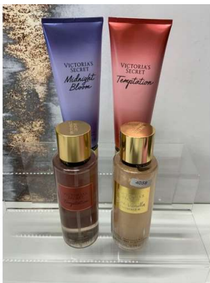
102. V - 4 X VICTORIA SECRETS ITEMS - 2 X 250ML BODY MIST, 2 X 236ML LOTION PEPRUME - TOTAL RRP £72 (9681)