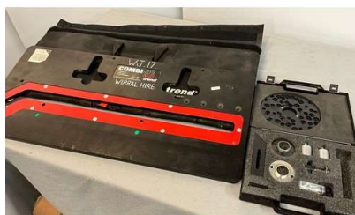
17. V - TREND COMBI WORKTOP JIG 640H (ROUTER JIG)