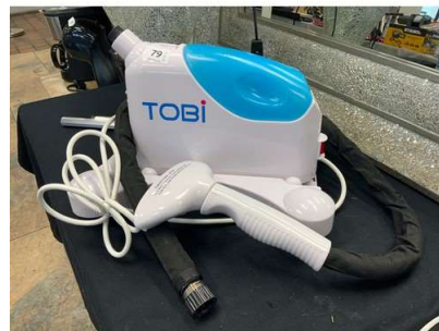
79. V - TOBY STEAMER MODEL KB1126