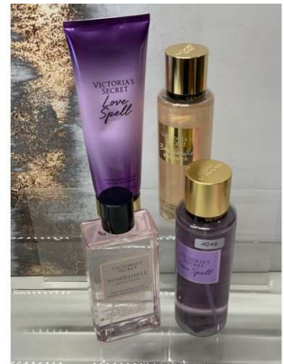
117. V - 4 VICTORIA'S SECRET ITEMS - 2 X 250 ML MIST, 1 X 236ML LOTION PERFUME, 1 X 250ML PERFUME - TOTAL RRRP £76 (9681)