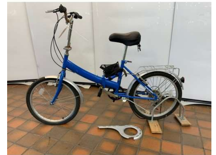
8. V - RALEIGH BLUE FOLDING BIKE WITH 20" WHEELS - COST NEW £399 (9607).