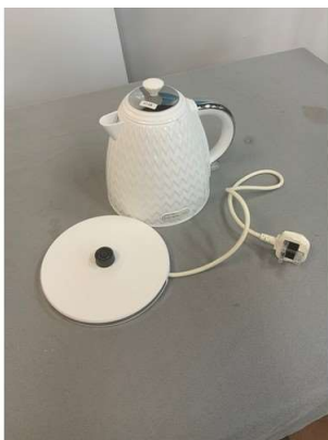
73. V - DAEEO ARGILE JUG KETTLE MODEL SDA1780