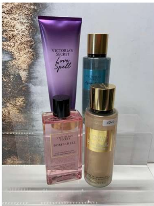
121. V - 4 VICTORIA'S SECRET ITEMS - 2 X 250 ML MIST, 1 X 236ML LOTION PERFUME, 1 X 250ML PERFUME - TOTAL RRRP £76 (9681)