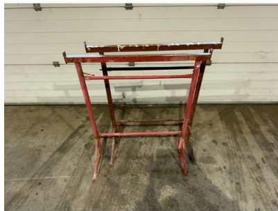
154. V - 2 X BUILDERS TRESTLES