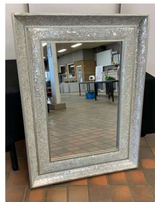
81. M - WALL MIRROR WITH CRAZED MIRROR SURROUND