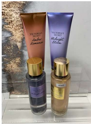
104. V - 4 X VICTORIA SECRETS ITEMS - 2 X 250ML BODY MIST, 2 X 236ML LOTION PEPRUME - TOTAL RRP £72 (9681)