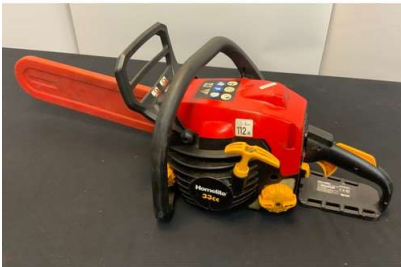
33. M - HOMELITE 33CC PETROL CHAIN SAW