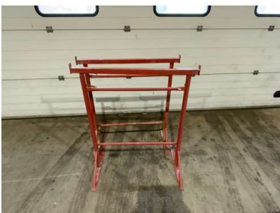
152. V - 2 X BUILDERS TRESTLES