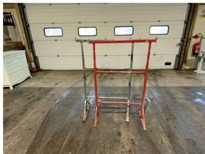
155. V - 2 X BUILDERS TRESTLES