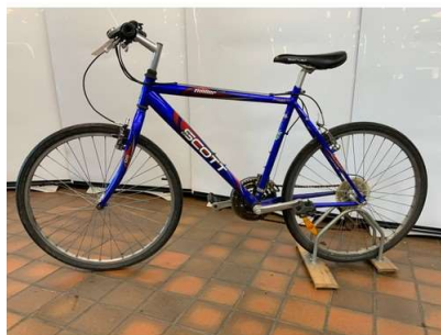
6. V - SCOTT TIMBER CONCEPT EXPLORER 19" ALUMINIUM FRAME WITH 26" WHEELS MOUNTAIN BIKE (9609)