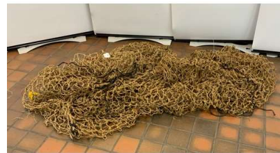
145. M - TRUCK CARGO NET