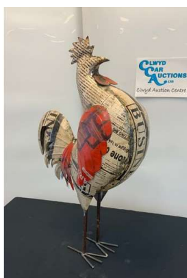
12. M - DECORATIVE METAL COCKERAL