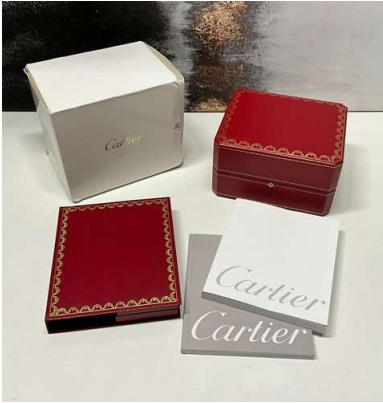
183. V - CARTIER WATCH BOX & BOOKS (9551 1932)