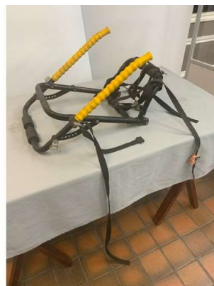
60. V - REAR MOUNTED BIKE RACK FOR 2 BIKES