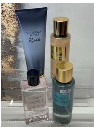
122. V - 4 VICTORIA'S SECRET ITEMS - 2 X 250 ML MIST, 1 X 236ML LOTION PERFUME, 1 X 250ML PERFUME - TOTAL RRRP £76 (9681)