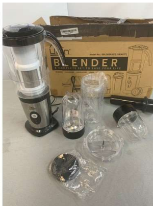
114. V - UTEN BLENDER MODEL NO - SBL365ABCE (UEA027)