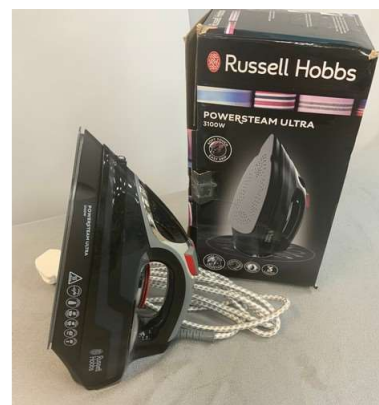
61. V - RUSSELL HOBBS POWERSTEAM ULTRA 3100W IRON MODEL 20630