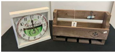
110. M - WOODEN KITCHEN STORAGE RACK WITH GORDONS GIN WALL CLOCK