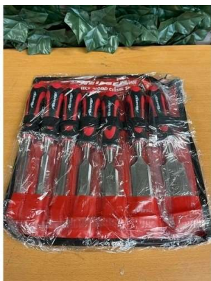
15. V - NEW NEILSON WOOD CHISEL SET - 7PC (CT0054)