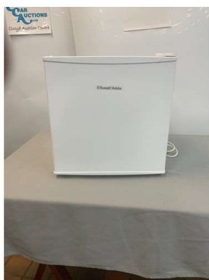
13. M - RUSSELL HOBBS FRIDGE MODEL RH TTLFI-AZ 220-240V