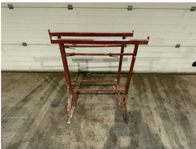
150. V - 2 X BUILDERS TRESTLES