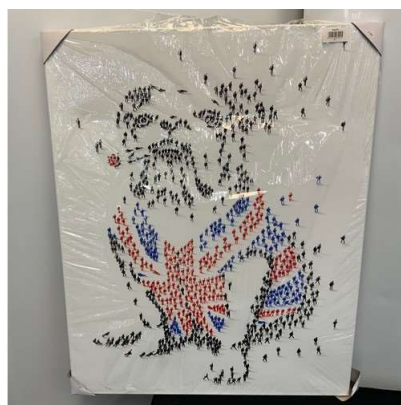
58. M - BRITISH BULLDOG PICTURE