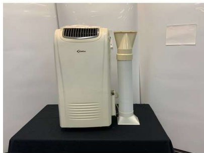
11. M - DELTA AIR CONDITIONING UNIT (MODEL IG3711)