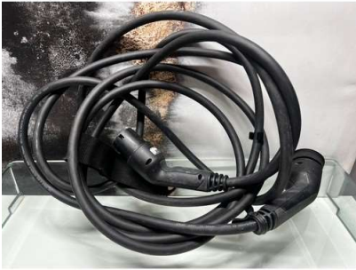
32. V - DEFA ECONNECT EV CHARGING CABLE MODEL DEVC/T2/P3/32 480V - 32A RRP £95 (9670)