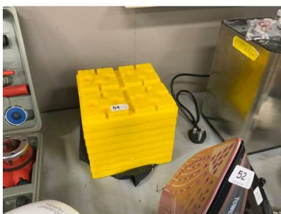
54. V - 8 LEVELLING BLOCKS