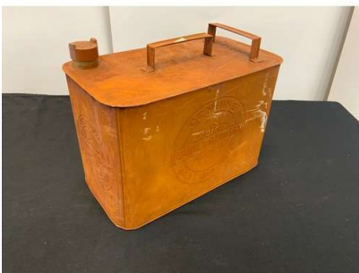
34. M - HARLEY DAVIDSON METAL CONTAINER