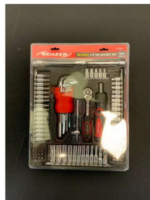
18. V - 84PC 1/4 OMCJ DRIVE SOCKET SET