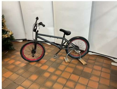
4. V - GREY BMX CHILDS BIKE, (9674)