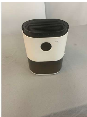
78. V - ROHS MULTIFUNTION DEHUMIDIFIER MODEL DH-CS02