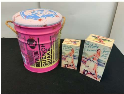
112. M - BREWDOG STORAGE FOOT STOOL & LES BELLES STORAGE BOXES X 2