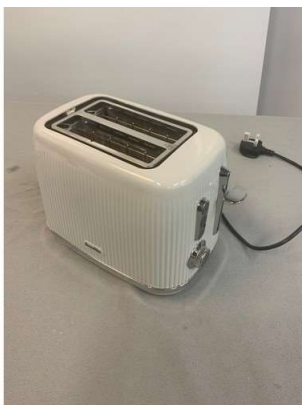
74. V - BREVILLE THICK SLICE TOASTER MODEL R270DG