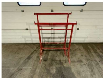
156. V - 2 X BUILDERS TRESTLES