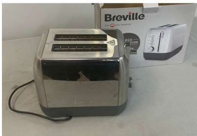
72. V - BREVILLE 2 SLICE TOASTER (EDGE COLLECTION) R235NYH