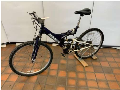
139. V - HAITI MAGNA PURPLE / WHITE MOUNTAIN BIKE (9615)