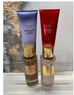
109. V - 4 X VICTORIA SECRETS ITEMS - 2 X 250ML BODY MIST, 2 X 236ML LOTION PEPRUME - TOTAL RRP £72 (9681)