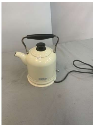
76. V - HAYDEN 1.5 LIT ELECTRIC KETTLE CREAM MODEL 197238