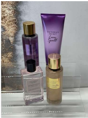
120. V - 4 VICTORIA'S SECRET ITEMS - 2 X 250 ML MIST, 1 X 236ML LOTION PERFUME, 1 X 250ML PERFUME - TOTAL RRRP £76 (9681)