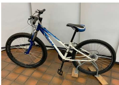
140. V - BLUE/WHITE CHILDS APOLLO XC24 MOUNTAIN BIKE, 20 INCH WHEELS (9675)