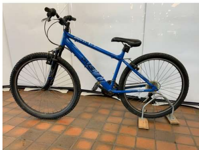
143. V - APOLLO PHAZE MENS BIKE WITH 27.5" WHEELS - COST NEW £156 (9610)