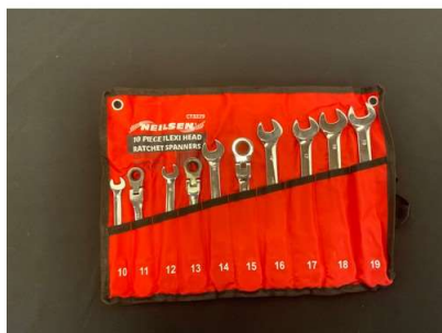
16. V - 10PC FLEXI-HEAD COMBINATION RATCHET SPANNER SET