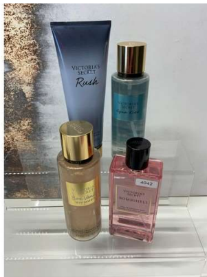
124. V - 4 VICTORIA'S SECRET ITEMS - 2 X 250 ML MIST, 1 X 236ML LOTION PERFUME, 1 X 250ML PERFUME - TOTAL RRRP £76 (9681)