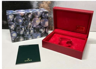
187. V - ROLEX OYSTER DATEJUST WATCH BOX - Red (9551 1928)