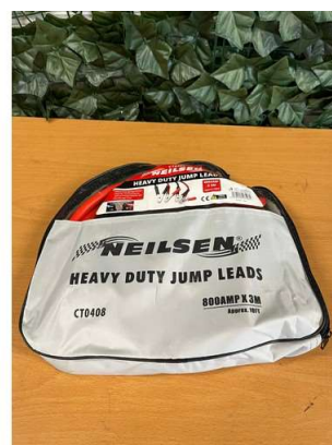
20. V - 800 AMP HD JUMP LEADS 3M