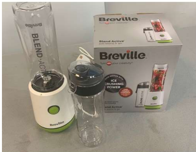
111. V - BREVILLE BLEND ACTIVE 350W MODEL SK83GQ