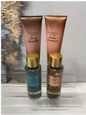
101. V - 4 X VICTORIA SECRETS ITEMS - 2 X 250ML BODY MIST, 2 X 236ML LOTION PEPRUME - TOTAL RRP £72 (9681)