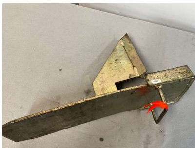
37. V - STRONG BOY