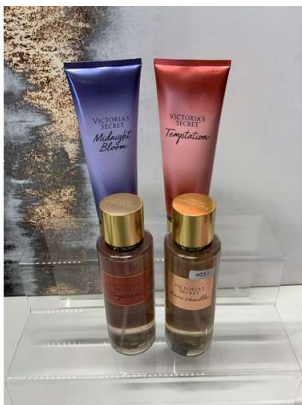
103. V - 4 X VICTORIA SECRETS ITEMS - 2 X 250ML BODY MIST, 2 X 236ML LOTION PEPRUME - TOTAL RRP £72 (9681)