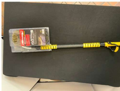
36. V - TELESCOPIC WATER BRUSH (ATTACH TO HOSE)