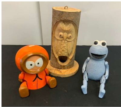
113. M - 3 CHILDS WOODEN NOVELTY TOYS