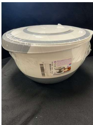
115. V - 1 X LARGE 5L MIXING BOWLS WITH LID RRP £14.99 (9572)