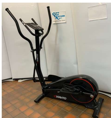
125. M - VIAVITO SINA FITNESS EXERCISE CARDIO WORKOUT ELLIPTICAL CROSS TRAINER RRP £349