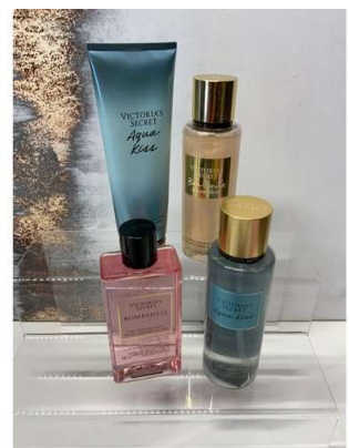
119. V - 4 VICTORIA'S SECRET ITEMS - 2 X 250 ML MIST, 1 X 236ML LOTION PERFUME, 1 X 250ML PERFUME - TOTAL RRRP £76 (9681)