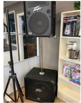
126. M - PAIR OF PEAVEY SPEAKERS ON STAND