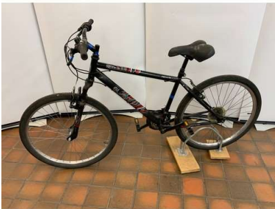
34. M - APOLLO SLANT MEDIUM FRAME 26X175 WHEELS BIKE