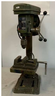
74. M - NU-WAY 240V PILLAR DRILL CF-10 MFX DATE 1980