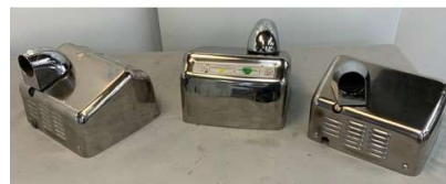
118. M - 3 X WORLD AUTOMATIC HAND DRYERS - MODEL DXA48