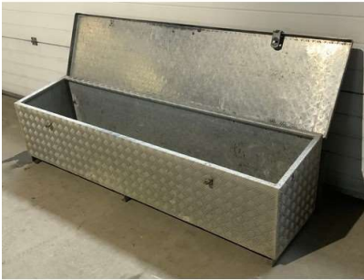
41. M - STEEL TOOL STORAGE UNIT L 6.6 FT X W19" X H 21"