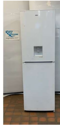
44. M - BEKO FRIDGE FREEZER WITH WATER DESPENSER MODEL CDF6914W