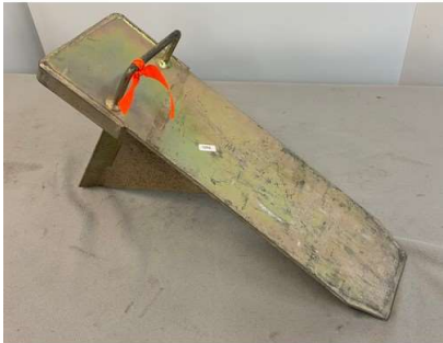
53. V - STRONG BOY