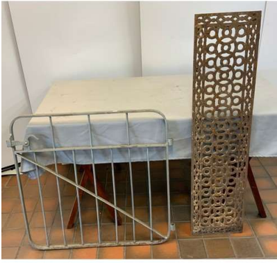
8. M - STEEL GARDEN GATE 33" X 32.5 " & ORNAMENTAL GRID COVER 12" X 50"