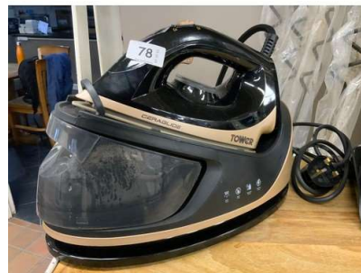
109. V - TOWER CERAGLIDE STEAM GENERATED IRON RRP £68