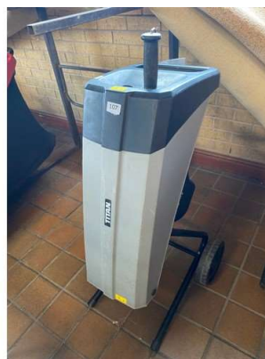
7. M - TITAN 2000W ELEC SHREDDER UNIT