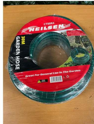
116. V - NEW NEILSON GARDEN HOSE 30 METRE