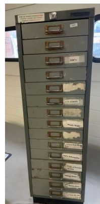
15. M - 15 DRAW FILING CABINET