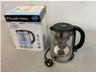
112. V - RUSSELL HOBBS GLASS KETTLE 3000W 1 LTR CAPACITY