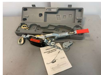
94. M - ROLSON CABLE PULLER