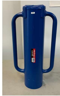
139. V - NEW NEILSON 6" POST RAMMER 68 X 40 X 16.5CM (CT2657)