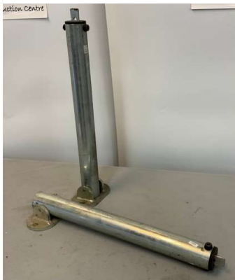
27. M - 2 X POP UP SECURITY POSTS