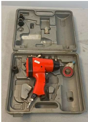
72. V - FAIRLINE AIR IMPACT GUN KIT - MODEL FD553061