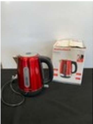
129. V - MORPHY RICHARDS EQUIP 1.7L JUG KETTLE RRP £30