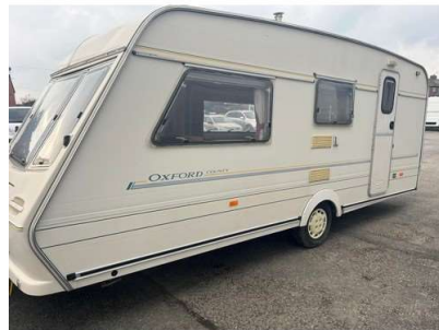
173. M - APPROX 2007 ABBEY OXFORD COUNTY 4 BERTH CARAVAN WITH AWNING - CHASSIS NUMBER SW50060527