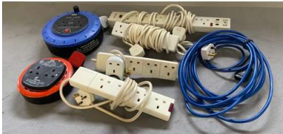
54. M - SET OF EXTENSION LEADS