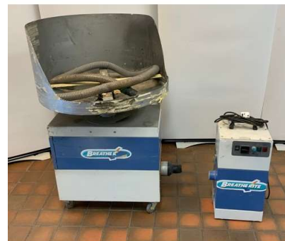
38. M - BREATHE RITE CAR WHEEL REFURBING , PAINT EXTRACTION 240V HANDY CART UK