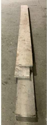
168. V - 2 X 10FT & 1 X 12'10" SCAFFOLD BOARD