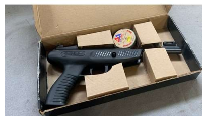
142. M - MAGTECH AIR PISTOL