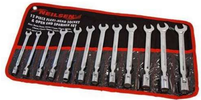
81. V - NEW NEILSON 12 PCS FLEXI SOCKET & OPEN END WRENCH SET