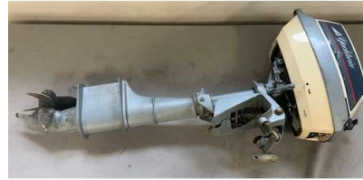
59. M - YAUGHTWIN EVINRUDE 4.0 ENGINE