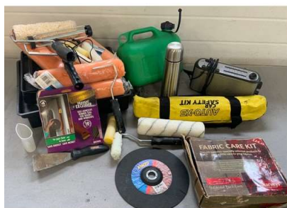
1A. M - SUNDRY BOX