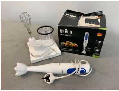
119. V - BRAUN MULTI QUICK3 HAND BLENDER