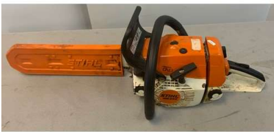
64. V - STIHL MS240 PETROL CHAIN SAW