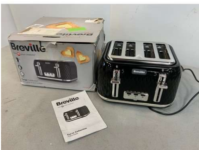
114. V - BREVILLE 4 SLICE TOASTER BLACK CURVE COLLECTION