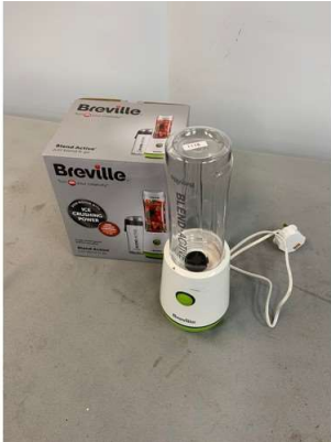
128. V - BREVILLE BLEND ACITVE 350W MOTOR