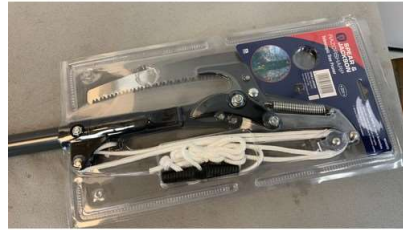
67. V - NEW - SPEAR & JACKSON RAZOR SHARP TELESCOPIC TREE PRUNER - EXTENDING 124CM TO 232CM