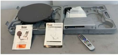
56. M - TEVION MINI SATELITE SYSTEM