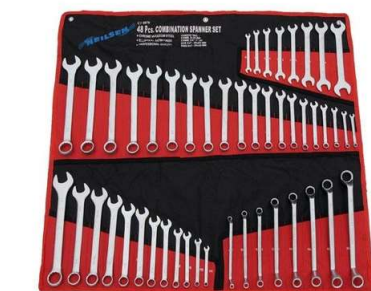
90. V - NEW NEILSON SPANNER SET 48PC SATIN FINISH