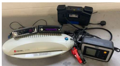
3. M - BOX OF 2 CAR STEREOS / RING BATTERY CHARGER & TESTER / REXEL LV340 A3 LAMINATOR / MICHELIN ELEC TYRE INFLATER