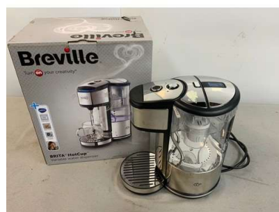
110. V - BREVILLE HOT WATER DISPENSOR