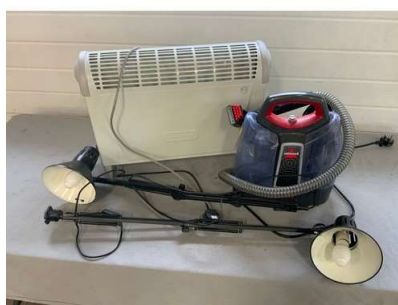
6. M - DELONGI ELEC HEATER & BISSELL PRO HEAT STEAM CLEANER