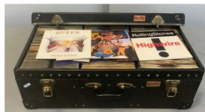
78. M - QTY OF 1980,1990'S RECORDS IN CASE