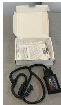
101. M - TDI TUNING BOX MODEL CRTD2 FOR FORD KUGA 150BHP