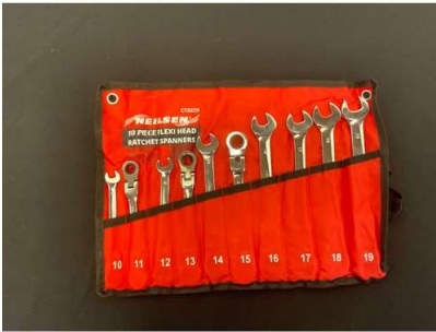
79. V - NEW NEILSON 10PC FLEXI-HEAD COMBINATION RATCHET SPANNER SET