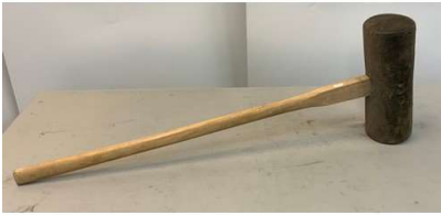
71. M - RUBBER MALLET 3FT HANDLE