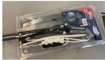
99. V - NEW - SPEAR & JACKSON RAZOR SHARP TELESCOPIC TREE PRUNER - EXTENDING 124CM TO 232CM