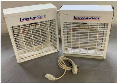
63. M - 2 X INSECT A CLEAR ULTRA VIOLET TRAPS - MODEL 08684