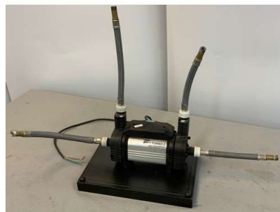
70. M - SHOWER FORCE TURBO 2 HIGH PERFORMANCE PUMP