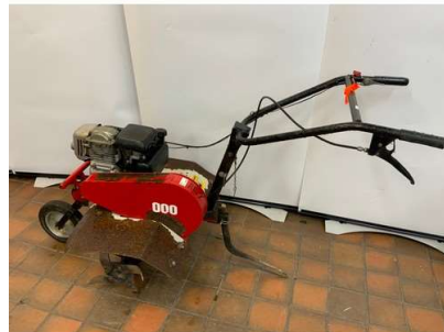
148. V - TRACKMASTER MERRY TILLER