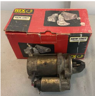
57A. M - SSANGYONG STARTER MOTOR (MUSSO)