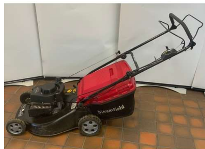
150. V - MOUNTFIELD SP534 SELF PROPELLED PETROL MOWER