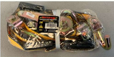
85. V - NEW NEILSON CAR HAULER STRAP & RATCHET 3M WITH SWIVEL 'J' HOOKS (CT4516)