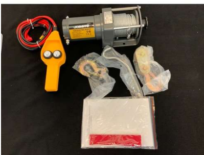
138. V - NEW JOB SITE ELECTRIC WINCH - 12V 1000 TO 2000LB REV CT0711