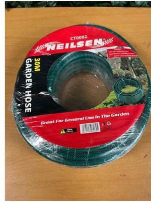
115. V - NEW NEILSON GARDEN HOSE 30 METRE