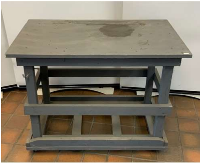
9. M - MOBILE GARDEN POTTING TABLE 37" X 22" X 29"