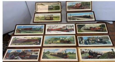
133. M - SET OF 13 RAILWAY PICTURES FROM CARRIAGES