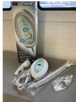
100. M - TRITON TOPAZ SHOWER T100SI 10.5KW