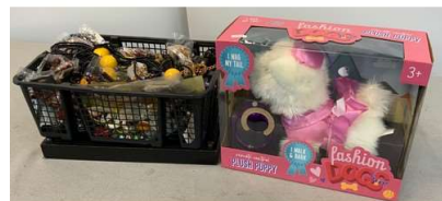
125. M - BASKET OF DRESS JEWELLERY & WALKING BARKING REMOTE PLUSH PUPPY