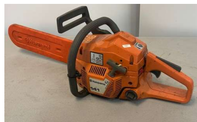
126. M - HUSQVARNA CHAIN SAW - PETROL - AIR INJECTION