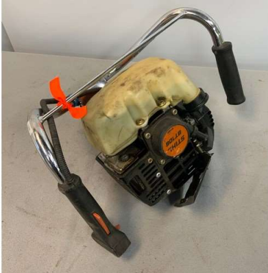
57. V - STIHL BT106 POST HOLE BORER (NO BIT)