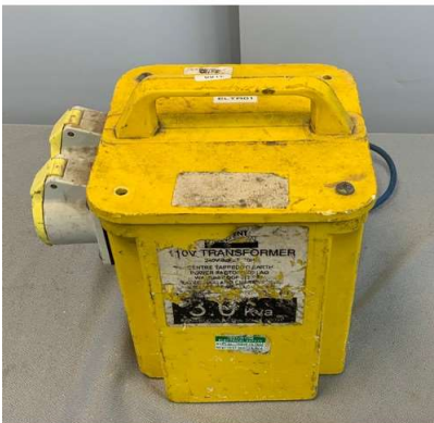
97. V - 110 TRANSOFRMER 240V 3.0 KVA