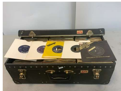
76. M - QTY OF 1960'S RECORDS IN CASE