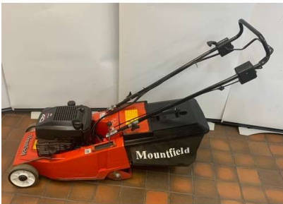
152. V - MOUNTFIELD S/P EMPRESS PETROL MOWER