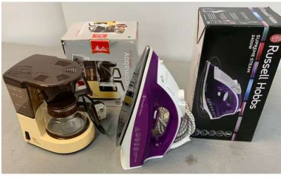
111. V - RUSSELL HOBBS 2400W SUPREME STEAM IRON RRP £19 & AROMABOY COFFEE MACHINE RRP £28