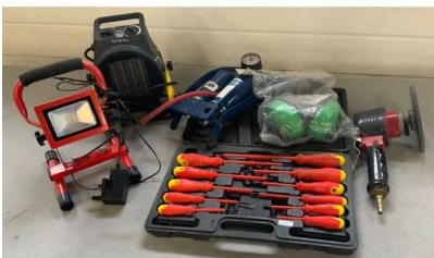
104. M - QTY LIGHTS / TOOLS / EAR MUFFS & CAR PUMP