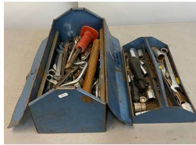
28. M - TOOL BOX WITH A SELECTION OF SPANNERS