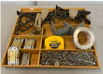
25. M - BOX OF WALL BRACKETS / HINGES / NAILS & LONG TAPE