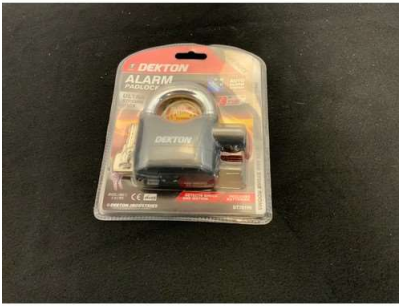
135. V - DECKTON PADLOCK DT70195