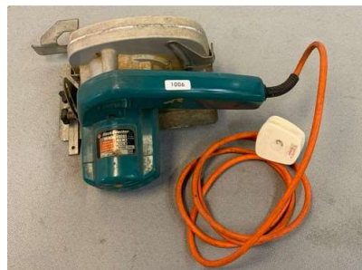
30. M - BLACK & DECKER 5" CIRCULAR SAW 240V