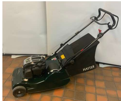
149. V - HAYTER HARRIER 48 SELF PROPELLED PETROL MOWER