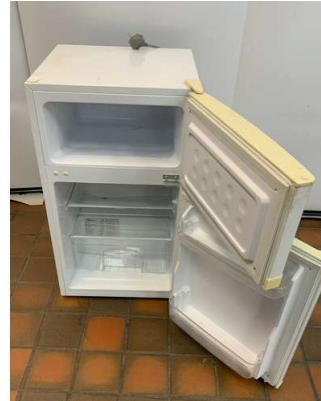
45. M - CURRYS UNDER COUNTER FRIDGE FREEZER - MODEL CUC502W12