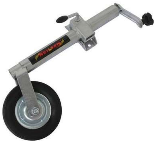
80. V - NEW NEILSEN JOCKEY WHEEL 160KGS 48MM