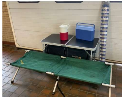
14. M - CAMPING BED / TABLE / COOLER BOX / WINDBREAK & COLEMAN DRINK DISPENSER