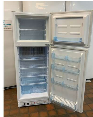
46. M - SMAD CAMPERVAN 3 WAY GAS FRIDGE FREEZER 220V - MODEL DDG-275B1E -275 LITRE NEW - RRP £1299