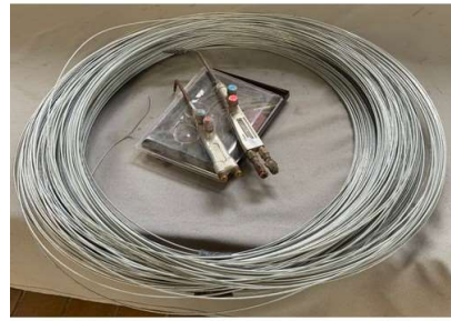
20. M - 2 SAFFIRE WELDING TORCHES & TIPS & 2 ROLLS OF FENCING WIRE