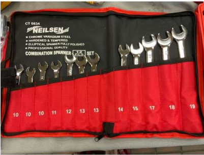
83. V - NEW NEILSON SPANNER SET SIZE 3X10MM 11 12 2X13 14 15 17 18 19MM