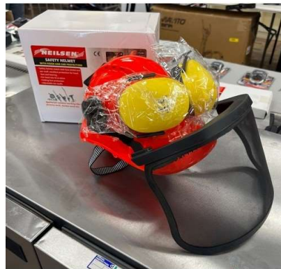
68. V - NEW NEILSON SAFETY HELMET WITH VISOR AND EAR PROTECTOR CT5290