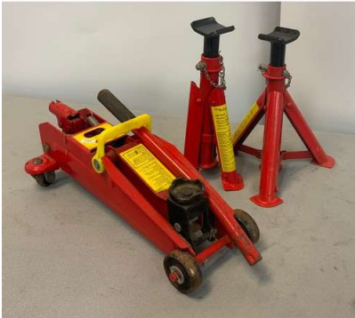
49. M - CAR TROLLEY JACK & PAIR OF AXLE STANDS