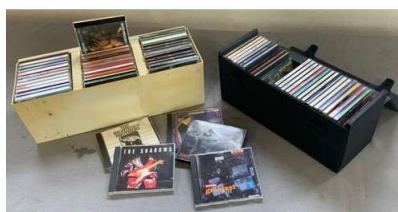
5. M - COLLECTION OF CD'S & 2 BOXES