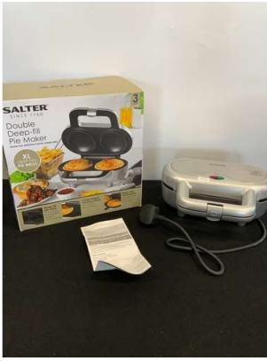
127. V - SALTER DOUBLE DEEP-FILL PIE MAKER used RRP £29.99