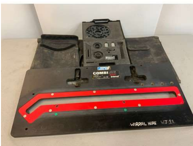
58. V - WORKTOP COMBI JIG 640H WITH ROUTER TOOLING