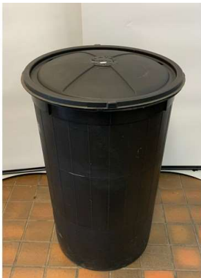
145. V - NEW - 200 LTR WATER BUTT (CT022B)