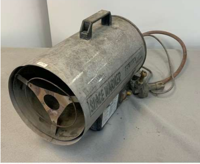
16. M - SEALEY SPACE WARMER MODEL LP4515 LPG 240V