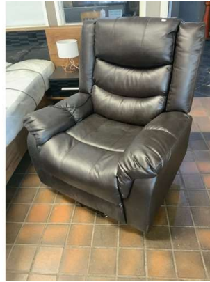
75. V - LANCASHIRE ELECTRIC RECLINER RRP £429