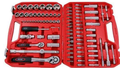
92. V - NEW NEILSON SOCKET SET - 94 PIECE - 1/4-1/2 INCH DRIVE & ACCESSORIES