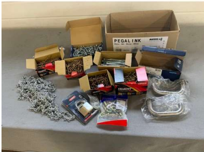
55. M - BOX NEW ASS BOLTS SCREWS & ABUS LOCK