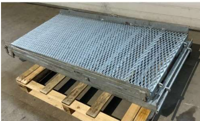
169. M - SKIP RAMPS