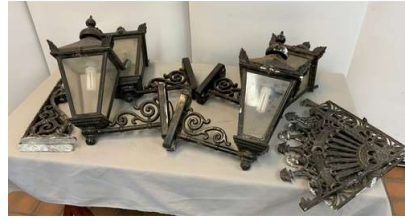
12. M - SET OF 4 OUTDOOR LIGHTS WITH BRACKETS