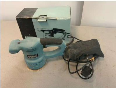
17. M - ERBAUER ORBITAL SANDER - MODEL ERB-ROS