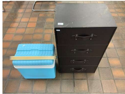
13. M - 4 DRAWER CHEST 17" X 29" X 12" & COOL BOX 15" X 16" X 11"