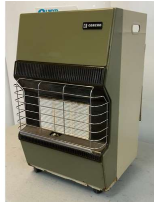
36. M - CORCHO MOBILE GAS HEATER (BUTANE) 2.25KW