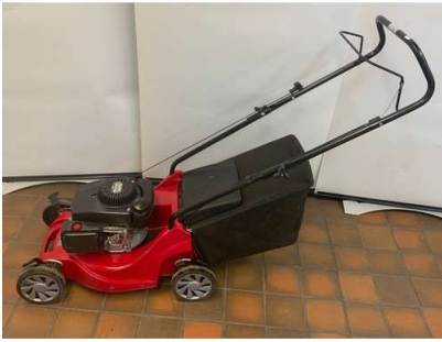
151. V - MOUNTFIELD S/P HP414 PETROL MOWER