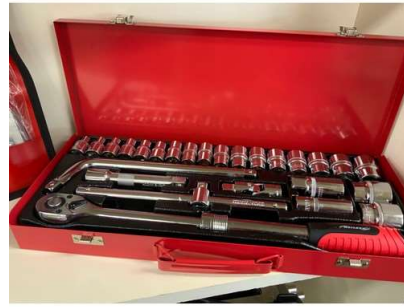
123. V - NEW NEILSON SOCKET SET - 26PC 1/2 IN DRIVE WITH EXT RATCHET