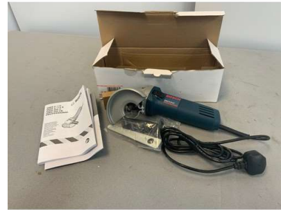
91. M - BOSCH GWS6 PROFESSIONAL 4 1/2" ANGLE GRINDER GWS6 PROFESSIONAL