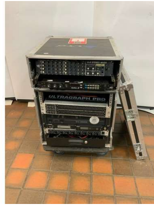
131. M - ULTRAGRAPH PRO AMP, X-8 STEREO MIXER FRONTLINE IN MOBILE CASE