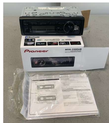
102. M - PIONEER DAB BLUETOOTH CAR STEREO MODEL MVH-330DAB IN BOX (UNUSED) COST NEW £99