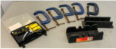
95. M - 5 X 6" G CLAMPS, B&Q MITRE BOX & FOCUS 3 IN 1 STAPLE GUN