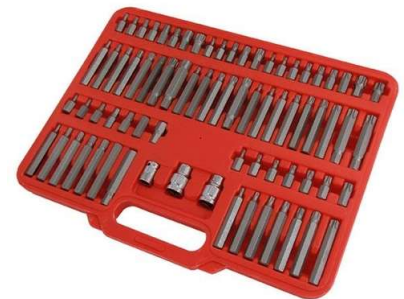
89. V - NEW NEILSON 75PC BITSET HEX RIBE SPLINE & STAR SET