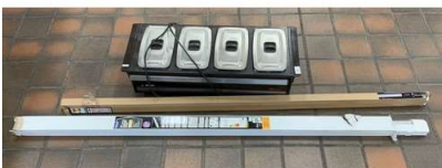
11. M - PHILIPS HOSTESS HOT PLATE & 2 X 5FT FLUORESCENT LIGHTS WITH DIFFUSER (WICKS)