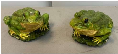
120. M - PAIR OF GARDEN FROGS