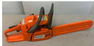
117. V - HUSQVARNA 236 PETROL CHAIN SAW