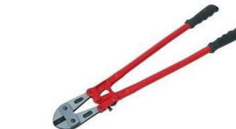
93. V - NEW NEILSON BOLT CUTTER - 30IN RED COLOUR