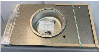
10. M - 450MM ROUND SS SINK & WORKTOP 600 X 1000