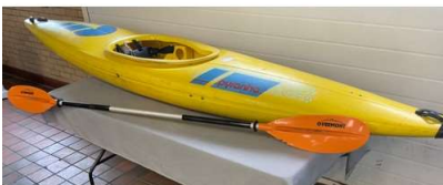
43. M - PYRANHA MASTER WHITE WATER CANOE & PADDLE