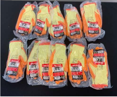
87. V - NEW NEILSEN 12 X CRINKLE LATEX COATED WORK GLOVE SIZE: 10" XL SINGLE (CT4970)