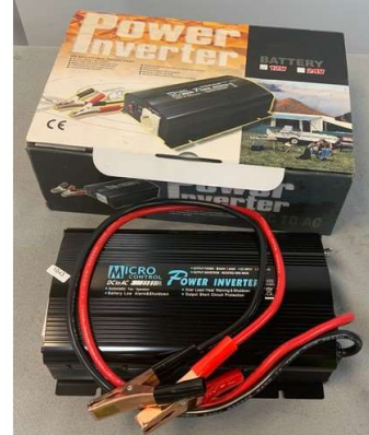
60. V - POWER INVERTER 12V & 24V MICRO CONTROL TO DC TO AZ AS NEW IN BOX