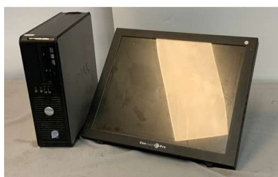
2. M - DELL CCTV HARD DRIVE & CONCEPT PRO MONITOR , NO CABLES OPTIPLEX 745