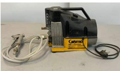
130. V - COSMO 1.5 HORSE AIR COMPRESSOR MODEL COSMO AIR 40900