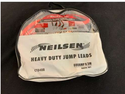
121. V - NEW NEILSON 800 AMP HD JUMP LEADS 3M CT0408