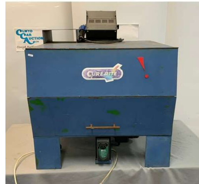
37. M - CURRENT PAINT OVEN FOR ALLOY WHEELS FCNDK40 240V