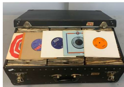
77. M - QTY OF 1970'S RECORDS IN CASE