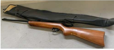
143. M - BSA MEATOR 177 CAL AIR RIFLE & CASE