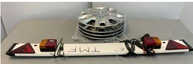
18. M - SET OF FOUR 14" WHEEL TRIMS & TRAILER LIGHT BOARD