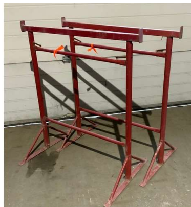
164. V - 2 X BUILDERS TRESTLES