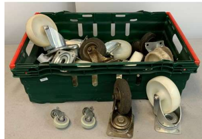
21. M - SELECTION OF CASTER WHEELS