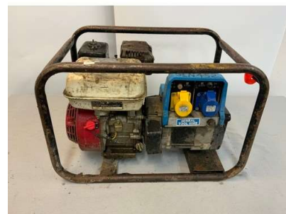
39. V - PETROL GENERATOR 230V HONDA GX 160