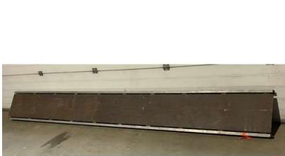
155. V - 12FT YOUNGMAN BOARD