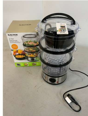
132. V - SALTER 3 TIER STEAMER 7.5 LITRE CAPACITY