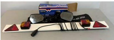
105. M - TWIN PACK OF STEADY VIEW TOWING MIRRORS & TRAILER LIGHT BOARD