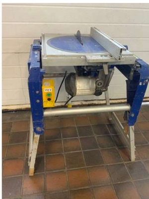
106. M - ELEKTRA KGT 501 SITE SAW