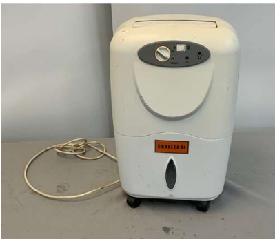
35. M - CHALLENGE DEHUMIDIFIER - MODEL RAM710 240V