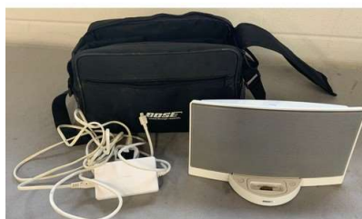
4. M - BOSE DIGITAL MUSIC DOCKING STATION & BAG