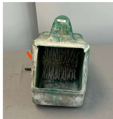
31. M - PLASTERER TYROLEEN GUN