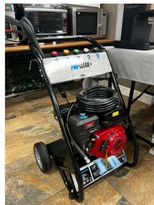
141. V - NEW Pro Clean+ 7.0Hp High Performance Petrol Pressure Washer (CT1757) OIL NEEDED