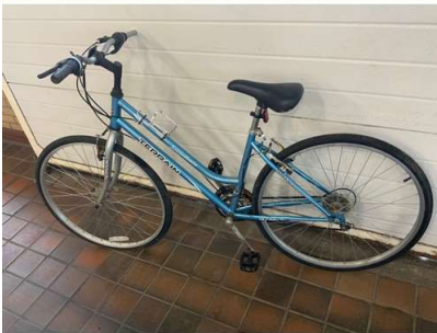
33. M - SNOWDONIA TERRAIN LADIES BIKE