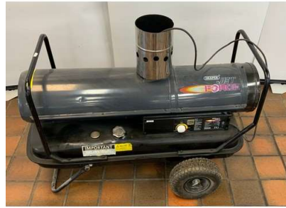
147. V - DRAPER JETFORCE DIESEL SPACE HEATER P/N DSH801