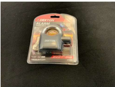
136. V - DECKTON PADLOCK DT70195