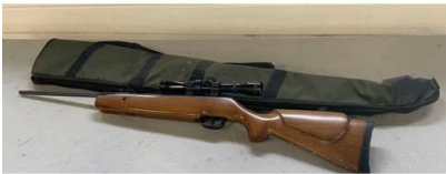
144. M - 22 AIR RIFLE & CASE SMK 19 & SIMMONS SCOPE 4 X 32