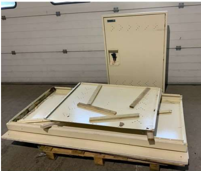
170. M - ASGARD STEEL STORAGE UNIT - SERIAL NO AO27681