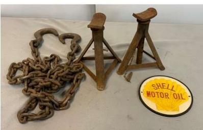
19. M - 2 X AXLE STANDS / LIFTING CHAIN & SHELL OIL SIGN