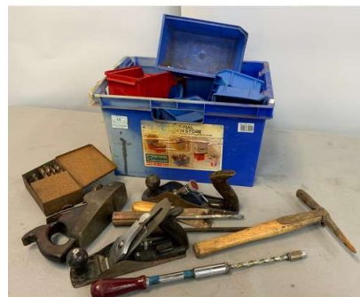
22. M - ASS TOOLS & BOX STORAGE BINS