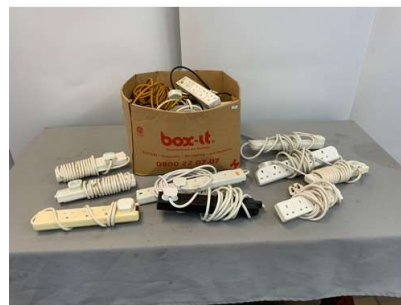
61. M - BOX ASS EXTENSION CABLES