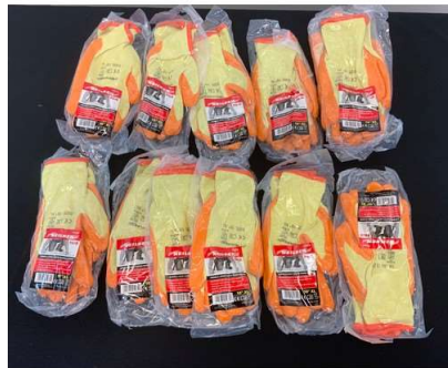
88. V - NEW NEILSEN 12 X CRINKLE LATEX COATED WORK GLOVE SIZE: 10" XL SINGLE (CT4970)