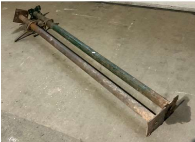
153. V - 2 X ACRO PROPS