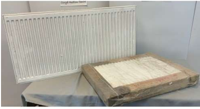
24. M - 2 X RADIATORS (1 X NEW IN BOX 800 X 600 & 1 X USED 1200 X 600)