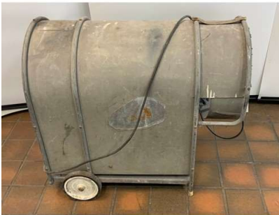
42. M - LPG GAS HEATER FOR GARAGES 240V