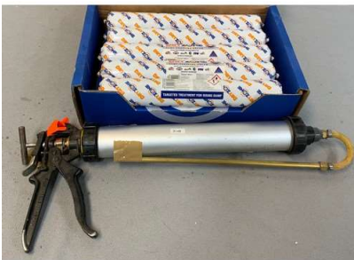
26. V - 10 X 600ML DAMP PROOF CREAM TUBES RRP £195 & DRYZONE GUN RRP £63.99