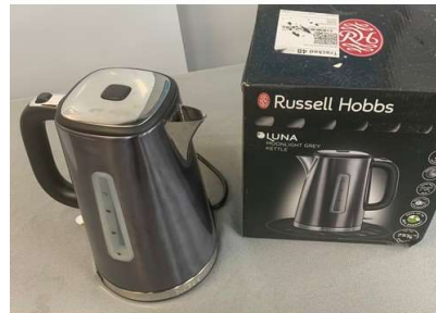
108. V - RUSSELL HOBBS LUNA KETTLE MOGNLIGHT GREY MODEL 23211