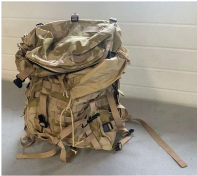
52. M - CAMO RUCK SACK