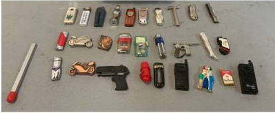
48. M - QTY OF OLD LIGHTERS