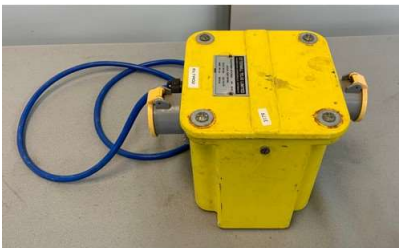
96. V - 110 TRANSFORMER 240V NO TC900/2