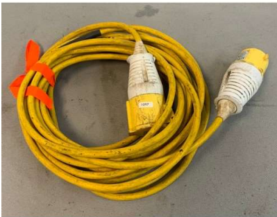
50. V - 32 AMP EXTENSION LEAD