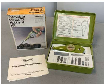
98. M - POWERLINE MODEL 72 HOBBYLIST ENGRAVER & ACCESSORIES