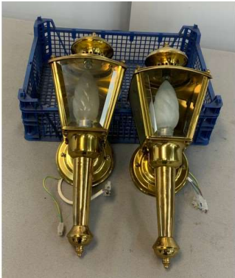
51. M - PAIR OF BRASS OUTSIDE LIGHTS