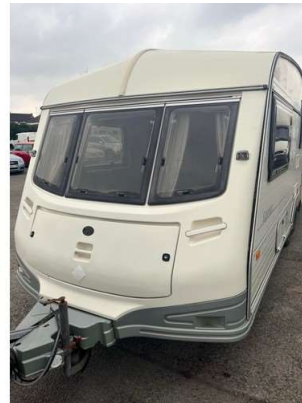
172. M - APPROX 2003 ABI AWARD SUPER STAR - TWIN AXLE - 5 BERTH - CHASSIS NO ABV0279773