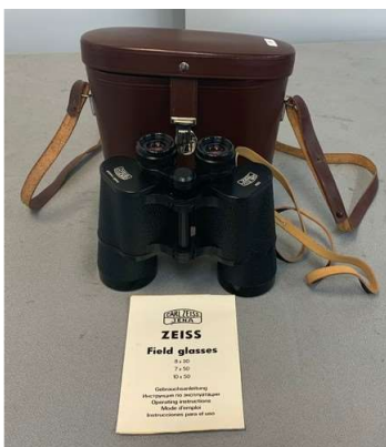
137. M - ZEISS JENOPTER FIELD GLASSES 10X50'S IN LEATHER CASE - COST NEW £149