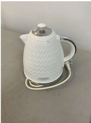
113. V - DAEEO KETTLE WHITE MODEL SDA 1780