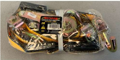
86. V - NEW NEILSON CAR HAULER STRAP & RATCHET 3M WITH SWIVEL 'J' HOOKS (CT4516)