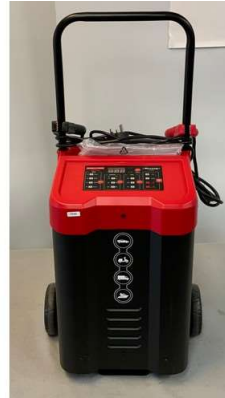
140. V - NEW NEILSON HEAVY DUTY SMART TROLLEY BATTERY CHARGER / STARTER 12/24V 200A (CT3393)