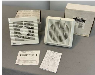
29. M - 2 X GOLD RANGE EXTRACTOR FANS 6" 240V