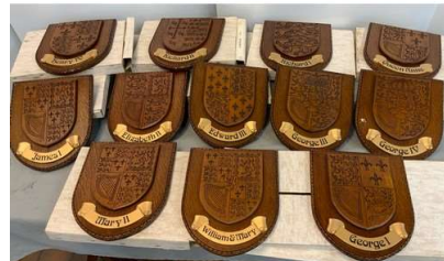
134. M - SET OF 12 KINGS & QUEENS PLAQUES