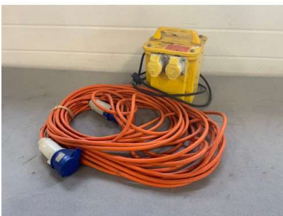
73. M - TRANSFORMER & LEAD