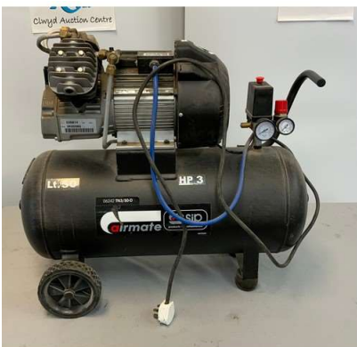
146. V - AIRMATE TN3/50.D 50 LITRE 240V COMPRESSOR