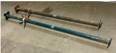
154. V - 2 X ACRO PROPS