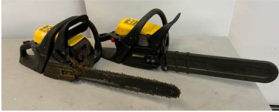
32. M - 2 X PRO-MAC 46 PETROL CHAIN SAW (SPARES OR REPAIRS)