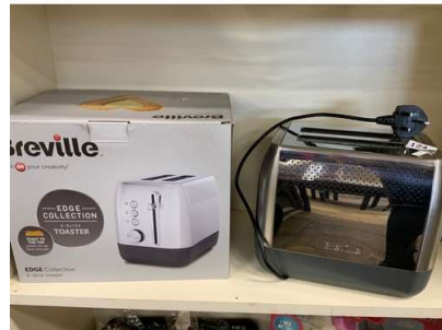
124. V - BREVILLE EDGE 2 SLICE TOASTER S/S