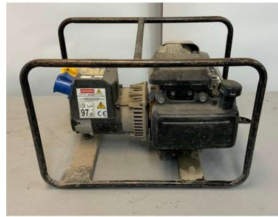
107. V - HONDA GC160 PETROL GENERATOR SER 156653