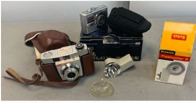
103. M - PANASONIC LUMIX DMC L560 DIGITAL CAMERA IN CASE & KODAK COLOURSNAP 35 BROWNIE MODEL 2 IN LEATHER CASE