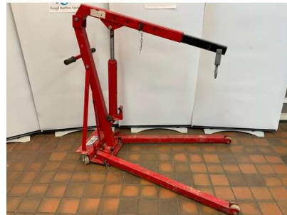
47. V - ENGINE HOIST UPTO 1000KG