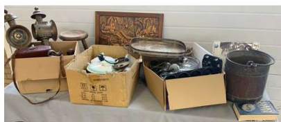
1. M - SUNDRY BOX & STOOL