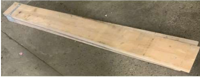
167. V - 4 X 7FT 3" SCAFFOLD BOARDS