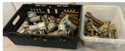
23. M - BOX ASS BOLTS & BOX SCAFFOLDING POLE CONNECTIONS