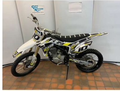
171. M - 10Ten 250CC OFF ROAD DIRT BIKE - ELECTRIC START & KICK - 2 KEYS - FRAME NUMBER HP20M175250RX0015 ENGINE NUMBER TEN22320090013