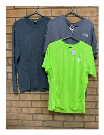
49. M - NORTHFACE LONG SLEEVE GREY TOP SIZE M,NORTH FACE GREY SHORT SLEEVE T-SHIRT SIZE M,NORTHFACE LIME GREEN T-SHIRT SIZE M COST NEW £103.99 (P23170721/JT/04)