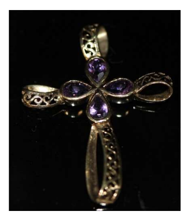
161. M - 9ct (375) GOLD & AMETHYST ORNATE CROSS PENDANT