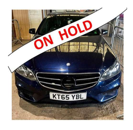
169. M - *** WITHDRAWN***DUE TO UNFORESEEN CIRCUMSTANCES- THE MERCEDES IS ON HOLD, IT WILL NOT BE ENTERED INTO TONIGHT'S AUCTION - SORRY FOR ANY INCONVENIENCE THIS MAY CAUSE