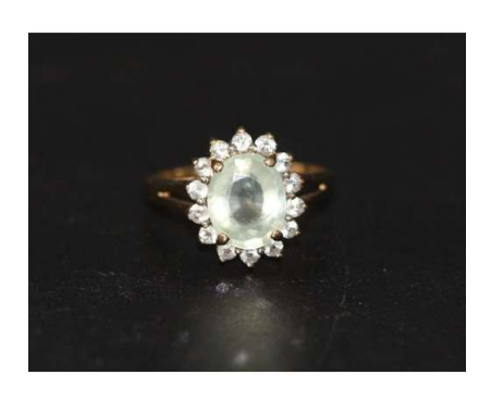
159. M - 9ct (375) GOLD SPODUMENE & CUBIC ZIRCON CLUSTER RING