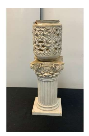
111. M - POT STAND & POT CANDLE HOLDER