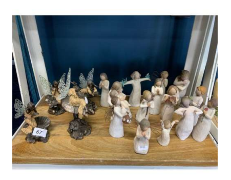
67. M - SET OF 4 GENESIS FAIRE ORNAMENTS & SELECTION OF WILLOW TREE ANGELS