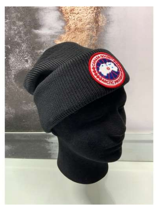
108. M - CANADA GOOSE HAT BLACK ONE SIZE COST NEW £195 (P22220832/TL/10)