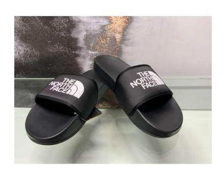
114. M - MENS NORTHFACE BASECAMP SLIDERRS SIZE 9 NEW WITH TAGS COST NEW £35 (P23170721/JT/04)

117. M - PAIR OF SMALL TABLE LAMPS & GLASS SHADE