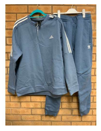
41. M - ADIDAS CREW SEATSHIRT (XL)AND PANTS (M) IN BLUE COST NEW £76 (P23041196/KBM/05)