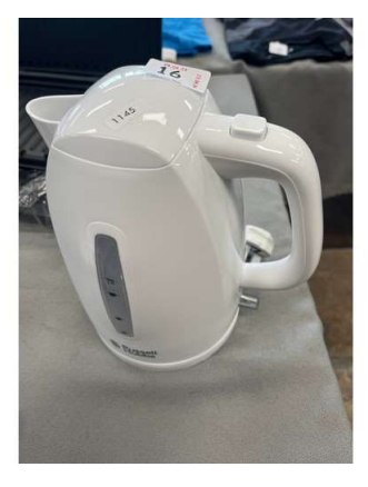
16. V - RUSSEL HOBBS CORDLESS KETTLE MODEL 21270 RRP £19.99