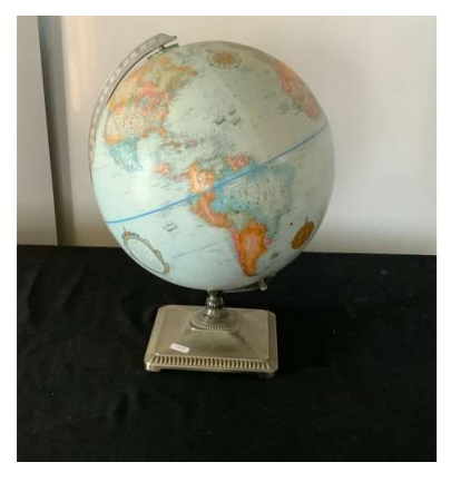
14. M - TABLE TOP WORLD GLOBE