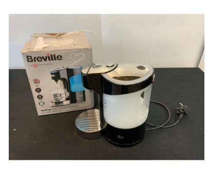
19. V - BREVILLE HOTCUP