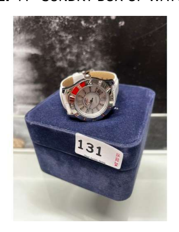
12. M - ROTARY CHRONOSPEED LADIES WATCH IN BOX RRP £125