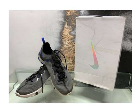
98. M - NIKE REACT ELEMENT "BLUE RACE" SIZE 8 RRP £129.94 (JFC/12)