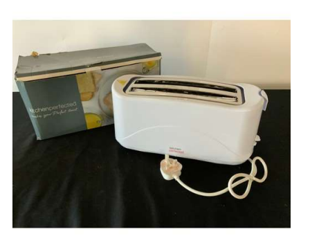
5. V - KITCHEN PERFECT 4 SLICE WHITE TOASTER RRP £20