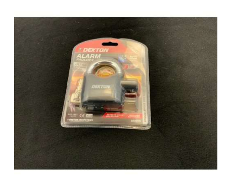
89. V - NEW - DECKTON ALARM PADLOCK DT70195