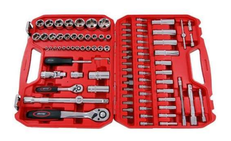
60. V - NEW NEILSON SOCKET SET - 94 PIECE - 1/4-1/2 INCH DRIVE & ACCESSORIES