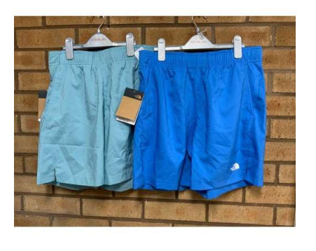
28. M - 2 PAIRS OF NORTH FACE SHORTS TURQOUISE & BLUE SIZE M COST NEW £80 (P23170721/JT/04)