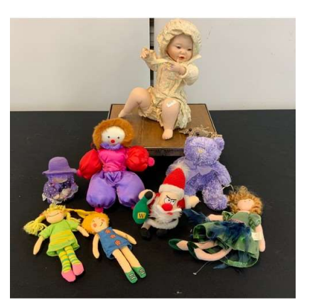
66. M - SELECTION OF SOFT TOYS