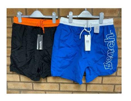
27. M - 2 PAIRS OF BENCH SWIM SHORTS SIZE S NEW WITH TAGS COST NEW £21.98 (P23170721/JT/04)