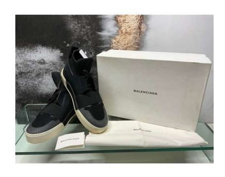
131. M - BALENCIAGA TECH MID NOIR TRAINERS SN64 IN BOX SIZE 9 (43) COST NEW £355 (4/ P23051789)