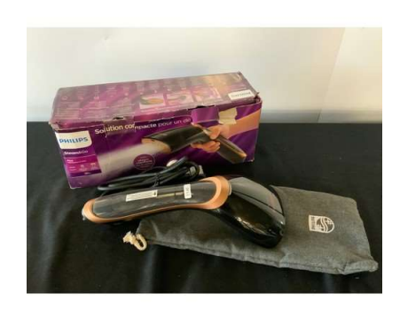
15. V - PHILLIPS STEAM & GO HAND STEAMER RRP £65