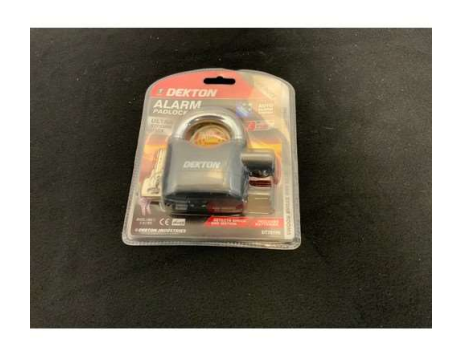
87. V - NEW - DECKTON ALARM PADLOCK DT70195