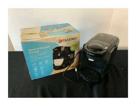
1. V - BOSCH TASSIMO BLACK EDITION DRINKS MAKER - RRP £39.99