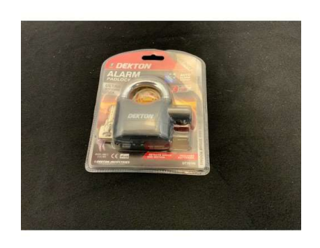
88. V - NEW - DECKTON ALARM PADLOCK DT70195