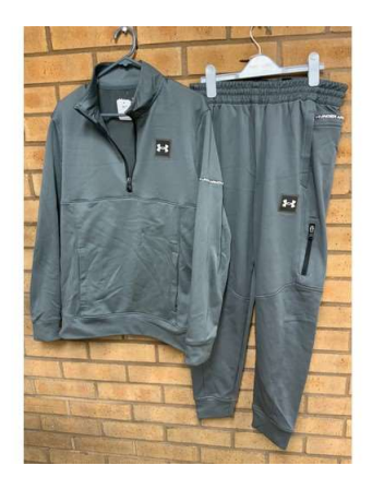
36. M - UNDER ARMOUR GREY 3/4 ZIP TOP & TRACKSUIT BOTTOMS SIZE M COST NEW £64.99 (P23170721/JT04)