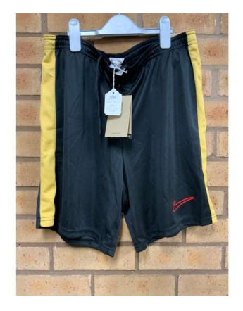
48. M - NIKE DRYFIT SHORTS BLACK/YELLOW (L) NEW WITH TAGS COST NEW £23 (P23041196/KBM/04)