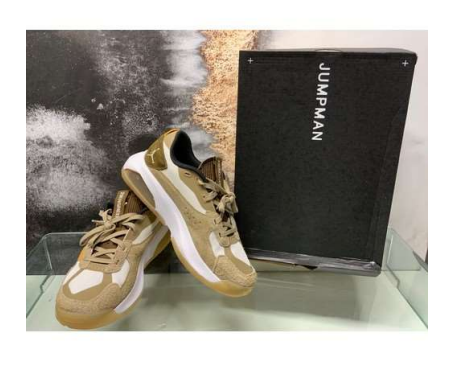
105. M - NIKE AIR JORDAN 200E KHAKI WHITE TRAINER IN BOX - SIZE 9.5 - COST NEW £112 (17/ P23051789)