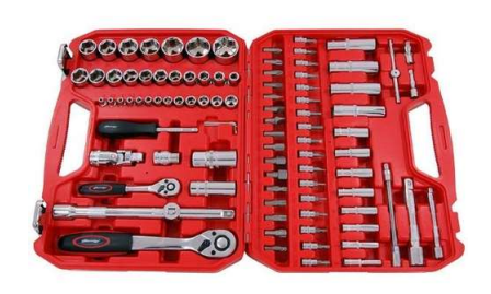
61. V - NEW NEILSON SOCKET SET - 94 PIECE - 1/4-1/2 INCH DRIVE & ACCESSORIES