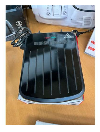
6. V - GEORGE FOREMAN GRILL SMALL RRP £39