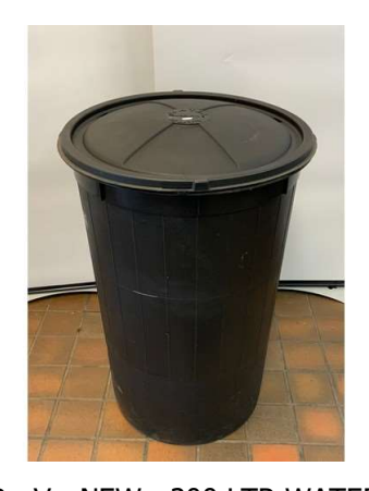
6B. V - NEW - 200 LTR WATER BUTT (CT022B)