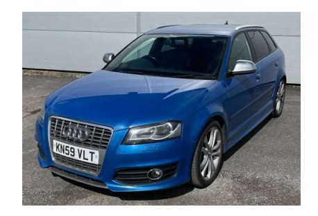
170. M - 2009 AUDI S3 QUATTRO - REG NO 'KN59VLT'-1984CC 5 DR HATCHBACK. 103,872 MILES, SERVICE HISTORY 15 STAMPS - TIMING BELT @79K,1 KEY,LEATHER HEATED SEATS,AIR CON,EW,CL,PAS,SAT NAV,ALLOYS.