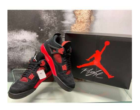
106. M - NIKE AIR JORDAN 4 RETRO THUNDER FIRE RED -BLACK NOIR TECH GREY TRAINERS IN BOX SIZE UK 9.5 - COST NEW £280 (6/ P23051789)