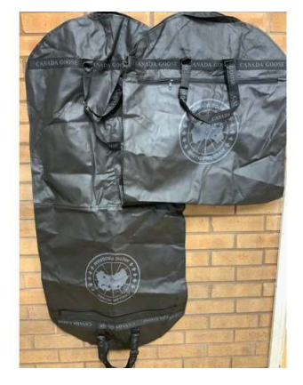
51. M - CANADA GOOSE GARMENT BAGS X 2 (P22220832/TL/10)