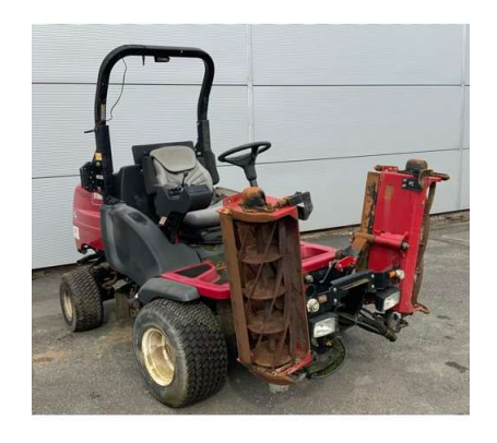
171. V - 2016 TORO LT3340 3 GANG MOWER AUTOMATIC 1498cc REG NO 'DG16KAE' 1559 HOURS -V5 PRESENT - COUNCIL OWNED FROM NEW