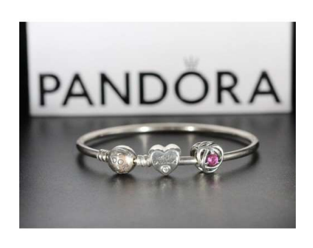
160. M - PANDORA BRACELET AND 2 X CHARMS (BEST FRIEND HEART & OCTOBER ETERNITY CIRCLE CHARM) COST NEW £125 (P23039089 RR/29)