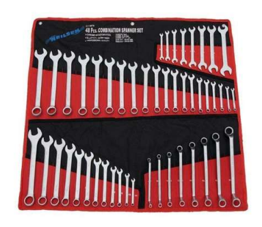
53. V - NEW NEILSON SPANNER SET 48PC SATIN FINISH