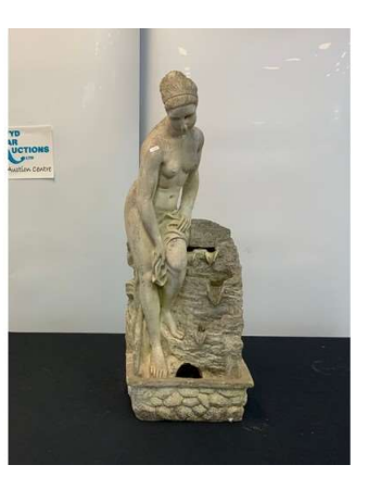
61. V - NEW NEILSON SOCKET SET - 94 PIECE - 1/4-1/2 INCH DRIVE & ACCESSORIES