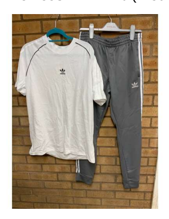
42. M - ADIDAS WHITE TSHIRT COST NEW £30 ADDIDAS SST TRACK PANTS GREY COST NEW £55 (P23041196/KBM/05)