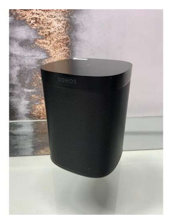
129. M - SONOS SPEAKERS (25 / P23051775) COST NEW - £264