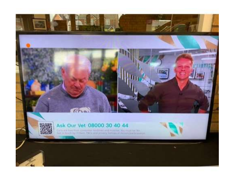
165. M - SAMSUNG FULL HD SMART WIFI 55" TV - MODEL UE55ES6100 (NO REMOTE) - COST NEW £799 (P23039126 RR/09)