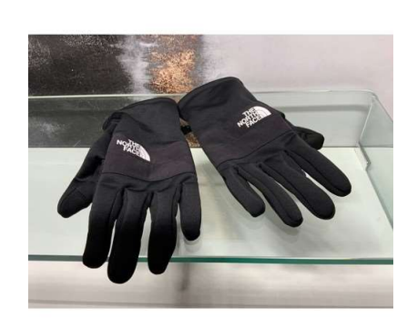
115. M - NORTHFACE FLEECE LINED GLOVES SIZE XL COST NEW £45 (P23170721/JT/04)