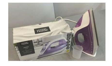
25. V - GEORGE HOME 2400W STEAM IRON SILVERCREST SDB2400F4