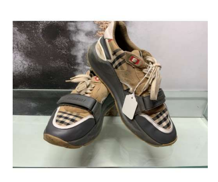
138. M - BURBERRY RAMSEY CHECK SUEDE LEATHER TRAINERS SIZE 44 (1 / P23051800) - COST NEW £570