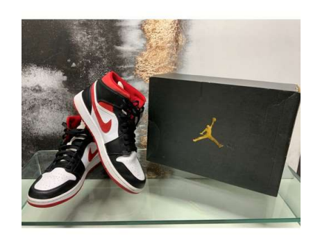
103. M - NIKE AIR JORDAN 1 MID RED SE TRAINERS SIZE UK 9 BLACK WHITE RED IN BOX - COST NEW £115 (16/P23051789)