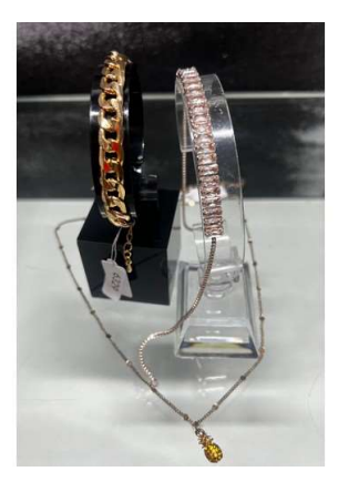
152. M - GOLD COLOURED NECKLACE WITH YELLOW PENDANT -PINEAPPLE DRESS NECKLACE, SILVER COLOURED BRACELET - A/F DIAMONTE DRESS, GOLD COLOURED DRESS BRACELET (P23039101 RR/32) (P23039099 RR/31)(P23039094 RR/30)