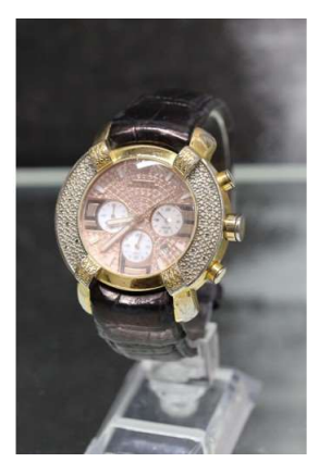
164. M - MENS DIAMOND AQUA MASTER JOJO JOJINO WATCH(27 / P23051760) - COST NEW £211