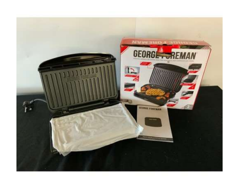
17. V - GEORGE FOREMAN MEDIUM FIT GRILL RRP £31.99