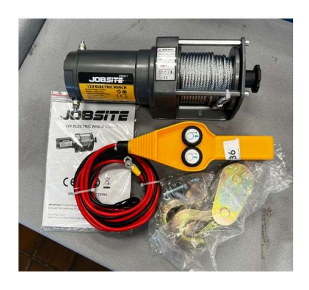
83. V - NEW JOBSITE ELECTRIC WINCH - 12V 1000 TO 2000LB REV