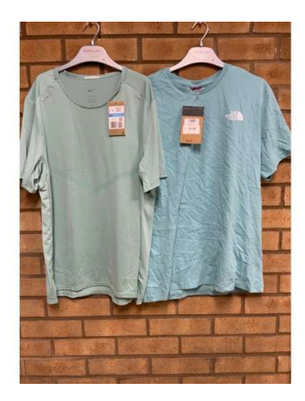
31. M - NORTHFACE TSHIRT SIZE M & NIKE DRI-FIT T-SHIRT SIZE M NEW WITH TAGS COST NEW £75 (P23170721/JT/04)