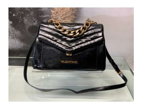
149. M - BLACK VALENTINO GRIFONE QUILTED HANDBAG COST NEW £99 (P23039175 RR/23)

148. M - NEW LEATHER RADLEY HANDBAG (BLACK) COST NEW £169 (P23039190 RR/25)