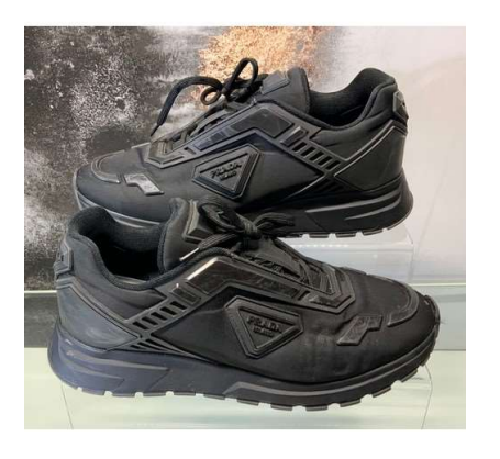
134. M - PRADA PRAX 01 TRAINERS - BLACK SIZE 10 - COST NEW £770 (P23039135 RR/11)