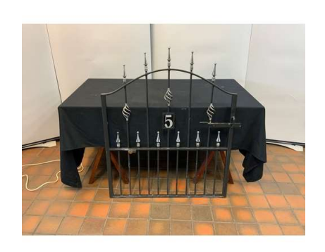
64. M - WROUGHT IRON BLACK AND SILVER GATE