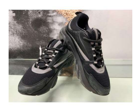
140. M - DIOR B22 CALF LEATHER MESH RELFLECTIVE BLACK TRAINERS SIZE 44 (14/ P23051789)