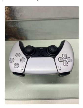
119. M - PS5 CONTROLLER RRP £54.85 (P23039740 RR/39)