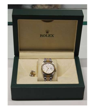
168. M - ROLEX OYSTER PERPETUAL DATEJUST 16233 GENTS WATCH. 36MM CASE WITH AN 18K YELLOW GOLD FLUTED BEZEL. IVORY PYRAMID DIAL WITH GOLD TONE ROMAN NUMERAL MARKERS. QUICKSET DATE FUNCTION. 18K YELLOW GOLD AND STAINLESS STEEL JUBILEE BAND WITH FOLD OVER CLASP. COMPLETE WITH SPARE LINK AND ROLEX BOX - NO PAPERS - CIRCA 2003 - SERIAL NUMBER Y351158 (P22024050 AM/1)