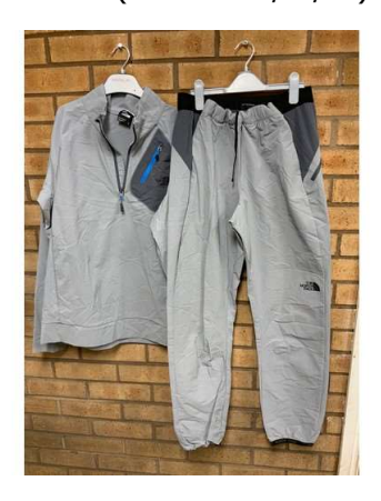
40. M - NORTHFACE TRACKSUIT SIZE M