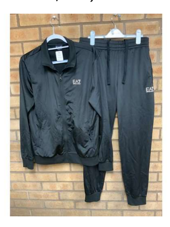
37. M - EA7 EMPORIO ARMANI SIZE M PANTS SIZE L TOP COST NEW £108.99 (P23170721/JT/04)