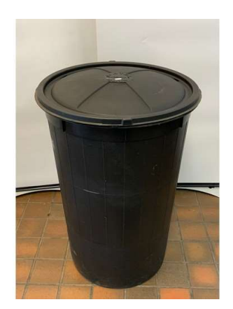
6A. V - NEW - 200 LTR WATER BUTT (CT022B)