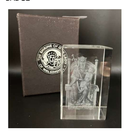
154. M - THE SHRINE OF OUR LADY OF WALSINGHAM GLASS ORNAMENT