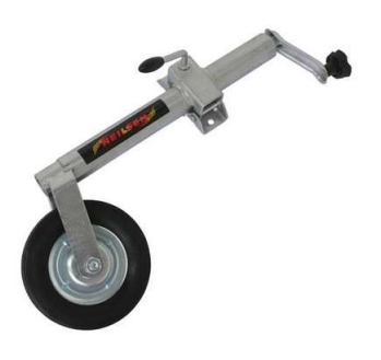
52. V - NEW NEILSEN JOCKEY WHEEL 160KGS 48MM

54. V - NEW NEILSON CAR HAULER STRAP & RATCHET