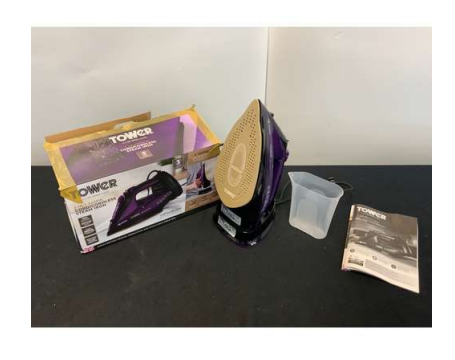
24. V - TOWER CERAGLIDE CORD/CORDLESS STEAM IRON RRP £25