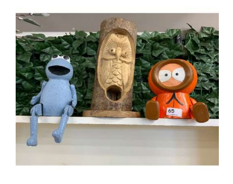
97. M - 3 TOY FIGURES