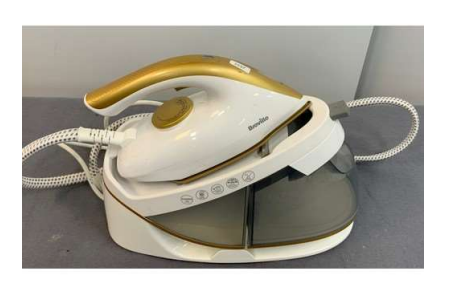
96. V - BREVILLE STEAM STATION IRON (P325HEA) rrp £94.99