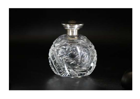
163. M - STERLING SILVER ETCHED GLASS PERFUME BOTTLE