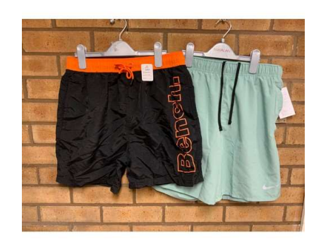
30. M - 1 PAIR OF BENCH SWIM SHORTS SIZE S & PAIR OF NIKE DRI-FIT SWIM SHORTS SIZE M NEW WITH TAGS COST NEW £47.99 (P23170721/JT/04)

29. M - PAIR OF NORTH FACE BLUE SHORTS SIZE M & JACK & JONES BLACK SWIM SHORTS SIZE M NEW WITH TAGS COST NEW 64.99 (P23170721/JT/04)