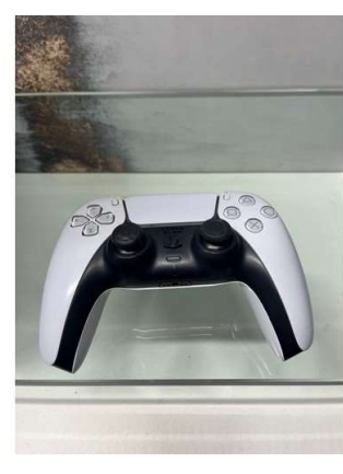
120. M - PS5 CONTROLLER RRP £54.85 (P23039740 RR/39)