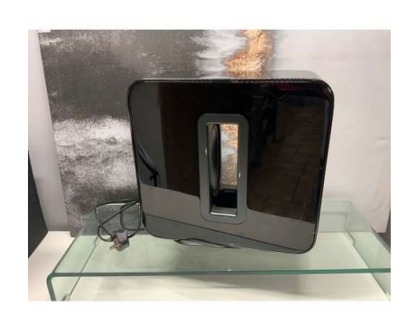
126. M - SONOS SUB WOOFER (22 / P23051773) - COST NEW £699