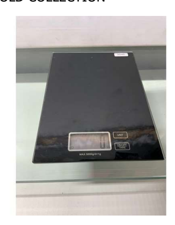
20A. M - GEORGE KITCHEN SCALES (P22220803/TL/09)