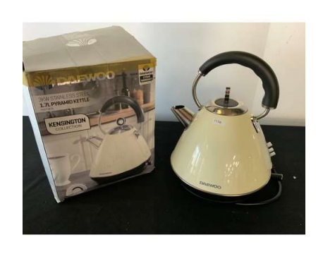
7. V - DAEOO 1.7L PYRAMID KETTLE KENSINGTON COLLECTION RRP £35