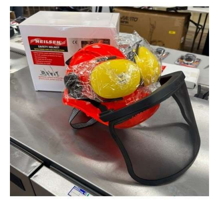
92. V - SAFETY HELMET WITH VISOR AND EAR PROTECTOR CT5290