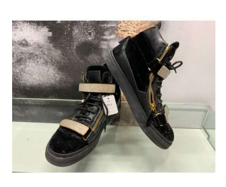
139. M - GIUSEPPE ZANOTTI COBY BLACK HIGH TOP TRAINERS SIZE 43 - COST NEW £855 3(15/ P23051789)