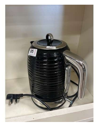
95. V - RUSSEL HOBBS CORDLESS KETTLE MODEL 24361