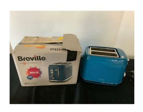
20. V - BREVILLE 2 SLICE TOASTER IN BLUE - THE BOLD COLLECTION