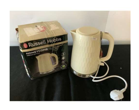
3. V - RUSSELL HOBBS HONEYCOMB CREAM KETTLE RRP £28.99