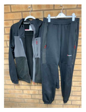
38. M - BERGHAUS BLACK FLEECE TRACKSUIT SIZE M COST NEW £180 (P23170721/JT/04)