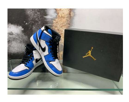
99. M - NIKE AIR JORDAN 1 MID SE TRAINER - SIGNAL BLUE / BLACK / WHITE IN BOX - SIZE UK 9 COST NEW £139 (9/ P23051789)