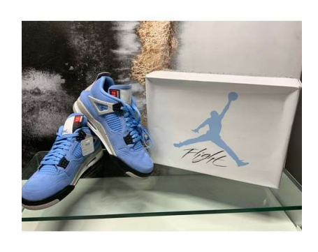
143. M - NIKE AIR JORDAN 4 RETRO UNIVERSITY BLUE TRAINER IN BOX SIZE UK 9.5 - ONLINE PRICE £545 - £650 (18/ P23051789)