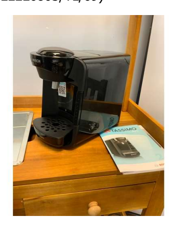
21. V - BOSCH TASSIMO TAS31xx COFFE MACHINE RRP £119