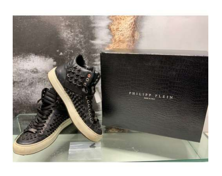
136. M - PHILLIPP PLEIN LTD EDITION STUD HIGH TOP TRAINERS IN BOX - SIZE 9 - COST NEW £700 (3/ P23051789)