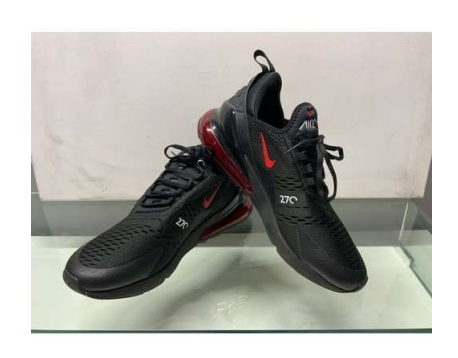
100. M - NIKE AIR MAX 270 BLACK & RED TRAINER SIZE 8 (P23041205/P23041207/GNB/04/03) COST NEW £140