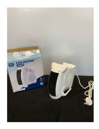
4. V - CUQOO FAN HEATER 2000W RRP £15.99