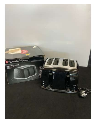
22. V - RUSSELL HOBBS BLACK 4 SLICE TOASTER RRP £45.99