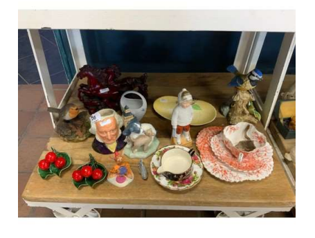
69. M - 3 ORNAMENTS - ROYAL DOULTON & NAO & A SELECTION OF CHINA & CARLTON WARE