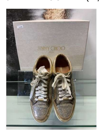
141. M - JIMMY CHOO MIAMI CHAMPAGNE TRAINERS (GOLD)- IN BOX SIZE 38 - COST NEW £187 (P23039123 RR/16)