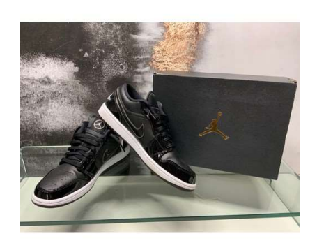
130. M - NIKE AIR JORDAN 1 LOW SE ALL STAR ASW TRAINER BLACK / WHITE IN BOX SIZE UK 9.5 - ONLINE PRICE RANGE £200 TO £671 (19/ P23051789)