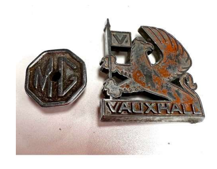
153. M - VINTAGE VAUXHALL CAR BADGE & MG CAR BADGE