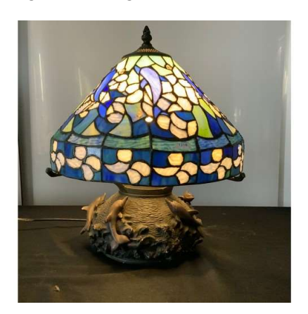
13. M - TIFFANY STYLE TABLE LAMP