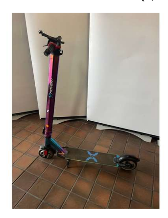
107. M - HOVER-1 AVIATOR IRIDESCENT ELECTRIC SCOOTER - NO CHARGER - COST NEW £210 (P23039083 RR/03)