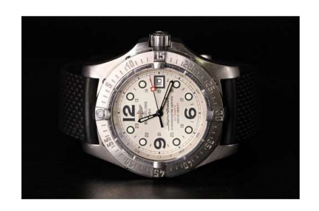
167. M - BREITLING SUPER OCEAN STEELFISH A17390 STAINLESS STEEL WATCH. 44MM CASE WITH BLACK RUBBER STRAP WITH POLISHED STEEL TANG BUCKLE AND SILVER DIAL. BRUSHED STEEL UNIDIRECTIONAL ROTATABLE BEZEL AND SCREW DOWN CROWN (NO BOX OR PAPERS) (P22220820/RJW/08122201)