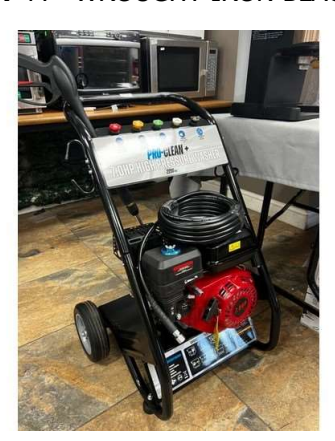
65. V - NEW Pro Clean+ 7.0Hp High Performance Petrol Pressure Washer (CT1757) OIL NEEDED