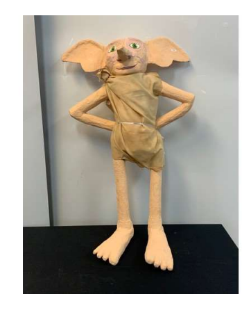
110. M - DOBBY CHARACTER 3FT TALL