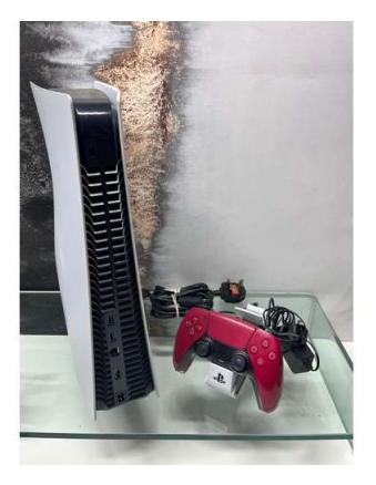
121. M - PS5 MODEL CFI-1016A AND ONE CONTROLLER & TWIN CHARGER - COST NEW £600 (P23039740 RR/39)