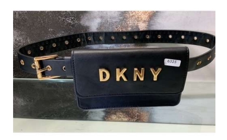
133. M - DKNY TANNER BAG/BELT (BLACK) SIZE SMALL - COST NEW £50 (P23039202 RR/28)