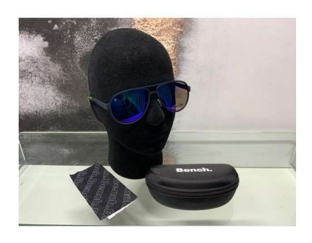
123. M - BENCH SUNGLASSES IN CASE COST NEW £14.99 (P23170721/JT/04)