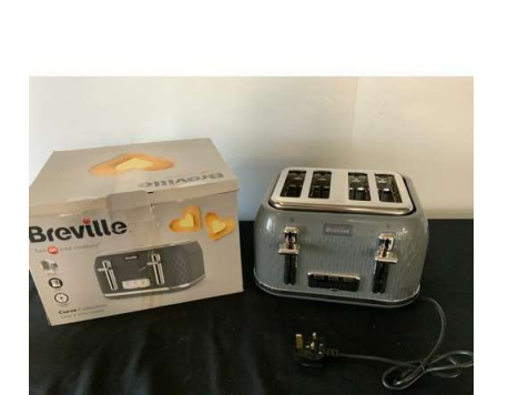
2. V - BREVILLE 4 SLICE TOASTER CURVE COLLECTION IN GREY - RRP £44