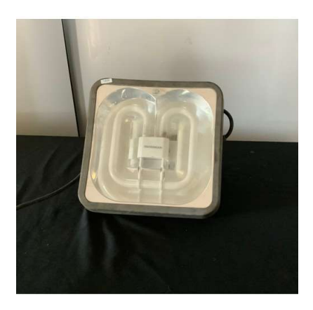
80. M - 240V WORK LIGHT