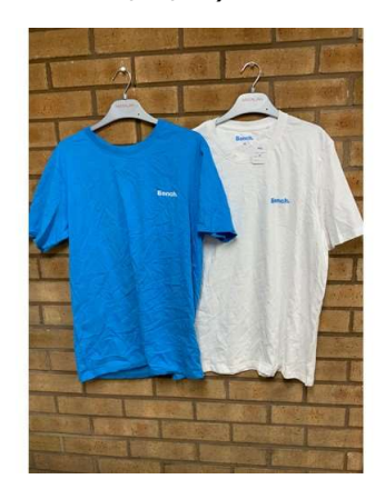
32. M - 2 BENCH T SHIRTS IN BLUE & WHITE SIZE M COST NEW £30 (P23170721/JT/04)