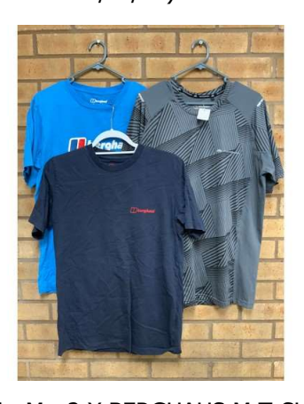
46. M - 2 X BERGHAUS M T-SHIRTS & MONTERRAIN GREY T SHIRT ALL SIZE M COST NEW £86 (P23170721/JT/04)