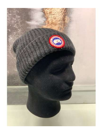
125. M - CANADA GOOSE BLACK RIB TORQUE HAT 5026M - COST NEW £175 (21/ P23051789)