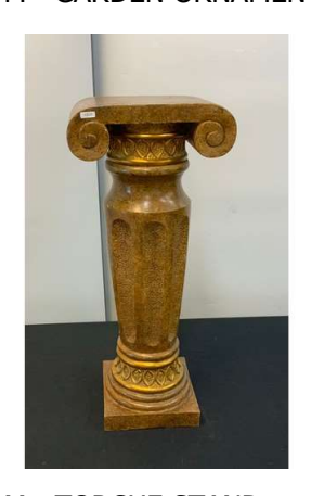
63. M - TORCHE STAND