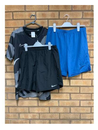
33. M - 2 PAIRS OF NIKE DRI-FIT SHORTS (BLUE & BLACK) SIZE M, NIKE DRI-FIT BLACK & GREY T SHIRT SIZE M COST NEW £78.99