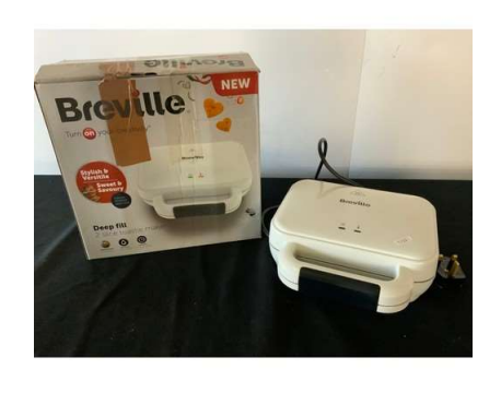
23. V - BREVILLE DEEP FILL 2 SLICE TOASTIE MAKER