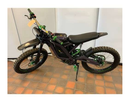
166. M - 2021 SUR-RON OFF LIGHT BEE LBX OFF ROAD ELECTRIC BIKE (NO KEY OR CHARGER) COST NEW £4000+ (P22220813)