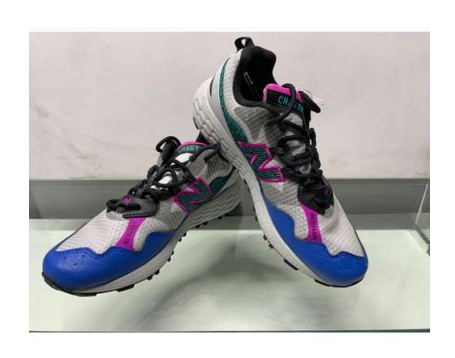
101. M - NEW BALANCE WTCRGRA2 TRAINER SIZE 7 (P23041199/P23041212/KBM15/16) COST NEW £60