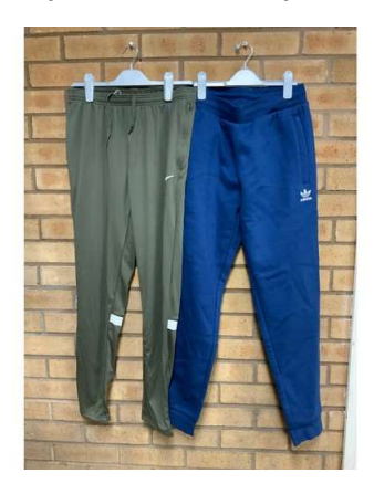
44. M - ADIDAS NAVY TRACK PAANTS (M) COST NEW £38 NIKE DRI-FIT ACADEMY PANTS CW61-222 (L) COST NEW £40 (P23041196/KBM/05)

43. M - 2 UNDER ARMOUR TSHIRTS SIZE M & UNDER ARMOUR LONG SLEEVE 3/4 ZIP TOP SIZE M COST NEW £108 (P23170721/JT/04)