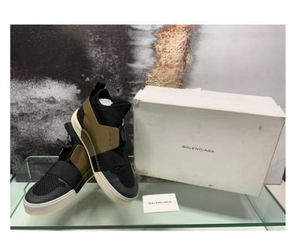
132. M - BALENCIAGA TECH MID VERY KHAKI TRAINER IN BOX SIZE 9 - COST NEW £355 (5/ P23051789)