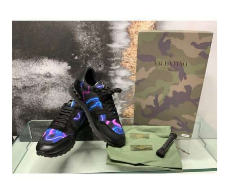
145. M - VALENTINO LEATHER BLACK / NEON TRAINERS SIZE 43.5 IN BOX COST NEW £500 (2 / P23051789)