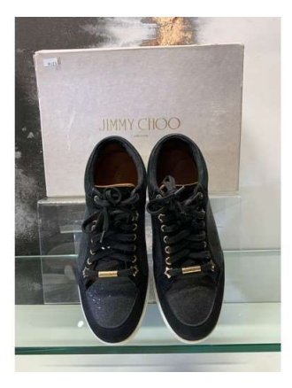
142. M - JIMMY CHOO MIAMI BLACK GLITTER TRAINERS (BLACK) - IN BOX SIZE 38 COST NEW £187 (P23039143 RR/19)