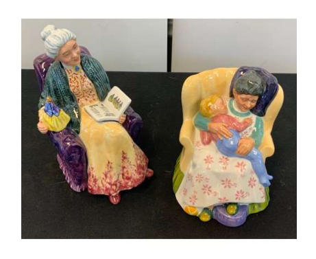
72. M - 2 ROYAL DOULTON ORNAMENTS 'SWEET DREAMS & PRIZED POSSESSIONS (RARE)'