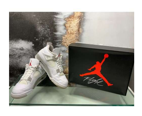
144. M - NIKE AIR JORDAN 4 RETRO TRAINERS WHITE OREO IN BOX SIZE UK 9.5 - ONLINE PRICE RANGE £449 - £855 (7/ P23051789)