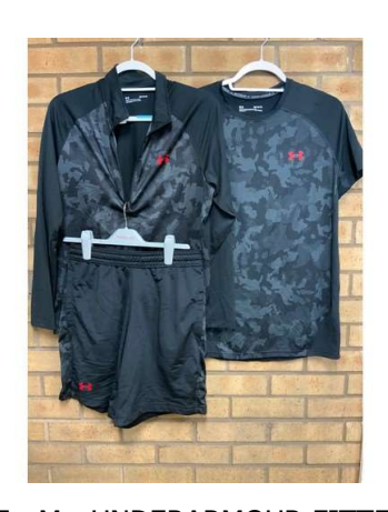
35. M - UNDERARMOUR FITTED BLACK CAMO T-SHIRT SIZE M & LONG SLEEVE LOOSE BLACK CAMO TOP SIZE M & UNDERARMOUR BLACK CAMO SHORTS SIZE M COST NEW £74.98