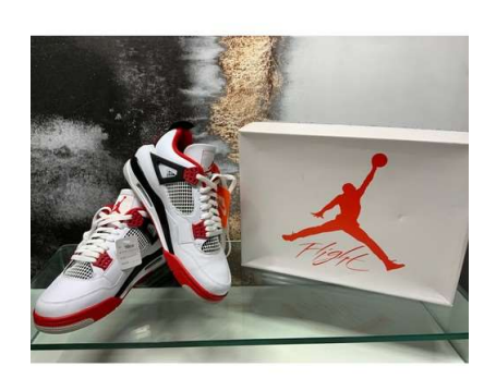
104. M - NEW' NIKE AIR JORDAN 4 RETRO FIRE RED TRAINERS IN BOX SIZE UK 9.5 - ONLINE PRICE RANGE - £257 - £462(8/ P23051789)