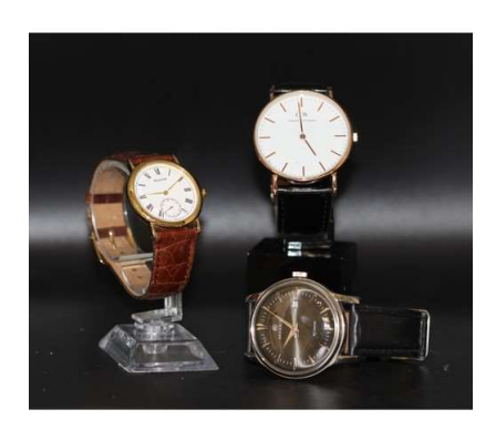
156. M - DANIEL WELLINGTON WATCH & 2 X ACCURIST WATCHES

155. M - VINTAGE 'TAM O'SHANTER' TOBACCO TIN & SILVER PLATED & GLASS BUD VASE ENGRAVED 'U.G.C TROTTER CUP R/U 1968'