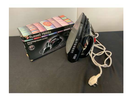
93. V - RUSSELL HOBBS POWERSTEAM ULTRA IRON