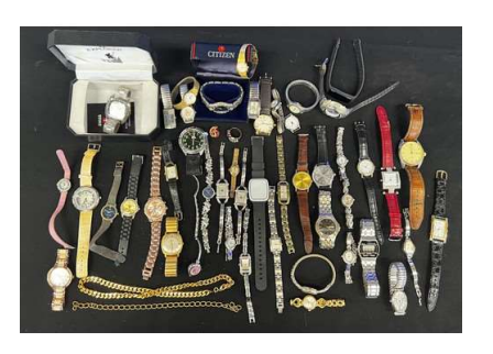
11. M - SUNDRY BOX OF WATCHES