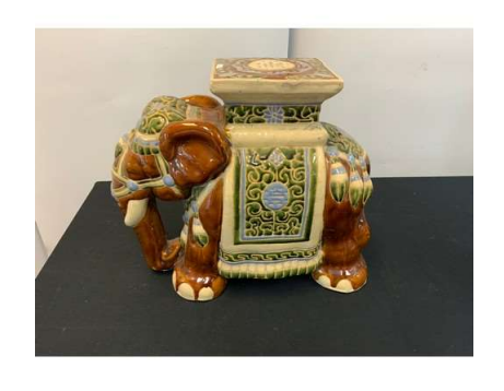
9. M - ORNAMENTAL POT ELEPHANT