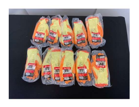
85. V - CRINKLE LATEX COATED WORK GLOVE SIZE 10" XL