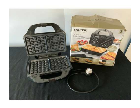
18. V - SALTER 3 IN 1 SNACK MAKER