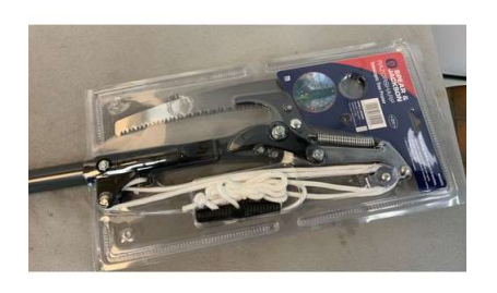
59. V - SPEAR & JACKSON TELESCOPIC TREE PRUNER