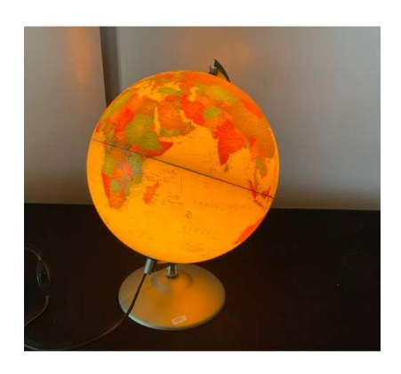
8. M - TABLE LAMP WORLD GLOBE