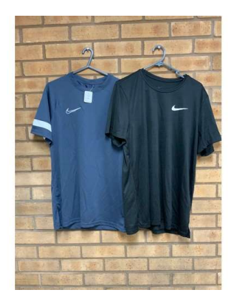
47. M - NIKE BLACK DRYFIT T-SHIRT SIZE M & BLUE NIKE T-SHIRT SIZE M COST NEW £38.94 (P23170721/JT0/04)