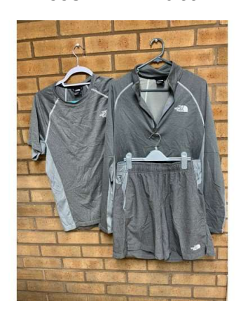
34. M - NORTHFACE FLASHDRY TRACK SHORTS,T-SHIRT & LONGSLEEVE ZIP TOP SIZE M COST NEW £140 (P23170721/JT/04)