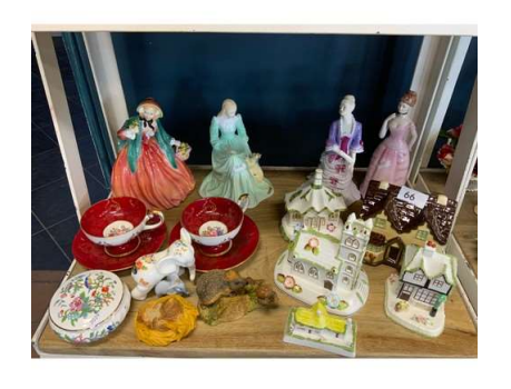
68. M - QUANTITY OF COLLECTABLE ORNAMENTS TO INCLUDE COLPORT COTTAGES, AINSLEY WARE, COLPORT LADIES & ROYAL DOULTON.