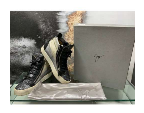
137. M - GIUSEPPE ZANNOTTI HI SNAKE BLACK LEATHER HIGH TOP TRAINERS IN BOX SIZE 43 - COST NEW £595 (11/ P23051789)