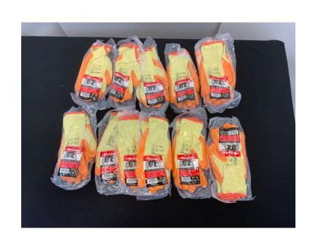
84. V - CRINKLE LATEX COATED WORK GLOVE SIZE 10" XL