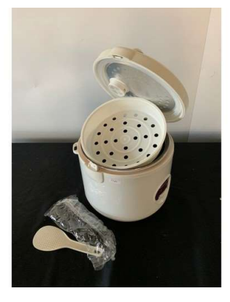
94. V - REISHUNGER RICE COOKER - NO BOX