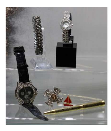
158. M - CJ SCOTLAND CELTIC BROOCH, ENAMEL SAILING BOAT BROOCH & VINTAGE PEN, DIAMONTE BRACELET & DIAMONTE EVE MON CROIS WATCH & DIAMONTE RIVER ISLAND WATCH