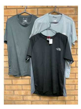
45. M - 3 NORTH FACE T SHIRTS (GREY,DARK GREY,BLACK) SIZE M COST NEW £83.99 (P23170721/JT/04)