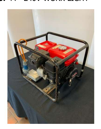
81. M - HONDA GENNIE ELECTRONIC IGNITION EG1500X