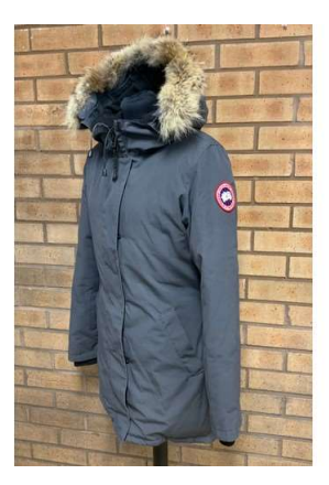
150. M - CANADA GOOSE VICTORIA PARKA JACKET 3037L GRAPHITE SIZE SMALL - COST NEW £1095 (12/P23051789)