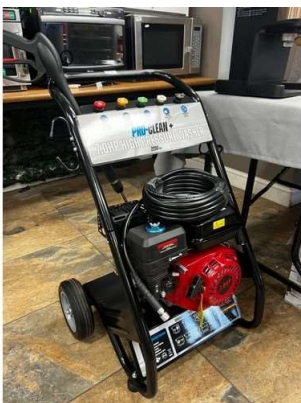
36. V - NEW PRO CLEAN+ 7.0HP HIGH PERFORMANCE PETROL PRESSURE WASHER (CT1757) OIL NEEDED