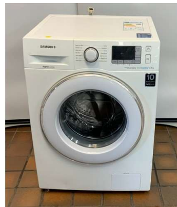
39. M - SAMSUNG ECOBUBBLE 8KG WASHING MACHINE MODEL WF80F5E5U4W - COST NEW £399