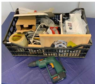
1. M - SUNDRY BOX