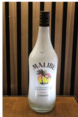
133. M - MALIBU 1 Ltr RRP £21 ( P23082501 / C )