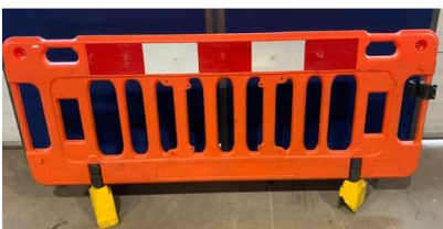
100. V - 1 X CHAPTER 8 SAFETY FENCING/BARRIER