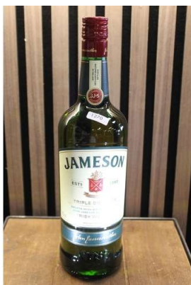
153. M - JAMESON 1 Ltr RRP £33 ( P21218926 / C )