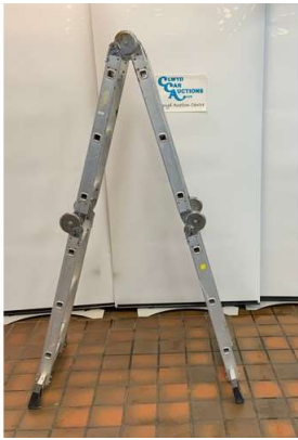
73. M - ALU STEP LADDER - 5 RUNG