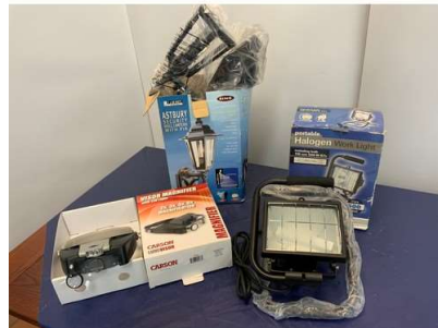
47. M - NEW PORTABLE HALOGEN LIGHT, ASTBURY SECURITY WALL LANTERN WITH PIR, CARSON VISOR MAGNIFIER