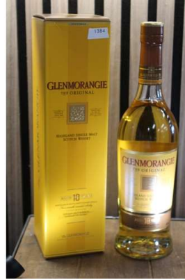
171. M - GLENMORANGIE 10 YEAR SINGLE MALT WHISKEY IN BOX 70cl RRP £39.99 ( P24182511 / C )