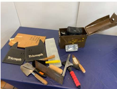
67. M - ASS OF TOOLS, PAIR TRIUMPH MUD FLAPS, SUNDRY BOX PLUS GARMIN NUVI SAT NAV