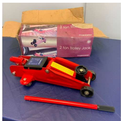
52. M - NUPOWER 2 TON TROLLEY JACK RRP £32