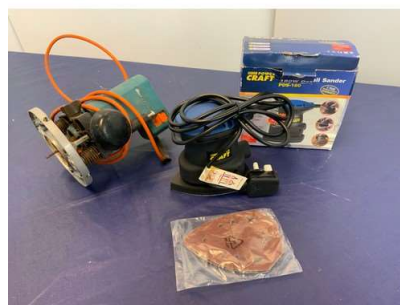
86. M - POWERCRAFT 180W SANDER & BLACK & DECKER ROUTER 240V