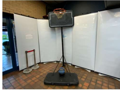
45. M - LIFETIME BASKETBALL NET AND BALL - COST NEW £89