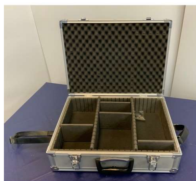
6. M - SILVER HARDCASE