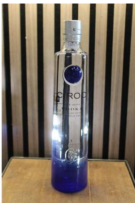
170. M - CIROC SNAP FROST VODKA 70cl RRP £32.99 ( P23208597 / C )