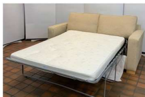
193. M - FURNITURE VILLAGE 'OSCAR' OATMEAL SOFA BED - COST WHEN NEW £1385