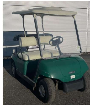
196. M - 2005 YAMAHA G22A PETROL GOLF BUGGY - SERIAL NUMBER JU0-215765 RRP £1700