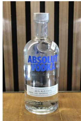
141. M - ABSOLUT VODKA 700ml RRP £22.50 ( P23021967 / C )