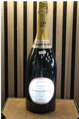
192. M - LAURENT-PERRIER MAGNUM CHAMPAGNE 1.5 Ltr RRP £95.99 ( P21218926 / C )