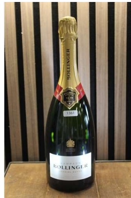
188. M - BOLLINGER SPECIAL CURVE CHAMPAGNE 75cl RRP £58 ( P21048105 / C )