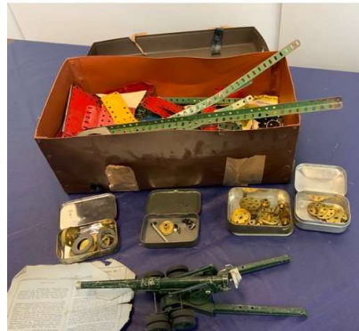
62. M - BOX ASS MECCANO