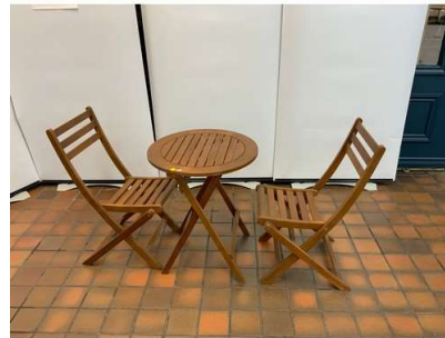
70. M - ROUND WOODEN FOLDING TABLE & 2 CHAIRS