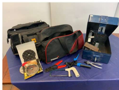
8. M - 2 BAGS ASS TOOLS & NEW STRONG BOX