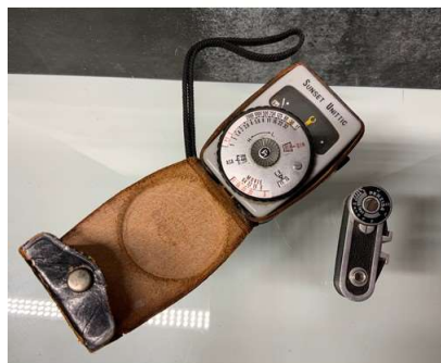
107. M - VINTAGE SUNSET UNITTIC LIGHT METER IN LEATHER CASE & PRIZIA RANGE FINDER FOR VINTAGE CAMERAS