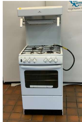
38. M - NEW WORLD GAS COOKER & GRILL MODEL M55THLG - COST NEW £519