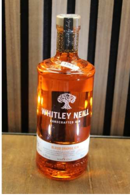
135. M - WHITLEY NEIL BLOOD ORANGE GIN 70cl RRP £29.99 ( P23018420 / C )