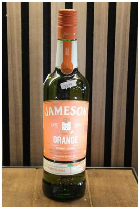
160. M - JAMESONS ORANGE WHISKY 700ml RRP £24.50 ( P23138786 / C )