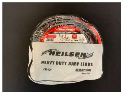
85. V - NEW NEILSON 800 AMP HD JUMP LEADS 6M NEISLEN