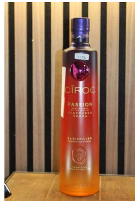
165. M - CIROC PASSION FRUIT VODKA 70cl RRP £34.99 ( P23138788 / C )