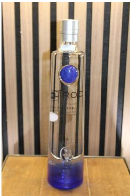
169. M - CIROC SNAPFROST VODKA 70cl RRP £32.99 ( P24182511 / C )