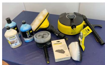
30. M - KARCHER ACCESSORIES & 1 STONE & PAVING CLEANER RRP £64 & 2 CAR SHAMPOOS