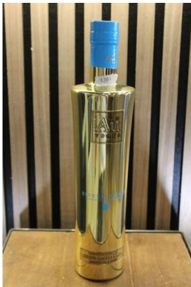
145. M - AU VODKA BLUE RASPBERRY 70cl RRP £34.99 ( P24182511 / C )