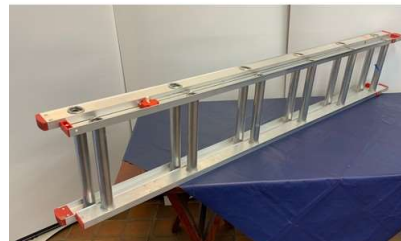
72. M - SET ALU LADDERS - 12 RUNG