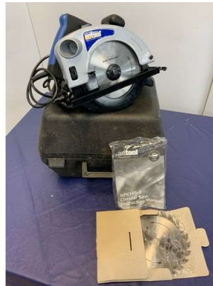
13. M - NU TOOL CIRCULAR SAW NPK185-2