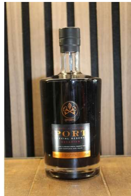
180. M - M & S SPECIAL RESERVE OPORTO PORT 50cl RRP £15 ( P21218926 / C )