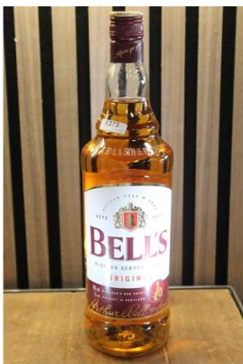
122. M - BELLS WHISKY 1 LTR RRP £24 ( P21218926 / C )