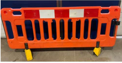
97. V - 1 X CHAPTER 8 SAFETY FENCING/BARRIER