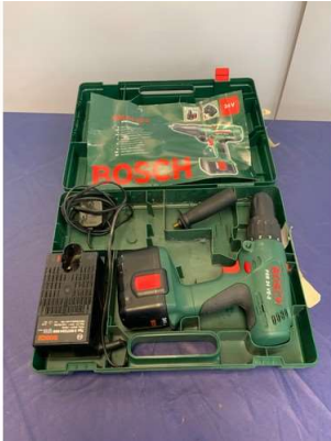
58. M - BOSCH VE2 BATTERY DRILL WITH CHARGER - 24V - RPR £60+