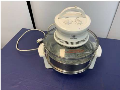
43. M - RUSSELL HOBBS HALOGEN OVEN - MODEL 18537 240V - RRP £49