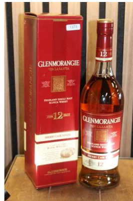
173. M - GLENMORANGIE 12 YEAR SINGLE MALT WHISKEY IN BOX 70cl RRP £51.50 ( P24182511 / C )