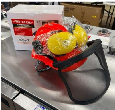
83. V - NEW NEILSON SAFETY HELMET WITH VISOR AND EAR PROTECTOR CT5290