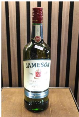
152. M - JAMESON 1 Ltr RRP £33 ( P21218926 / C )