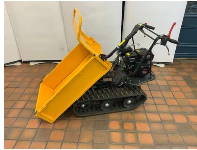
194. V - MINI DUMPER MANUAL TIPPER WITH LONCIN G200F ENGINE RRP £1700+