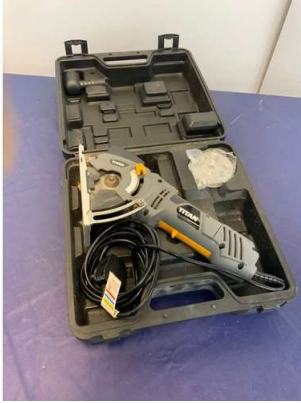
33. M - TITAN 500W MINI CIRCULAR SAW 240V RRP £45