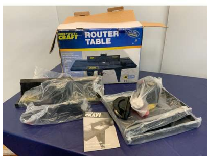
3. M - NEW POWERCRAFT ROUTER TABLE 450 X 335mm RRP £59