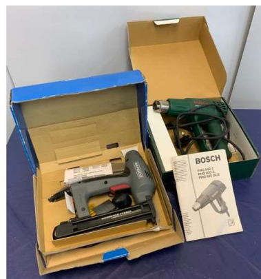
31. M - RAPESCO NAIL STAPLER RRP £14 & BOSCH HOT AIR GUN RRP £45