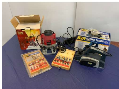
51. M - POWER DEVIL 1020W ROUTER WITH 24 ROUTER BITS & POWERCRAFT ELEC PLANER WK900EH