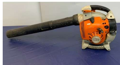
79. V - STIHL BGB6C PETROL BLOWER - COST NEW £379