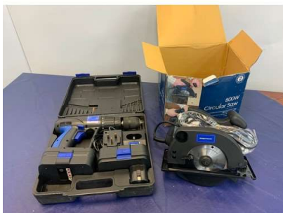
92. M - NUTOLL BATTERY DRILL INC CHARGER, 2 BATTERIES & NUPOWER 800W CIRCULAR SAW