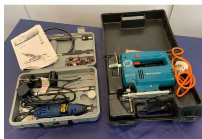
7. M - POWERCRAFT MINI DREMEL TOOL KIT & BLACK & DECKER JIG SAW 240V