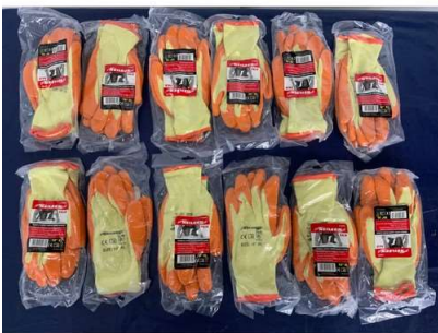
11. V - 12 X NEW NEILSON CRINKLE LATEX COATED WORK GLOVE SIZE 10" XL