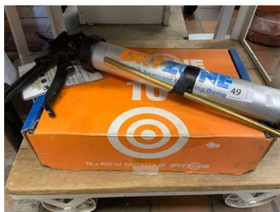
49. V - DRYZONE DP 81 DRY ZONE GUN - RRP £63.99 & BOX OF DRY ZONE CREAM (10 PACK PER BOX) RRP £194 PER BOX