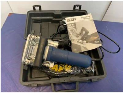
9. M - POWER CRAFT 850W BUSCUIT JOINTER RRP £39.99