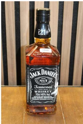
128. M - 1 X JACK DANIELS 70cl RRP £26( P22019022 / C )