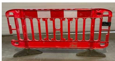
95. V - 1 X CHAPTER 8 SAFETY FENCING/BARRIER