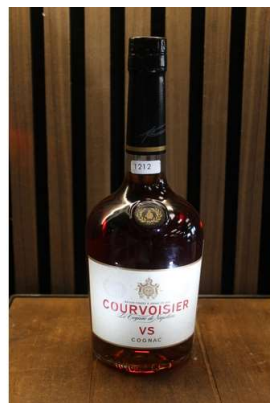
142. M - COURVOISIER VS COGNAC 700ml RRP £33 ( P23138793 / C )