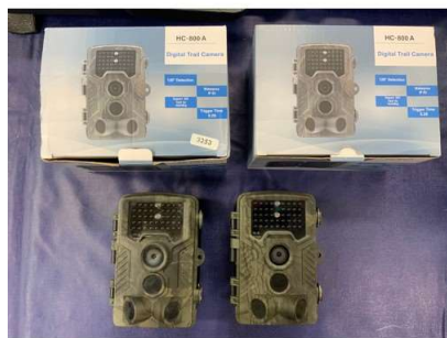
105. M - 2 x TOPHUNT HC800A FDH 42XIR HUNTING CAMERA RRP £62.25 EACH