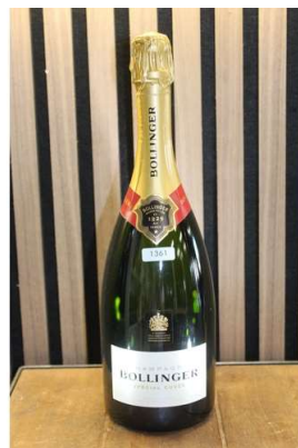
189. M - BOLLINGER SPECIAL CURVE CHAMPAGNE 75cl RRP £58 ( P21048105 / C )