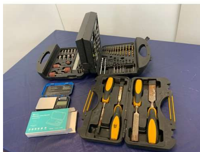
55. M - BRIFIT DIGITAL MINI SCALES, JCB WOOD CHISEL, BOX DRILLS, HOLE CUTTERS, DRUM SANDERS & LARGE ASS OF BITS - PHILIPS, FLAT, HEX