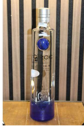
163. M - CIROC SNAP FROST VODKA 70cl RRP £32.99 ( P23208597 / C )