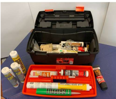
60. M - TOOL BOX OF ASS SEALANTS