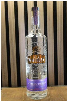
137. M - JJ WHITLEY NEILL LONDON DRY GIN 70CL RRP £17 ( P23138798 / C )