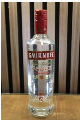
138. M - SMIRNOFF VODKA 70cl RRP £17.75 ( P18039605 / C )