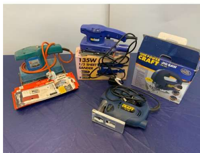
54. M - BLACK & DECKER SANDER & NUTOOL SANDER135W & POWERCRAFT PS700 JIGSAW