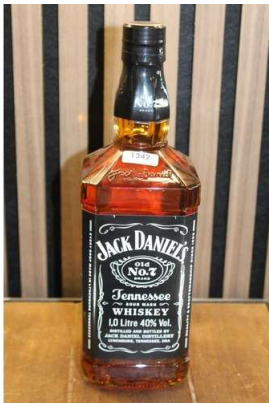
120. M - JACK DANIELS 1 Ltr RRP £35 ( P22049466 / C )