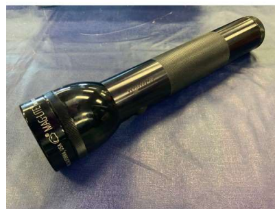
110. M - MAG-LITE TORCH 25CM 2 D - CELL RRP £49