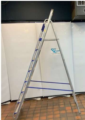
74. M - ALU STEP LADDER 8 RUNG