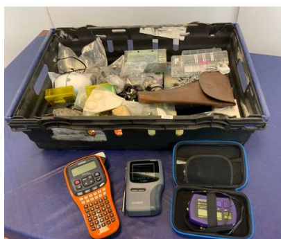
4. M - SUNDRY BOX - METRES, SCREWS ETC