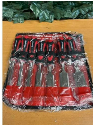
14. V - NEW NEISLON WOOD CHISEL SET 7PC