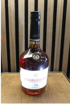
143. M - COURVOISIER 700ML RRP £33 ( P23208610 / C )