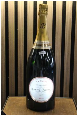
191. M - LAURENT-PERRIER MAGNUM CHAMPAGNE 1.5 Ltr RRP £95.99 ( P21218926 / C )