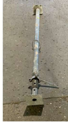
101. M - ACRO PROP