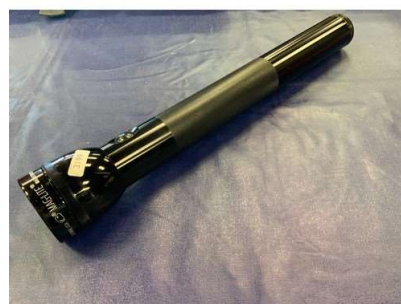
111. M - MAG-LITE TORCH 37CM 4 D - CELL RRP £49.99