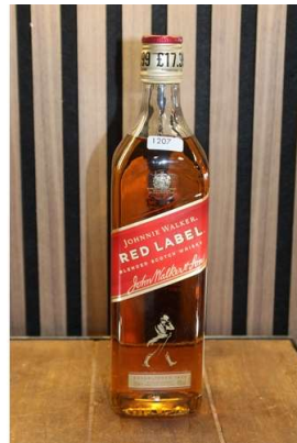
179A. M - JOHNNIE WALKER RED LABEL 70CL RRP £23.50 ( P23138796 / C )