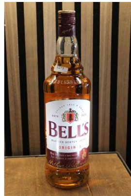
124. M - BELLS WHISKY 1 LTR RRP £24 ( P21218926 / C )