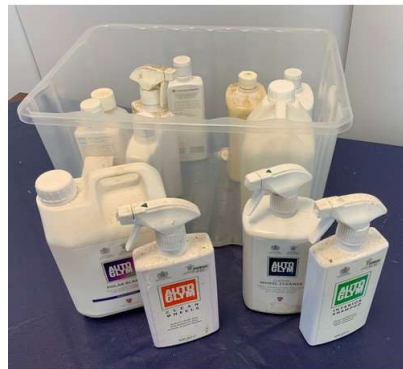
63. M - BOX OF CAR POLISH, CLEANER & SHAMPOOS