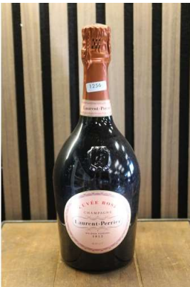
183. M - LAURENT-PERRIER CHAMPAGNE ROSE 750ml RRP £79.99 ( P21218926 / C )