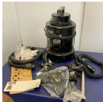
71. M - VAX MULTI PURPOSE VACUUM CLEANER 1300W 6130SX