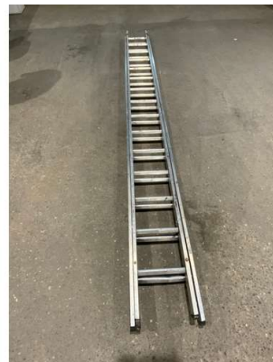
104. M - SET OF LADDERS ALLUMINIUM 24FT