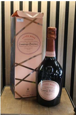
184. M - LAURANT PERRIER CURVE ROSE CHAMPAGNE 750ML IN BOX RRP £79.99 ( P24182511 / C )