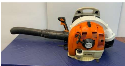
76. M - STIHL PETROL BLOWER BR450 RRP £534