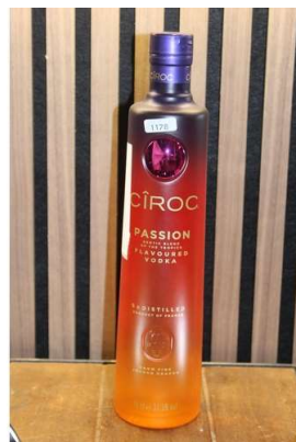
166. M - CIROC PASSION FRUIT VODKA 70cl RRP £34.99 ( P23138788 / C )