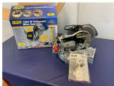
87. M - POWERCRAFT 1300W COMPOUND MITRE SAW WITH LASER