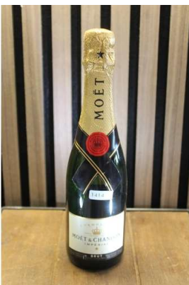
185. M - MOËT CHANDON CHAMPAGNE 375ml RRP £25 ( P24182511 / C )