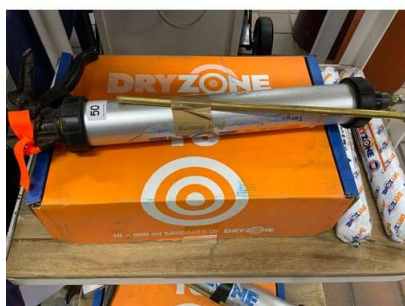
50. V - DRYZONE GUN C/W 2 TUBES CREAM & BOX OF DRY ZONE CREAM (10 PACK PER BOX) RRP £194 PER BOX