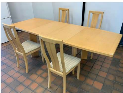
44. M - SKOVBY DENMARK DINING SUITE COMPRISING OF EXTENDING DINING TABLE LENGTH FROM 4'8" TO 7'6", 4 UPHOLSTERED CHAIRS