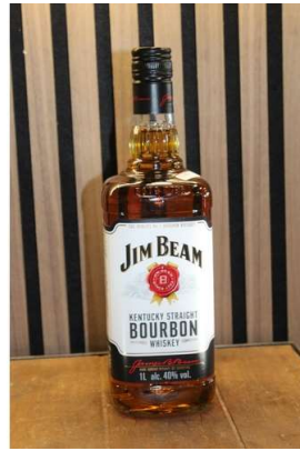
131. M - JIM BEAM 1 Ltr RRP £27 ( P23082500 / C )