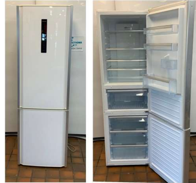
46. M - PANASONIC FRIDGE FREEZER MODEL Y3WB1273 - COST NEW £459