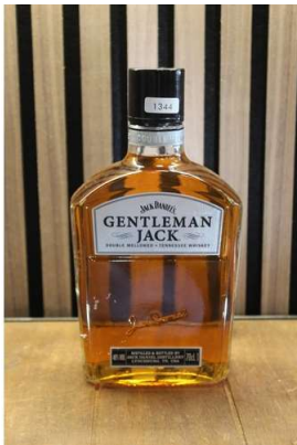
177. M - GENTLEMAN JACK 70cl RRP £34 ( P18039604 / C )