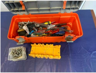
57. M - SUNDRY BOX OF TOOLS & BOLTS