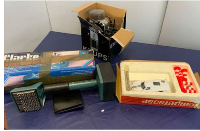
61. M - CLARKE CARPET KNEE KICKER & VINTAGE CHILDS TOY CAR & KRUPS GVX2 BURR GRINDER