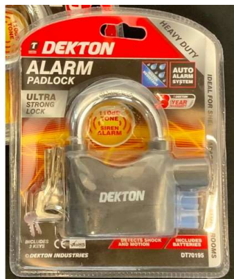
25. V - NEW DEKTON ALARM PADLOCK