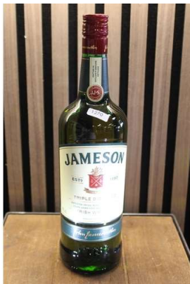
151. M - JAMESON 1ltr RRP £33 ( P23208616 / C )