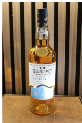
158. M - THE GLENLIVET SINGLE MALT WHISKEY 70cl RRP £27 ( P24182511 / C )