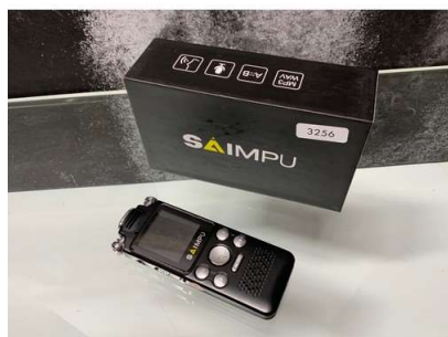
106. M - SAIMPU DIGITAL VOICE RECORDER IN BOX RRP £29