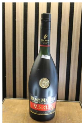
156. M - REMY MARTIN COGNAC 70cl RRP £46 ( P24182511 / C )