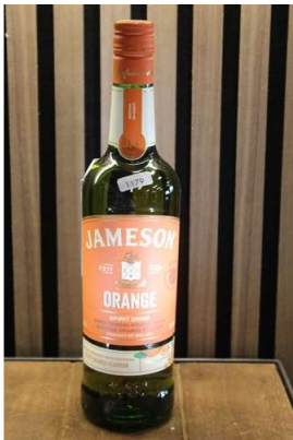
161. M - JAMESONS ORANGE WHISKY 700ml RRP £24.50 ( P23138786 / C )