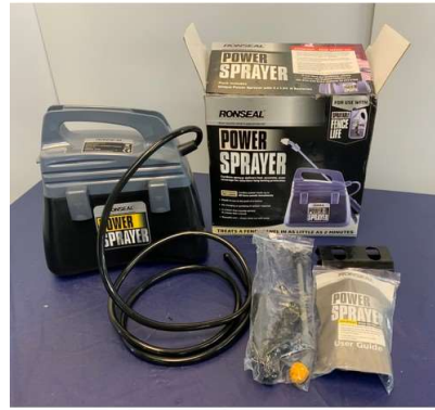
77. M - RONSEAL POWER SPRAYER 6V RRP £29.95