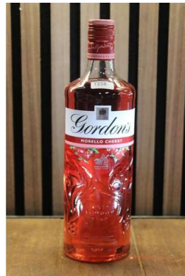
164. M - GORDONS MORELO CHERRY GIN 70cl RRP £18.50 ( P23208620 / C )