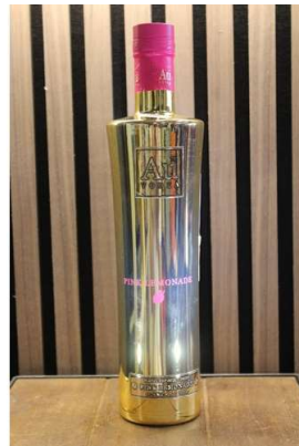
148. M - AU VODKA PINK LEMONADE 70cl RRP £34.99 ( p23138790 / C )