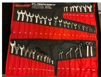
32. V - NEW NEILSON SPANNER SET 48PC SATIN FINISH CT0876