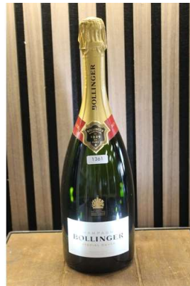
187. M - BOLLINGER SPECIAL CURVE CHAMPAGNE 75cl RRP £58 ( P21048105 / C )