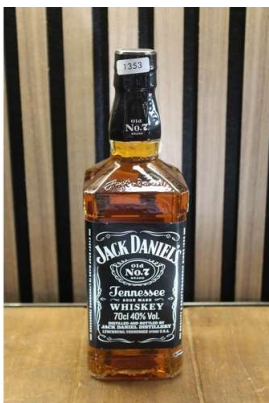
130. M - JACK DANIELS 70cl RRP £26 ( P22049466 / C )