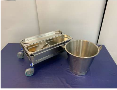
41. M - STAINLESS STEEL STEAMER & BUCKET