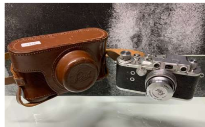
109. M - VINTAGE REID & SIGRIST III RANGE FINDER CAMERA SERIAL NUMBER 1651 IN LEATHER CASE - ONLINE PRICES £1500+