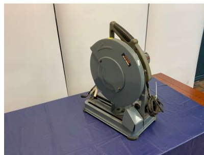
88. M - TOOLTEC CUT OFF MACHINE STONE CUTTER - BLADE D1/356 240V