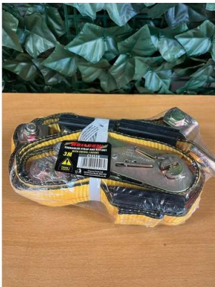
19. V - NEW NEILSON CAR HAULER STRAP AND RATCHET WITH SWIVEL J HOOKS