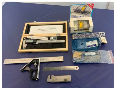
64. M - PRECISION TOOLING INC MOORE & WRIGHT 0-1 MICROMETER, WORKZONE DIGITAL VERNER CALLIPER , STEEL RULE & OLFA 45 DEGREE CUTTING TOOL