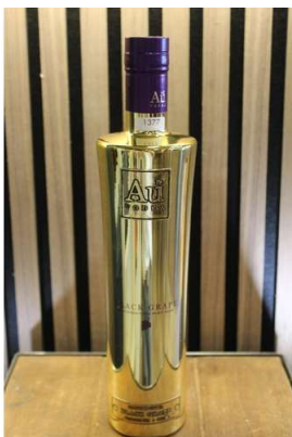
146. M - AU VODKA BLACK GRAPE 70cl RRP £34.99 ( p23138790 / C )