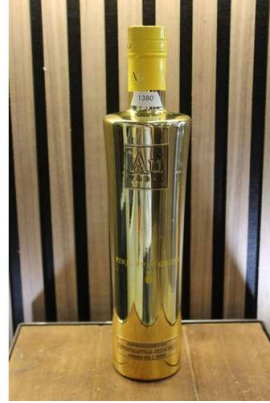
147. M - AU VODKA PINEAPPLE 70cl RRP £34.99 ( P24182511 / C )