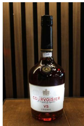
150. M - COURVOISIER 700ml RRP £33 ( P23208614 / C )