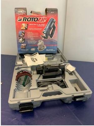
17. M - ROTOZIP SPIRAL SAW & ZIPMATE COMBO KIT 550W RRP £63