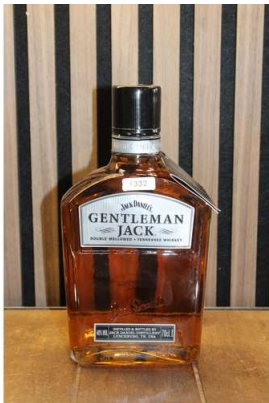
176. M - GENTLEMAN JACK 70cl RRP £34 ( P18039604 / C )