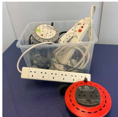
48. M - BOX ASS EXTENSION CABLES