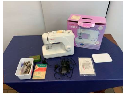
69. M - SINGER 1507 SEWING MACHINE RRP £125 & TABLE PLUS ACCESSORIES, NEEDLES ETC