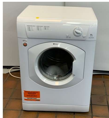
40. M - HOTPOINT AQUARIUS TUMBLE DRYER MODEL TVHM80 - COST NEW £289