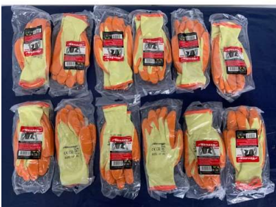
12. V - 12 X NEW NEILSON CRINKLE LATEX COATED WORK GLOVE SIZE 10" XL