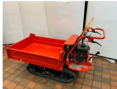
195. V - NEW - UNUSED CANYCOM BP415D TRACKED CARRIER. HYDRAULIC DROPSIDE BODY- SERIAL NUMBER 7240083. 2 FORWARD & 2 REVERSE GEARS