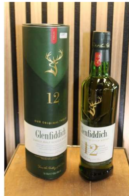
172. M - GLENFIDDICH SINGLE MALT WHISKEY IN BOX 70cl RRP £31.99 ( P24182511 / C )