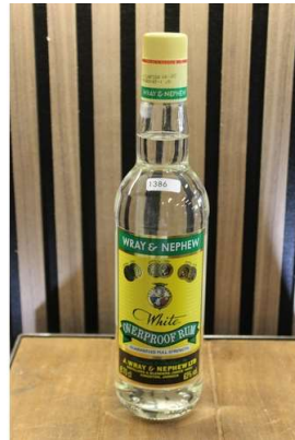
132. M - WRAY & NEPHEW WHITE RUM 70cl RRP £30 ( P23133789 / C )