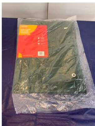
27. V - NEW 12 X 8 GREEN TARPAULIN