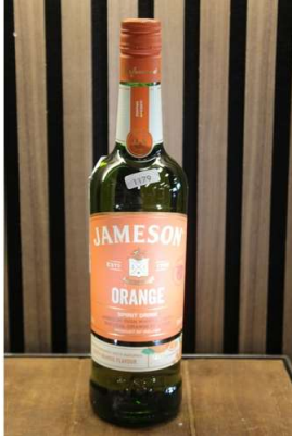
159. M - JAMESONS ORANGE WHISKY 700ML RRP £24.50 ( P23138786 / C )