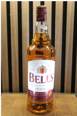
121. M - BELLS WHISKY 1 LTR RRP £24 ( P21218926 / C )