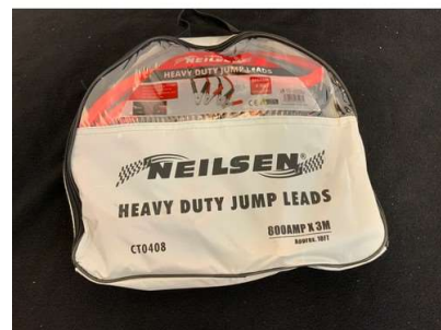
16. V - NEW NEILSON 800 AMP HD JUMP LEADS 3M CT0408