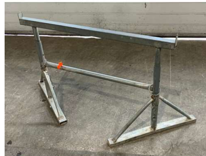
103. V - 1 X PLASTERER TRESTLE