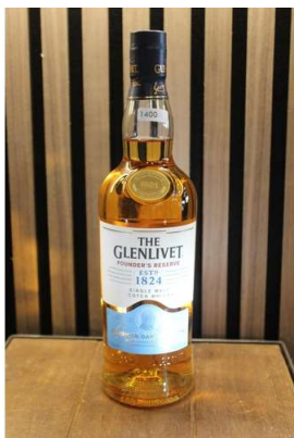
154. M - THE GLENLIVET SINGLE MALT WHISKEY 70cl RRP £27 ( P24182511 / C )