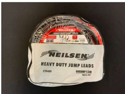
84. V - NEW NEILSON 800 AMP HD JUMP LEADS 6M NEISLEN