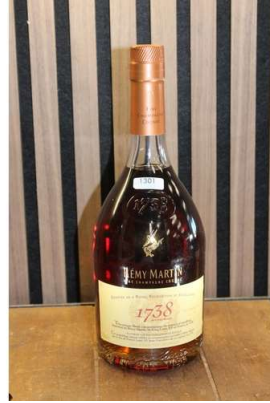
179. M - REMY MARTIN CHAMPAGNE COGNAC 70cl RRP £56 ( P20140604 / C )