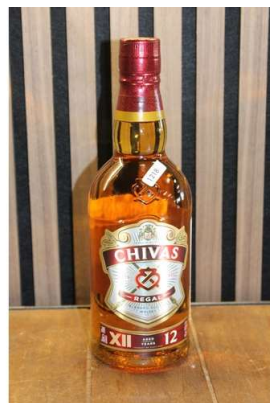
181. M - CHIVAS REGAL 70cl RRP £30.50 ( P23208613 / C )