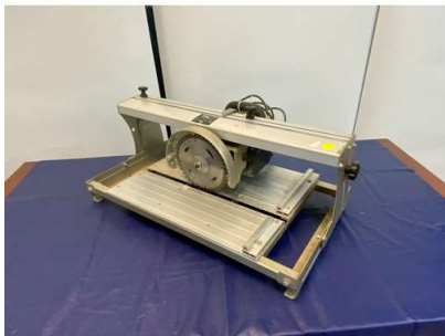
89. M - TILE-IT ELECTRIC 240V CUTTER MODEL T0180111