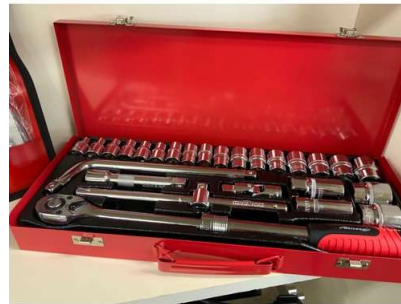
22. V - NEW NEILSON SOCKET SET - 26PC 1/2 IN DRIVE WITH EXT RATCHET