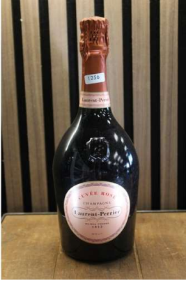
182. M - LAURENT-PERRIER CHAMPAGNE ROSE 750ml RRP £79.99 ( P21218926 / C )