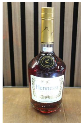
174. M - HENNESSY COGNAC 70cl RRP £37.50 ( P23138804 / C )