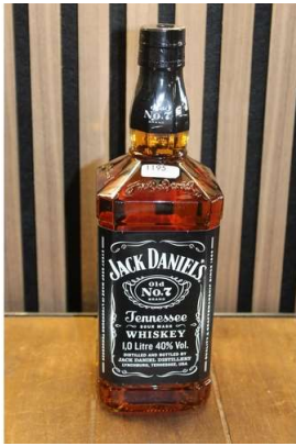
119. M - JACK DANIELS 1LTR RRP £35 ( P23138792 / C )