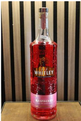
168. M - JJ WHITLEY RASPBERRY VODKA 1 Ltr RRP £23 ( P22154256 / C )