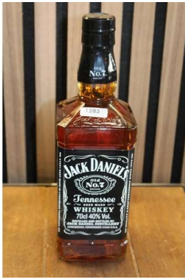
127. M - JACK DANIELS 70CL RRP £26 ( P2000342 / C )