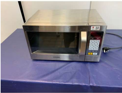
42. M - SAMSUNG COMMERCIAL MICROWAVE 1.6KW - MODEL CM1089 - RRP £317