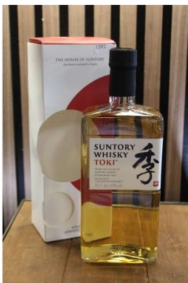
178. M - SUNTORY WHISKEY TOKI 70CL 70cl RRP £35 ( P24182511 / C )