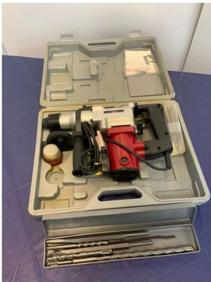
18. M - POWER DEVIL ROTARY HAMMER DRILL - MODEL PDD2005K