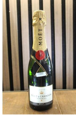
186. M - MOËT & CHANDON IMPERIAL CHAMPAGNE 375ml RRP £25 ( P22154256 / C )