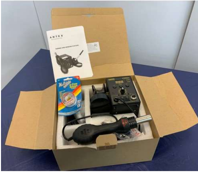
65. M - ANTEX 760RWK SMD REDWORK STATION - SOLDERING ETC RRP £204