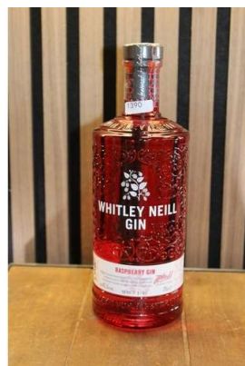
134. M - JJ WHITLEY NEILL RASPBERRY GIN 70cl RRP £37.50 ( P23133789 / C )