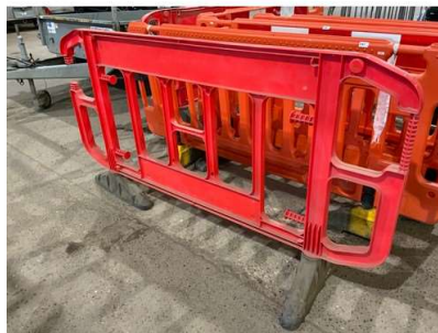
96. V - 1 X CHAPTER 8 SAFETY FENCING/BARRIER