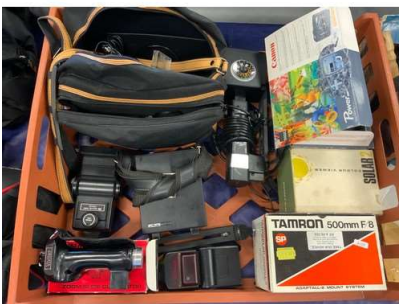
68. M - SELECTION OF CAMERA EQUIPMENT- TAMARON 500MM, 200M LENS, DIGITAL TRAIL CAMERA, SOLAR 2 COLOUR VIEWER