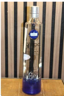
162. M - CIROC VODKA 70cl RRP £38 ( P23208601 / C )