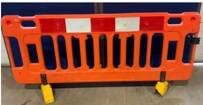
99. V - 1 X CHAPTER 8 SAFETY FENCING/BARRIER