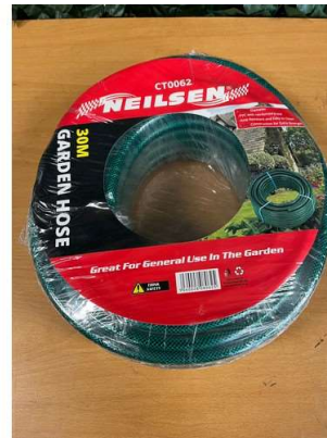
23. V - NEW NEILSON GARDEN HOSE 30 METRE