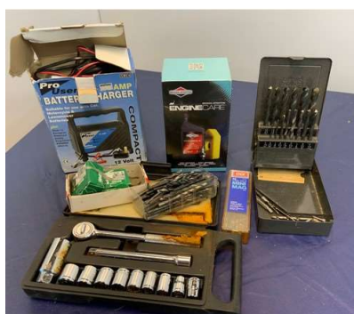
56. M - TASKMASTER SOCKET SET, PROUSER 4 AMP BATTERY CHARGER, BRIGGS & STRATTON ENGINE CARE OIL, 3 BOXES OF DRILL BITS