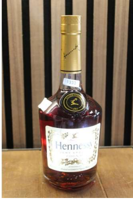
175. M - HENNESSEY 70cl RRP £37.50 ( P21048127 / C )