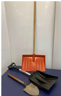
94. M - 3 SHOVELS, SNOW SHOVEL, SPEAR & JACKSON EXT SHOVEL & SMALL POTTING SHOVEL