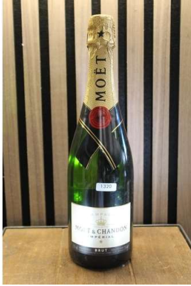
190. M - MOËT & CHANDON IMPERIAL CHAMPAGNE 750ml RRP £44 ( P23208607 / C )