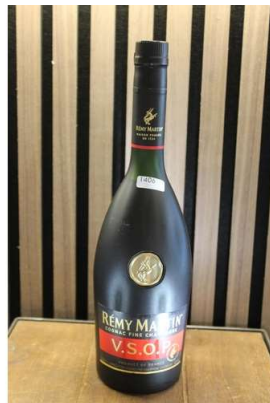
155. M - REMY MARTIN COGNAC 70cl RRP £46 ( P24182511 / C )