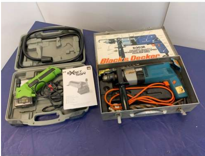
10. M - BLACK & DECKER 750W REVERSING HAMMER DRILL RRP £63 & EXAKT SAW MODEL EC310N RRP £19.99