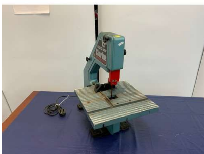
91. M - CLARKE WOOD WORKER BAND SAW C85-12W/240V