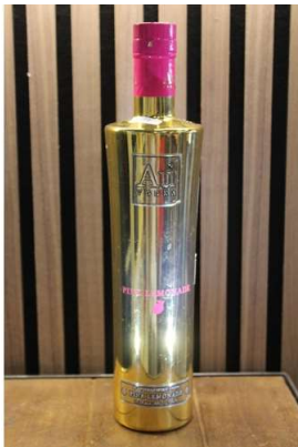
144. M - AU VODKA PINK LEMONADE 70cl RRP £34.99 ( p23138790 / C )