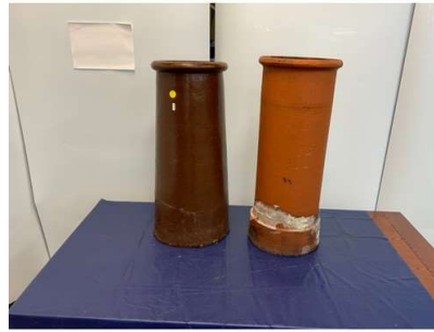
37. M - PAIR OF CHIMNEY POTS