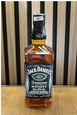
129. M - JACK DANIELS 70cl RRP £26 ( P22049466 / C )