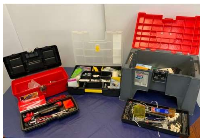
53. M - 3 X TOOL BOXES & ASS TOOLS & SPARES