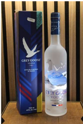
136. M - GREY GOOSE VODKA 700ml RRP £41.50 ( P18039600 / C )