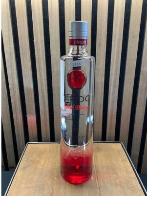
167. M - CIROC RED BERRY VODKA 70cl RRP £38 ( P23208596 / C )