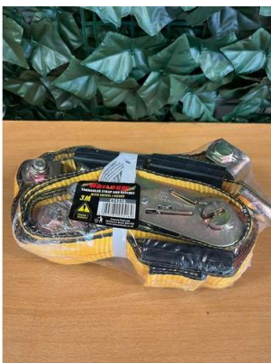
20. V - NEW NEILSON CAR HAULER STRAP AND RATCHET WITH SWIVEL J HOOKS