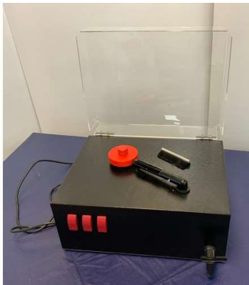
66. M - MOTH MK11 PRO RECORD CLEANING MACHINE - COST NEW £488