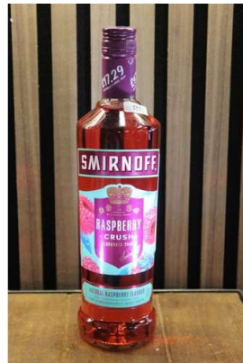
140. M - SMIRNOFF RASPBERRY CRUSH VODKA 70cl RRP £18.50 ( P23208594 / C )