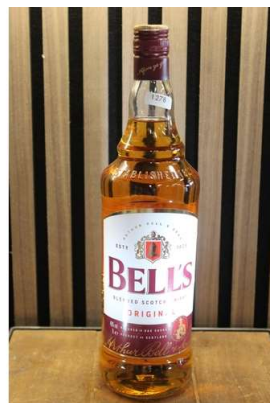
126. M - BELLS WHISKY 1 LTR RRP £24 ( P21218926 / C )