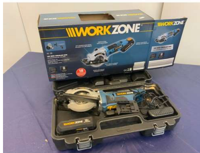
93. M - WORKZONE 18V MINI CIRCULAR SAW