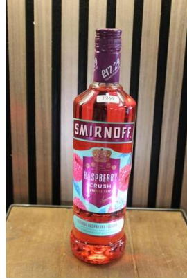
139. M - SMIRNOFF RASPBERRY VODKA 70cl RRP £18.50 ( P23208616 / C )