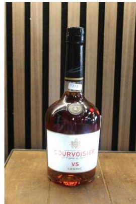
149. M - COURVOISIER VS COGNAC 700ml RRP £33 ( P23138793 / C )