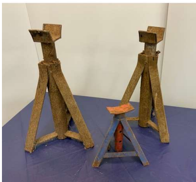
75. M - 3 ACRO PROPS