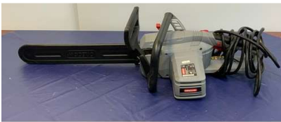
34. M - OREGON ELECTRIC CHAIN SAW C51500-092 RRP £149.99