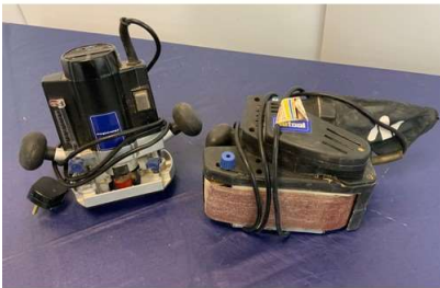
59. M - NUTOOL 720W SANDER & NUTOOL ROUTER 240V