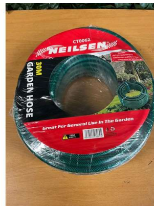
24. V - NEW NEILSON GARDEN HOSE 30 METRE