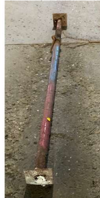
102. M - ACRO PROP