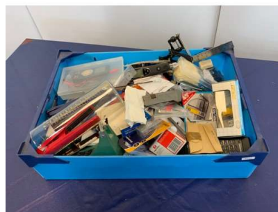
5. M - SUNDRY BOX