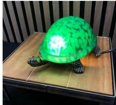
147. V - NEW TURTLE TABLE LAMP - GREEN 20.3 CM