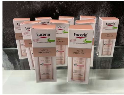
124. M - 10 BOXES EUCERIN ANTI-PIGMENT DUAL SERUM 30ML RRP £41.99 EXP 07/2024 (TOTAL £419.90) (P24021143/A)