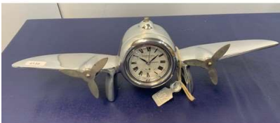
160. M - AERPOSTALE PAR AVION PLANE CLOCK RRP £90