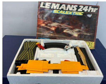
117. M - LARGE BOX OF SCALEXTRIC LE MANS 24HR