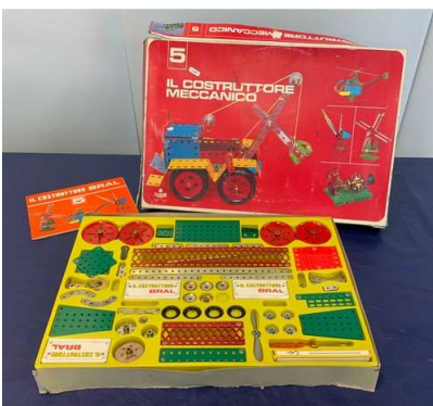
153. M - BOX OF VINTAGE COSTRUTTORE MECCANICO