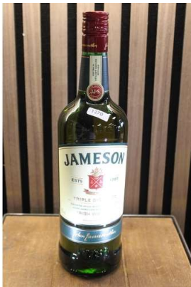
208. M - JAMESON WHISKY 1 Ltr RRP £33 ( P23208608 / C )