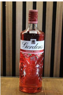
233. M - GORDONS MORELO CHERRY GIN 70cl RRP £18.50 ( P23208620 / C )