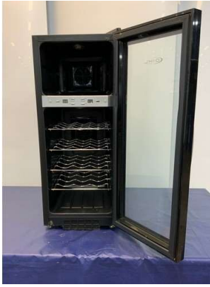
88. M - DIHL WINE CHILLER 240V ELECTRIC MODEL WF-21BD - COST NEW £300+