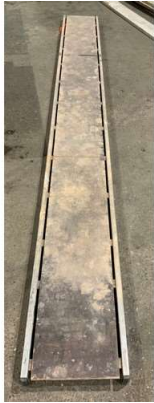
182. V - 16FT YOUNGMAN BOARD