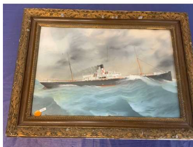
38. M - GILT FRAMED WATER COLOUR SIGNED SS HUELVA PICTURE IN FRAME