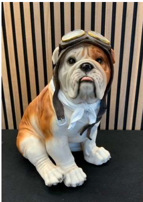
143. V - NEW BULLDOG PILOT 41CM - RRP £100