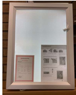
31. V - NEW SNAPLIGHT SINGLE SIDED A2 ILLUMINATED NOTICE BOARD RRP £141