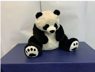
82. M - CHILDS LARGE PLUSH PANDA