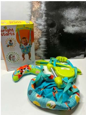
41. M - BRIGHT START BABY DOOR BOUNCER