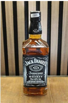
240. M - JACK DANIELS 70CL RRP £26 ( P23138792 / C )