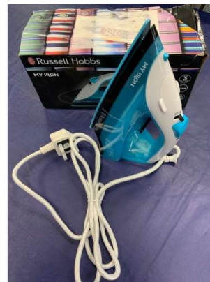
15. V - RUSSELL HOBBS MY IRON 1800W STEAM IRON rrp £16.95