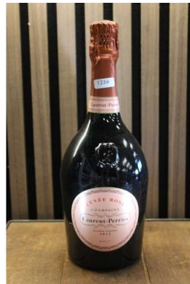
252. M - LAURENT-PERRIER CHAMPAGNE ROSE 750ml RRP £79.99( P21218926 / C )