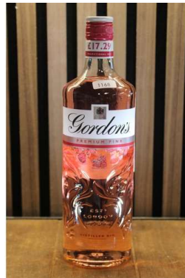
235. M - GORDONS PREMIUM PINK GIN 70cl RRP £18.50 ( P23208611 / C )