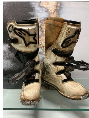
195. M - ALPINESTARS T6 MOTORCROSS BOOTS SIZE 44.5