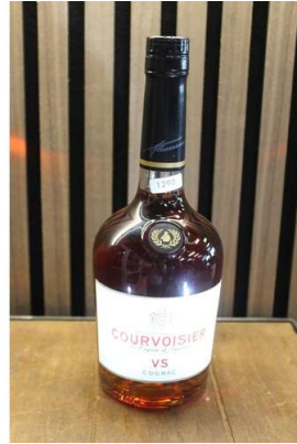
250. M - COURVOISIER 700ML RRP £33 ( P23208610/C )