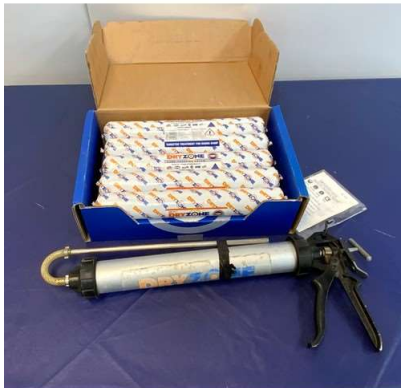
176. V - DRYZONE DP 81 DRY ZONE GUN - RRP £63.99 & BOX OF DRY ZONE CREAM (10 PACK PER BOX) RRP £194 PER BOX