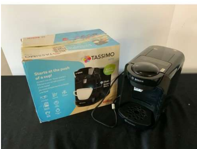
12. V - BOSCH TASSIMO BLACK EDITION DRINKS MAKER - RRP £39.99