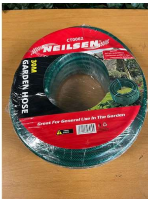
91. V - NEW NEILSON GARDEN HOSE 30 METRE