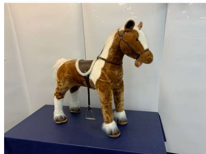
79. M - CHILDS PLUSH SHETLAND PONY - COST NEW £200