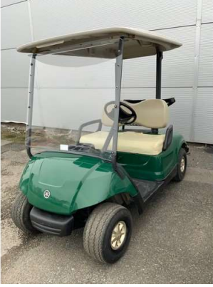
198. M - YAMAHA G29A PETROL GOLF BUGGY SERIAL NO JW1 209828