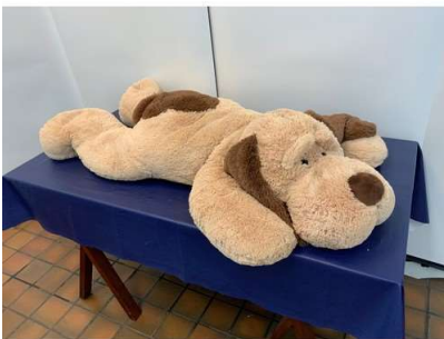
83. M - CHILDS LARGE PLUSH DOG TOY