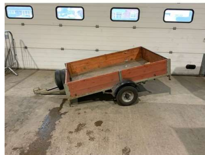
180. V - 4FT X 6FT WOODEN TRAILER WITH SPARE WHEEL & LIGHTS