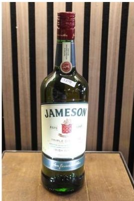
207. M - JAMESON WHISKY 1 Ltr RRP £33 ( P23208598 / C )