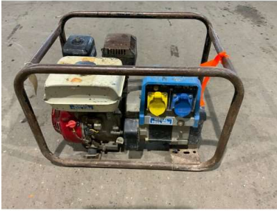
190. V - PETROL GENERATOR WITH HONDA GX150 5.5 ENGINE - 2.7KVA