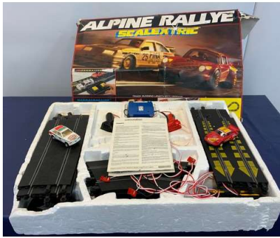
112. M - LARGE BOX OF SCALEXTRIC ALPINE RALLYE