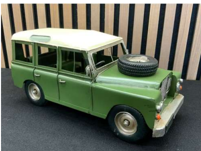
161. V - NEW - MODEL 4 X 4 STATION WAGON - 33CM