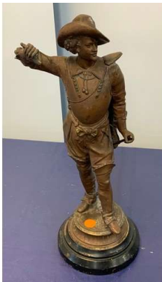
136. M - VINTAGE MUSKETEER METAL STATUE