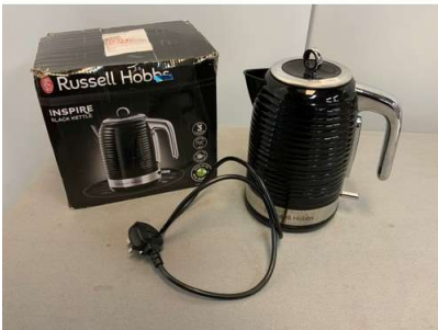
27. V - RUSSELL HOBBS INSPIRE BLACK KETTLE RRP £31.99