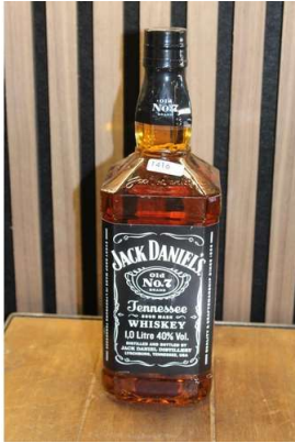
206. M - 1ltr Jack Daniels 1 Ltr RRP £35 ( P18039609 / c )