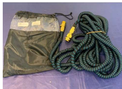
8. M - EXTENDABLE HOSEPIPE IN BAG - APROX 60FT - RRP £40