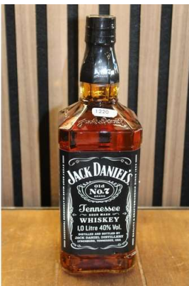
201. M - JACK DANIELS 1 Ltr RRP £35 ( P23208603 / C )