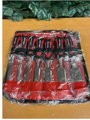
93. V - NEW NEILSON WOOD CHISEL SET 7PC