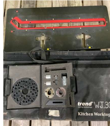
187. V - WORKTOP COMBI JIG 640H - COST NEW £209 WITH ROUTER TOOLING