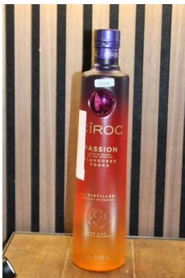
225. M - CIROC PASSION FRUIT VODKA 70cl RRP £34.99 ( P23138788 / C )