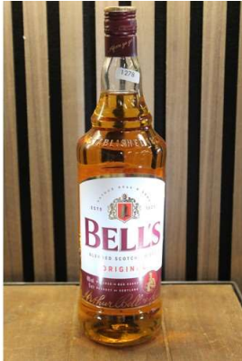
215. M - BELLS WHISKY 1 Ltr RRP £24 ( P21218926 / C )