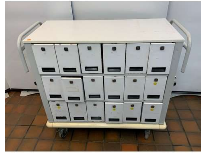
44. M - BRISTOL MAID MULTI STORAGE METAL CABINET ON WHEELS RRP £4284