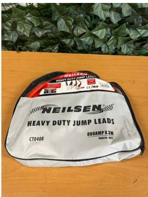
100. V - NEILSON 800 AMP HD JUMP LEADS 3M (CT0408)