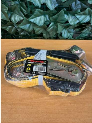
97. V - NEW NEILSON CAR HAULER STRAP AND RATCHET WITH SWIVEL J HOOKS