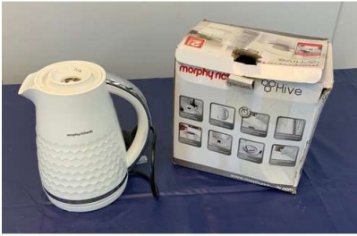
25. V - MORPHY RICHARDS 1.5 LITRE JUG KETTLE WHITE RRP £28.99