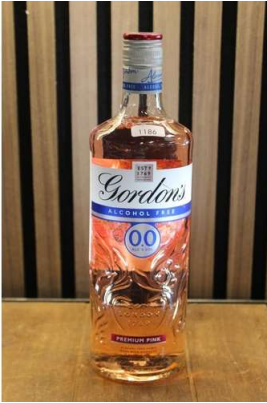
230. M - GORDONS 0% ALC PINK GIN 70cl RRP £14 ( P23138785 / C )