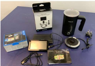
10. M - GARMIN SAT NAV RRP £65, GAMIN TRAVEL PACK- AC ADAPTER, CARRYING CASE, USB CABLES & CAPPUNCINO ELEC MILK FROTHER