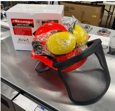
106. V - NEILSON SAFETY HELMET WITH VISOR AND EAR PROTECTION (CT5290)