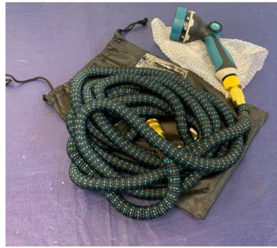
108. M - EXTENDABLE HOSEPIPE WITH SPRAY NOZZLE - APROX 35FT - RRP £35