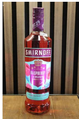
229. M - SMIRNOFF RASBERRY CRUSH VODKA 70cl RRP £18.50 ( P23208594 / C )