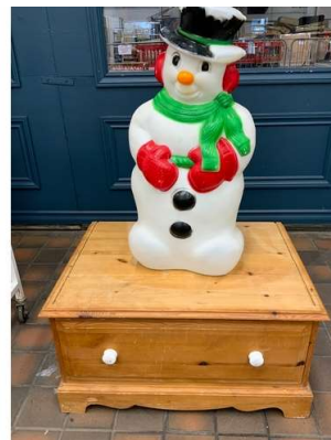
47. M - SINGLE DRAWER PINE STORAGE UNIT AND A CHEERY SNOWMAN