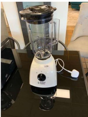
28. V - RUSSELL HOBBS BLENDER MODEL 24610 RRP £29