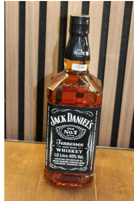
204. M - JACK DANIELS 1 Ltr RRP £35 ( P22049466 / C )