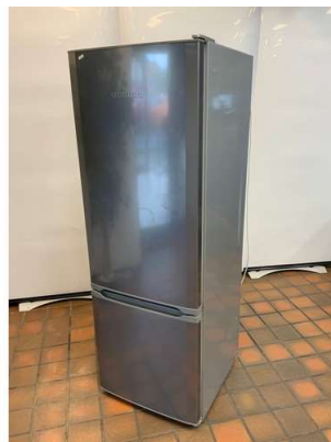
32. M - LIEBHER 60/40 FRIDGE FREEZER MODEL NN112Y - RRP £499