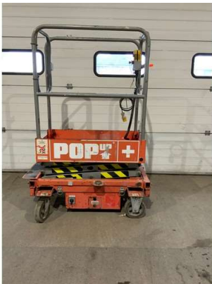
191. V - POP UP HYDRAULIC AUTOMATIC SCISSOR LIFT SERIAL NO PUP1410 - 2.5 METRE