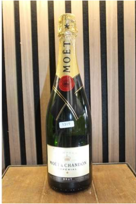
262. M - MOËT & CHANDON IMPERIAL CHAMPAGNE 750ml RRP £44( P23208607 / C )