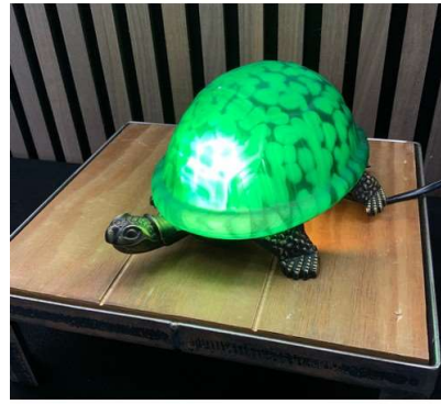
146. V - NEW TURTLE TABLE LAMP - GREEN 20.3 CM