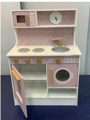
42. M - CHILDS TOY KITCHEN PINK & WHITE