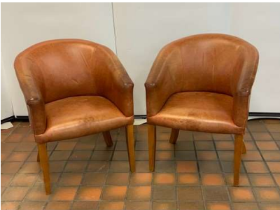
74. M - 2 X VINTAGE LEATHER TUB CHAIRS (SMALL TEAR OF BACK OF ONE CHAIR)