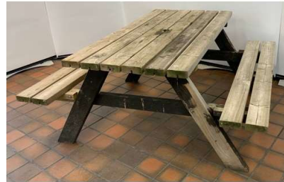
179. M - WOODEN GARDEN PICNIC BENCH/TABLE