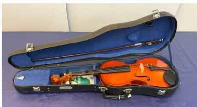
167. M - SKYLARK VIOLIN IN CASE - ONLINE £80-£150