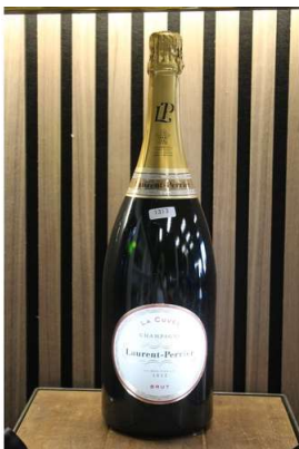
265. M - LAURENT-PERRIER MAGNUM CHAMPAGNE 1.5 Ltr RRP £95.99 ( P21218926 / C )