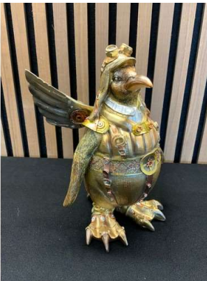
159. V - NEW STEAM PUNK PENGUIN PILOT - RRP £45