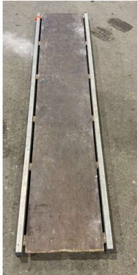
183. V - 6FT YOUNGMAN BOARD