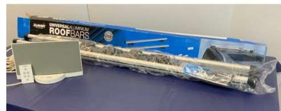
6. M - NEW UNIVERSAL SUMMIT ALU ROOF BARS - SUM003 & KEYS - RRP £45 & BOSE SOUND DOCK FOR IPOD WITH REMOTE