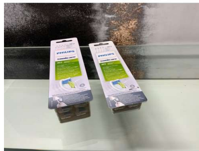
125. M - PHILIPS SONICARE W2 OPTIMAL WHITE TOOTHBRUSH HEADS PACK OF 4 & 8 PACK TOTAL RRP £55.07 (P22141035/A)