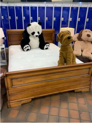
72. M - KINGSIZE PRELOVED WOODEN SLEIGH BED WITH SILENTNIGHT 1400 POCKET ORTHO MATTRESS AS NEW