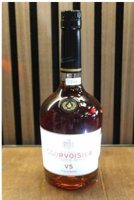
247. M - COURVOISIER COGNAC 700ml RRP £33 ( P23208614/C )