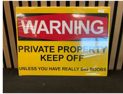
162. V - NEW - WARNING BIG BOOBS METAL SIGN - 30CM