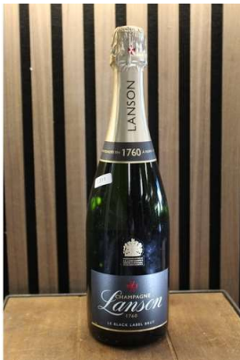
255. M - LANSON BLACK LABEL CHAMPAGNE 750ML RRP £42 ( P23208607 / C )