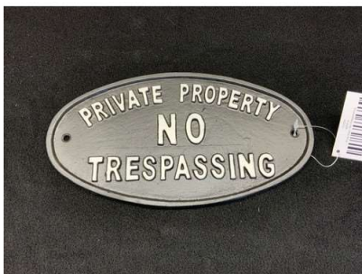
145. V - NEW CAST OVAL SIGN - NO TRESPASSING BLACK