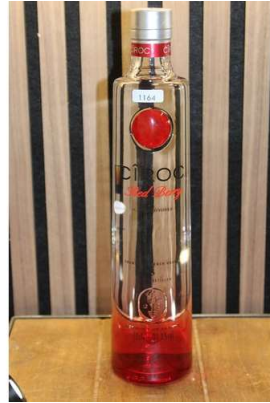
226. M - CIROC RED BERRY VODKA 70CL RRP £38 ( P23208596 / C )