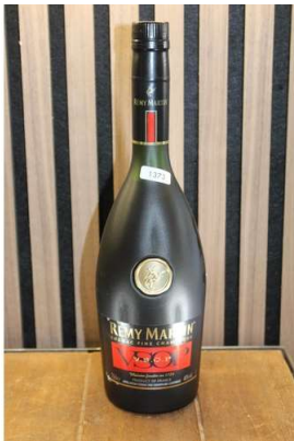
223. M - REMY MARTIN COGNAC 70cl RRP £46 ( P18039601 / C )