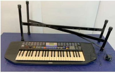
150. M - YAMAHA ELECTRIC KEYBOARD MODEL PSR-78 & STAND