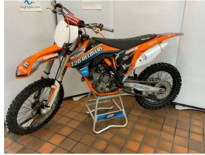
194. M - APPROX 2014 KTM 250 MOTORCROSS BIKE, RENTAL BARS, WP SHOCKS