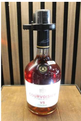
249. M - COURVOISIER 700ML RRP £33 ( P23208607/C )