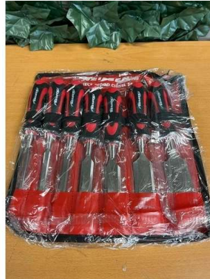
94. V - NEW NEILSON WOOD CHISEL SET 7PC