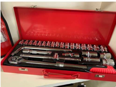
107. V - NEW NEILSON SOCKET SET - 26PC 1/2 IN DRIVE WITH EXT RATCHET