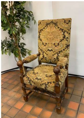
151. M - VINTAGE DUTCH OAKWOOD ARM CHAIR