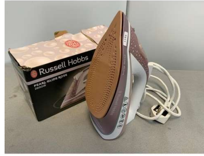
21. V - RUSSELL HOBBS PEARL GLIDE ROSE IRON 2600W RRP £24