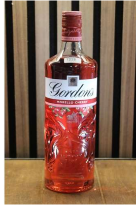
234. M - GORDONS MORELO CHERRY GIN 70cl RRP £18.50 ( P23208620 / C )