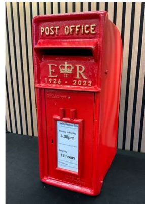
155. V - NEW - ER 1926-2022 CAST POST BOX RED 57CM WITH KEY