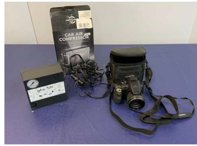
13. M - SWITORY CAR AIR COMPRESSOR RRP £12.99 / FUJI FINEPIX S3300 CAMERA IN BAG RRP £99