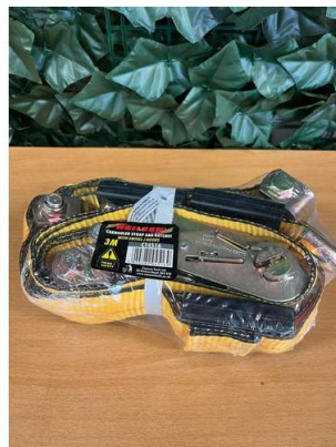
96. V - NEW NEILSON CAR HAULER STRAP AND RATCHET WITH SWIVEL J HOOKS