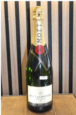
264. M - MOËT & CHANDON IMPERIAL CHAMPAGNE 750ml RRP £44 ( P23208607 / C )