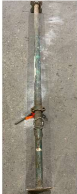
175. V - 1 X ACRO PROP