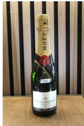
259. M - MOËT & CHANDON CHAMPAGNE 375ml RRP £25 ( P22066980 / C )