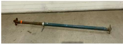
174. V - 1 X ACRO PROP