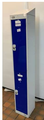
71. M - 2 CUPBOARD STEEL STAND ALONE LOCKER - COST £213 WHEN NEW