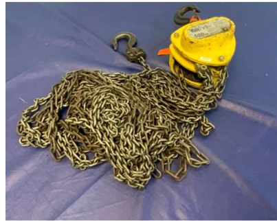
170. V - 500KG YALE CHAIN HOIST SERIAL NO S12080199