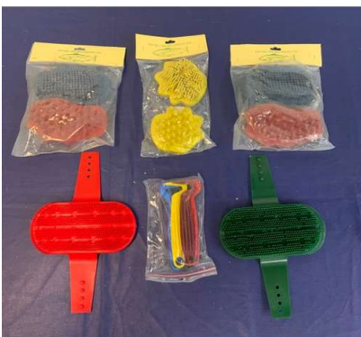
4. M - 1 X BAG NEW HORSE BRUSHES