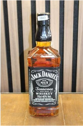
238. M - JACK DANIELS 70cl RRP £26 ( P22049466 / C )