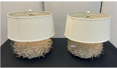
73. M - PAIR WHITE NEST SQUAT TABLE LAMPS RRP £234 - PRELOVED