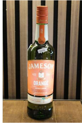
218. M - JAMESONS ORANGE WHISKY 700ml RRP £24.50 ( P23138786 / C )