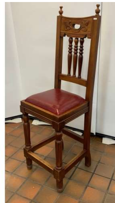
86. M - MAHOGANY HIGH BACK BAR STOOL WITH LEATHER SEAT - ONLINE £525 EACH