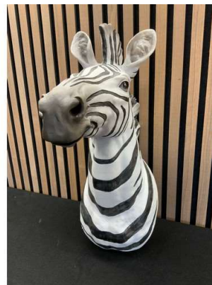
149. V - NEW ZEBRA HEAD BLACK & WHITE 46CM HANGING - RRP £95