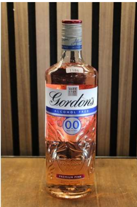
231. M - GORDONS 0% ALC PINK GIN 70cl RRP £14 ( P23138785 / C )