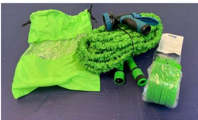
90. M - EXTENDABLE HOSEPIPE WITH SPRAY NOZZLE & HANGER - APPROX 60FT - RRP £40