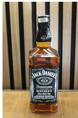
237. M - JACK DANIELS 70cl RRP £26 ( P22049466 / C )