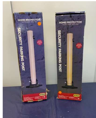
30. M - SET OF 2 SECURITY PARKING POSTS (LOCKS WITHOUT KEY) HOME PROTECTOR ITEM 670022 RRP £99.98