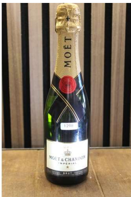
257. M - MOËT & CHANDON IMPERIAL CHAMPAGNE 375ml RRP £25 ( P22154256 / C )