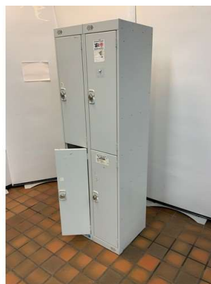
39. M - 4 CUPBOARD STEEL LOCKER - COST NEW £257