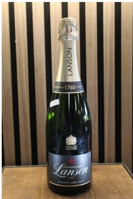
256. M - LANSON BLACK LABEL CHAMPAGNE 750ML RRP £42 ( P23208607 / C )