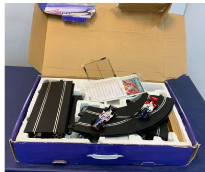
119. M - LARGE BOX OF SCALEXTRIC GRAND PRIX A1