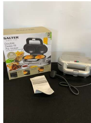
22. V - SALTER DOUBLE DEEP-FILL PIE MAKER used RRP £29.99