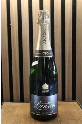
254. M - LANSON BLACK LABEL CHAMPAGNE 750ML RRP £42 ( P23208607 / C )