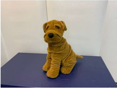
80. M - CHILDS SHAR PEIS DOG TOY