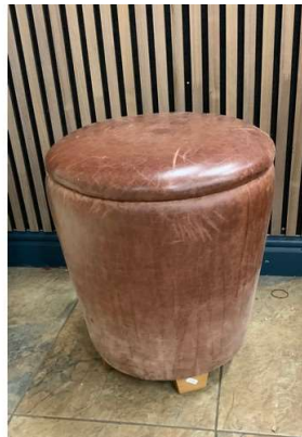
77. M - VINTAGE LEATHER STOOL - ONLINE £126 EACH