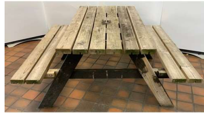
178. M - WOODEN GARDEN PICNIC BENCH/TABLE