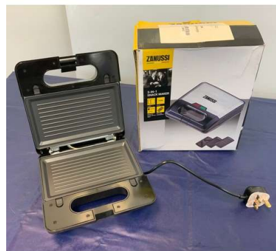
23. V - ZANUSSI 3 IN 1 SNACK MAKER 750W - 2 SLICE - RRP £50