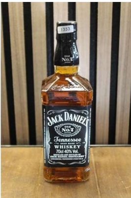
239. M - JACK DANIELS 70cl RRP £26 ( P22049466 / C )