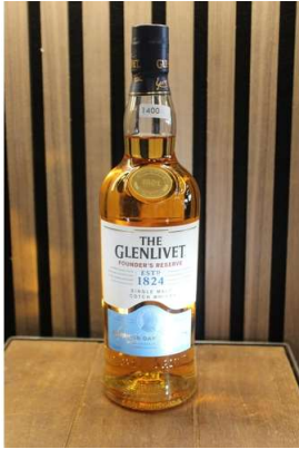
246. M - THE GLENLIVET SINGLE MALT WHISKEY 70cl RRP £27 ( P24182511/C )