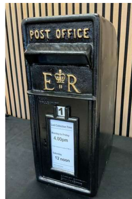
156. V - NEW ER ROYAL MAIL CAST POST BOX - BLACK 57CM - WITH KEY