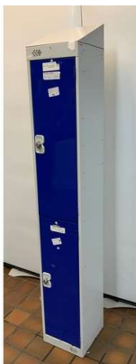
59. M - 2 CUPBOARD STEEL STAND ALONE LOCKER - COST £213 WHEN NEW