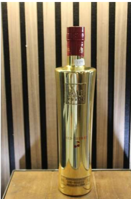
232. M - AU VODKA RED CHERRY 70cl RRP £34.99 ( P24182511 / C )