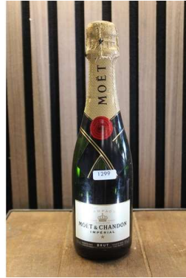
258. M - MOËT & CHANDON IMPERIAL CHAMPAGNE 375ml RRP £25 ( P22154256 / C )