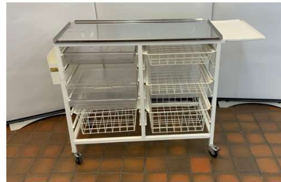
45. M - TWO SECTION MULTIPURPOSE MEDICAL TROLLEY SS TOP - COST WHEN NEW £1739