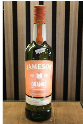
219. M - JAMESONS ORANGE WHISKY 700ml RRP £24.50 ( P23138786 / C )