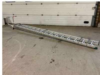
181. V - DOUBLE CAT LADDER