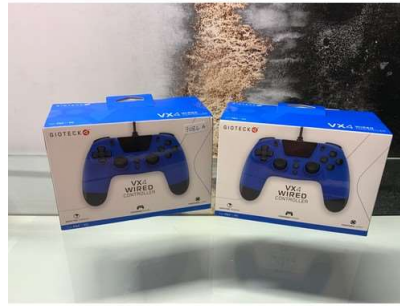
154. M - 2 X GIOTECK VX4 WIRED CONTROLLER FOR PLAYSTATION 4 TOTAL RRP £59.50 ( P22150610 /C )