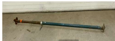
171. V - 1 X ACRO PROP