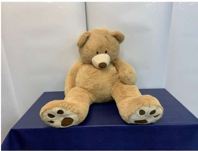
81. M - CHILDS LARGE PLUSH TEDDY BEAR