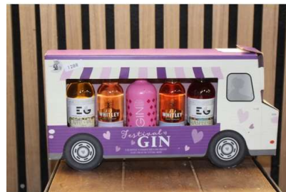
140. M - BOXED SETS 5CL GIN 5 x 5cl RRP £18.50 ( P20197828 / C )