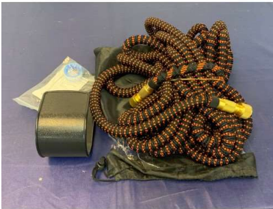
98. M - EXTENDABLE HOSE PIPE IN BAG WITH HANGER - APPROX 30FT - RRP £35