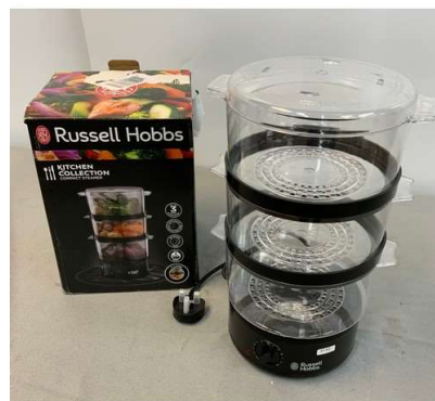
16. V - RUSSELL HOBBS KITCHEN COLLECTION COMPACT STEAMER RRP £33