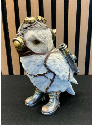
158. V - NEW STEAMPUNK OWL ROCKET- 21CM - RRP £30