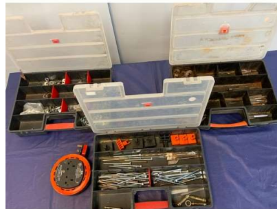
110. M - SET OF 3 STORAGE BOXES WITH SUNDRIES & 16FT EXTENSION LEAD