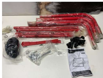
111. M - GOAL POST WITH NET NEVER USED