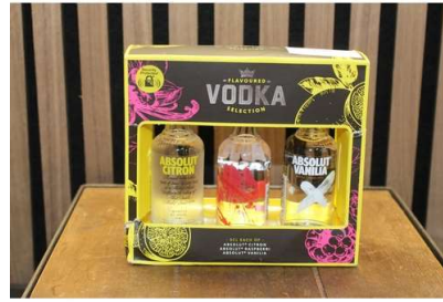
138. M - BOXED SETS 5CL VODKA 3 x 5cl RRP £10 ( P20197828 / C )