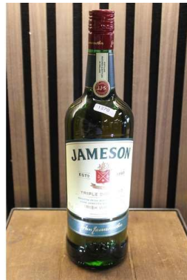
211. M - JAMESON IRISH WHISKEY 1LTR RRP £33 ( P23138794 / C )