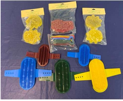
1. M - 1 X BAG NEW HORSE BRUSHES