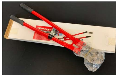
109. V - NEILSON 30" RED BOLT CUTTER (CT0297)