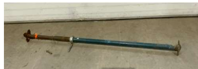
172. V - 1 X ACRO PROP