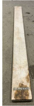
186. V - 4 X 8FT SCAFFOLD BOARDS