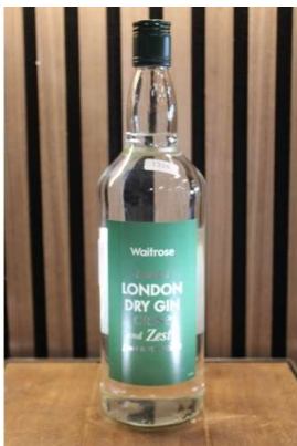
217. M - WAITROSE GIN 1 Ltr RRP £19 ( P21190827 / C )