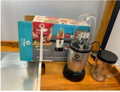
17. V - MAGIC BULLET NUTRI BLENDER RRP £50