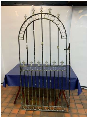
168. M - 6.5FT GARDEN GATE