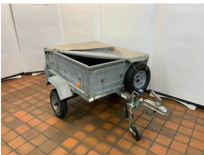
193. M - 4 X 3 ERDE TIPPER TAILGATE TRAILER WITH JOCKEY WHEEL & COVER - COST WHEN NEW £700