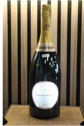
266. M - LAURENT-PERRIER MAGNUM CHAMPAGNE 1.5 Ltr RRP £95.99 ( P21218926 / C )