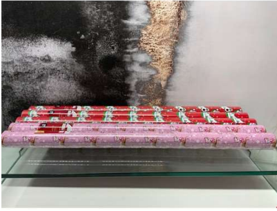
134. M - 5 X ROLLS OF CHRISTMAS WRAPPING PAPER ( P23214867/C)