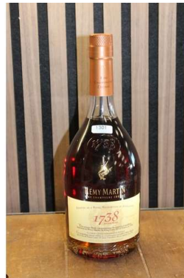
244. M - REMY MARTIN CHAMPAGNE COGNAC 70cl RRP £56 ( P20140604/C )