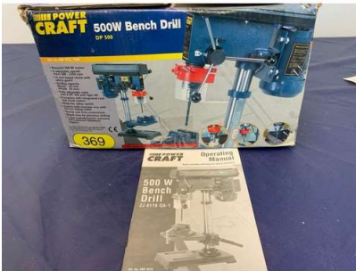
89. M - NEW POWERCRAFT 500W BENCH DRILL