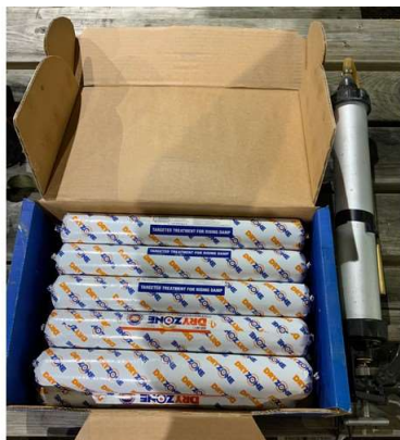
177. V - DRYZONE DP 81 DRY ZONE GUN - RRP £63.99 & BOX OF DRY ZONE CREAM (10 PACK PER BOX) RRP £194 PER BOX