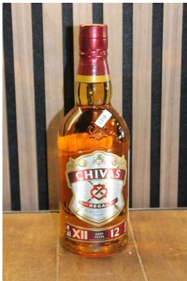
216. M - CHIVAS REGAL WHISKEY 70cl RRP £30.50 ( P23208613 / C )