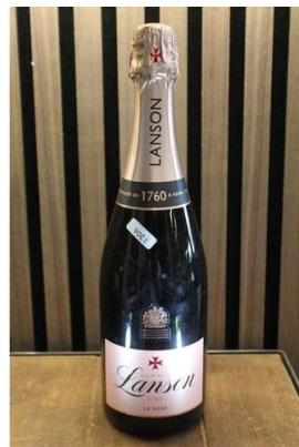
261. M - LANSON ROSE CHAMPAGNE 750ML RRP £47 ( P23208607 / C )