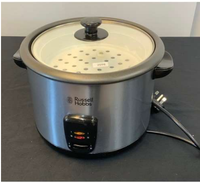
18. V - RUSSELL HOBBS RICE COOKER & STEAMER MODEL 19750 - RRP £39.99