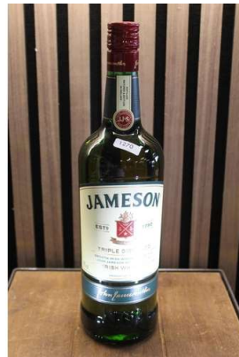
212. M - JAMESON WHISKY 1 Ltr RRP £33 ( P23208598 / C )