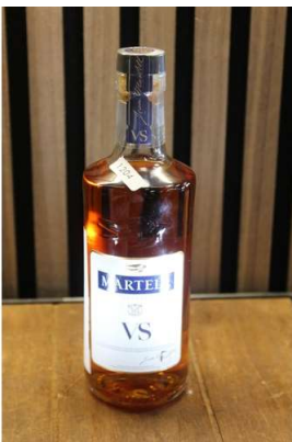
241. M - MARTELL VS COGNAC 35CL RRP £18.50 ( P23138805/C )