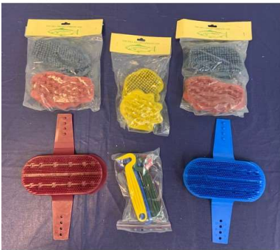
2. M - 1 X BAG NEW HORSE BRUSHES