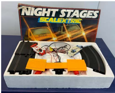
113. M - LARGE BOX OF SCALEXTRIC NIGHT STAGES