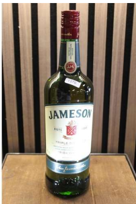
209. M - JAMESON WHISKY 1 Ltr RRP £33 ( P23208608 / C )