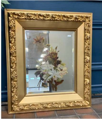
142. M - ANTIQUE GILT FRAMED MIRROR WITH HAND PAINTED GLASS