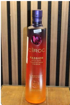
224. M - CIROC PASSION FRUIT VODKA 70CL RRP £34.99 ( P23138788 / C )