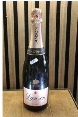
260. M - LANSON ROSE CHAMPAGNE 750ML RRP £47 ( P23208607 / C )