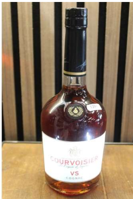
248. M - COURVOISIER 700ml RRP £33 ( P23208610/C )