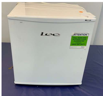
34. M - LEC SMALL WHITE FREEZER MODEL U50052W RRP £119.99