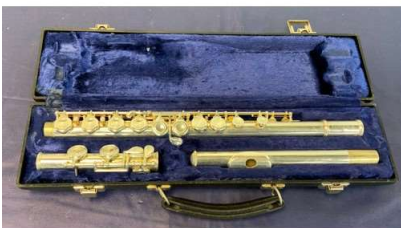
137. M - FLUTE IN BOX MODEL BLESSING USA - ONLINE £35-£70