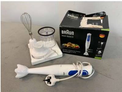
19. V - BRAUN MULTI QUICK3 HAND BLENDER RRP £51