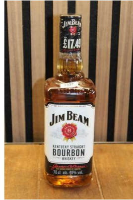
242. M - JIM BEAM 70cl RRP £27 ( P22019033/C)