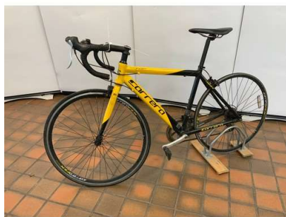
33. V - CARERRA TOUR DE FRANCE LTD EDITION YELLOW BLACK RACE BIKE WITH ALUMINIUM FRAME - COST NEW £269 (9618)