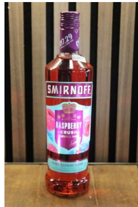
227. M - SMIRNOFF RASBERRY CRUSH VODKA 70cl RRP £18.50 ( P23208594 / C )