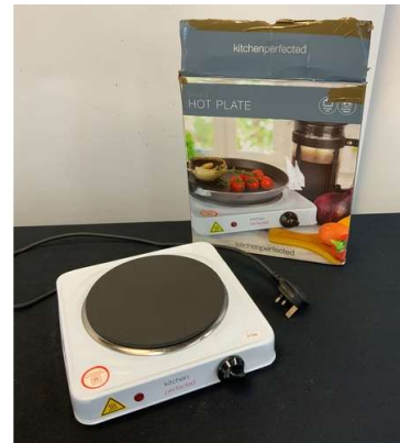
14. V - KITCHEN PERFECTED HOT PLATE RRP £19.98