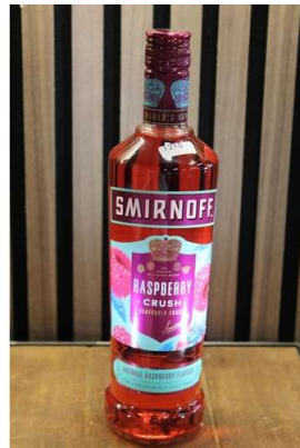
228. M - SMIRNOFF RASBERRY CRUSH VODKA 70cl RRP £18.50 ( P23138803 / C )