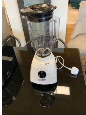
29. V - RUSSELL HOBBS BLENDER MODEL 24610 RRP £29