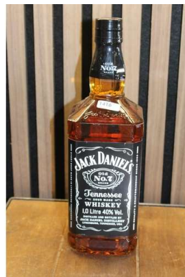
205. M - 1ltr Jack Daniels 1 Ltr RRP £35 ( P18039609 / c )