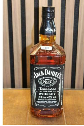
202. M - JACK DANIELS 1 Ltr RRP £35 ( P22049466 / C )