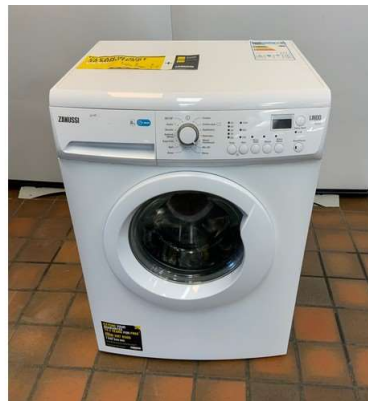
36. M - ZANUSSI LINDO 100 WASHING MACHINE - RRP £248