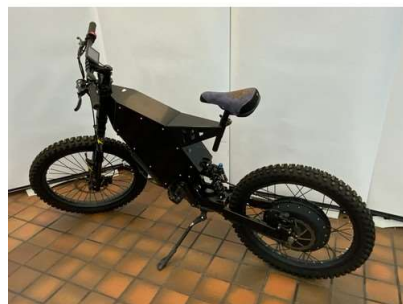
197. M - STEALTH BOMBER ELECTRIC BIKE WITH MEDUSA SEAT, BURNER RCP-2S REAR SHOCK, KKE FACTORY FRONT SHOCK WITH CHARGER & KEY