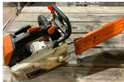
189. V - STIHL MS2001 TOP HANDED PETROL CHAIN SAW