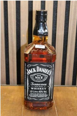
199. M - JACK DANIELS 1 Ltr RRP £35 ( P22049466 / C )