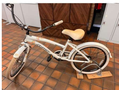
33A. M - WESTCOAST AVIGO GIRLS BIKE