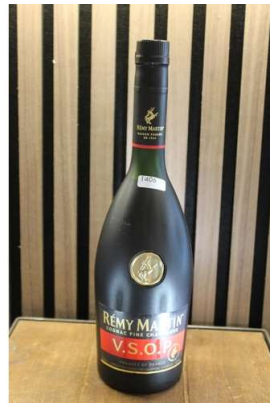
220. M - REMY MARTIN COGNAC 70cl RRP £46 ( P24182511 / C )