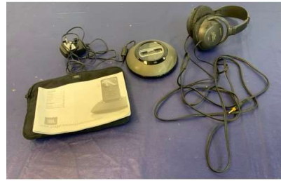
5. M - UBL IPOD DOCKING STATION WITH BAG & SONY CD250 HEADPHONES