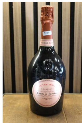
253. M - LAURENT-PERRIER CHAMPAGNE ROSE 750ml RRP £79.99( P21218926 / C )