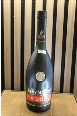
222. M - REMY MARTIN COGNAC 70cl RRP £46 ( P24182511 / C )