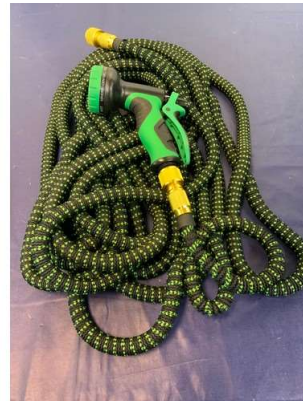
7. M - EXTENDABLE HOSEPIPE WITH SPRAY NOZZLE - extends to 150ft - RRP £49