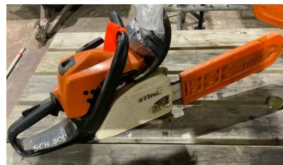
188. V - STIHL MS 171 PETROL CHAIN SAW - 14" WITH SPARE CHAIN