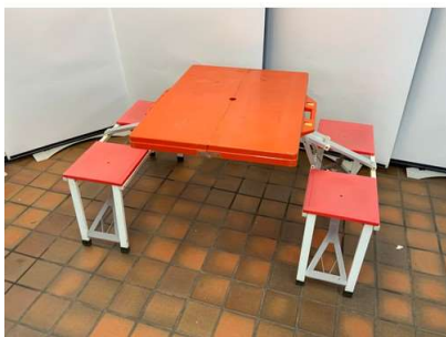
169. M - FOLDAWAY 4 SEATER BENCH