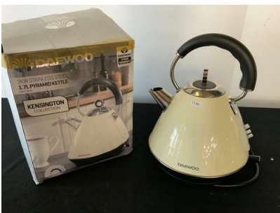
20. V - DAEWOO 1.7L PYRAMID KETTLE KENSINGTON COLLECTION RRP £35