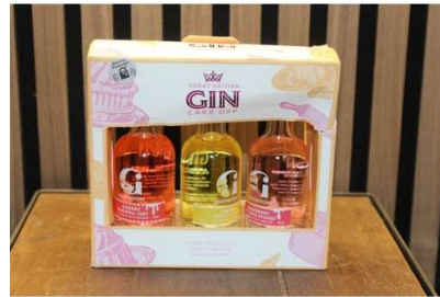
139. M - BOXED SETS 5CL GIN 3 x 5cl RRP £10 ( P20197828 / C )