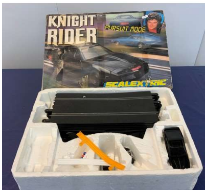
114. M - SMALL BOX OF SCALEXTRIC KNIGHT RIDER