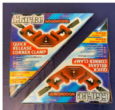
104. M - 2 X CLARKE WOODWORKER CORNER CLAMPS IN BOX - RRP £21 each