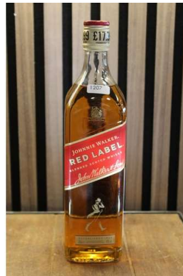
236. M - JOHNNIE WALKER RED LABEL WHISKEY 70cl RRP £23.50 ( P23138796 / C )