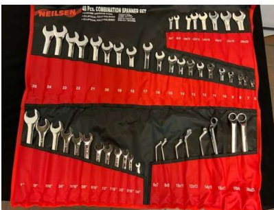
99. V - NEW NEILSON SPANNER SET 48PC SATIN FINISH CT0876