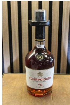
251. M - COURVOISIER VS COGNAC 700ml RRP £33 ( P23133789/C )