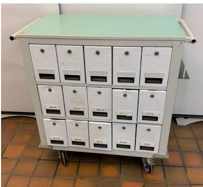
43. M - BRISTOL MAID MULTI STORAGE METAL CABINET ON WHEELS RRP £4622