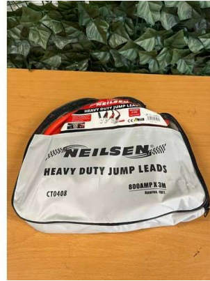
101. V - NEILSON 800 AMP HD JUMP LEADS 3M (CT0408)