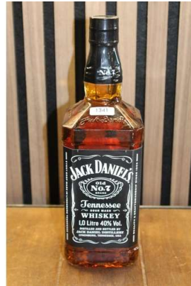
203. M - JACK DANIELS 1 Ltr RRP £35 ( P22049466 / C )