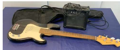
148. M - BENSON BASE GUITAR IN CASE WITH AMP BA10