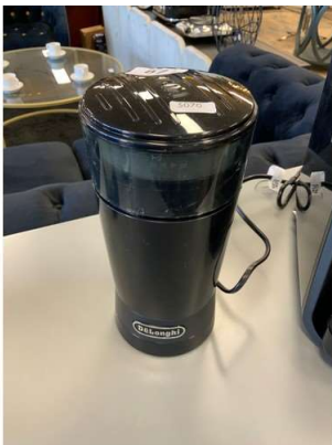
11. V - DELONGHI KG200-210 COFFEE GRINDER RRP £56.99