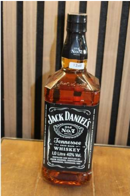
200. M - JACK DANIELS 1 Ltr RRP £35 ( P22049466 / C )