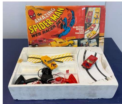
118. M - LARGE BOX OF SCALEXTRIC SPIDERMAN RACE SET