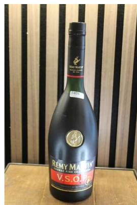
221. M - REMY MARTIN COGNAC 70cl RRP £46 ( P24182511 / C )