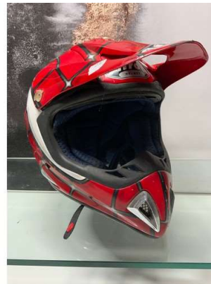
164. M - AIROH SPIDERMAN JUNIOR HELMET 250 SIZE SMALL - COST £179 WHEN NEW