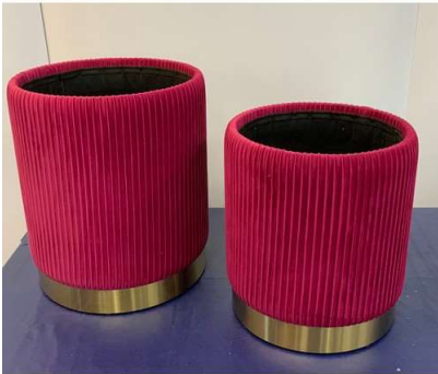
135. M - 2 X ORNATE VELVET PLANT STANDS