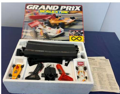
115. M - SMALL BOX OF SCALEXTRIC GRAND PRIX