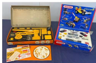
165. M - 2 X BOXES OF MECANO EVOLUTION 2 & CRANE SET