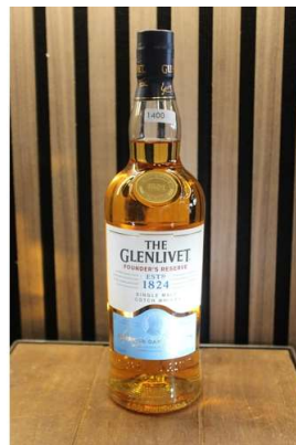
245. M - THE GLENLIVET SINGLE MALT WHISKEY 70cl RRP £27 ( P24182511/C )