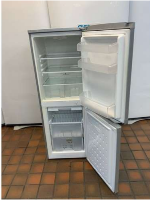
40. M - BEKO FROST FREE A CLASS FRIDGE FREEZER - COST NEW £339