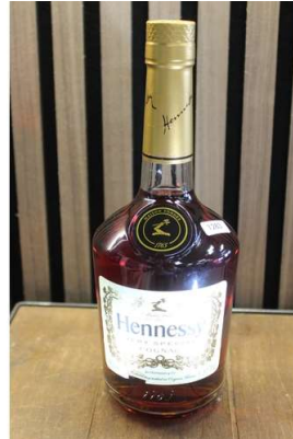
243. M - HENNESSY COGNAC 70cl RRP £37.50 ( P21218926/C )