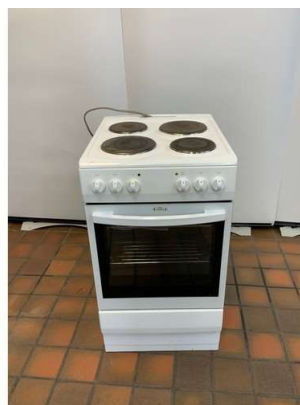
37. M - CURRYS ELECTRIC 4 RING SOLID PLATE COOKER MODEL CFSEWH14 - RRP £219