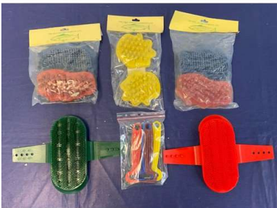
3. M - 1 X BAG NEW HORSE BRUSHES