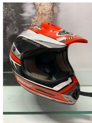
157. M - WULFSPORT AIR-5 MOTORCROSS JUNIOR HELMET - XS - COST WHEN NEW £59.99