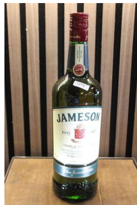
213. M - JAMESON WHISKY 1 Ltr RRP £33 ( P23208598 / C )