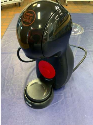
9. V - NESCAFÉ DOLCE GUSTO OICCOLO XS COFFEE MACHINE RRP £35