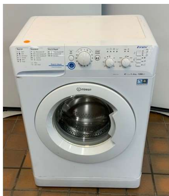
35. M - INDESIT 6KG-1200 WASHING MACHINE - COST NEW £259