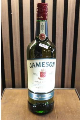
214. M - JAMESON 1LTR RRP £33 ( P23208616 / C )