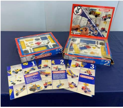
120. M - 2 x BOXES OF VINTAGE MECCANO