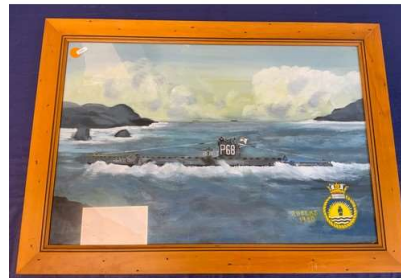
46. M - WATER COLOUR OF 'HMS VENTURER' - A SECOND WORLD WAR BRITISH SUBMARINE' IN FRAME