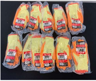
104A. V - 12 X CRINKLE LATEX COATED WORK GLOVE SIZE: 10" XL SINGLE (CT4970)