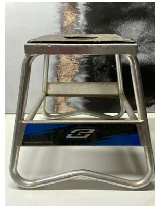
196. M - MOTORBIKE STAND - COST NEW £100