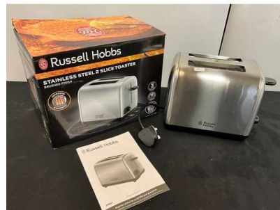
24. V - RUSSELL HOBBS STAINLESS STEEL 2 SLICE TOASTER RRP £24.99