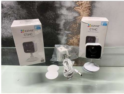
166. M - 2 X NEW IN BOX - EZVIZ C1HC SMART HOME CAMERA 1080P COST £25 EACH (P23045942/C)