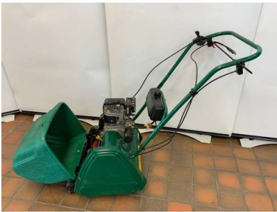
121. V - ATCO CYLINDER PETROL 14S PETROL LAWNMOWER SELF PROPELLED RRP £399