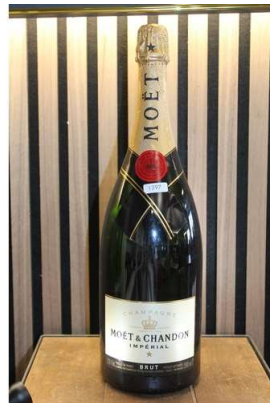
267. M - MOËT & CHANDON IMPERIAL CHAMPAGNE 1.5 Ltr RRP £92 ( P22154256 / C )