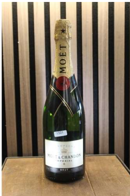
263. M - MOËT & CHANDON IMPERIAL CHAMPAGNE 750ml RRP £44 ( P23208607 / C )