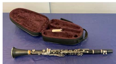
141. M - SONATA CLARINET IN CASE - ONLINE £90-£120