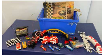
116. M - BOX OF ASSORTMENT SCALEXTRIC ACCESSORIES