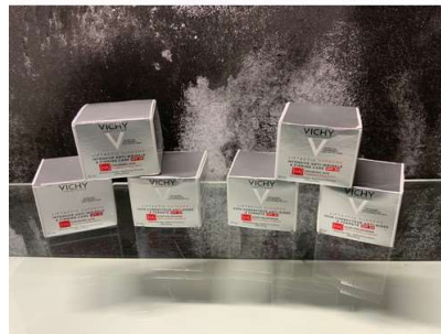
126. M - 6 X VICHY LIFTACTIV UPREME INTENSIVE ANTI-WRINKLE & FIRING CARE SPF 30 50 ML EXP 09/2024 RRP £34.99 (TOTAL £209.94) (P24021139/A)