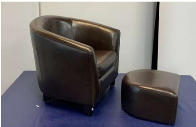
57. M - CHILDS TUB CHAIR & STOOL