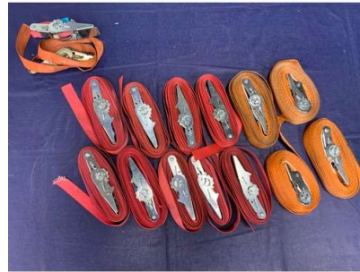
68. M - 13 X RATCHET STRAPS & 2 SPARE PARTS