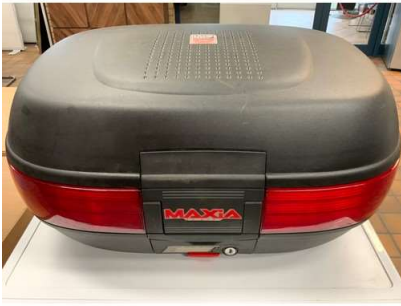
9. M - GIVI MAXIA TOP BOX - WITH KEY - COST WHEN NEW £330+