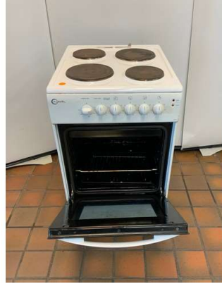
13. M - FLAVEL ELEC COOKER MODEL FSE50 RRP £199