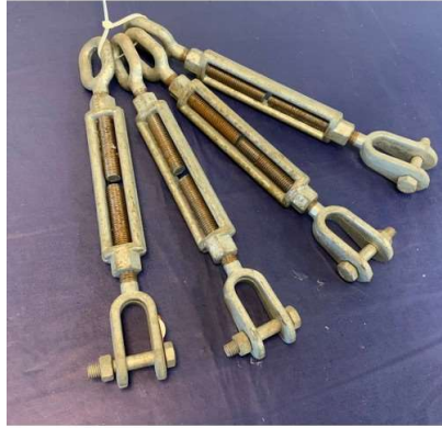
76. M - 4 SS TURN BUCKLES