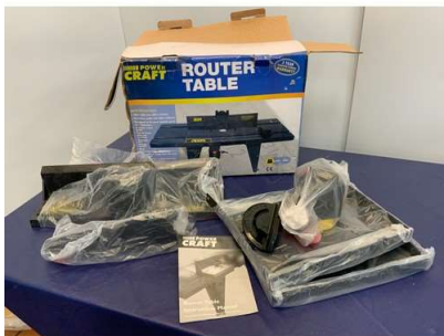
66. M - NEW POWERCRAFT ROUTER TABLE 450 X 335mm RRP £59