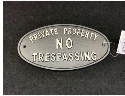
45. V - NEW CAST OVAL SIGN - NO TRESPASSING BLACK