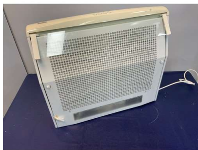
17. M - BOSCH DHU632PGB SLIMLINE CONVENTIONAL EXTRACTOR HOOD WHITE - COST NEW £94