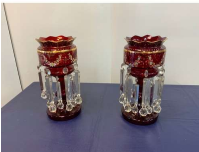
43. M - 2 DECORATIVE ANTIQUE ENGLISH VICTORIAN RUBY GLASS LUSTERS