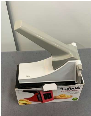
64. V - GEEDEL POTATO CUTTER RRP £23.99