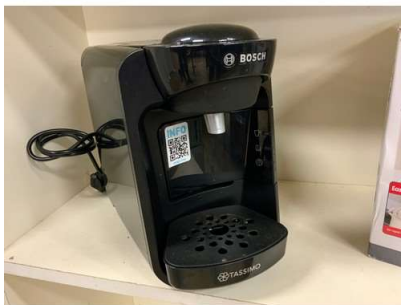
26. V - BOSCH TASSIMO BLACK EDITION DRINKS MAKER - RRP £39.99