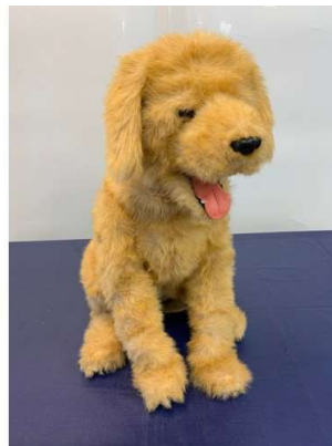
52A. M - HASBRO FURREAL 'BISCUIT' BATTERY OPERATED PLUSH DOG - COST NEW £139.99