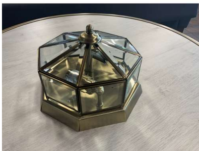
67. V - SEARCHLIGHT 2 LIGHT FLUSH CEILING LIGHT RRP £53.30