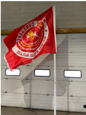
114. M - LIVERPOOL FLAG & FLAG POLE WITH BASE & ENGLAND FLAG