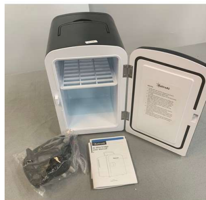
32. V - ASTRO AL 4L MINI FRIDGE MODEL LY0204A 240V