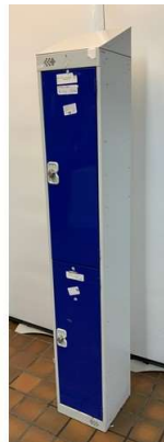
6. M - 2 CUPBOARD STEEL STAND ALONE LOCKER - COST £213 WHEN NEW