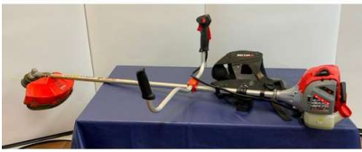
113. V - MITOX 430 PETROL BRUSH CUTTER WITH HARNESS - COST NEW £288