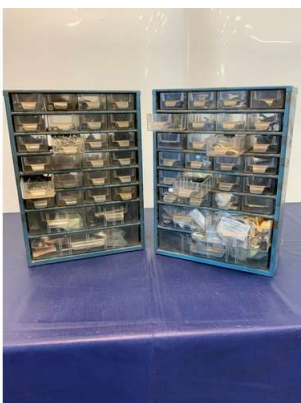
91. M - 2 X DRAW METAL UNITS INC SCREWS ETC