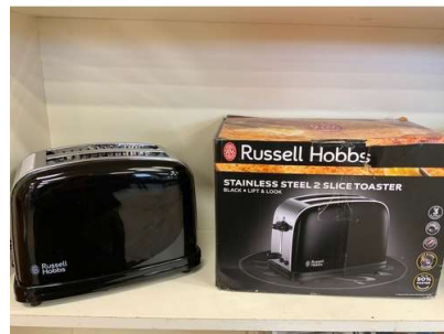
31. V - RUSSELL HOBBS S/S & BLACK 2 SLICE TOASTER IN BOX