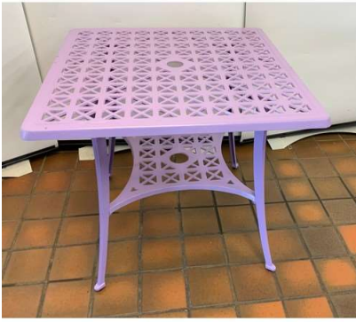
56. M - PURPLE SQUARE OUTDOOR TABLE