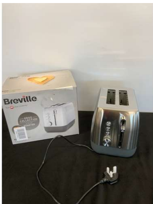
28. V - BREVILLE 2 SLICE TOASTER RRP £39.99