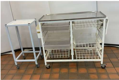
10. M - 2 X METAL TROLLEYS (1 WITH STORAGE DRAWERS)