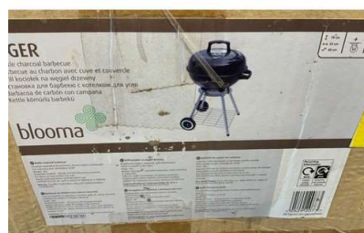
55. M - NEW IN BOX - EIGER KETTLE CHARCOAL BBQ