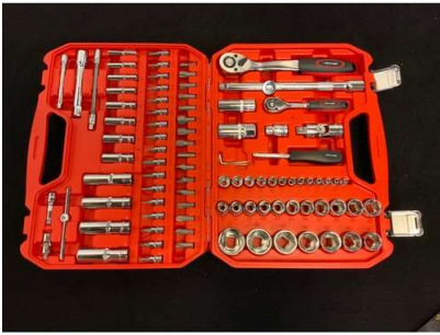
88. V - NEW NEILSON SOCKET SET - 94 PC - 1/4-1/2 INCH DRIVE & ACCESORIES CT0697