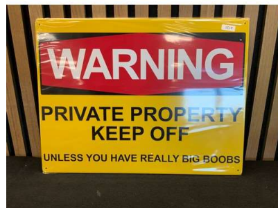
103. V - NEW - WARNING BIG BOOBS METAL SIGN - 30CM