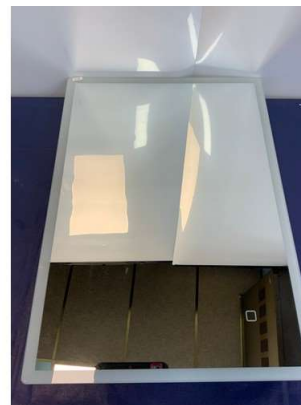
110. M - NEW HIB RECTANGULAR LED TOUCH SCREEN DEFOGGER MIRROR 300MM X 300MM - MODEL REC1-1212 - RRP £274