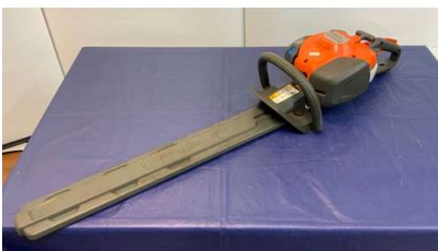
107. V - HUSQVARNA 122HD60 HEGDE TRIMMER - COST NEW £279.99