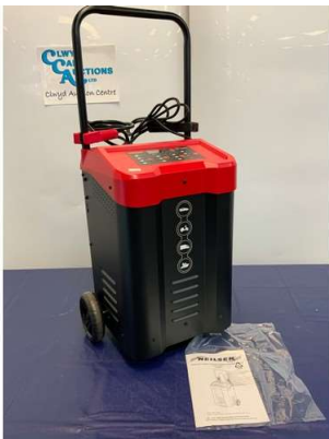
58. V - NEW NEILSON HEAVY DUTY SMART TROLLEY BATTERY CHARGER/STARTER 12/24V 200A