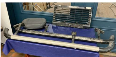
99. M - DEFENDER GRILL, SET OF SIDE STEPS -COST WHEN NEW £228-£360 & SEAT (P23142512 )