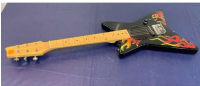
42. M - TOYS R US CHILDS ELEC / BATTERY GUITAR