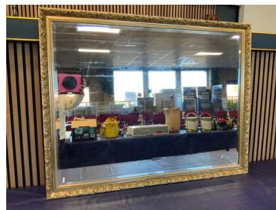
48. M - ORNATE LARGE GILT FRAME MIRROR