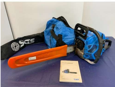
106. M - SGS PETROL CHAINSAW & BAG 20" 62CC