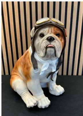
49. V - NEW BULLDOG PILOT 41CM - RRP £100