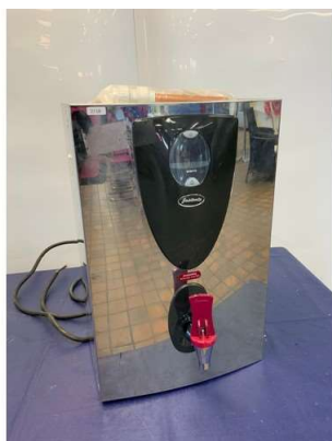
18. M - INSTANTA WM15 SS 15 LITRE WALL MOUNTED WATER BOILER - COST NEW £900+