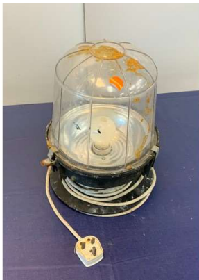
105. M - FERGIN MOTALA PORTABLE WORK LIGHT 240V