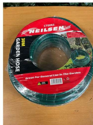
71. V - NEW NEILSON GARDEN HOSE 30 METRE