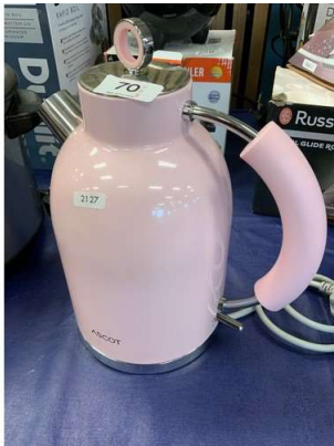
25. V - ASCOT CANDY PINK ELECTRIC KETTLE RRP £50