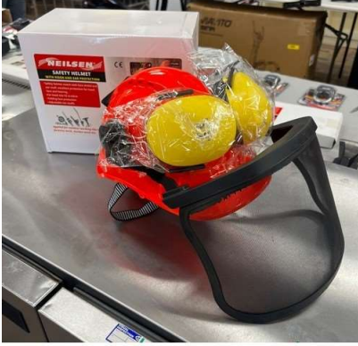
72. V - NEW NEILSON SAFETY HELMET WITH VISOR AND EAR PROTECTOR CT5290