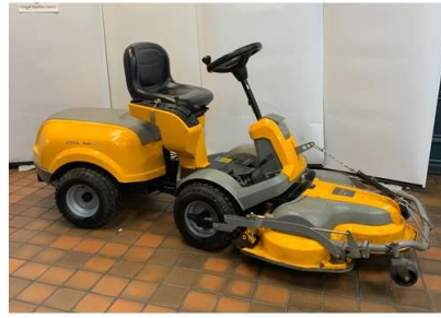
116. V - STIGA PARK 420 P FRONT DECK MOWER POWERED BY A BRIGGS & STRATTON ENGINE. 100CM CUTTING DECK RRP £2410