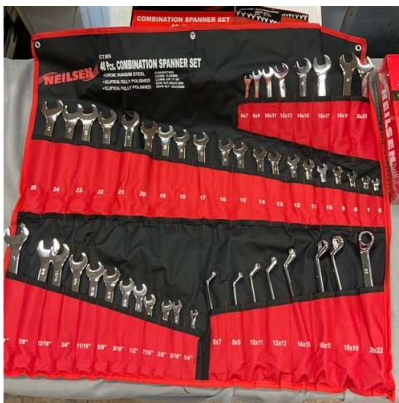
83. V - NEILSON SPANNER SET 48PC SATIN FINISH (CT0876)