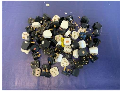
60. M - BOX OF 3 PIN PLUGS