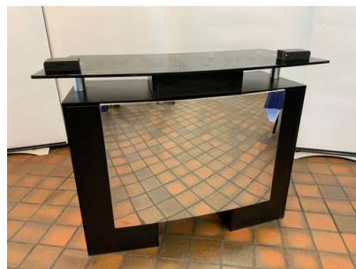
119. M - RECEPTION DESK / COUNTER COST NEW £500