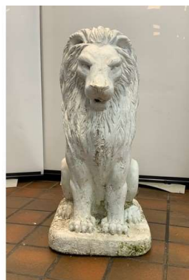
54. M - LION GARDEN STATUE