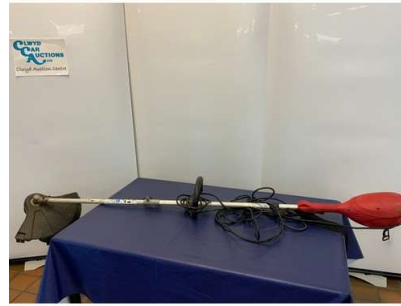
100. M - MANTIS HD ELEC STRIMMER - COST WHEN NEW £199