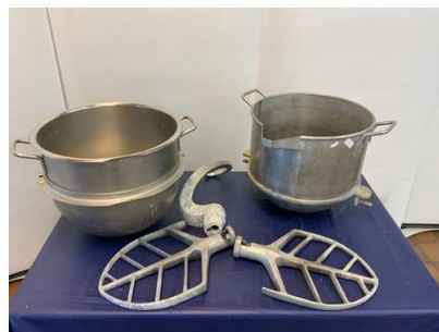
16. M - HOBART DOUGH MIXER, HOOK & BOWLS