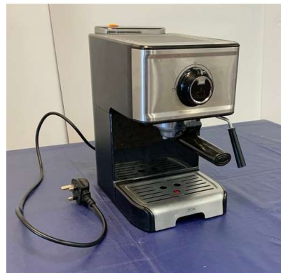
70. M - LOGIK EXPRESSO SS COFFEE MACHINE