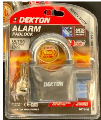
79. V - DECKTON HD ULTRA STRONG ALARM PADLOCK WITH 3 KEYS (DT70195)