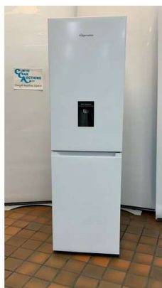
19. M - FRIDGEMASTER FRIDGE FREEZER MODEL MC55251DE - NO FROST MODEL WITH WATER DISPENSER RRP £379