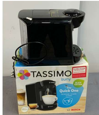
29. V - TASSIMO SUNY BOSCH IN BLACK 1300W RRP £61.49