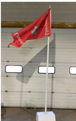
115. M - LIVERPOOL FLAG & FLAG POLE WITH BASE & JURGEN KLOPP FLAG