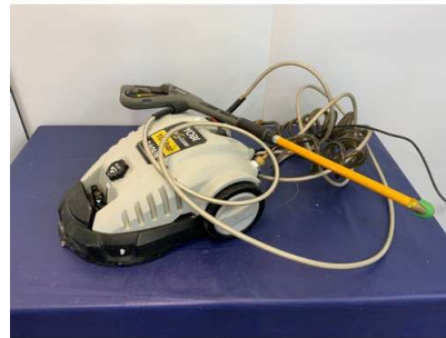
101. M - RYOBI DUAL 2 IN 1 CLEAN 105 BAR PRESSURE WASHER, FLOOR SCRUBBER & NOZZLE - MODEL RPW105DM