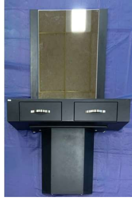
124. M - STYLING UNIT - 2 DRAWER MIRROR, TABLE & STAND - COST NEW £200