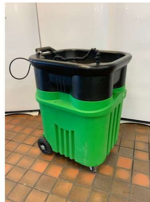
102. M - ROZONE ROWASHER MOBILE CLEANING UNIT MODEL 2082 - COST WHEN NEW £1530