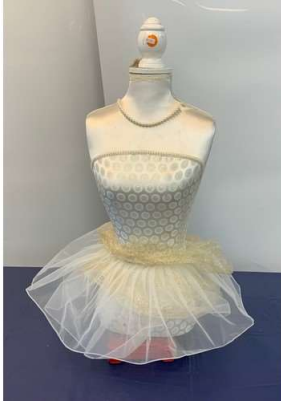
1. M - MANNEQUIN