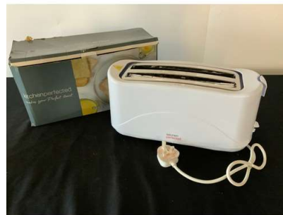
69. V - KITCHEN PERFECT 4 SLICE WHITE TOASTER RRP £20