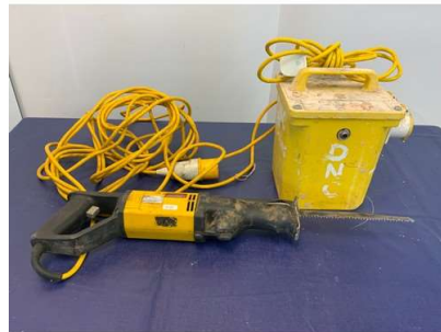
61. M - REMS 110V RECIPROCATING SAW 927680 - COST WHEN NEW £690 & TRANSFORMER