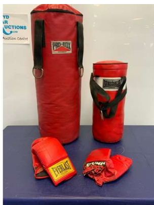
20. M - 2 X BOXING BAGS & 2 PAIRS OF BOXING GLOVES