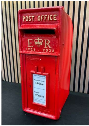
41. V - NEW ER 1926-2022 CAST POST BOX RED 57CM WITH KEY