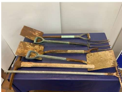
4. M - ASSORTMENT OF GARDEN TOOLS