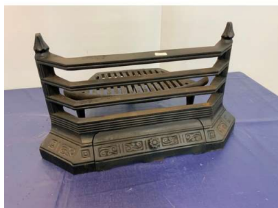
51. M - BLACK CAST FIRE GRATE