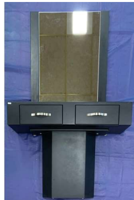
125. M - STYLING UNIT - 2 DRAWER MIRROR, TABLE & STAND - COST NEW £200