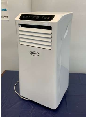
96. M - NEW BURFAM AIR CON PORTABLE UNIT - COOLING ONLY 240V - OL-BKY26-A011C2 RRP £335