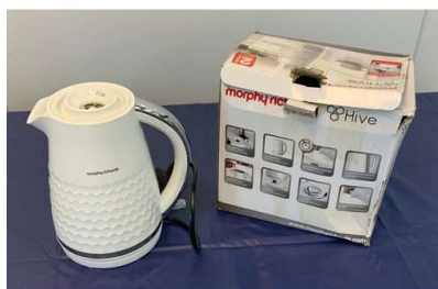
23. V - MORPHY RICHARDS 1.5 LITRE JUG KETTLE WHITE RRP £28.99