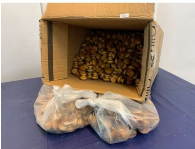
98. M - BOX OF APPROX 800-900 WOODEN KNOBS