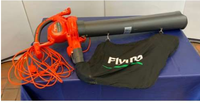
104. M - FLYMO ELECTRIC POWER VAC LEAF BLOWER & VAC 3000V - COST NEW £79