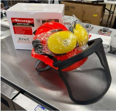
73. V - NEW NEILSON SAFETY HELMET WITH VISOR AND EAR PROTECTOR CT5290