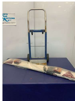
95. M - TRAILER LIGHTING BOARD & SMALL SACK TROLLEY