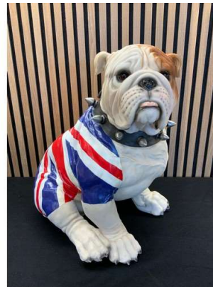
46. V - NEW EXTRA LARGE SITTING BULLDOG UNION JACK 55CM - RRP £300