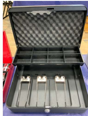
118. M - BLACK CASH TIN