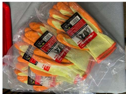
63. V - PACK OF 4 CRINKLE LATEX COATED WORK GLOVE SIZE 10" XL