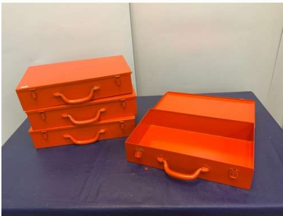
81. M - 4X ORANGE STORAGE BOXES