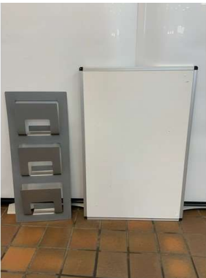
97. M - MAGAZINE STAND & NOTICE BOARD