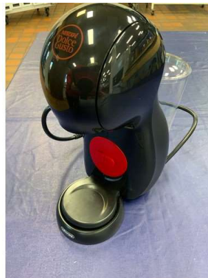
30. V - NESCAFÉ DOLCE GUSTO PICCOLO XS COFFEE MACHINE RRP £35