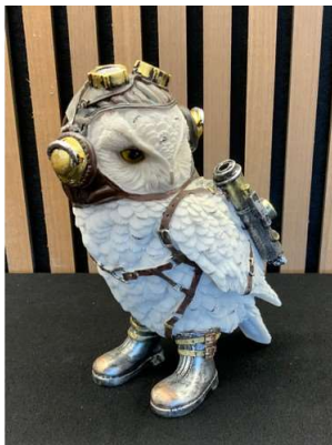
50. V - NEW STEAMPUNK OWL ROCKET- 21CM - RRP £30