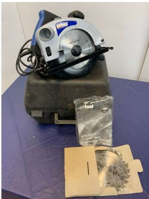
89. M - NU TOOL CIRCULAR SAW NPK185-2