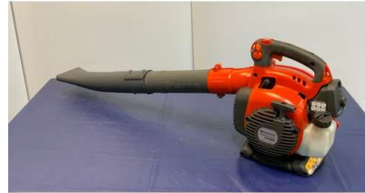
108. V - HUSQVARNA 125BV PETROL LEAF BLOWER - COST NEW £299.99