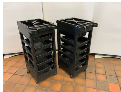
147. M - 2 X HAIRDRESSING EQUIPMENT TROLLEYS - COST £40 EACH