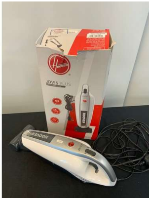
65. V - HOOVER JOVIS PLUS POWER CORDED VAC RRP £60