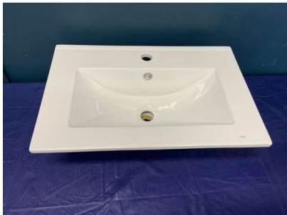
3. V - NEW MINIMALIST BASIN W600 X H390 X D190 - RRP £165