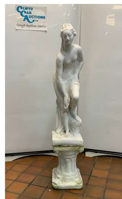
53. M - ORNATE LADY GARDEN STATUE