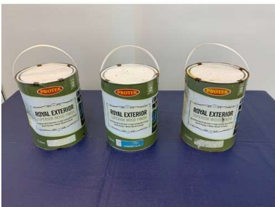
59. M - 3 X TINS PROTEK ROYAL EXTERIOR SUPERIOR WOOD FINISH - SUMMERSET BLUE RRP £44.95 EACH