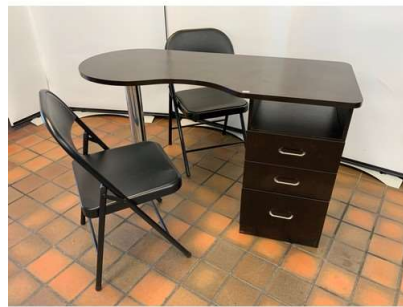
117. M - NAIL BAR WITH 4 DRAWERS & FOLDING CHAIR - COST NEW £250