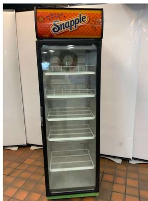
21. M - TALL GLASS FRONTED DISPLAY FRIDGE