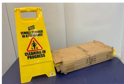
22. M - ROBERT SCOTT BOX OF 5 'CLEANING IN PROGRESS' SIGNS RRP £9.24 EACH