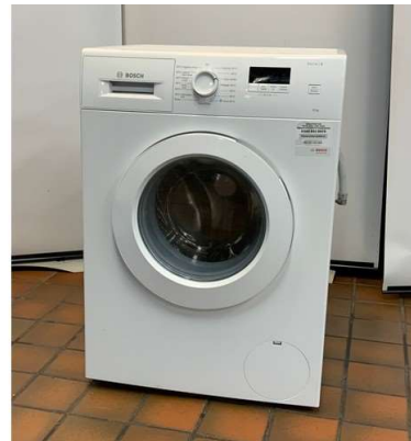
15. M - BOSCH SERIES 2 8KG WASHING MACHINE RRP £429