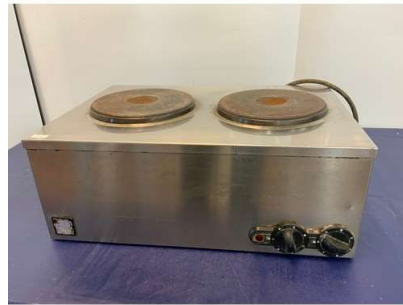
14. M - PARRY SS DOUBLE RING HOT PLATE MODEL CHU2 - COST WHEN NEW APPROX £300