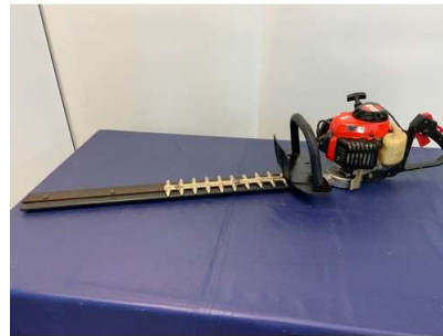
109. M - IBEA KATANA MHT2075D HEAVY DUTY PETROL HEDGE TRIMMER - COST NEW APPROX £400