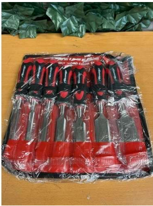
74. V - NEW NEILSON WOOD CHISEL SET 7PC