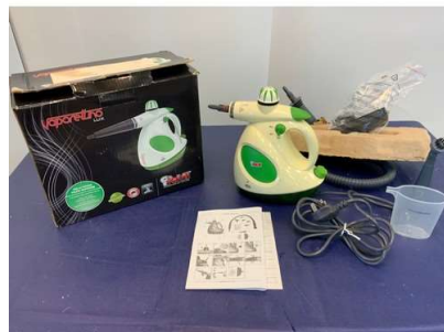
62. M - VAPORETTINO LUX HAND HELD STEAMER