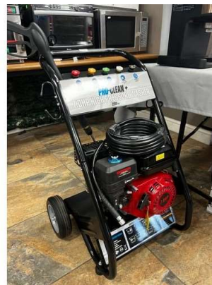
94. V - NEW PRO CLEAN+ 7.0HP HIGH PERFORMANCE PETROL PRESSURE WASHER (CT1757) OIL NEEDED