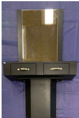
126. M - STYLING UNIT - 2 DRAWER MIRROR, TABLE & STAND - COST NEW £200