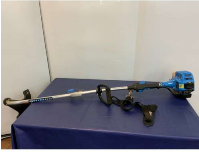
112. M - SGS PETROL STRIMMER - 62CC