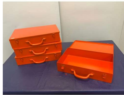
84. M - 4X ORANGE STORAGE BOXES