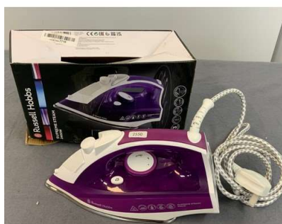
24. V - RUSSELL HOBBS SUPREME STEAM IRON 2400W RRP £17.99