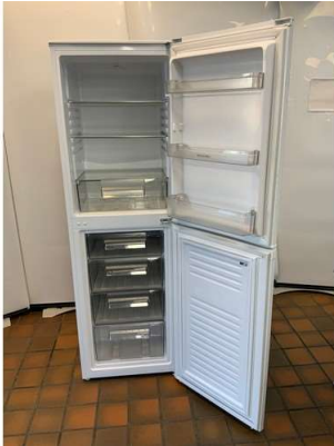
2. M - MONTPELLIER FRIDGE FREEZER MODEL MS175W - RRP £345