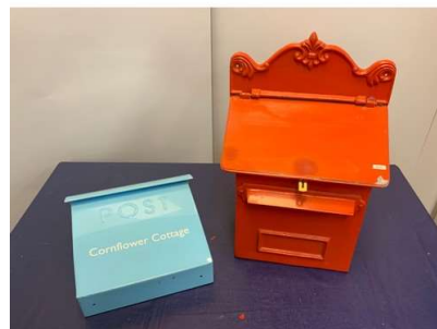
111. M - 2 X ORNATE POST BOXES