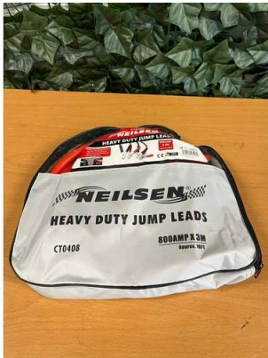
80. V - NEILSON 800 AMP HD JUMP LEADS 3M (CT0408)