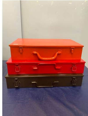
77. M - 3X METAL STORAGE BOXES