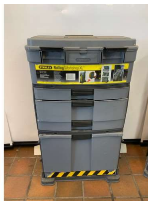
72. M - STANLEY TOOL TROLLEY RRP NEWER VERSION £160