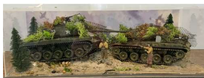
83. M - TWO BULLDOG TANKS - US - WITH CREW IN DISPLAY CASE