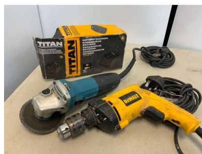
51. M - MAKITA M14 GA4530R GRINDER RRP £51.99, 240V DEWALT DRILL D21710 RRP APPROX NEW £237 & TITAN 18V BATTERY CHARGER RRP £19.99