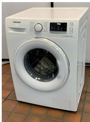
22. M - SAMSUNG 7KG ECOBUBBLE WASHING MACHINE - COST NEW £299