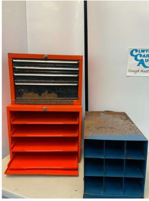
7. M - 2 X METAL TOOL CABINETS & BLUE WELD ROD CONTAINER