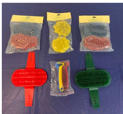
99. M - 1 X BAG NEW HORSE BRUSHES