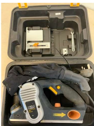
50. M - MACALLISTER 240V 3 BLADE PLANER RRP £45