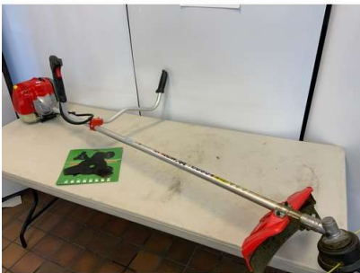
123. M - MITOX SELECT 43U PETROL BRUSH CUTTER - COST NEW £319