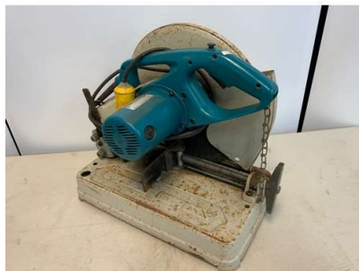
63. M - 110V MAKITA 2414B METAL SAW RRP £199.99