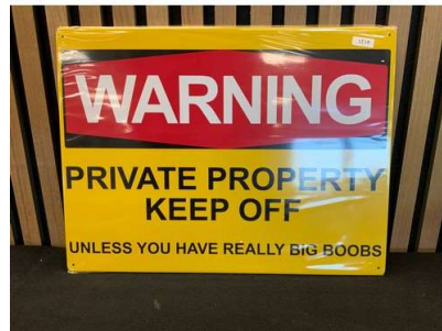
79. V - NEW - WARNING BIG BOOBS METAL SIGN - 30CM