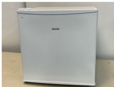
21. M - ABODE TABLE TOP / CARAVAN FREEZER MODEL ATTFZ1 - COST NEW £90