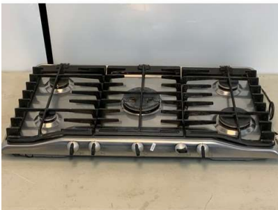
76. M - ZANUSSI 5 RING GAS HOB A7702/046CE 35" x 20" COST WHEN NEW APPROX £400