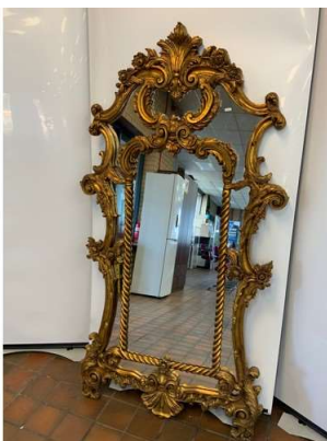
116. M - ORNATE GILT FRAMED MIRROR