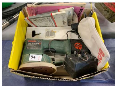
54. M - BOSCH PEX MULTI SANDER IN BOX - COST NEW £124