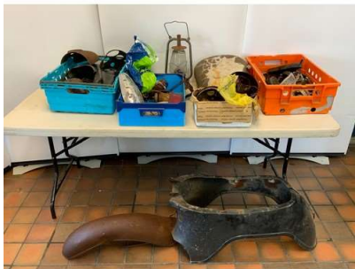
9. M - 4 X BOXES OF ASS MOTORCYCLE PARTS