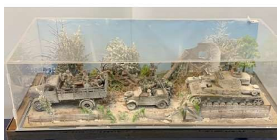
86. M - PANZER KAMPFWAFGEN IV SOLDIERS, MOTORBIKE & TANK IN DISPLAY CASE