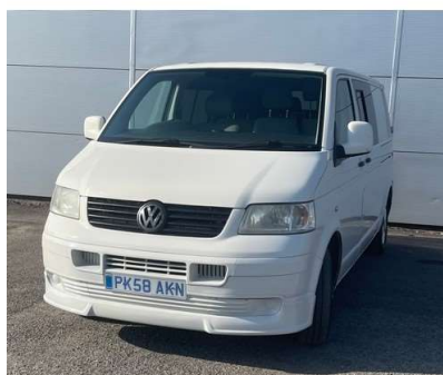
146. M - 2008 VW TRANSPORTER T30 102 LWB TDI VAN - 1896cc - DIESEL - REG NO 'PK58AKN' 209K MILES. MOT 23.01.26. 2 OWNERS FROM NEW. EXTENSIVE HISTORY.