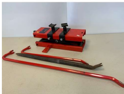
64. M - MOTORCYCLE JACK RRP £34 & 3 CROW BARS