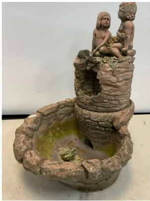
39. M - BOY & GIRL GARDEN WATER FEATURE