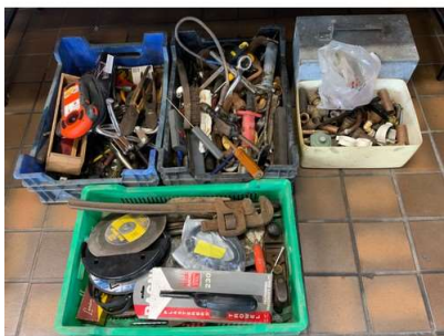
2A. M - 5 SUNDRY BOXES OF TOOLS