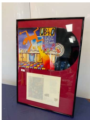
92. M - SIGNED PROGRAMME UB40 BY ROBIN CAMPBELL WITH LP