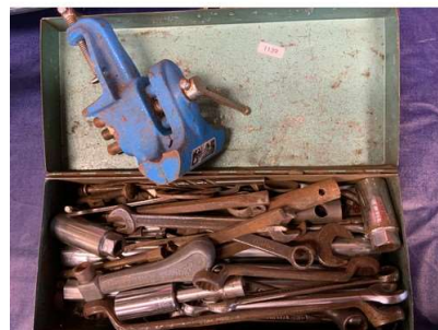
6. M - DRAPER TABLE TOP VICE & BOX OF MIXED TOOLS - SPANNERS - SOCKETS ETC