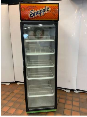
23. M - NORCOOL - S75L TALL GLASS FRONTED DISPLAY BOTTLE FRIDGE