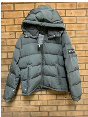
97. M - NVLT PADDED COAT SIZE LARGE - NEW WITH TAGS