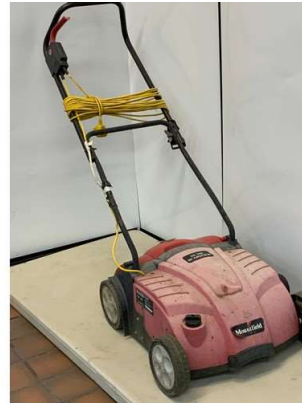
12. M - MOUNTFIELD ELEC SCARIFIER SE 350