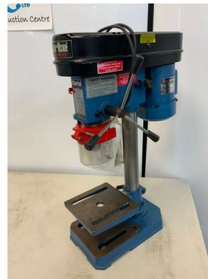
118. M - CLARKE CDP5DD 240V BENCH MOUNTED DRILL PRESS