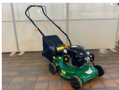
68. V - FPLP99 PETROL LAWN MOWER - COST NEW £145