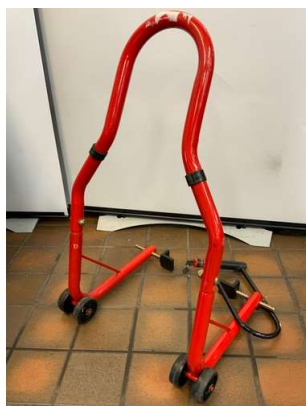
71. M - BIKE STAND & BIKE LOCK - RRP £50