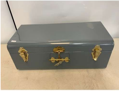
113. M - STEEL TOOL BOX