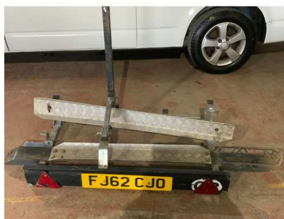
144. M - CAR MOTORCYCLE / BIKE CARRIER