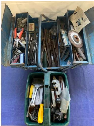
1A. M - TOOLBOX OF TOOLS & CARRY BOX WITH TOOLS