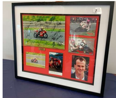
78. M - STEVE HISLOP ONE OFF SIGNED BY BRITISH BIKE RIDERS NAMED ON BACK. SIGNED PHOTO STEVE HISLOP OULTON PARK 2003