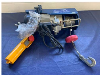
54A. M - NU POWER - MODEL MNWH1000 240V ELECTRIC WINCH HOIST