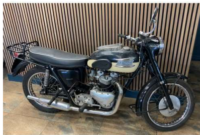
130. M - 1960'S TRIUMPH TIGER T110 MOTORCYCLE 500cc REG NO' MVS 501'