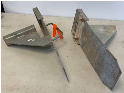
126A. V - 2 X STRONG BOY LINTEL SUPPORTS