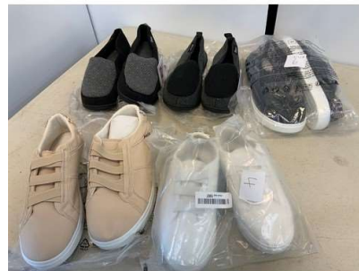
5. M - BOX - 5 PAIRS ASS SHOES