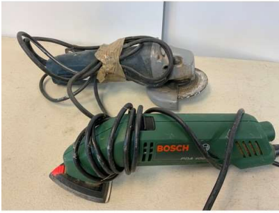
121. M - MAKITA GRINDER & BOSCH PDA 100 SANDER