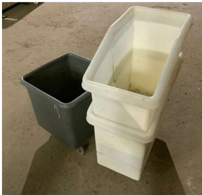
132. M - 3 WHEELED STORAGE TUBS