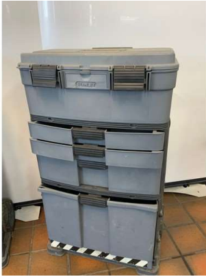
73. M - STANLEY TOOL TROLLEY RRP NEWER VERSION £160