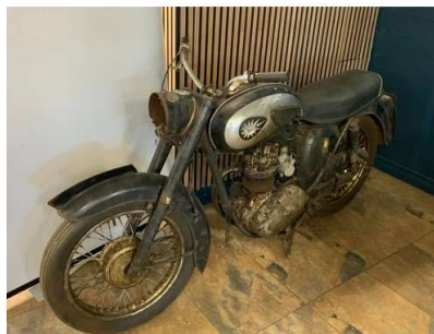
129. M - 1960'S BSA C15 SINGLE 250cc MOTORCYCLE - FRAME NUMBER C15.49888 ORIGINAL REG NUMBER WAS 'EAA 252'