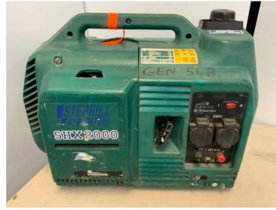
117. V - STEPHILL SHX2000 1.7KVA SILENT PETROL SUITCASE GENERATOR - COST NEW £700