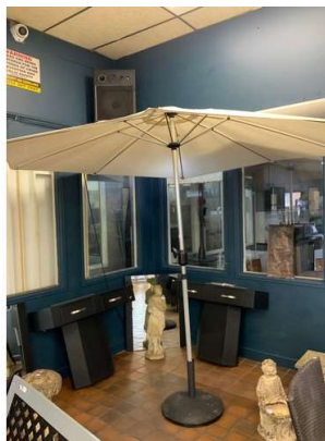
44. M - GARDEN PARASOL AND STAND