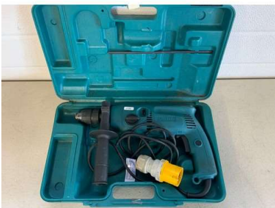
123A. V - 110V MAKITA DRILL IN BOX - MODEL HP2041 - COST NEW £110