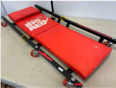
74. M - TORIN BIG RED MECHANICS TROLLEY RRP £70