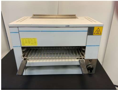
24. V - GAVINOX GRILL MODEL SG608