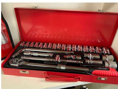
108. V - NEW NEILSON SOCKET SET - 26PC 1/2 IN DRIVE WITH EXT RATCHET