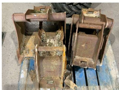
142. M - SET OF 4 TAKEUCHI DIGGER BUCKETS - 3 TONNER