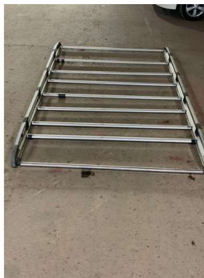
136. M - LARGE ALU ROOF RACK