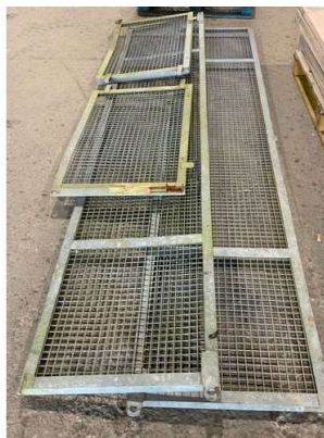
139. M - TRANSIT VAN MESH EXTENSION SIDES