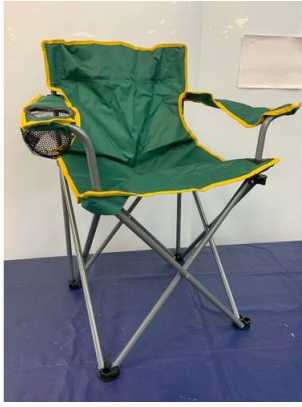
31. M - TESCO GREEN FOLDING CAMPING CHAIR IN BAG RRP £13.25 ( P23078825 / C )