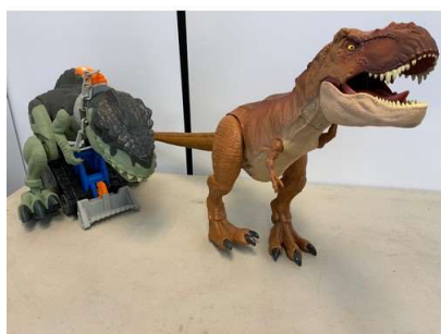
90. M - 2 X MODEL DINOSAUR TOYS