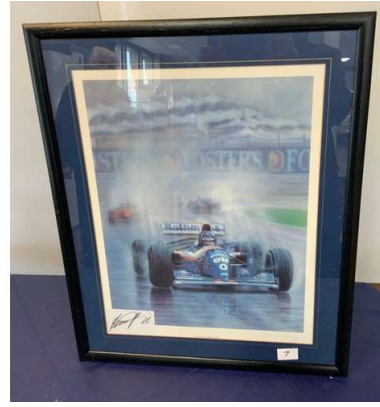
77. M - DAMON HILL SIGNED CARD WITH POSTER - OULTON PARK