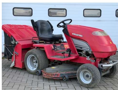
145. M - COUNTAX A20-50 RIDE ON LAWN MOWER WITH COLLECTION BOX 50" HIGH GRASS CUTTING DECK