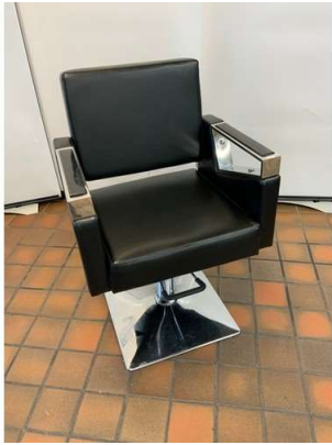
32. M - RISE & FALL BLACK & CHROME SALON CHAIR - COST NEW £350