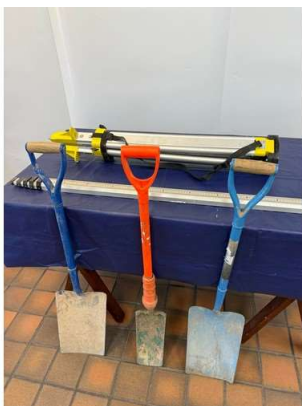
128. M - LEICA CT150 TRIPOD RRP £ 85, 5 METRE CONSTRUCTION STAFF RRP £46, BULLDOG INSULATED SHOVEL RRP £40 & TWO BLUE SHOVELS APPROX £20 EACH - TOTAL RRP £211 ( P24205675 / C )