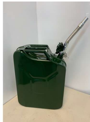
110. M - GREEN METAL JERRY CAN WITH METAL FUNNEL -COTS NEW £35.99