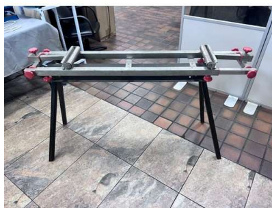
96. M - MITRE SAW STAND - ONLINE PRICE £100+