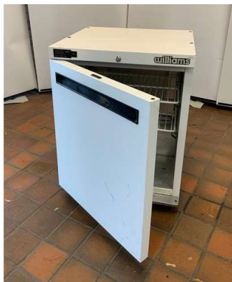
18. V - WILLIAMS UNDER COUNTER FRIDGE MODEL HA135WA RRP £1129