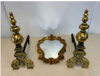
115. M - ORNATE GILT FRAMED MIRROR & PAIR BRASS FIRE DOGS