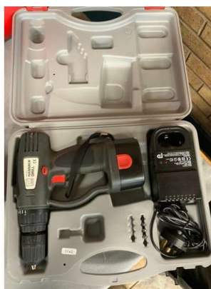
104. M - 14.4V CORDLESS HAMMER DRILL IN BOX