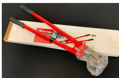
102. V - NEILSON 30" RED BOLT CUTTER (CT0297)