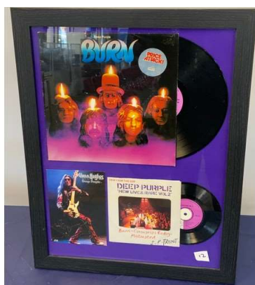
91. M - DEEP PURPLE SIGNED PHOTO WITH LP & SINGLE