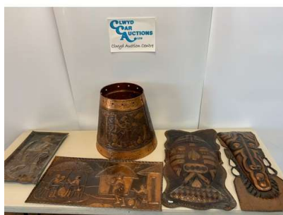
45. M - 4 X HAMMERED COPPER AFRICAN PLAQUES & BRASS LAMP SHADE