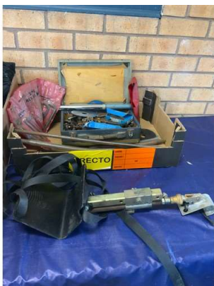
2. M - S BOX TOOLS & ENGINEERING TOOLS