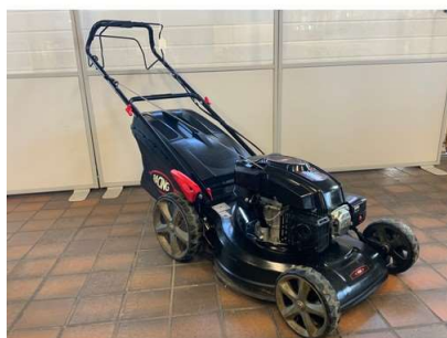
66. V - RACING SELF PROPELLED THERMAL PETROL LAWN MOWER 173cm MODEL RAC5175SPM RRP £230