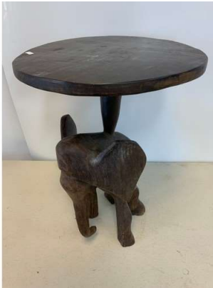
114. M - CARVED ELEPHANT PLANT TABLE