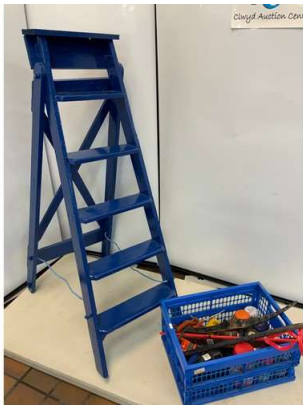
1. M - SUNDRY BOX OF TOOLS & WOODEN LADDER