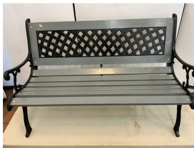
43. M - CAST GARDEN BENCH