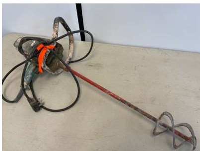
127. V - MAKITA 240V PADDLE MIXER MODEL UT121