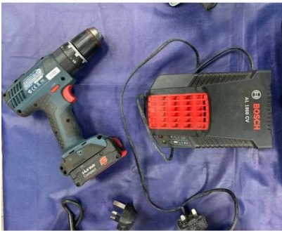
122. M - BOSCH CORDLESS DRILL 14.4V