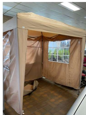
14. V - 2M X 2M POP UP GAZEEBO WITH SIDES IN BAG RRP £269