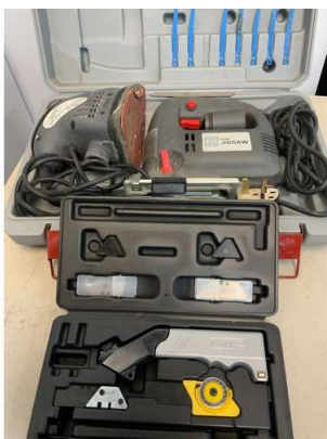
61. M - PRO JIG SAW, SANDER SET & WORK KNIFE