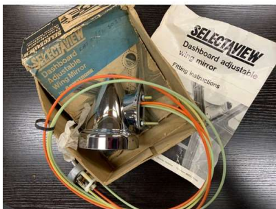
10. M - VINTAGE SELECTAVIEW DASHBOARD ADJUSTABLE WING MIRROR BY ARMSTRONG