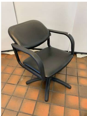
47. M - HAIR DRESSING BACK WASH CHAIR