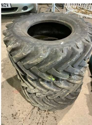
143. M - 3 TONNE DUMPER TYRES