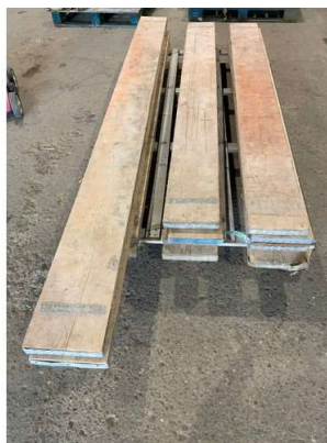
138. V - 13 X 8FT SCAFFOLD BOARDS