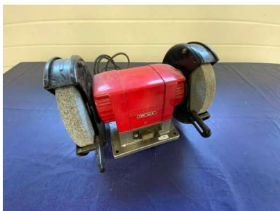
59A. M - PARKSIDE DOUBLE BENCH GRINDER 200W - RRP £79