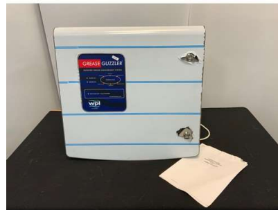
119. V - NEW GREASE GUZZLER MODEL WPI DD-620-041 RRP £1675