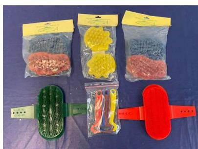
98. M - 1 X BAG NEW HORSE BRUSHES