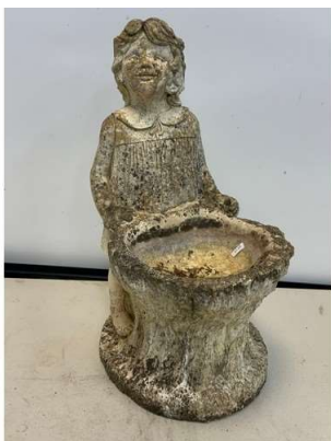
41. M - GARDEN GIRL BIRD BATH