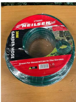
100. V - NEW NEILSON GARDEN HOSE 30 METRE