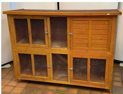
17. M - TWO STOREY RABBIT / GUINEA PIG WOODEN HUTCH - COST NEW £240