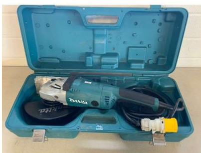
127A. V - 110V MAKITA 9" GRINDER IN BOX - MODEL GA9020S