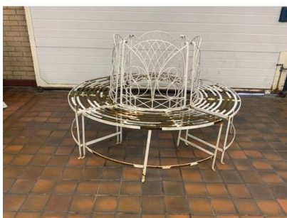
135. M - CIRCULAR TREE GARDEN BENCH