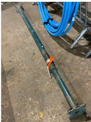
133. V - ACROW PROP