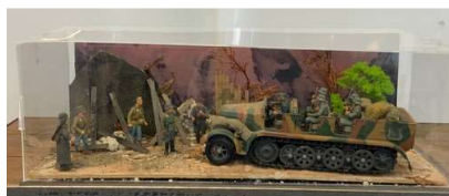
81. M - GERMANY SEMI 8 TONNER.SD.KFZ WITH SOLDIERS IN DISPLAY CASE