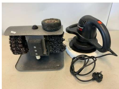
55. M - CREME SHOE SHINE MACHINE - COST NEW £120 & CAR BUFFER