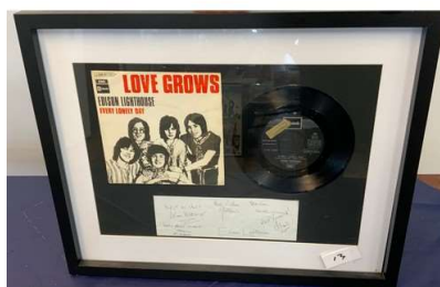
87. M - SIGNED EDISON LIGHTHOUSE WITH THEIR NUMBER ONE SINGLE SIGNED AT WARNER HOTEL HARROGATE