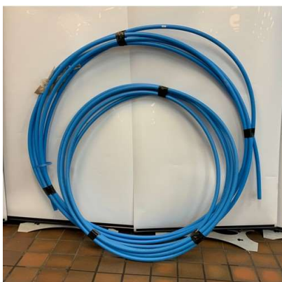
134. V - 2 X PART ROLLS OF MDPE BLUE 25MM PIPE