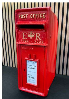
88. V - NEW ER 1926-2022 CAST POST BOX RED 57CM WITH KEY