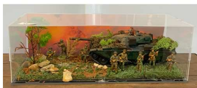
84. M - BRITISH CHIEFTAIN TANK MK5 WITH SOLDIERS IN DISPLAY CASE