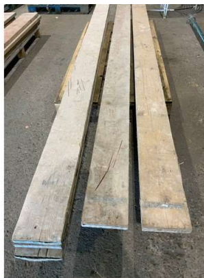
137. V - 7 X 12FT SCAFFOLD BOARDS