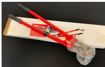
101. V - NEILSON 30" RED BOLT CUTTER (CT0297)