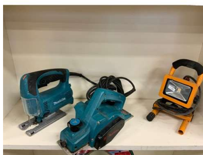
103. M - MAKITA JIGSAW - 240V & 240VLED WORK LIGHT & MAKITA PLANER