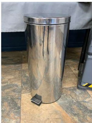
26. M - SS BIN