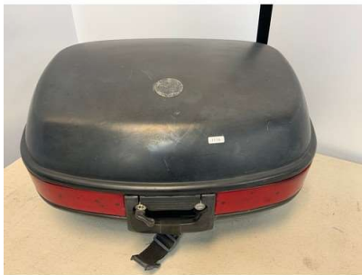
8. M - MOTORCYCLE BACK BOX & ELECTRIC TRUNKING