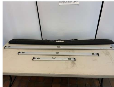
125. M - SET OF 3 MACALLISTER SPIRIT LEVELS