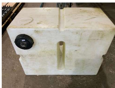
131. M - WATER STORAGE TANK