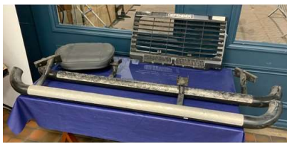
15. M - DEFENDER GRILL, SET OF SIDE STEPS -COST WHEN NEW £228-£360 & SEAT (P23142512 )