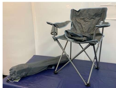
30. M - 2 X TESCO FOLDING CAMPING CHAIRS IN BAG (GREY) TOTAL RRP £26.50 ( P23078825 / C )