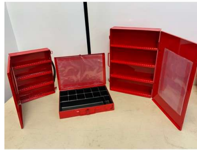
109. M - 3 X RED METAL STORAGE BOXES ( 2 X SMALL & 1 X LARGE)