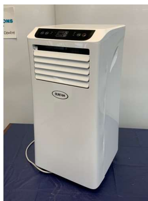
48. M - NEW BURFAM AIR CON PORTABLE UNIT - COOLING ONLY 240V - OL-BKY26-A011C2 RRP £335