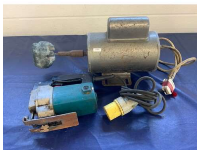
57A. M - 110V JIGSAW & ELECTRIC BUFFER