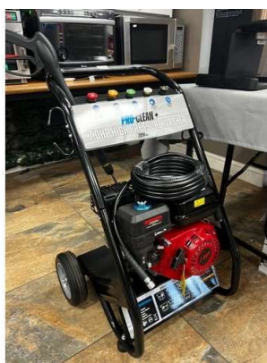
95. V - NEW PRO CLEAN+ 7.0HP HIGH PERFORMANCE PETROL PRESSURE WASHER (CT1757) OIL NEEDED