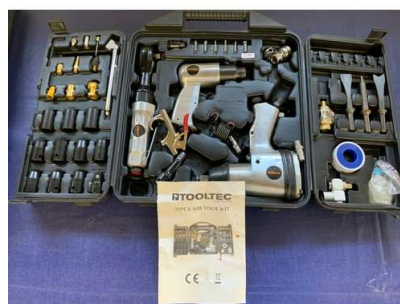
52A. M - TOOLTEC 50 PCS AIR TOOL KIT