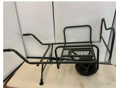
13. M - SINGLE WHEELED FISHING BARROW RRP APPROX £80