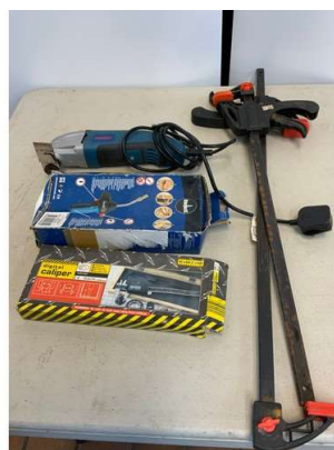
58. M - PR CLAMPS, CALIPER, BLOW TORCH & FERREX MULTIFUNCTION TOOL TD9511