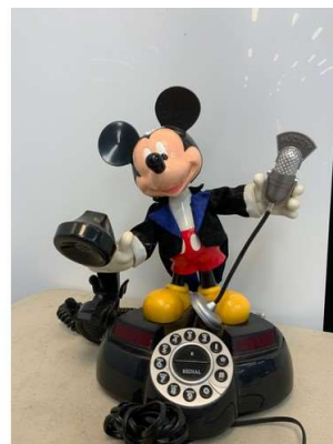
80. M - VINTAGE MICKEY MOUSE PUSH BUTTON TELEPHONE