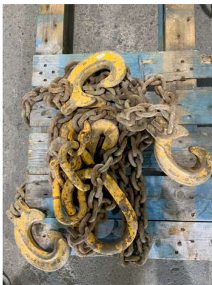
140. M - HEAVY DUTY CHAIN - 3 LEG