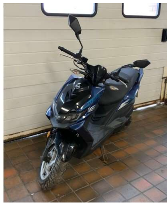
128A. M - 2022 SYM JET 4 RX 125 e5 125cc MOTORCYCLE 9891 MILES WARRANTED. 2 KEYS. WITH V5.