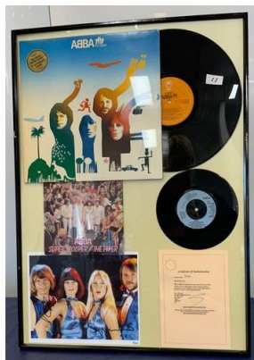
93. M - SIGNED ABBA PHOTO WITH COA & LP