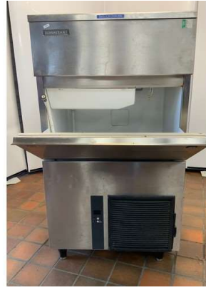
27. V - HOSHIZAKI ICE MAKER MODEL IM-100NE - RRP £2634