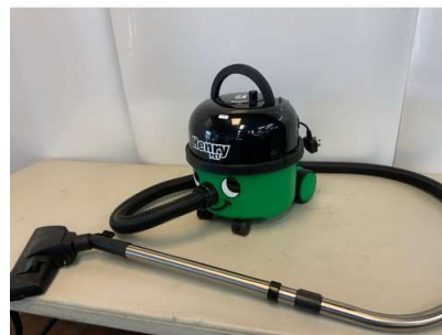
120. M - HENRY PET HOOVER - COST WHEN NEW £179