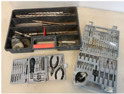
59. M - 2 BOXES OF DRILL BITS & TOOL KIT