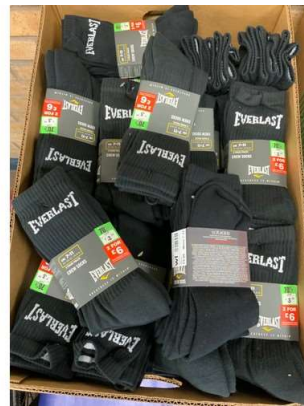
4. M - BOX OF NEW EVERLAST SOCKS APPROX 96 PAIRS