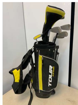
112. M - JUNIOR DUNLOP GOLF CLUBS IN BAG