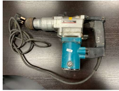
124. M - MAKITA SDS HAMMER DRILL 900min- 240V