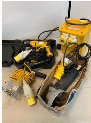
62. M - 110V TRANSFORMER, BOSCH GWS 660 110V GRINDER RRP £59.99, DEWALT DWD024-LX 110V DRILL RRP £109.79 & 110V WORK LIGHT