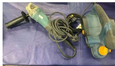
126. M - MAKITA ANGLE GRINDER & POWER CRAFT ELEC PLANER