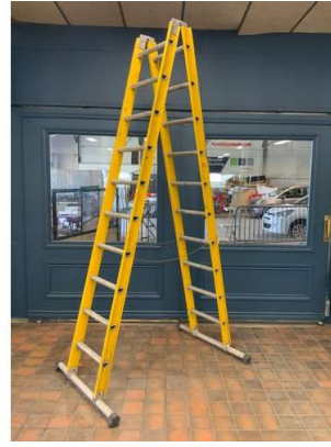
11. M - GRP FIBREGLASS 10 TREAD STEP LADDER