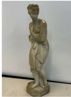
37. M - GARDEN STATUE - BOUDICA