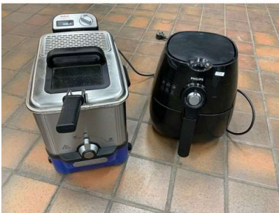
75. M - TEFAL DEEP FAT FRYER & PHILIPS AIR FRYER