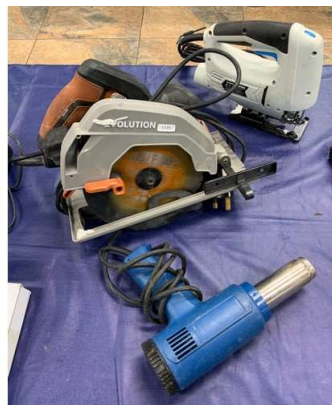
56. M - EVOLUTION R185 MULTI-MATERIAL CUTTING SAW 1200W RRP £59.99, MACALLISTER MSJS600 JIG SAW RRP £27 & HEAT GUN