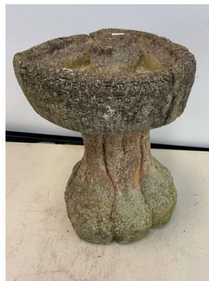
38. M - GARDEN BIRD BATH