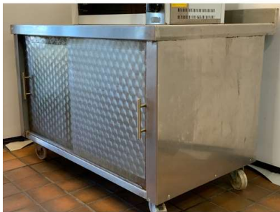
25. V - S/S CATERING 2 DOOR CUPBOARDS ON WHEELS 2ft 7" x 4ft