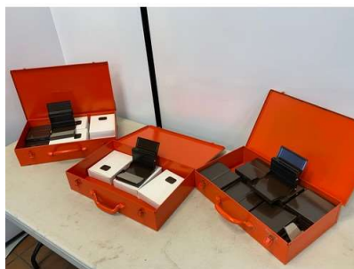
57. M - ASS DRILL BIT BOXES & 3 ORANGE METAL STORAGE BOXES