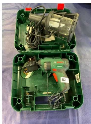
52. M - 9V BOSCH PR SELECT CORLDESS SCREWDRIVER RRP £50 & 240V WORK LIGHT