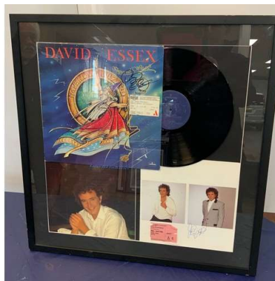
94. M - DAVID ESSEX SIGNED PROGRAMME & LP COVER WITH TICKET STUBBS