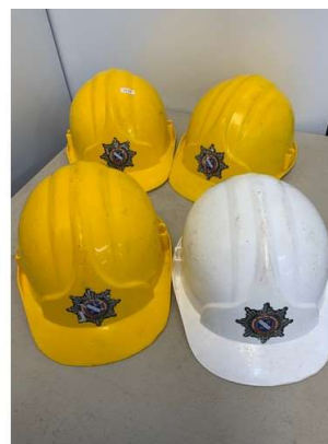
111. M - 4 X CHILDS HARD HATS