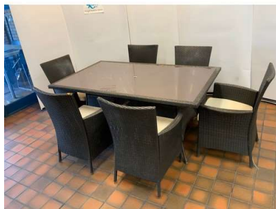
46. M - RATTEN GARDEN TABLE & 6 CHAIRS