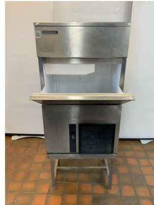
28. V - HOSHIZAKI ICE MAKER MODEL 1M-100NE RRP £2732