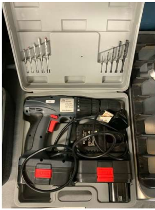
105. M - 24V CORLESS HAMMER DRILL IN BOX