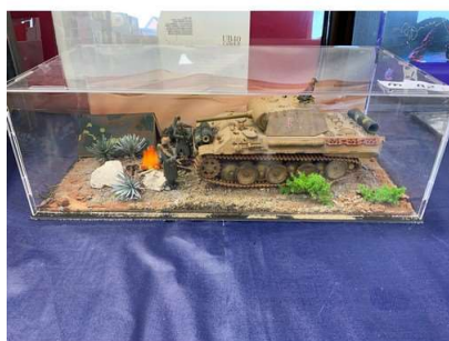
82. M - PANTHER AFRIKAKORPS TANK WITH SOLDIERS & TENT IN DISPLAY CASE