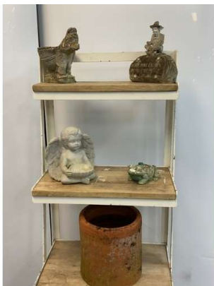
40. M - 4 GARDEN FIGURES & CHIMNEY POT