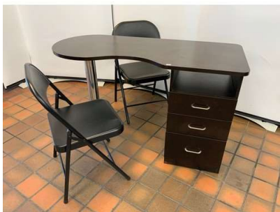
34. M - NAIL BAR WITH 4 DRAWERS & FOLDING CHAIR - COST NEW £250