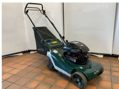
67. V - HAYTER SPIRIT 41 SELF PROPELLED MOWER WITH BRIGGS & STRATTON ENGINE - ONLINE RRP £800- £1000