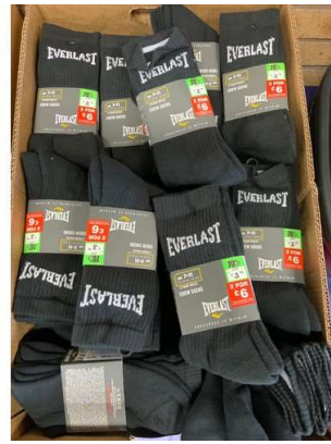
3. M - BOX OF NEW EVERLAST SOCKS APPROX 96 PAIRS