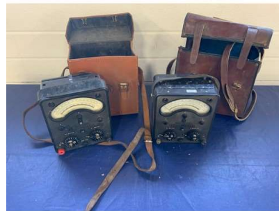
125A. M - 2 UNIVERSAL AVO METERS IN CASES