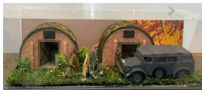
85. M - TWO HUTS WITH GERMAN SOLDIERS GANAD DOG & TRUCK IN CASE