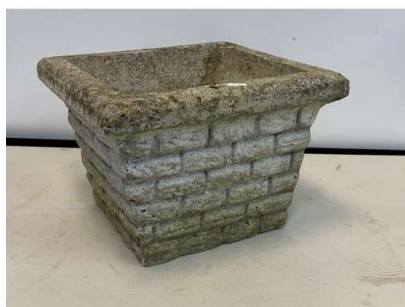
42. M - SQUARE GARDEN PLANTER