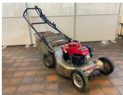
69. V - LAWNFLITE 553 HWS.PRO 21" PETROL LAWN MOWER - COST WHEN NEW £1200+