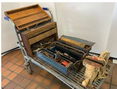
16. M - LGE BENCH VICE & 2 BOXES OF TOOLS