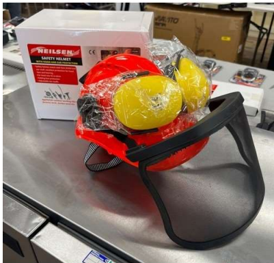
106. V - NEW NEILSON SAFETY HELMET WITH VISOR AND EAR PROTECTOR CT5290