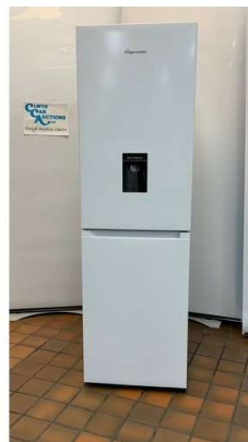
19. M - FRIDGEMASTER FRIDGE FREEZER MODEL MC55251DE - NO FROST MODEL WITH WATER DISPENSER RRP £379