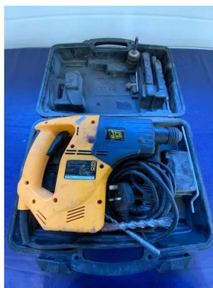
63A. M - JCB SDS + ROTARY HAMMER DRILL 850W - COST NEW £75