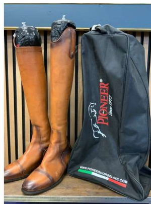
126. M - PIONEER ITALY BOOT BAG RRP £42.99 WITH PIONEER ARTEMIDE VERA PELLE LEATHER BROWN RIDING BOOTS WITH FILLER BAG SIZE 43 RRP APPROX £500 FOR BOOTS (PB/17/P22128572)