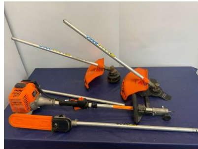
46. V - GARDEN PRIDE PETROL 3 IN 1 MULTI TOOL