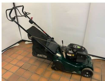
78. V - HAYTER 41 HARRIER 2009 VARIABLE SPEED AUTO DRIVE PETROL MOWER WITH COLLECTION - BRIGGS & STRATTEN ENGINE - 41CM CUTTING WIDTH = COST NEW £999