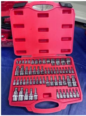
105. V - NEW NEILSON 60 PIECE MASTER STAR SOCKET SET (CT4513)