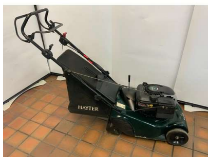
76. V - HAYTER HARRIER 41 2008 VARIABLE SPEED AUTO DRIVE PETROL MOWER WITH COLLECTION -