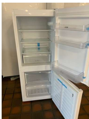
20. M - LOGIK FRIDGE FREEZER