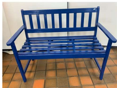
8. M - WOODEN GARDEN BENCH