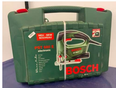
47. M - NEW BOSCH JIG SAW M MODEL 3603C92170