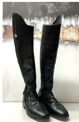
124. M - PIONEER TALL RIDING BOOTS CRONO-BLACK SIZE 39 RRP £297.90 (PB/18/P22128570)