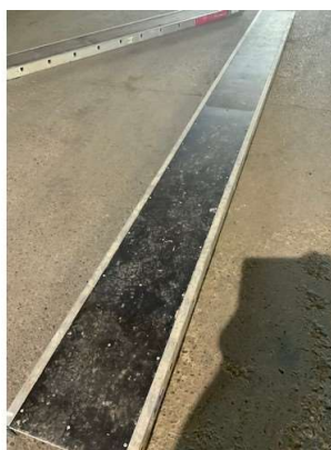
141. V - 5.3M YOUNGMAN BOARD