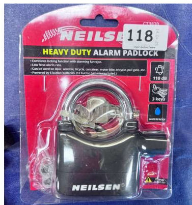
118. V - NEW NEILSON HEAVY DUTY ALARM PADLOCK (CT3870)