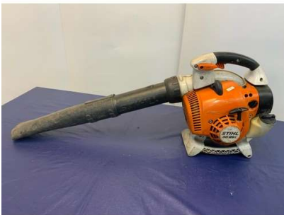
43. V - STIHL PETROL BG866 LEAF BLOWER