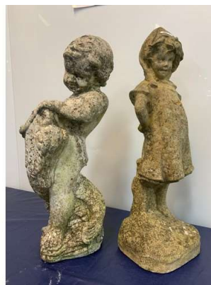
79. M - STONE BOY & GIRL FIGURES