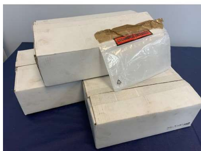
19. M - 3 X BOXES DOCUMENT WALLETS