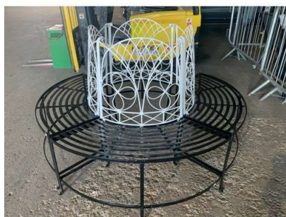
57. M - WROUGHT IRON TREE SEAT