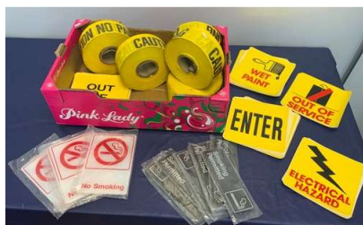
17. M - BOX ON NO SMOKING / PARKING TAPE & 5 X SIGNS