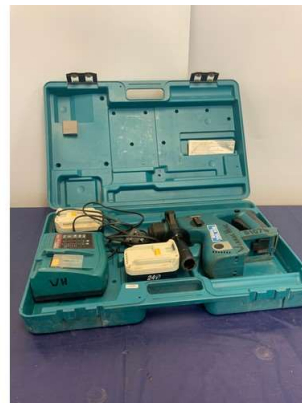
102. V - MAKITA BHR200 24V CORDLESS SDS HAMMER DRILL IN CASE