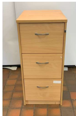
7. M - 3 DRAWER WOODEN FILING CABINET WITH KEY