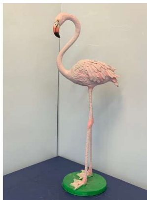
61. M - 4FT PINK FLAMINGO - RRP £100