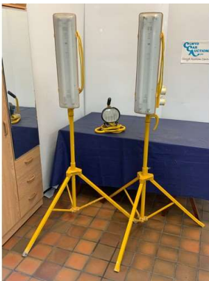
3. V - 110V WORK LIGHT & 110V PLASTERERS LIGHT