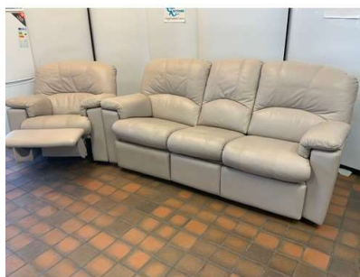
29. M - G PLAN 3 + 1 GREY LEATHER SUITE WITH RECLINER (NON ELECTRIC) RRP 3 SEATER £2040 CHAIR £1716 TOTAL £3756