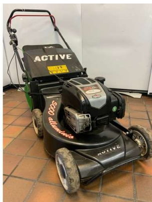
74. V - ACTIVE 5000B PETROL PUSH MOWER 163cc - 20" CUT - COST NEW £800