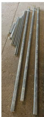
135. M - VARIOUS SIZE - METAL CABLE TRACKS