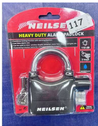
117. V - NEW NEILSON HEAVY DUTY ALARM PADLOCK (CT3870)