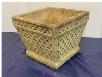
16. M - LARGE SQUARE STONE PLANTER