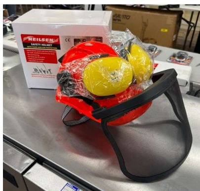
90. V - NEILSON SAFETY HELMET WITH VISOR AND EAR PROTECTION (CT5290)