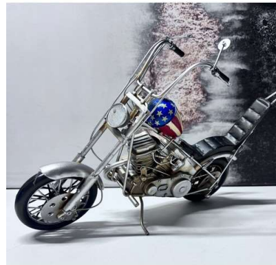
110. V - VINTAGE CHOPPER MOTORCYCLE 38cm