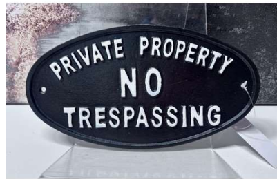
109. V - PRIVATE PROPERTY NO TRESPASSING SIGN