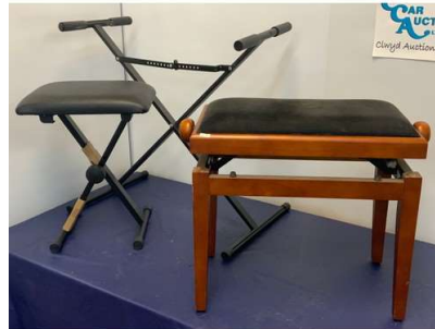
6. M - RISE & FALL PIANO STOOL & KEYBOARD STAND & STOOL