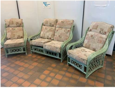
1. M - WICKER CONSERVATORY SUITE