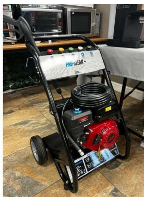
30. V - NEW PRO CLEAN+ 7.0HP HIGH PERFORMANCE PETROL PRESSURE WASHER (CT1757) OIL NEEDED