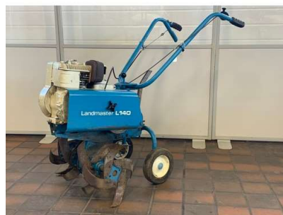
72. V - LANDMASTER L140 PETROL CULTIVATOR