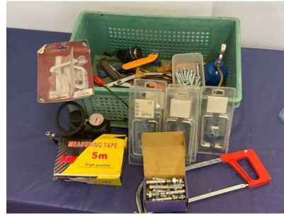
53. M - SUNDRY BOX OF TOOLS