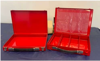
42. M - 2 X SMALL RED METAL BOXES