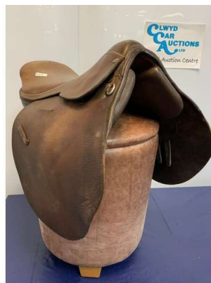
125. M - LA POLERA LEATHER POLO SADDLE 19" NEW LAMARTINA TECHNICAL/POLO RRP £1250 (DTM/02/P22129580)