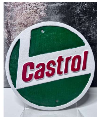
111. V - CASTROL CAST IRON SIGN