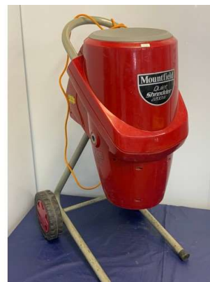
56. M - MOUNTFIELD QUIET 2200W ELEC GARDEN SHREDDER