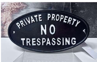
108. V - PRIVATE PROPERTY NO TRESPASSING SIGN