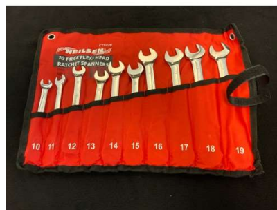
119. V - NEW NEILSON 10PC FLEXI-HEAD COMBINATION RATCHET SPANNER SET CT3229