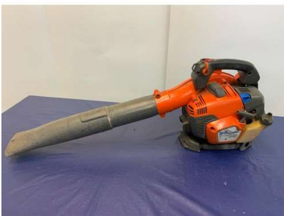
44. V - HUSQUAVANA 525 BX PETROL LEAF BLOWER