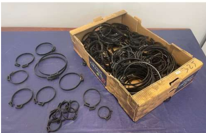
52. M - BOX OF HERBIE CLIPS