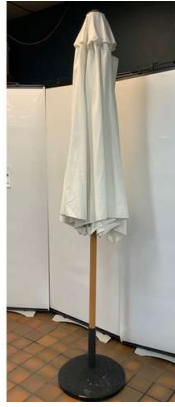
5. M - CAPRAIA ROUND PARASOL & STAND - 250CM X 300CM WIDE WITH COVER - RRP £100