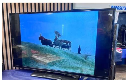
122. M - HITACHI 42IN HDMI SMART TV FULL HD 1080 FREEVIEWHD DTS TRUSURROUND WITH REMOTE-MODEL 42HBT42U K