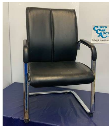
22. M - BLACK OFFICE CHAIR