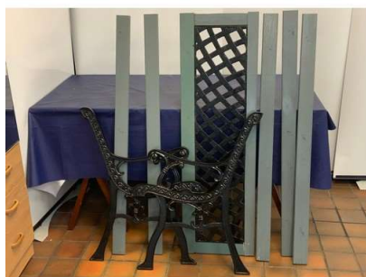
9. M - CAST GARDEN BENCH