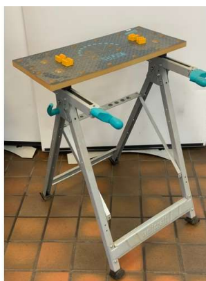
71. M - WOLF CRAFT MITRE SAW STAND