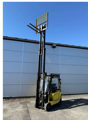
149. M - 2007 HYSTER J1.80XMT 3 WHEELED ELECTRIC FORK LIFT WITH A 4900MM LIFT HEIGHT, TRIPLEX MAST & SIDESHIFT WITH POWER BOX & KEY RRP £4750