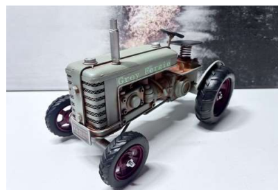
112. V - GREY FERGIE TRACTOR 27CM MODEL VEHICLE