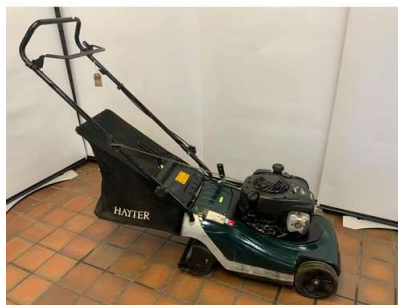
77. V - HAYTER SPIRIT MODEL CODE619J PETROL PUSH PETROL MOWER WITH COLLECTION