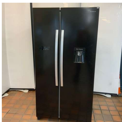
12. M - KENWOOD KSBS DB 19 AMERICAN STYLE FRIDGE FREEZER, 178CM X 90.8CM X 74.5CM(HxWxD) 370 LITRES FRIDGE/208 LITRES FREEZER, FROST FREE, WATER DISPENSER GLOSS BLACK RRP NEWER MODEL £599