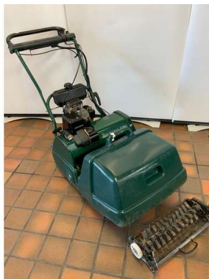
73. V - ATCO BALMORAL 17 SE PETROL CYLINDER MOWER WITH RAKE UNIT