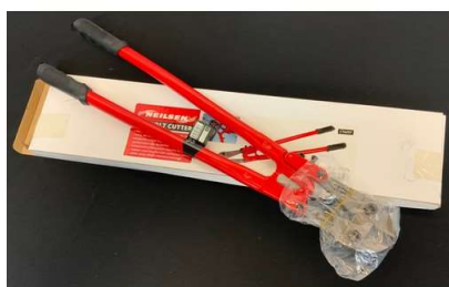
91. V - NEW NEILSON 30" RED BOLT CUTTER (CT0297)