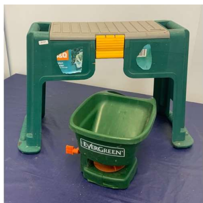
58. M - EVERGREEN HAND HELD SPREADER RRP £20 & B&Q GARDEN KNEELER RRP £15