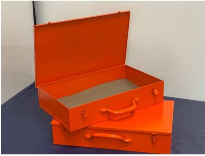
41. M - 2 X METAL STORAGE BOXES