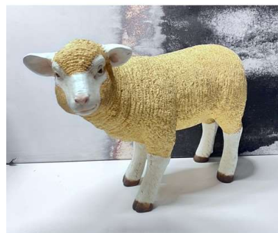
104. V - LARGE STANDING MERINO LAMB 62CM - RRP £199