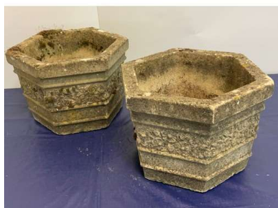
66. M - PAIR OF HEXAGANOL PLANTERS