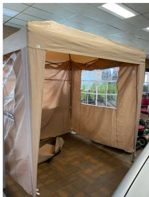
10. V - 2M X 2M POP UP GAZEEBO WITH SIDES IN BAG RRP £269