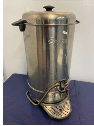
101. V - SWAN SS WATER BOILER - 240V - COST NEW £98