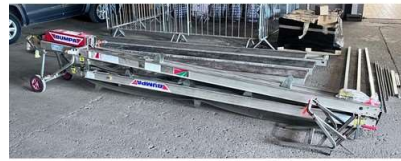
148. V - BUMPA 8M ELECTRIC HOIST SERIAL NUMBER 1436519 - COST NEW £4400