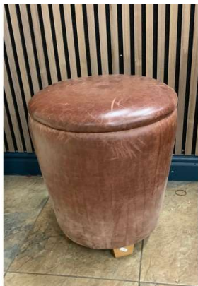
25. M - VINTAGE LEATHER STOOL - ONLINE £126 EACH