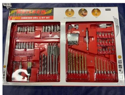
120. V - NEW NEILSON 83 PIECE COMBINED DRILL & BIT SET (CT4225)