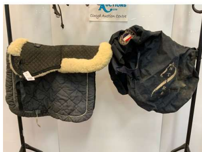
123. M - GREY HKM SADDLE PACK RRP £30 & ANTARES BLUE FLEECE LINED SADDLE COVER RRP £35, LEMIEUX PRO LAMBSKIN SADDLE SKIN HALF PAD SIZE L RRP £89.95 TOTAL RRP £154.95 (PB/13/P22129513) (PB/14/P22129515) (PB/9/P22128487)