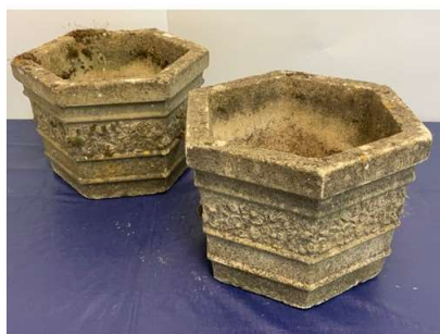
65. M - PAIR OF HEXAGANOL PLANTERS