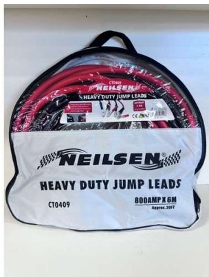
89. V - NEW NEILSON 800 AMP HD JUMP LEADS 6M