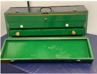
50. M - JOINERS TOOL BOX