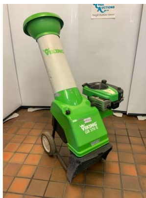
69. V - VIKING GB 370S PETROL CHIPPER SHREDDER WITH 6.5 HP BRIGGS & STRATTON ENGINE - COST NEW £875