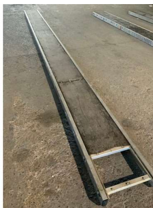
142. V - 6.2M YOUNGMAN BOARD