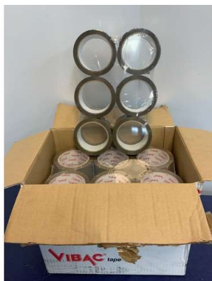
18. M - BOX OF PARCEL TAPE