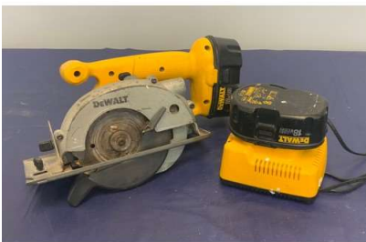
51. M - DEWALT DW936 CORDLESS CIRCULAR SKILL TRIM SAW & 2 BATTERIES & CHARGER