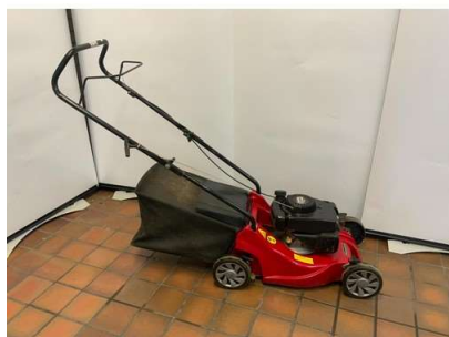
75. V - MOUNTIFIELD HP414 2011 PUSH PETROL MOWER WITH COLLECTION