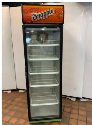
13. M - NORCOOL - S75L TALL GLASS FRONTED DISPLAY BOTTLE FRIDGE