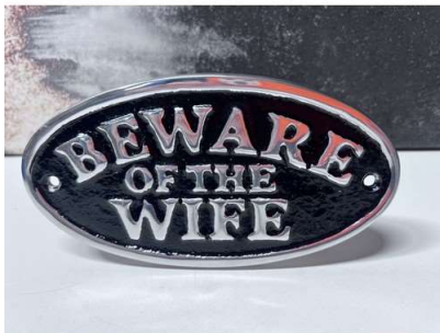
106. V - BEWARE OF THE WIFE - POLISHED ALUMINIUM SIGN