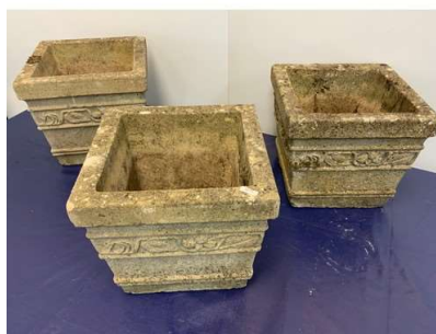
63. M - 3 SQUARE PLANTERS