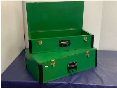
49. M - 2 X WOODEN TOOL BOXES