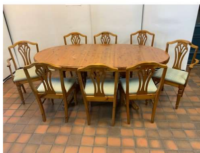
23. M - PINE DINING ROOM SUITE WITH 8 CHAIRS