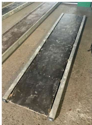
139. V - 2.4M YOUNGMAN BOARD