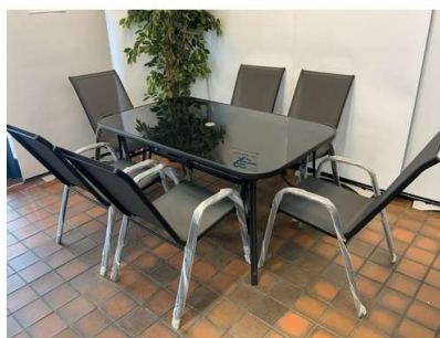
62. V - RECTANGULAR 6 PERSON OUTDOOR DINING SET RRP £369.99