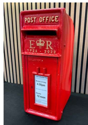
103. V - NEW ER 1926-2022 CAST POST BOX RED 57CM WITH KEY