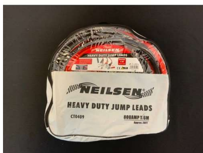
92. V - NEW NEILSON 800 AMP HD JUMP LEADS 3M (CT0408)