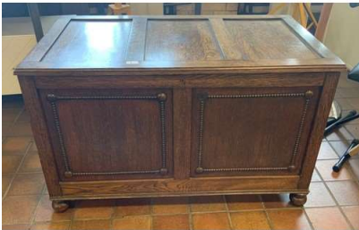
2. M - LARGE WOODEN BLANKET BOX - ONLINE RRP £375+