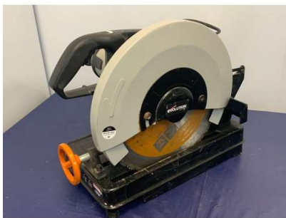
99. M - EVOLUTION 355mm MUTLI PURPOSE CUT OFF SAW - COST NEW £219