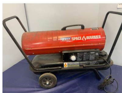
70. V - SEALEY AB7081 SPACE WARMER PARAFFIN / KEROSENE / DIESEL HEATER 70,000BTU/HR WITH WHEELS - COST NEW £367