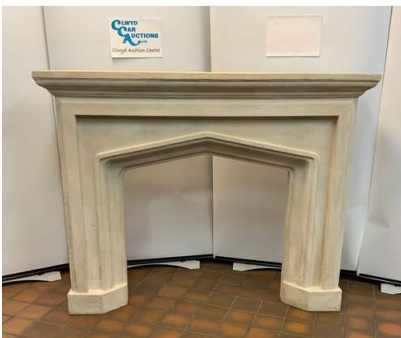
4. M - STONE EFFECT FIRE SURROUND RRP £1187