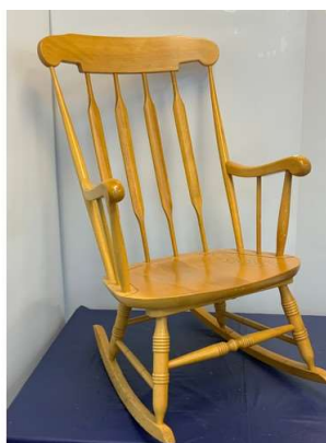
24. M - BEECH ROCKING CHAIR