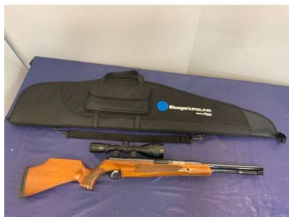
121. M - AIR ARMS TX200 2.2 AIR RIFLE WITH SIGHT & BAG - COST NEW £700-£800