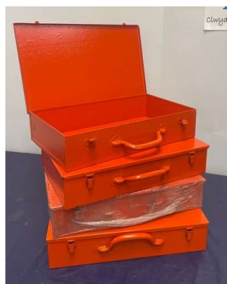
96. M - 4 X METAL ORANGE STORAGE BOXES