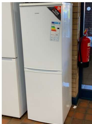
14. M - TEKNIX FRIDGE FREEZER - COST WHEN NEW £300