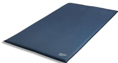
59. M - SILENTNIGHT CAMPING EXTRA DEEP SELF-INFLATING 10CM MATT DOUBLE IN BAG NEW WITH TAGS RRP £75.99 ( P24270109 / C )