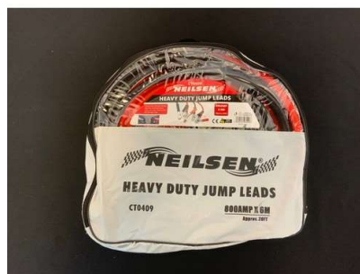
93. V - NEW NEILSON 800 AMP HD JUMP LEADS 3M (CT0408)