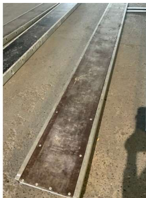
140. V - 4.8M YOUNGMAN BOARD