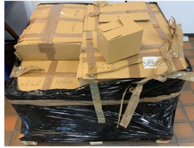
147. M - PALLET OF CARDBOARD BOXES - VARIOUS SIZES - COST NEW £1000