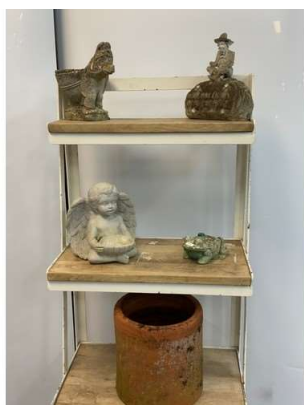
67. M - 4 GARDEN FIGURES & CHIMNEY POT