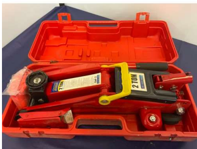
100. M - EUROPARTS 2 TON TROLLEY JACK RRP £37