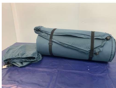
60. M - SILENTNIGHT CAMPING EXTRA DEEP SELF-INFLATING 10CM MATT DOUBLE IN BAG NEW WITH TAGS RRP £75.99 ( P24270109 / C )