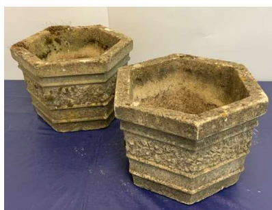
64. M - PAIR OF HEXAGANOL PLANTERS