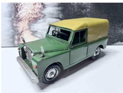
114. V - RETRO 4X4 GREEN JEEP MODEL VEHICLE