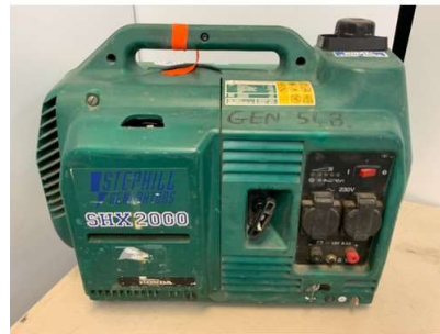
55. V - STEPHILL SHX2000 1.7KVA SILENT PETROL SUITCASE GENERATOR - COST NEW £700