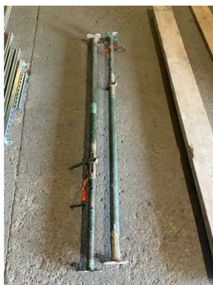
137. V - PAIR OF ACRO PROPS