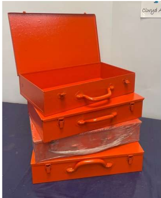
98. M - 4 X METAL ORANGE STORAGE BOXES