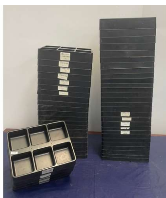
11. M - 2SETS X PLASTIC STORAGE TRAYS