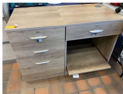
119. V - EBERN DESIGN DESK GREY WITH 4 DRAWERS WITH KEYS RRP £409.99