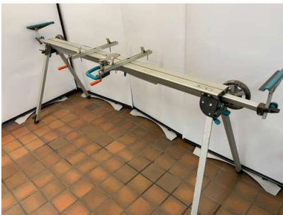
3. M - WOLFCRAFT MITRE SAW STAND WITH CLAMPS RRP £65.99