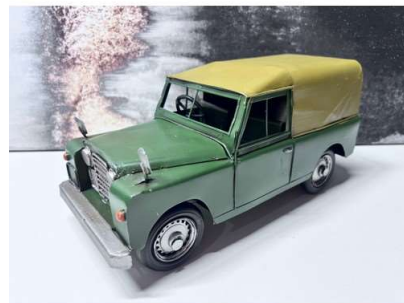
81. V - RETRO 4X4 GREEN JEEP MODEL VEHICLE