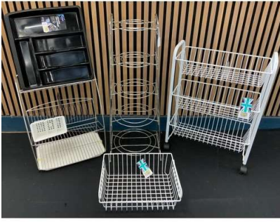
107. M - NEW 5 ASSORTED STORAGE ITEMS TOTAL RRP £262.99