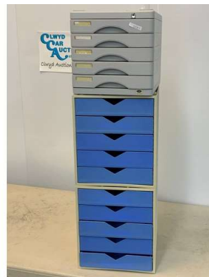
6. M - 3 PLASTIC FILE DRAWERS