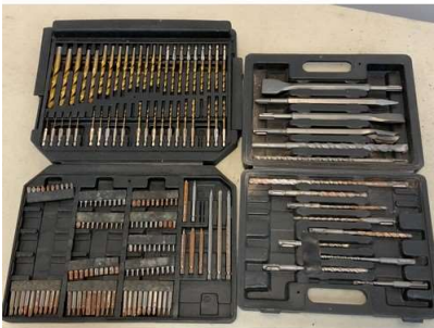
131. M - 2 X CASED DRILL BIT SETS