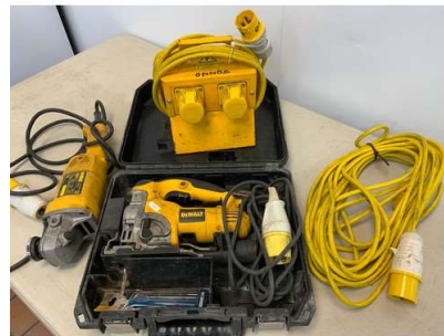
36. M - 110V DEWALT JIGSAW MODEL DW331K-LX RRP £196.52, GRINDER MODEL DW831L-XW RRP £139.99, JUNCTION BOX & LEAD