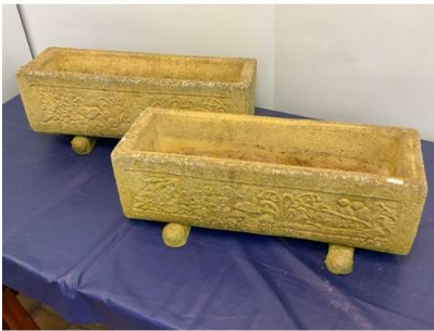
24. M - PR OF OBLONG STONE PLANTERS