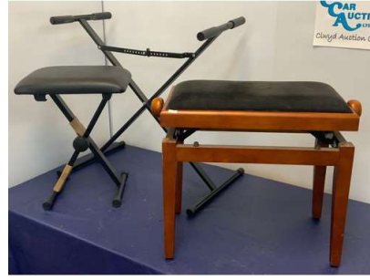
4A. M - RISE & FALL PIANO STOOL & KEYBOARD STAND & STOOL