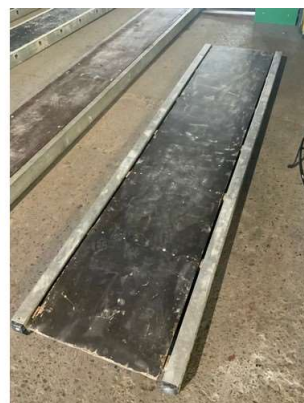
144. V - 2.4M YOUNGMAN BOARD