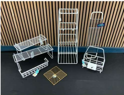
108. M - NEW 7 ASSORTED STORAGE ITEMS TOTAL RRP £188.74