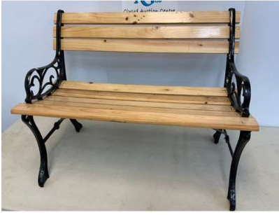
23. M - CHILDRENS CAST & WOODEN GARDEN SEAT