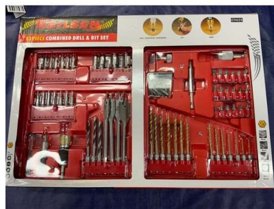
118. V - NEW NEILSEN 83 PIECE COMBINED DRILL & BIT SET (CT4225)