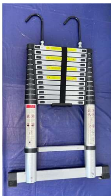
26. M - TECKNET EN131 TELESCOPIC ALU LADDER - RRP £291