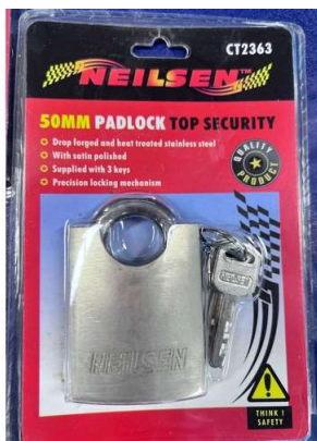
86. V - NEW NEILSEN TOP SECURITY 50MM PADLOCK (CT2363)