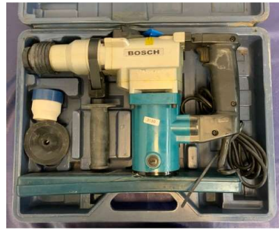
126. M - BOSCH 230V ROTARY HAMMER DRILL - MODEL ZIC-26A - COST NEW £228