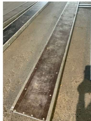
143. V - 4.8M YOUNGMAN BOARD