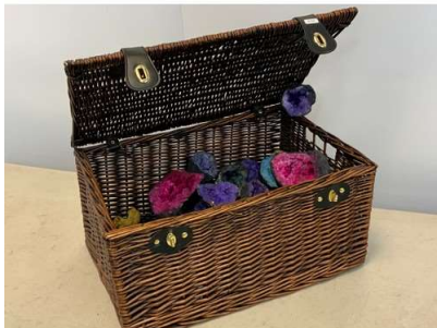
54. M - WICKER BASKET OF CRYSTAL ROCKS