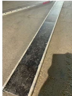
142. V - 5.3M YOUNGMAN BOARD