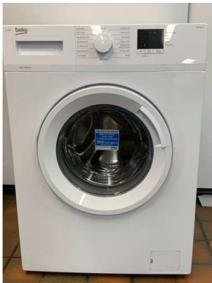
10. M - BEKO 7KG 1200 RPM WASHING MACHINE (WTK72011W) RRP £249