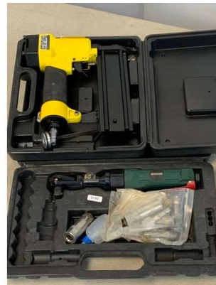
136. M - PARKSIDE AIR WRENCH & POWERCRAFT AIR NAILER XY-F50