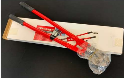
122. V - NEILSON 30" RED BOLT CUTTER (CT0297)