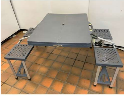
1. M - FOLDING PICNIC TABLE RRP £50