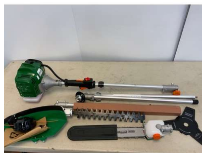
96. M - HAWKS MOORE TOOL STATION - PETROL MULTI TOOL, 33cc STRIMMER / HEDGE CUTTER MODEL 62625(DGJ330H) RRP £231.98