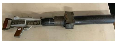
46. M - THORNTON PICKARD MARK III H (HYTHE) GUN CAMERA