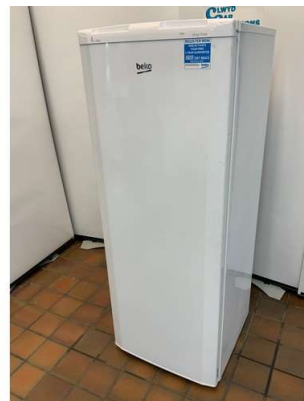
7. M - BEKO FOSTFREE A+ CLASS UPRIGHT FREEZER RRP £250