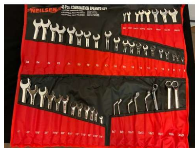
121. V - NEW NEILSON SPANNER SET 48PC SATIN FINISH CT0876