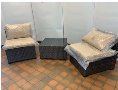
61. V - RATTAN EFFECT TABLE & 2 CHAIRS WITH CUSHIONS RP £300