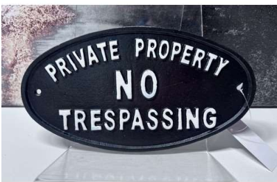
84. V - PRIVATE PROPERTY NO TRESPASSING SIGN