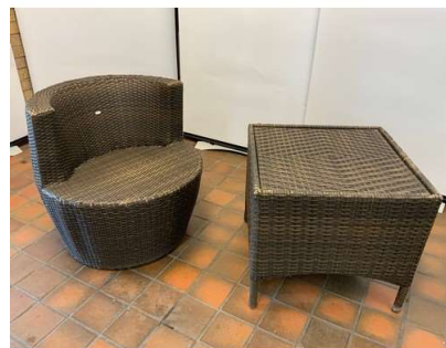
58. M - RATTAN SINGLE CHAIR & TABLE PRE LOVED