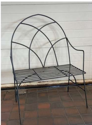
109A. M - 2 SEATER DECORATIVE GARDEN BENCH