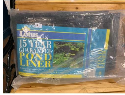
19. M - LOTUS 18 X 12FT POND LINER RRP £98