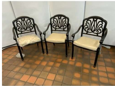
53. V - 3 X AMALFI GARDEN CHAIRS WITH CUSHIONS RRP £567