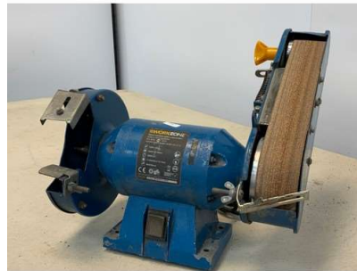
28. M - WORK ZONE BENCH GRINDER WITH SANDING BELT