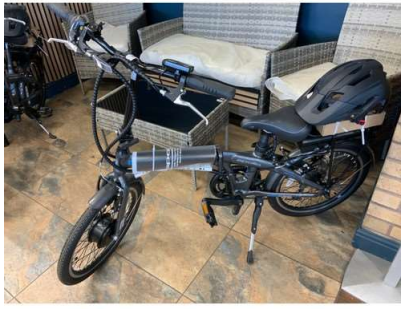
59. M - APOLLO ELECTRIC FOLDING BIKE WITH CHARGER & 3 KEYS RRP £849 WITH HELMET RRP £59.99