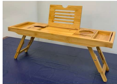
63. M - NEW BAMBOO EXTENDABLE BATH CADDY DESK TRAY RRP £39.95