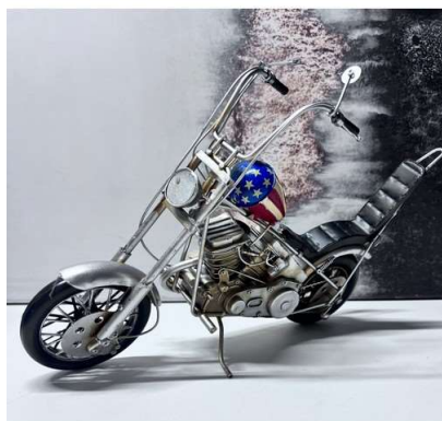
92. V - VINTAGE CHOPPER MOTORCYCLE 38cm