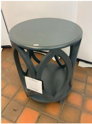
52. V - SAFAVIEH OCCASIONAL TABLE RRP £187.04