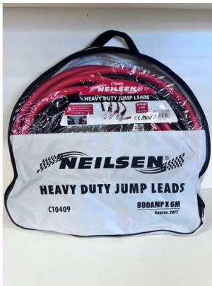
77. V - NEW NEILSEN 800 AMP HD JUMP LEADS 6M