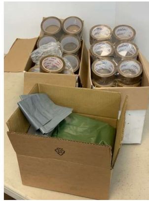
110. M - 2 X BOXES OF PACKING TAPE & BOX OF NEW PARCEL BAGS