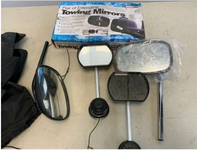
16. M - 3 X PAIRS OF TOWING MIRRORS TOTAL RRP £120