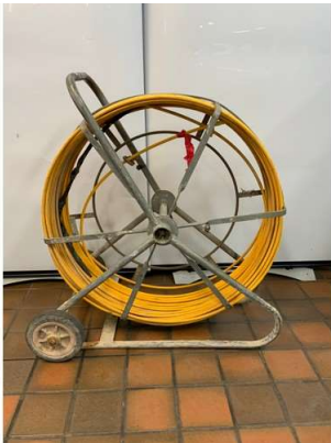
148. M - DUCT RODDER SYSTEM - COST NEW £300+