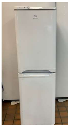
11. M - INDESIT NO FROST FRIDGE FREEZER (R600A) RRP £329