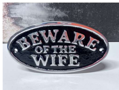
82. V - BEWARE OF THE WIFE - POLISHED ALUMINIUM SIGN