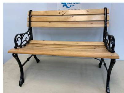
22. M - CHILDRENS CAST & WOODEN GARDEN SEAT