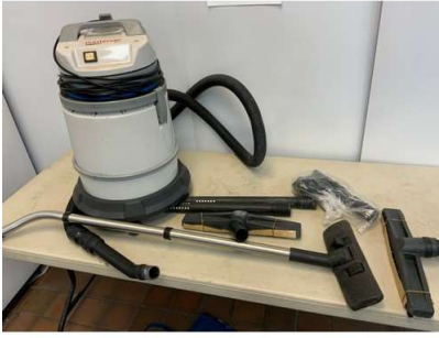
138. M - MASTER VAC WET VACUUM CLEANER WITH TOOLS