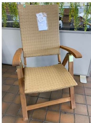
49. V - NEW MERXX CAPRI POLYRATTAN RECLINER CHAIR RRP £180