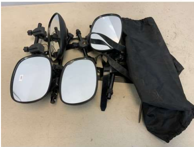
17. M - 2 X PAIRS OF TOWING MIRRORS TOTAL RRP £80