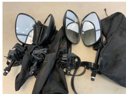
15. M - 2 X PAIRS OF TOWING MIRRORS TOTAL RRP £80