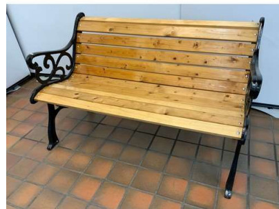
21. M - LARGE CAST & WOOD GARDEN BENCH