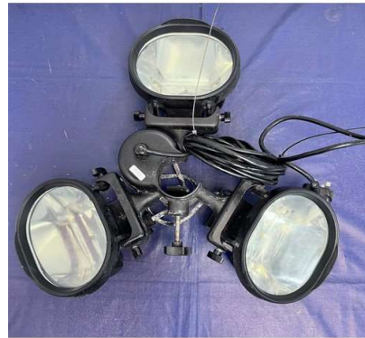
57. M - INFRARED PARASOL HEATER 240V MODEL PH0003SDG/KB006 - SIMILAR RRP £89.99