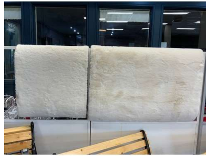
12. M - 2 x CREAM FUR RUGS (42" x 24" / 40" x 60")