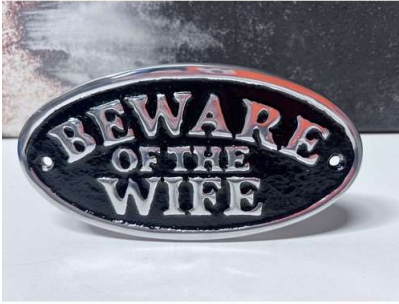
83. V - BEWARE OF THE WIFE - POLISHED ALUMINIUM SIGN