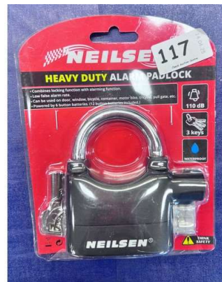
89. V - NEW NEILSEN HEAVY DUTY ALARM PADLOCK (CT3870)