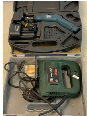
135. M - BOSCH 240V JIG SAW MODEL PST 52 A - COST NEW £42 & BLACK & DECKER VP940 MULTITOOL