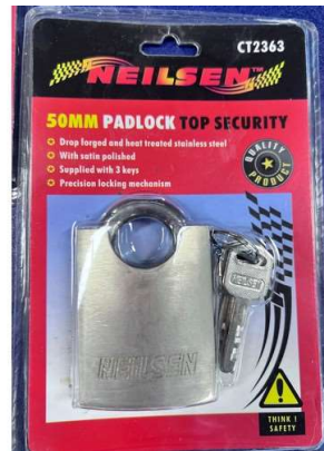
87. V - NEW NEILSEN TOP SECURITY 50MM PADLOCK (CT2363)