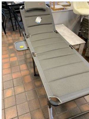
48. V - QUEST ELITE NAPLES PRO LOUNGER RRP £132