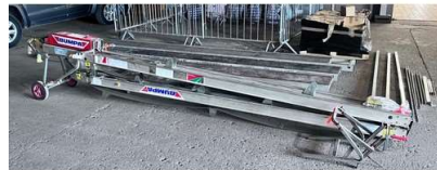
152. V - BUMPA 8M ELECTRIC HOIST SERIAL NUMBER 1436519 - COST NEW £4400