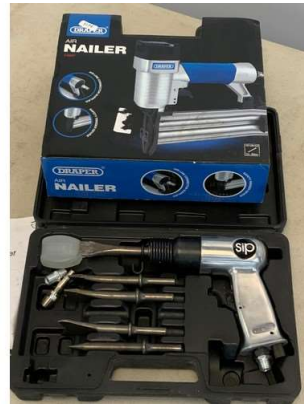
134. M - DRAPER AIR NAILER 14607 COST NEW £53 & SIP AIR CHISEL SET MODEL 01610