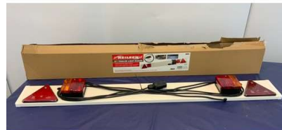
128. V - NEW NEISLON TRAILER LIGHT BOARD - 4FT WITH 5M CABLE (CT4927)