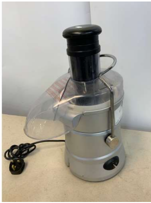
8. M - TESCO WHOLE FRUIT JUICER MODEL WFJ07 RRP £59.99