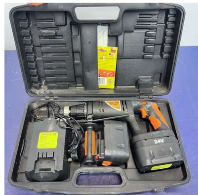
127. M - CHALLENGE PRO HD 24V CORDLESS DRILL IN BOX - MODEL BD4916C