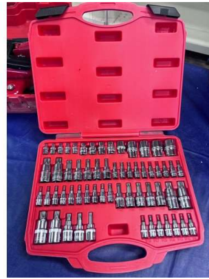
79. V - NEW NEILSEN 60 PIECE MASTER STAR SOCKET SET (CT4513)