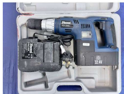
137. M - FERN FDCL3240 CORDLESS HD HAMMER DRILL IN BOX