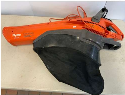
2. M - FLYMO 1600W GARDEN VAC