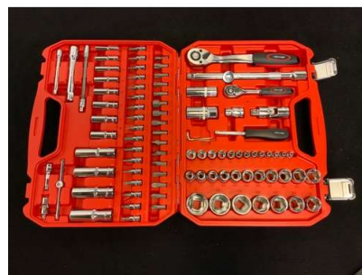
129. V - NEW NEILSON SOCKET SET - 94 PC - 1/4-1/2 INCH DRIVE & ACCESORIES CT0697