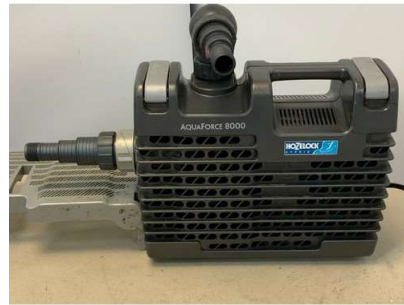
20. M - HOZELOCK AQUAFORCE 8000 POND PUMP RRP £234.99