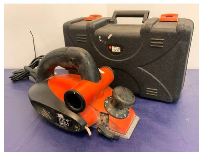
30. M - BLACK & DECKER KW82 PLANER IN BOX - 900W RRP £74.98