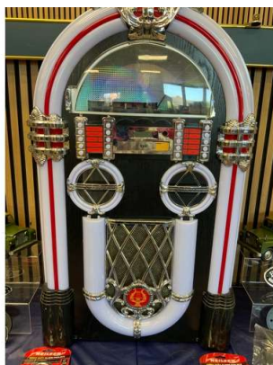
93. M - ITEK RECORD & CD PLAYER JUKEBOX MODEL 158066 - COST WHEN NEW £649