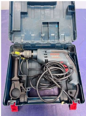
133. M - BOSCH GSB 1600RE PROFESSIONAL IMPACT DRILL IN CASE - COST NEW £193