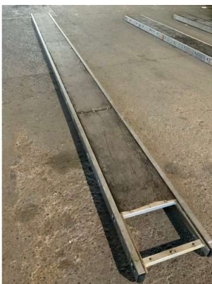
141. V - 6.2M YOUNGMAN BOARD