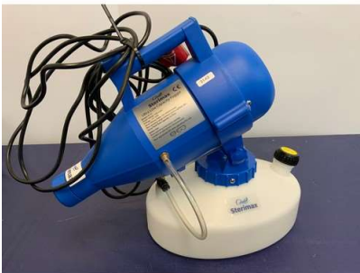
124. M - STERIMAX ULTRA LOW CAPACITY FOGGER - MODEL SP-4.5 - COST NEW £127