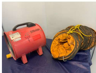
29. V - ELITE 300 110V FUME EXTRACTOR - COST NEW £393