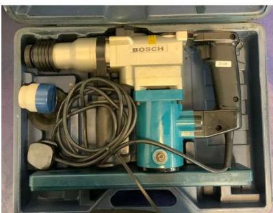
125. M - BOSCH 230V ZIC-26A ROTARY HAMMER DRILL IN BOX - COST NEW £228