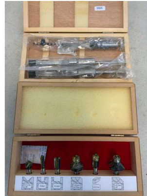
34. M - BOX OF MILLING BITS & BOX ROUTER BITS