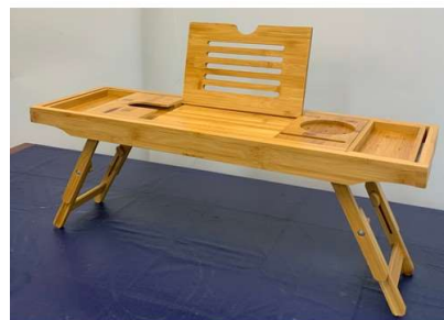
65. M - NEW BAMBOO EXTENDABLE BATH CADDY DESK TRAY RRP £39.95