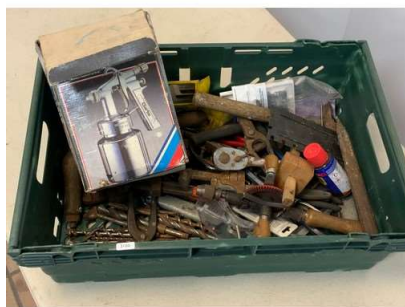
45. M - S BOX TOOLS, SPRAY GUN & DRILL BITS