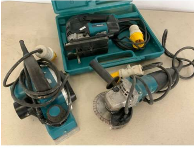
31. M - MAKITA 110V JIGSAW MODEL 4340FCT RRP £159.99, PLANER MODEL KP0800 RRP £124.44 & GRINDER MODEL 9554NB RRP £83 TOTAL RRP £367.43