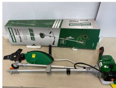
97. M - HAWKS MOOR BRUSH CUTTER - PETROL 33cc MODEL 51405(CG330FHB) RRP £79.98