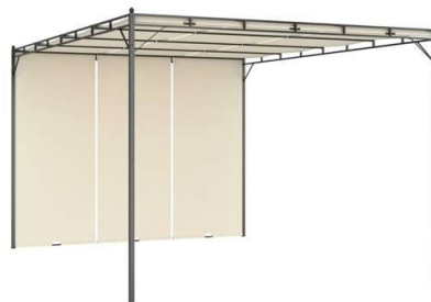
154. V - NEW VIDA XL GARDEN GAZEBO WITH SIDE CURTAINS 4 X 3 RRP £217.99