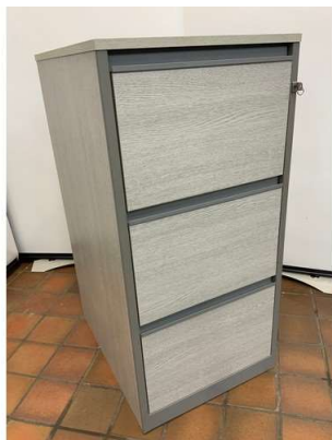
116. M - GREY 3 DRAWER WOODEN FILING CABINET WITH KEY