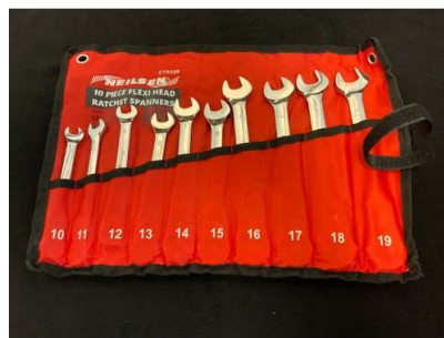
95. V - NEW NEILSEN 10PC FLEXI-HEAD COMBINATION RATCHET SPANNER SET CT3229