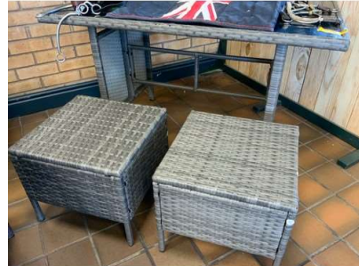
56. V - 2 SEATER RATTAN STOOL AND GLASS TOP TABLE SET

JACK JOHN WHITTAKER LTD LEG PADS RRP £45 EACH, ESKADKON FLEXI SOFT OPEN HORSE BOOTS RRP £114 TOTAL RRP £249 (PB/15/P22129494)(DTM/10/P22129588) LEATHER HACKMORE RRP APPROX £150-200 (DTM/06/P22129599)