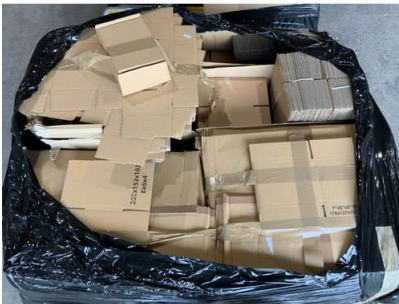
140. M - PALLET OF CARDBOARD BOXES - VARIOUS SIZES - COST NEW £1000