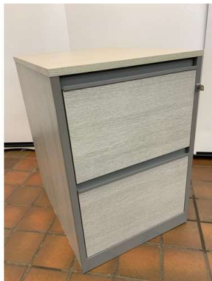
114. M - GREY 2 DRAWER WOODEN FILING CABINET WITH KEY