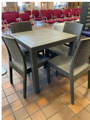
47. V - SIESTA FLORIDA RATTAN 4 SEATER GARDEN DINING SET RRP £400