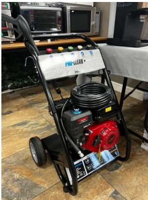
109. V - NEW PRO CLEAN+ 7.0HP HIGH PERFORMANCE PETROL PRESSURE WASHER (CT1757) OIL NEEDED