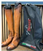
55. M - PIONEER ITALY BOOT BAG RRP £42.99 WITH PIONEER ARTEMIDE VERA PELLE LEATHER BROWN RIDING BOOTS WITH FILLER BAG SIZE 43 RRP APPROX £500 FOR BOOTS (PB/17/P22128572) 3 SMALL UNION

JACK JOHN WHITTAKER LTD LEG PADS RRP £45 EACH, ESKADKON FLEXI SOFT OPEN HORSE BOOTS RRP £114 TOTAL RRP £249 (PB/15/P22129494)(DTM/10/P22129588) LEATHER HACKMORE RRP APPROX £150-200 (DTM/06/P22129599)