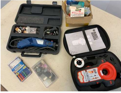
130. M - BLACK & DECKER LASERPLUS LZR 2 & DRAPER 140W MULTI TOOL PT140K