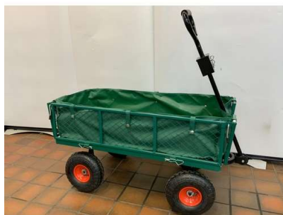
50. M - 4 WHEEL GREEN GARDEN TROLLEY FESTIVAL CART RRP £77