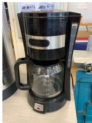
113. M - DELONGHI COFFEE PERCOLATOR MODEL ICM15210 - COST WHEN NEW £49