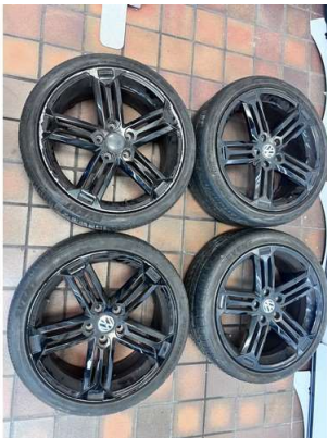
18. M - SET OF 4 VW 18" 5 SPOKE ALLOY WHEELS COST £490 EACH - WITH TYRES