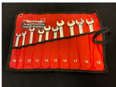
94. V - NEW NEILSEN 10PC FLEXI-HEAD COMBINATION RATCHET SPANNER SET CT3229