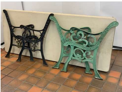
25. M - 2 PAIRS CAST BENCH ENDS