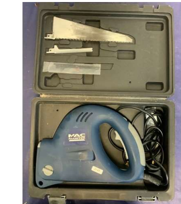
32. M - MACALLISTER MULTI PURPOSE SAW- MODEL M1MS600 - IN BOX RRP £40