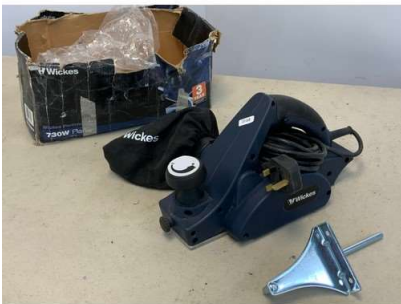
33. M - WICKES PERFORMANCE 730W PLANER RRP £45