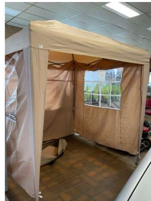
5. V - 2M X 2M POP UP GAZEBO WITH SIDES IN BAG RRP £269