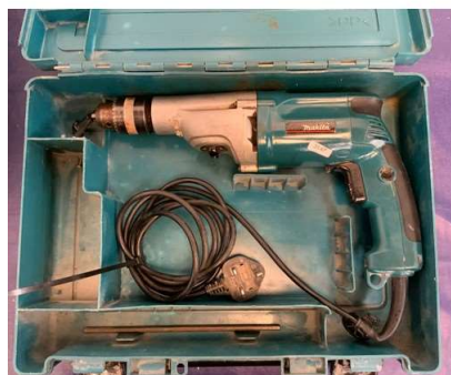
117. M - MAKITA 230V HP2050F PERCUSSION DRILL IN BOX - COST WHEN NEW £208