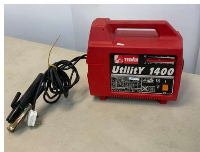
120. M - TELWIN UTILITY 1400 STICK WELDER