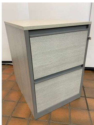
115. M - GREY WOODEN 2 DRAWER FILING CABINET WITH KEY