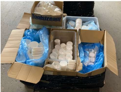
139. M - 1 PALLET ASS TUBS- SMALL MEDIUM, MEDIUM, LARGE & LIDS