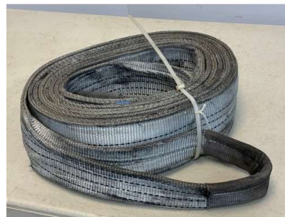
35. M - HEAVY DUTY LIFTING STRAP