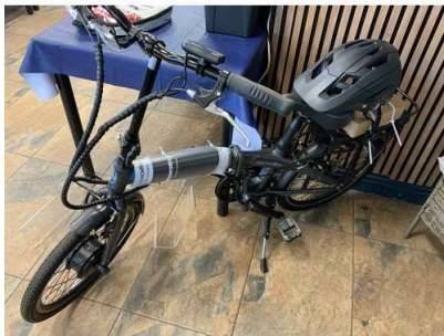
60. M - APOLLO ELECTRIC FOLDING BIKE WITH CHARGER & 3 KEYS RRP £849 WITH HELMET RPP £59.99