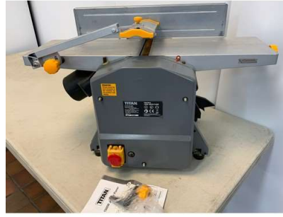
27. M - TITAN TTB579PLN 204MM ELECTRIC PLANER THICKNESSER 230V - COST NEW £189