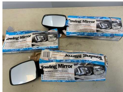
14. M - 3 EXTENDING TOWING MIRRORS TOTAL RRP £60