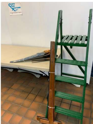
4. M - WOODEN STEPS, JOINERS SAW & SET SQUARES