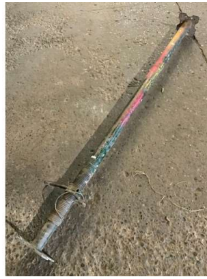
150. V - ACRO PROP