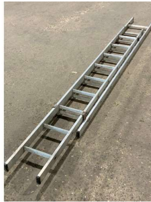
151. M - DOUBLE ALUMINIUM LADDER