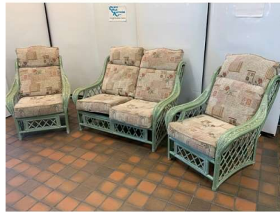
13. M - WICKER CONSERVATORY SUITE