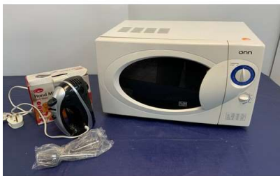
9. M - QUEST HAND MIXER & ONN MICROWAVE - MODEL OMO10