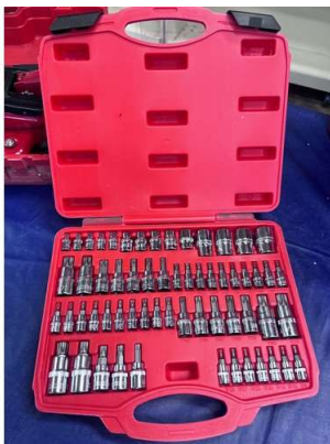
78. V - NEW NEILSEN 60 PIECE MASTER STAR SOCKET SET (CT4513)