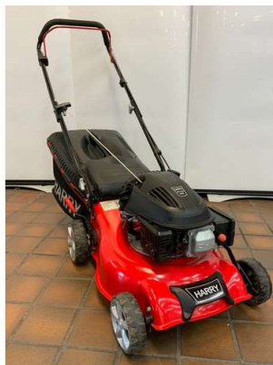
51. M - HARRY PETROL PUSH MOWER MODEL G42P-A1 WIDTH 42CM CUT WITH COLLECTION - JUST SERVICED RRP £195