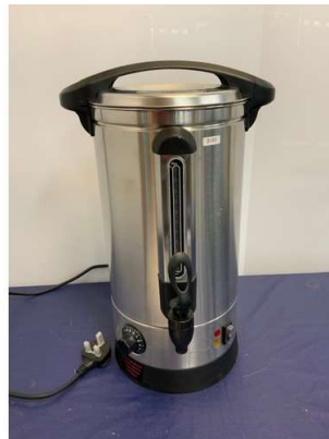
112. M - SUNNEX 240V 1500W ELEC WATER BOILER - MODEL MWB100 10LTR RRP £70.79