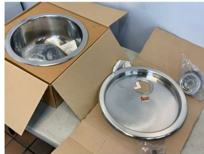
111. M - TEKA INSET ROUND SS SINK MODEL -DR80 18" RRP £122