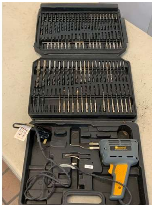
132. M - CASED DRILL BIT SET & POWER G SOLDERING GUN