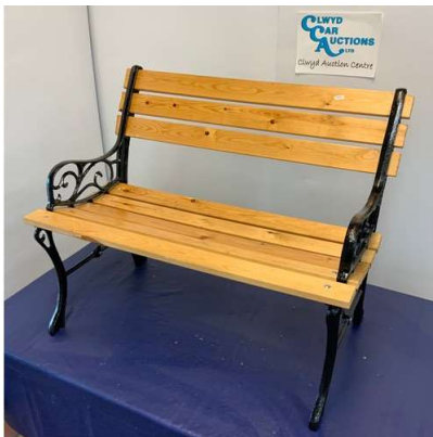
55. M - 3FT GARDEN BENCH - 2 SEATER