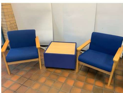
10. M - BLUE 2 SEATER RECEPTION SUITE - COST NEW £366