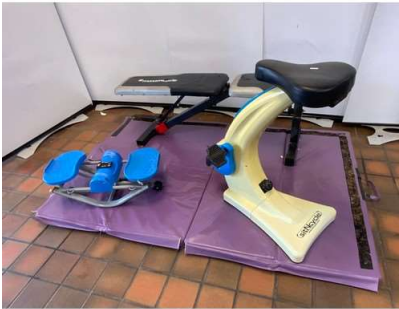
172. M - SET OF 4 KEEP FIT ITEMS - ROCK & ROLL, STEPPER, SIT & CYCLE BIKE, MAX MUSCLE WEIGHT BENCH & GYM MAT