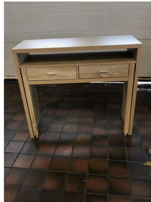
128. V - NEW PC TABLE W/ DOUBLE DRAWERS WORKSTATION RRP £216.99