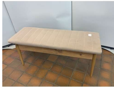
11. V - OTTOMAN PIANO BENCH RRP £156