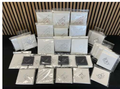
129. M - NEW BOX OF ASSORTED PRINTER NAPKINS (34) TOTAL RRP £182.84