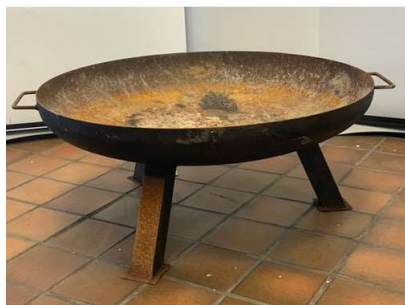
29. M - FIRE BOWL WITH LEGS