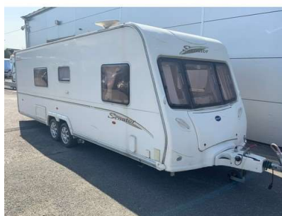
186. M - APPROX 2005 BAILEY SENATOR 5 WYOMING TWIN AXLE 4 BERTH CARAVAN - VIN NO: