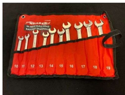
83. V - NEW NEILSEN 10PC FLEXI-HEAD COMBINATION RATCHET SPANNER SET CT3229