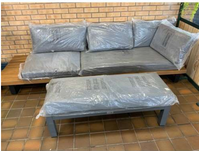
46. V - LOW LEVEL GARDEN SOFA AND STOOL RRP £649