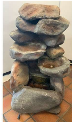
50. M - CASCADING WATER FOUNTAIN - COST WEN NEW £380