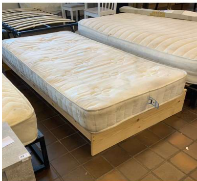
17. M - MODERN ALPINE NATURAL SINGLE GUEST BED WITH MATTRESS