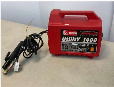
117. M - TELWIN UTILITY 1400 WELDING MACHINE & MASK - COST NEW RRP £199