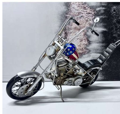
76. V - VINTAGE CHOPPER MOTORCYCLE 38cm