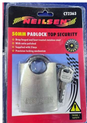
81. V - NEW NEILSEN TOP SECURITY 50MM PADLOCK (CT2363)