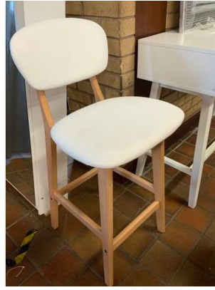
103. V - WHITE STOOL WITH BACKREST WOOD RRP £80