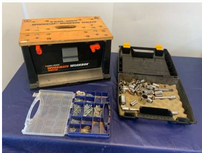
108. M - BLACK & DECKER WORKMATE WORK BOX WM450 & 2 STORAGE BOXES INC SOCKETS, SCREWS & WALL PLUGS