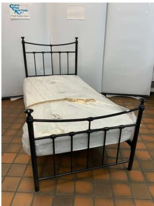
16. V - EMILY BLACK METAL BED FRAME RRP £154 WITH PREMIER JULIAN BOWEN SINGLE MATTRESS RRP £129 - TOTAL RRP £283