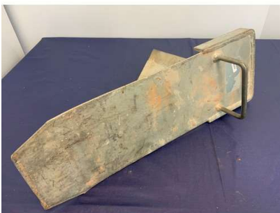
118. V - STRONG BOY