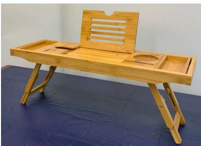
142. M - NEW BAMBOO EXTENDABLE BATH CADDY DESK TRAY RRP £39.95