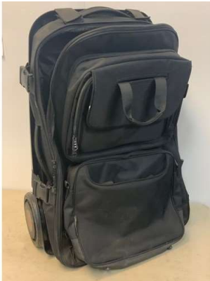
101. M - TRAVEL CASE/TROLLEY