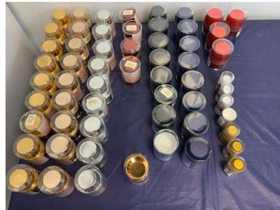
144. M - NEW ASSORTMENT OF MUFFIN & SWEET CAKES (59) TOTAL RRP £265.60