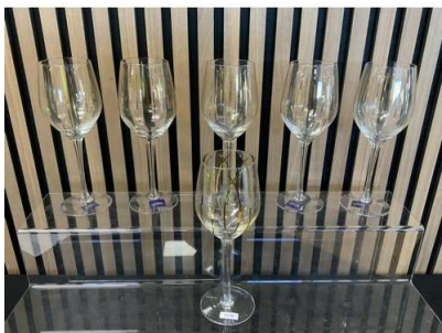
150. M - 6 MIKASA GOLD COLOURED GLASSES TOTAL £59.94