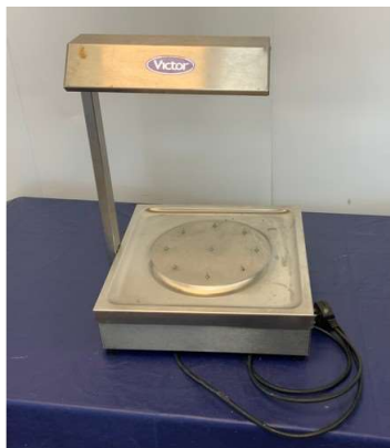
91. M - VICTOR SS HEATED CARVERY PAD - COST WHEN NEW £552