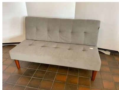
5A. V - YENINGS 3 SEATER UPHOLSTERED RECLINING SOFA BED RRP £169.99