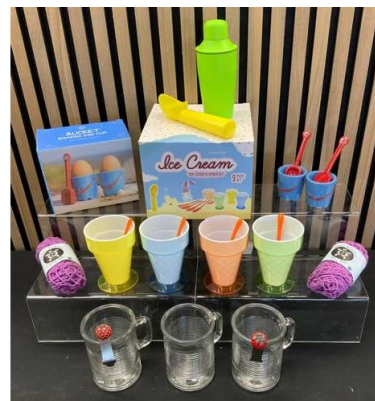
138. M - NEW ICE CREAM SET, EGG & SPOON BUCKET SET, GLASSES ETX (10 ITEMS) TOTAL RRP £63.95