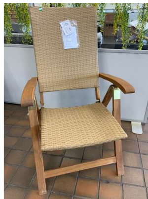
44. V - NEW MERXX CAPRI POLYRATTAN RECLINER CHAIR RRP £180