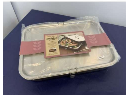
137. M - NEW HOMEMADE SMOKING OVEN S/S RRP £77.99