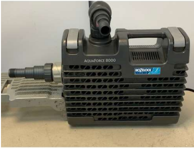
53. M - HOZELOCK AQUAFORCE 8000 POND PUMP - COST WHEN NEW £234.99