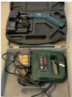
110. M - BOSCH 240V JIG SAW MODEL PST 52 A - COST NEW £42 & BLACK & DECKER VP940 MULTITOOL