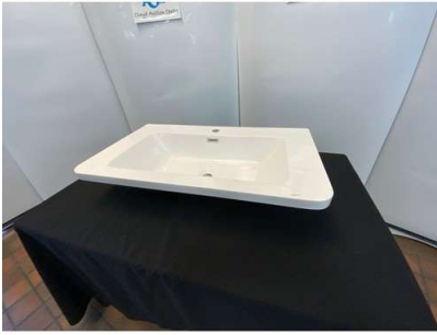
123. V - COUNTER TOP WASH BAIN RRP £279 A/F 31.5 inch x 18inch x 6.5inch