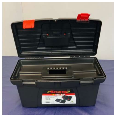
98. V - NEW NEILSON 19" TOOL BOX (CT4381)