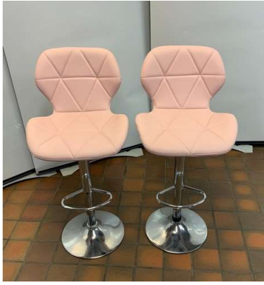
147. M - 2 X PINK BREAKFAST BAR STOOLS PRE LOVED