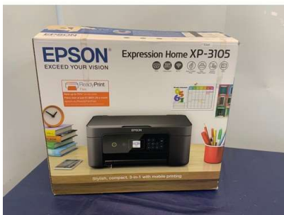
109. M - EPSON HOME XP-3105 3 IN 1 PRINTER NEW IN BOX RRP £54.99