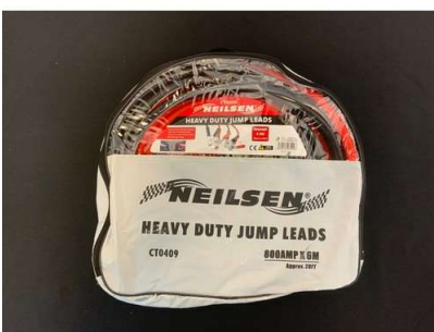
64. V - NEW NEILSEN 800 AMP HD JUMP LEADS 3M (CT0408)