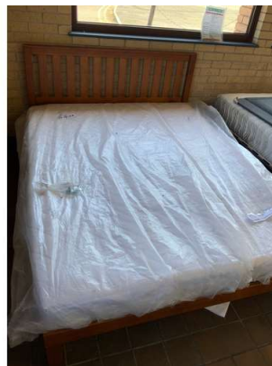
20. V - HATFIELD WOOD PLATFORM BED WITH WOODEN HEADBOARD KINGSIZE RRP £219 WITH SPRUNG POCKET KINGSIZE MATTRESS