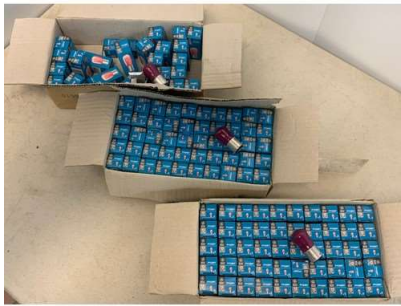
107. M - 3 X BOXES OF 15W PYGMY BULBS - RRP £1.10 EACH BULB