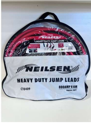
131. V - NEW NEILSEN 800 AMP HD JUMP LEADS 6M