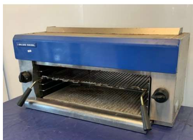
96. M - BLUE SEAL EVOLUTION G9 GAS SALAMANDER GRILL - COST WHEN NEW £1600+