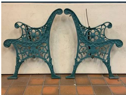
1A. M - PR OF CAST BENCH ENDS