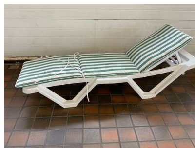
14. V - GARDEN LOUNGER WITH GREEN STRIPEY CUSHION RPP £193