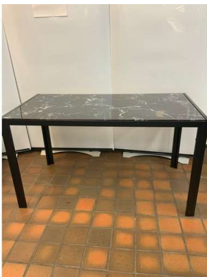
48. V - BLACK MARBLE EFFECT GLASS TOP TABLE RRP £89.99