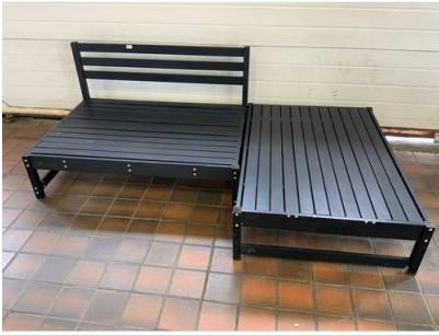
45. V - LARGE GARDEN DAYBED (NO CUSHIONS)