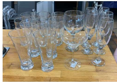
151. M - 17 NEW DRINKING GLASSES