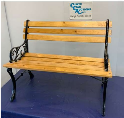
54. M - 3FT GARDEN BENCH - 2 SEATER