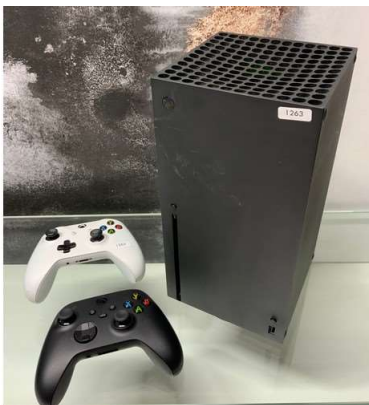
76C. M - XBOX SERIES X MODEL 1882 - D.O.M.18.03.2021 PRODUCT ID 14846531075403211217 & TWO X BOX WIRELESS CONTROLLERS (NO CABLES)- RRP £559 (7.P22163941 )

Samsung UE55AU7100 55" 4K HDR UHD Smart LED TV HDR10+ Q-Symphony Lite