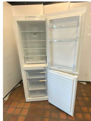
169. M - BOSCH 'NO FROST' FRIDGE FREEZER MODEL KGN34NW3AG - COST £529