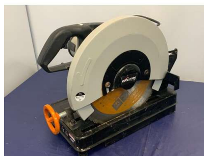
114. M - EVOLUTION 355mm MUTLI PURPOSE CUT OFF SAW - COST NEW £219