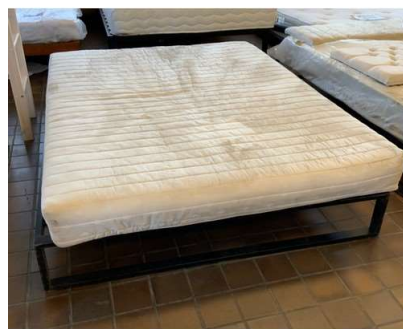
21. V - NEW KINGSIZE WICKFORD PLATFORM BED 104.99 & ASPIRE COOL TOUCH KING SIZER MATTRESS RRP £120