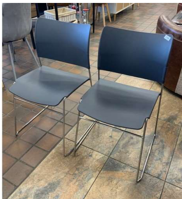
9. M - SET OF 2 PLASTIC GREY CHAIRS WITH METAL FRAMES