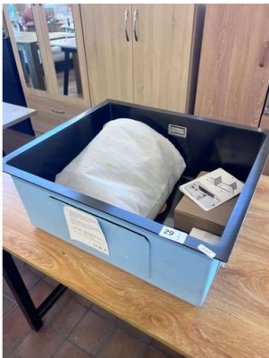
126. V - KORVO GUN METAL KITCHEN SINK WITH ATTACHMENTS RRP £249