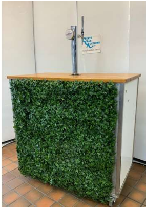
148. M - MOBILE BAR WITH BEER PUMP - COST £600