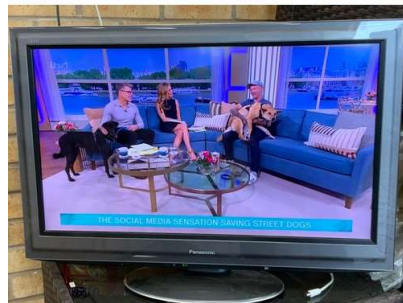
75. M - PANASONIC 32" LCD TV MODEL - TXL32D25BA RRP £269