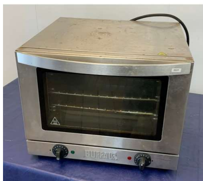
93. M - BUFFALO SS CONVECTION OVEN MODEL DA957 - COST WHEN NEW £375