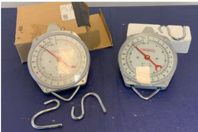
124. M - 2 X WEIGH STATION WEIGHING SCALES RRP £30 EACH