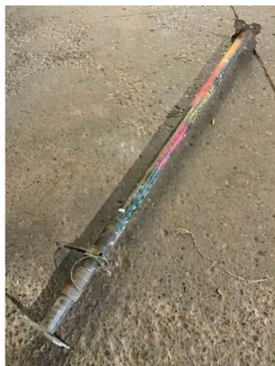
179. V - ACRO PROP

LOADS UP TO 300KG - COST WHEN NEW £4000 - RAMPS COST WHEN NEW £1000+