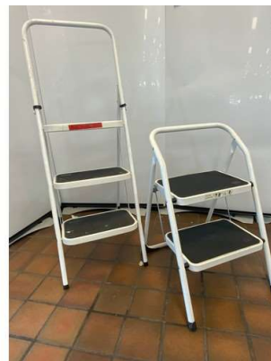
170. M - 2 & 3 TREAD KITCHEN STEP LADDERS