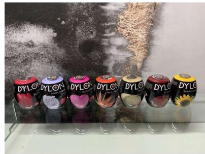
136. M - NEW 7 X ASSORTED DYLO ALL IN ONE 350G POTS TOTAL RRP £69.93