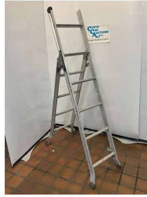
175. M - STAIR LADDER