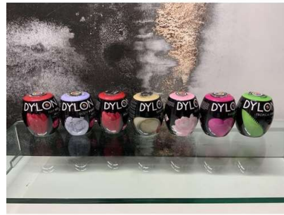
135. M - NEW 7 X ASSORTED DYLO ALL IN ONE 350G POTS TOTAL RRP £69.93