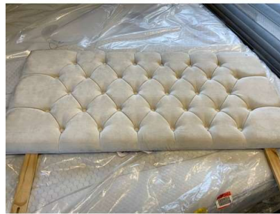
19. V - CREAM VELVET BUTTON BACKED HEADBOARD DOUBLE RRP £79