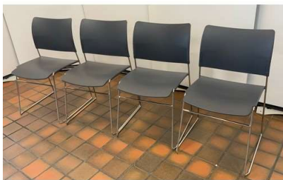
8. M - SET OF 4 PLASTIC GREY CHAIRS WITH METAL FRAMES