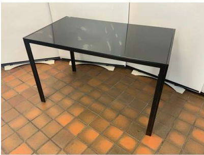
23. V - TEMPERED GLASS TOP DINING TABLE RRP £84.99