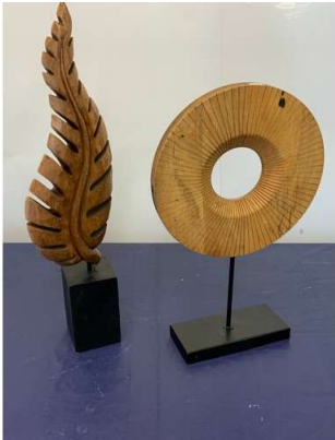
70. M - 2 X NATURAL WOODEN SCUPLTURES