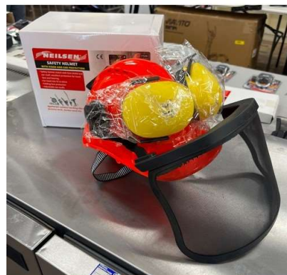
60. V - NEILSEN SAFETY HELMET WITH VISOR AND EAR PROTECTION (CT5290)