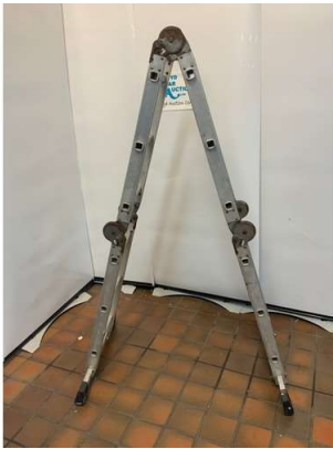
173. M - FOLDING MULTI LADDER