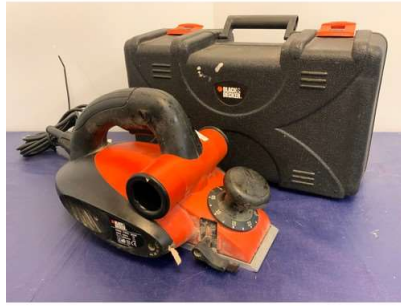
119. M - BLACK & DECKER KW82 PLANER IN BOX - 900W RRP £74.98