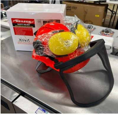
61. V - NEILSEN SAFETY HELMET WITH VISOR AND EAR PROTECTION (CT5290)