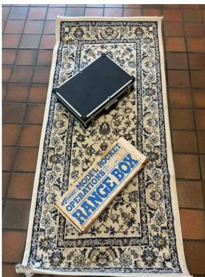
102. M - ESTES 'THE ALPHA' MODEL ROCKET BOX SET, STORAGE CASE & ORIENTAL RUNNER RUG