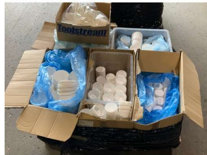
177. M - 1 PALLET ASS NEW TUBS- SMALL MEDIUM, MEDIUM, LARGE & LIDS