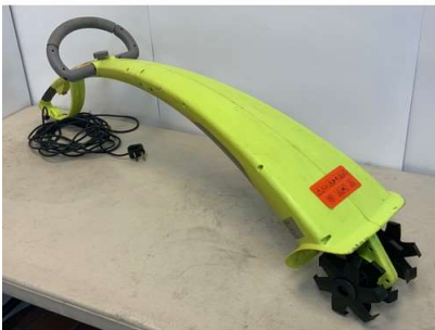
47. M - GEAR GARDEN ELECTRIC TILLER / CULTIVATOR / ROTOVATOR RRRP £74.99