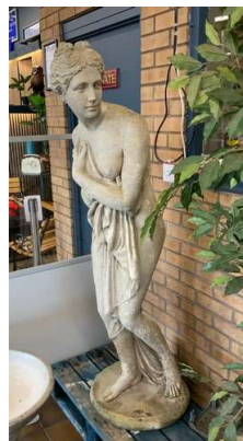
52. M - PANDORA LADY GARDEN STATUE - ONLINE £600+