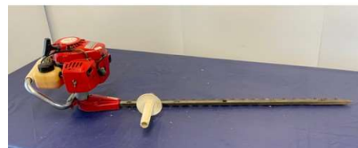
59. M - LITTLE WONDER PETROL HEDGE CUTTER