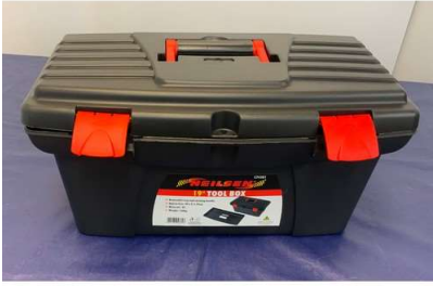
99. V - NEW NEILSON 19" TOOL BOX (CT4381)