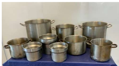
92. M - SS PANS