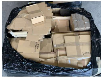
176. M - PALLET OF NEW CARDBOARD BOXES - VARIOUS SIZES - COST NEW £1000