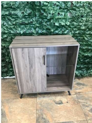
133. V - PERAO SIDEBOARD FURNITURE - RRP 143.99