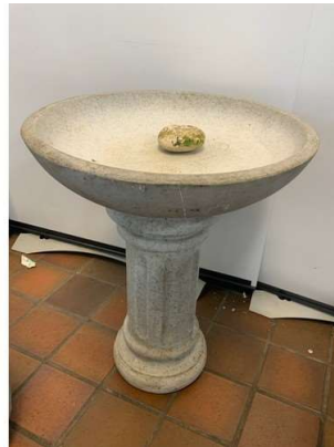
51. M - GARDEN WATER FEATURE