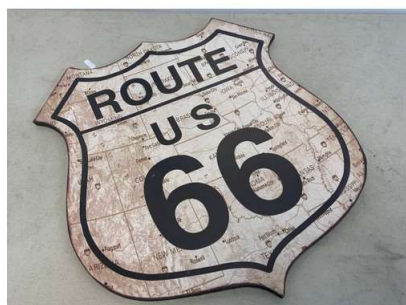
77. M - ROUTE 66 SIGN