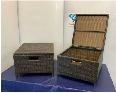
171. M - 2X RATTAN STORAGE BOXES