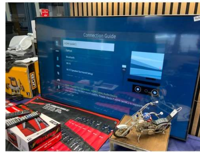
76D. M - SAMSUNG 55" UHD 4K HDR SMART TV 2021