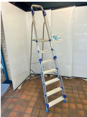
174. M - 6 TREAD ALU STEP LADDDER