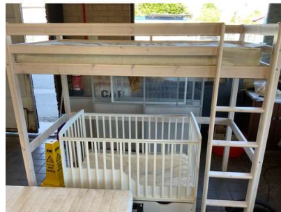
5. V - MACK + MILO LUPER EUROPEAN SINGLE (90 X 200CM) SOLID WOOD HIGH SLEEPER BUNK RRP £669.99