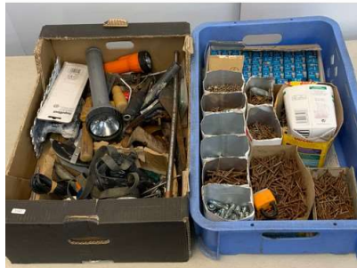
121. M - 2 BOXES NAILS ,BULBS / TOOLS ETC