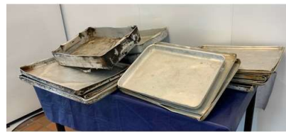
168. M - SS OVEN TRAYS