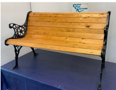
56. M - 3 SEAT - 46" WOODEN GARDEN BENCH