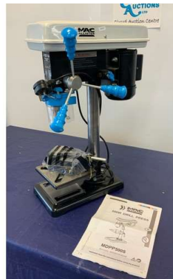
105. M - NEW - MACALLISTER 500W DRILL PRESS - MODEL MDPP500S RRP £90