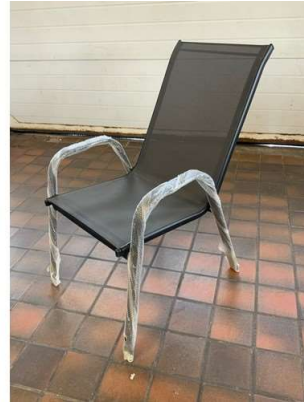
25. V - 1X BLOOMER STACKING CHAIR RRP £126