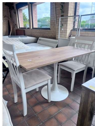
130. V - PAIR OF JULIAN BOWEN COAST DINING CHAIRS RRP £83 & SINGLE PEDESTAL TABLE