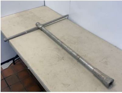
115. M - WATER STAND PIPE KEY