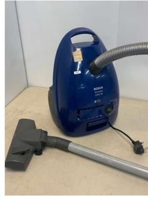
57. M - BOSCHTERROSSA 2000W CYLINDER VAX RRP £70