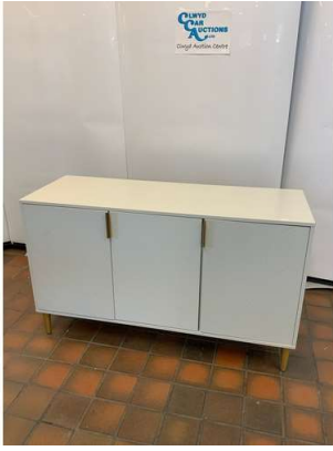
139. V - MILLY LARGE 3 DOOR SIDBOARD - GREY & BRASS EFFECT RRP £159.95