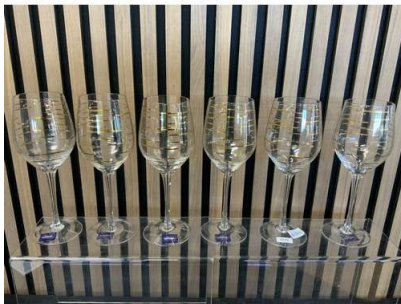
149. M - SET OF 6 MIKASA GOLD COLOURED GLASSES TOTAL £59.94