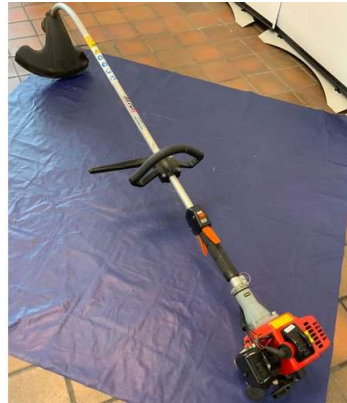
120. V - MITOX 250cc PETROL STRIMMER - COST NEW £189