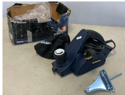
112. M - WICKES PERFORMANCE 730W PLANER RRP £45