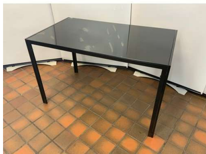
31. V - TEMPERED GLASS TOP DINING TABLE RRP £84.99