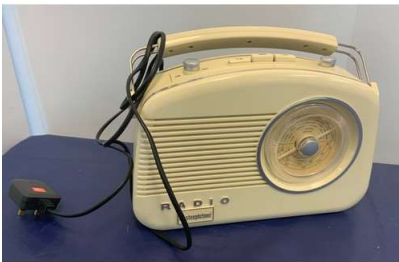
62. M - STEEPLETONE RADIO BATTERY & MAINS OPERATED RRP £49.99