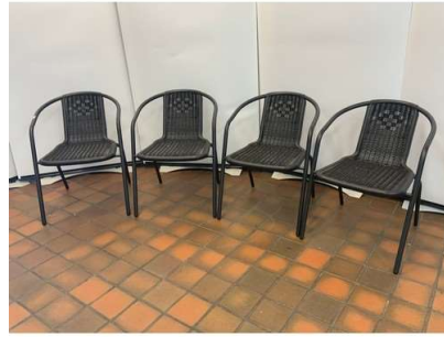
49. V - GISBELLE STACKING PATIO CHAIRS - SET OF 4 - RRP £143.98