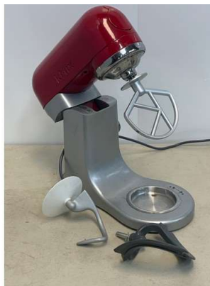
97. M - KENWOOD K-MIX ELEC FOOD MIXER RRP £250-£329