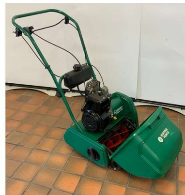
28. V - SUFFOLK PUNCH 145 SP CYLINDER PETROL LAWN MOWER