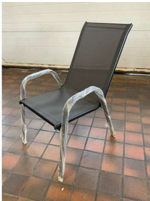
39. V - 1X BLOOMER STACKING CHAIR RRP £120