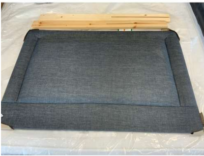
22A. V - CHARCOAL UPHOLSTERED SINGLE HEADBORAD RRP £63.99