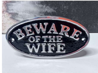
74. V - BEWARE OF THE WIFE - POLISHED ALUMINIUM SIGN