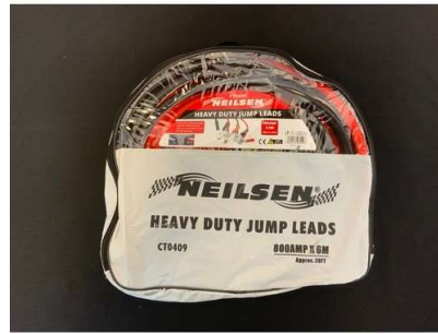
65. V - NEW NEILSEN 800 AMP HD JUMP LEADS 3M (CT0408)