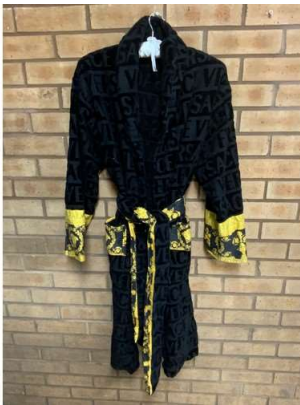
76B. M - VERSACE BAROQUE BLACK BATH ROBE - USED - COST WHEN NEW £370 (4.P22163952/5.P22163976)