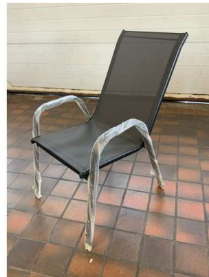
27. V - 1X BLOOMER STACKING CHAIR RRP £126