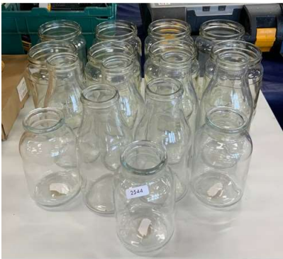
140. M - 17 NEW GLASS JARS / BOTTLES