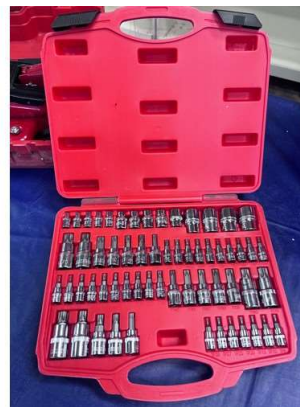
67. V - NEW NEILSEN 60 PIECE MASTER STAR SOCKET SET (CT4513)