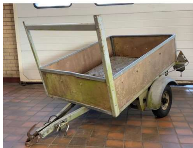
183. M - TRAILER WITH DROP BACK 41" x 55"