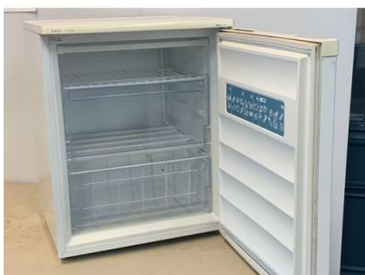
3. M - LEC SMALL UNDERCOUNTER FREEZER MODEL U250WS