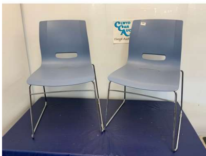
166. M - SET 2 PLASTIC BLUE CHAIRS WITH METAL FRAME