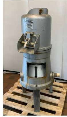
167. M - HOBART 3 PHASE POTATO RUMBLER - COST NEW £5600+