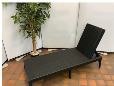
36. V - GEORGE OLIVER MICKLESON 186CM LONG RECLINING SINGLE LOUNGER: BLACK RRP £99.99