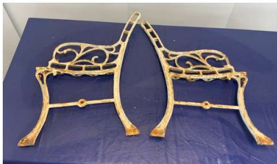
2. M - 1 X PAIR CAST IRON BENCH ENDS - WHITE