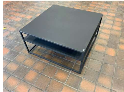
58. V - PETILLO COFFEE TABLE RRP £249.99