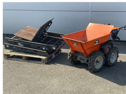
178. M - BELLE BMD 300 4X4 PEDESTRIAN MINI DUMPER COMPLETE WITH SKIP RAMP & ATTACHMENT - PETROL HONDA 5.5HP ENGINE - IT CAN HANDLE