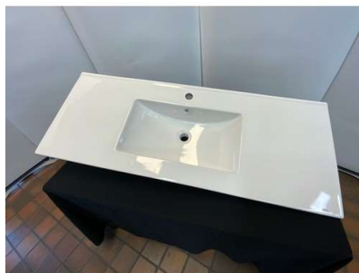
122. V - COUNTER TOP WASH BASIN RRP £279 48 INCH X 18 INCH X 7INCH