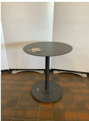
63. V - KETTLER LIGHTWEIGHT ALUMINIUM OUTDOOR TABLE RRP £149