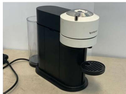
106. M - NESPRESSO DEL'LONGHI VERTUO PLUS COFFEE MACHINE RRP £89