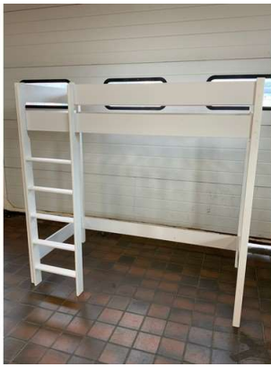
7. V - MACK + MILO ALLENSIDE SHEPARD BED FRAME 160cm x 80cm RRP £253.36