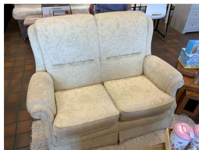
6. M - 2 SEATER CREAM SOFA - PRELOVED