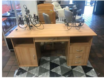
143. V - BOYSEN DESK RRP 204.99