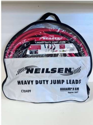
132. V - NEW NEILSEN 800 AMP HD JUMP LEADS 6M