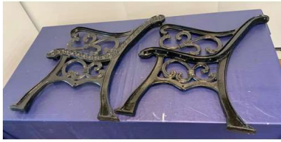
1. M - 1 X PAIR CAST IRON BENCH ENDS - BLACK