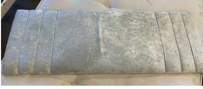
22. V - DOUBLE GREY VELOUR HEADBOARD RRP £75