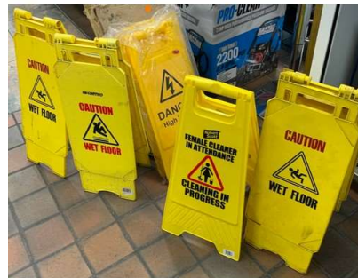
104. M - 11x CAUTION FLOOR SIGNS