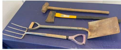
4. M - SET OF 4 TOOLS - SLEDGE HAMMER / GARDEN FORK / 4.5LB AXE / SHOVEL