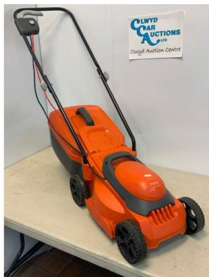
30. M - FLYMO SIMPLE COMPACT 300 ELECTRIC MOWER RRP £84.99