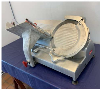
95. M - BERKEL PROFESSIONAL SS MEAT SLICER MODEL RP-M361CE - COST WHEN NEW £2000+