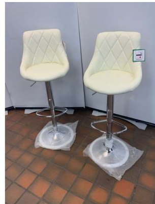
146. V - PAIR OF SWIVRL HEIGHT ADJUSTABLE CREAM STOOLS RRP £96.99