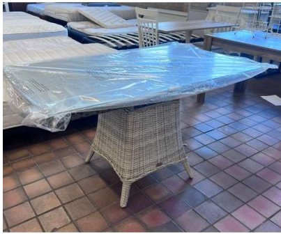
37. V - GARDEN RATTAN TABLE WITH GLASS TOP