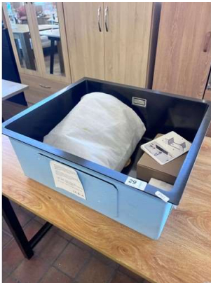
125. V - KORVO GUN METAL KITCHEN SINK WITH ATTACHMENTS RRP £249