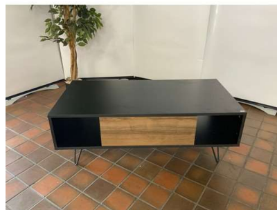
12. V - CALLYVILLE COFFEE TABLE WITH STORAGE RRP £155.99