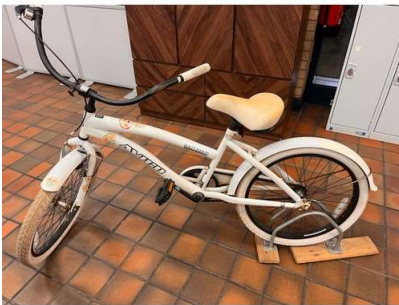
100. M - WESTCOAST AVIGO GIRLS BIKE