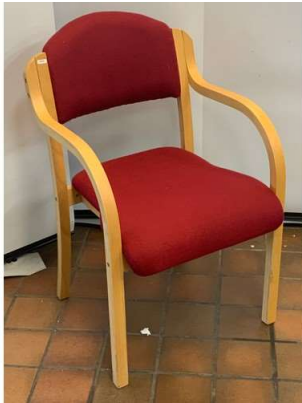
164. M - ZSH STACKABLE CONFERENCE / OFFICE / RECEPTION CHAIR RRP £ 135 EACH