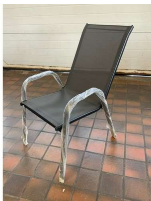
32. V - 1X BLOOMER STACKING CHAIR RRP £120