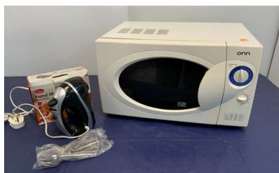
94. M - QUEST HAND MIXER & ONN MICROWAVE - MODEL OMO10