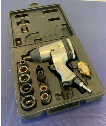
116. M - 1/2 SQ COMPRESSED AIR IMPACT WRENCH & SOCKETS IN CASE RRP £80