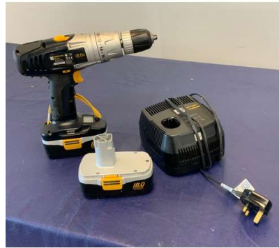
111. M - PRO HAMMER DRILL 18V MODEL CLM18VHD PLUS 2 BATTERIES & CHARGER