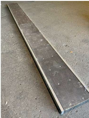
150. V - 16FT YOUNGMAN BOARD