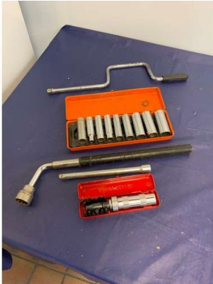
62. M - DRAPER EXTRA LONG SOCKETS & EXTENSION BARS, BREAKER BAR / TIRE IRON, IMPACT DRIVER SET