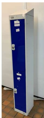
154C. M - 2 CUPBOARD STEEL STAND ALONE LOCKER - COST £213 WHEN NEW