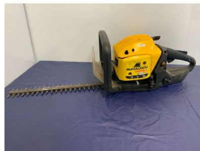
139. M - MCCULLOCH VIRGINIA PETROL HEDGE TRIMMER (MH542P)