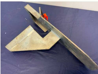
19. V - STRONG BOY