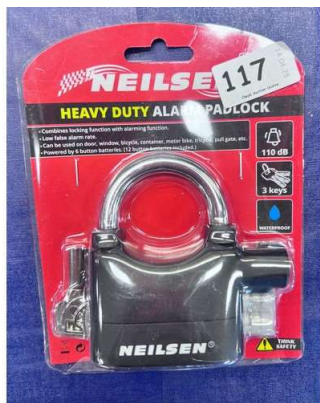
109. V - NEW NEILSEN HEAVY DUTY ALARM PADLOCK (CT3870)