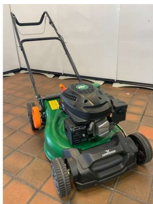
112. M - HAWKSMOOR HAND PUSH PETROL LAWNMOWER NO COLLECTION BOX 75784(XSS46F)