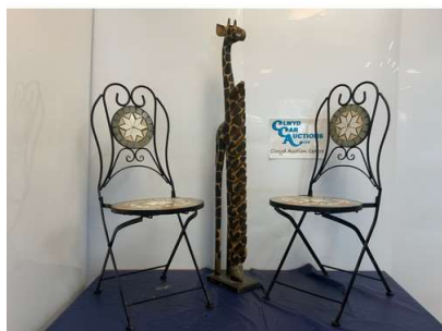
46. M - 2X BISTRO MOSAIC CHAIRS + WODEN GIRAFFE CD STAND