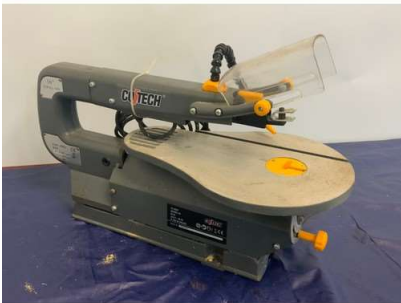
70. M - 240V COLTECH 16" SCROLL SAW 160912158