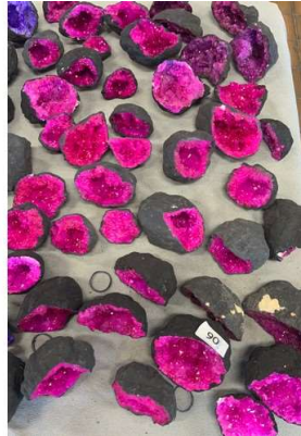
90. M - 2 BOXES OF PINK CRYSTAL ROCKS