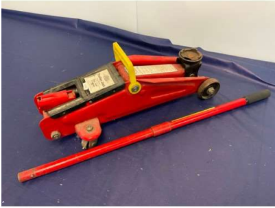
77. M - KING CRAFT 2 TONNE TROLLEY JACK MODEL ZQ20001