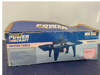
7. M - POWER CRAFT ROUTER TABLE IN BOX PC3163/08