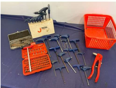
126. M - 2 x SETS JTEC HEX & STAR KEYS