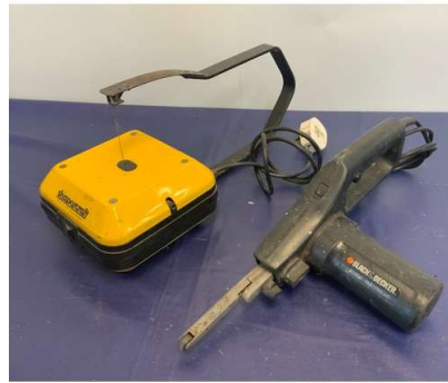
73. M - SHARPERCRAFT HOT WIRE FOAM / CRAFT CUTTER & BLACK & DECKER BD282E ELECTRONIC POWERFILE SANDER