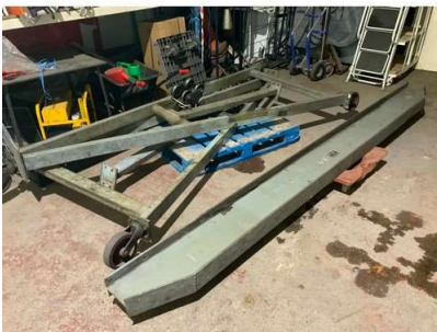
155. M - FELCO 2 TON PORTAL GANTRY WITH BLOCK & TACKLE - 3.4M TALL X 3.4M WIDTH.