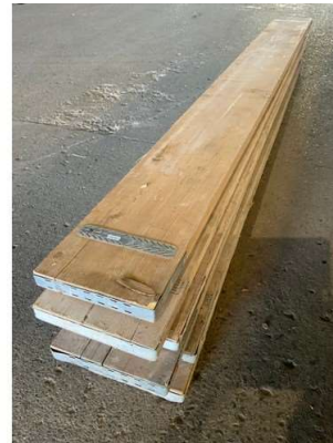
153. V - 8 X 8FT SCAFFOLD BOARDS