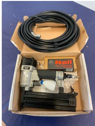
87. M - 18 GAUGE PNEUMATIC NAILER IN BOX RRP £54