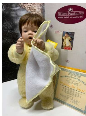
48B. M - THE ASHTON DRAKE GALLERIES PORCELAIN DOLL IN BOX - 'MOMMY IM SLEEPY' - NO TH2326' WITH COA