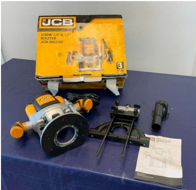
125. M - NEW - JCB 2100W 1/4" & 1/2" ROUTER - MODEL JCB - RO2100