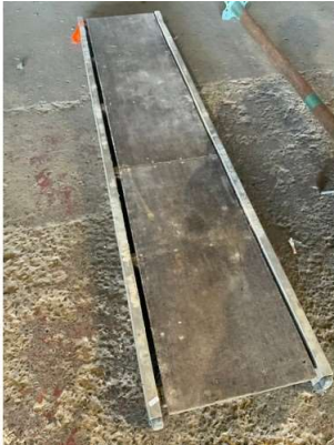
149. V - 6FT YOUNGMAN BOARD