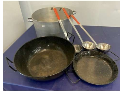
57. M - LARGE S/S PAN,WOK & LADLES