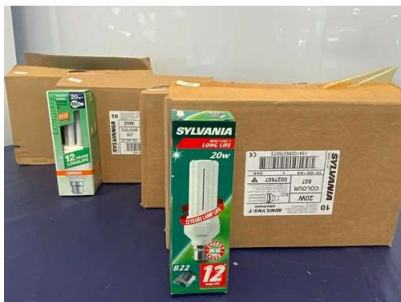
12. M - 40 X LOW ENERGY LIGHT BULBS BAYONETT