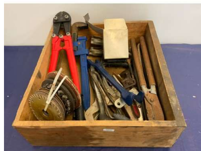
76. M - BOX ASS TOOLS