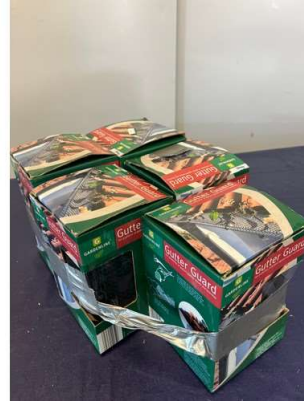
5. M - 5X GARDENLINE GUTTER GUARDS RRP £20 PER BOX