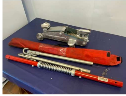
128. M - TROLLEY JACK & RIDGED TOWING BAR