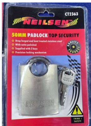
95. V - NEW NEILSEN TOP SECURITY 50MM PADLOCK (CT2363)