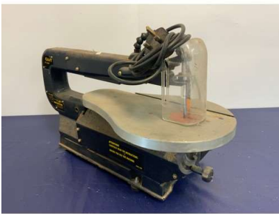
86. M - POWERCRAFT PFZ-400R SCROLL MITRE SAW 240V