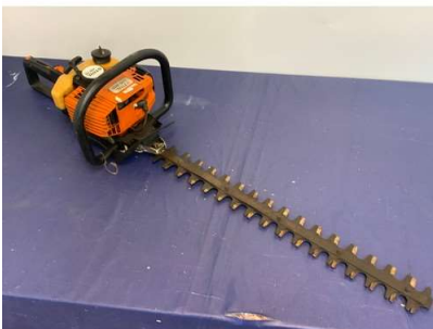
103. V - STIHL HS80 PETROL STRAIGHT SHAFT HEDGE TRIMMER