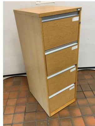
34. M - 4 DRAWER OAK EFFECT FILING CABINET