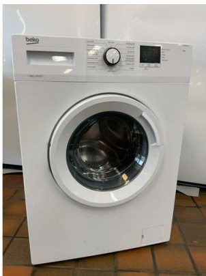
31. M - BEKO 1200RPM WASHING MACHINE (WTK62041W)