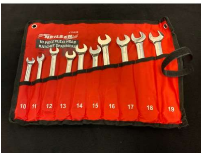
104. V - NEW NEILSEN 10PC FLEXI-HEAD COMBINATION RATCHET SPANNER SET CT3229