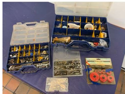
83. M - 3 STORAGE CASES OF NUTS ETC & HOLE SAW SET