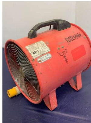
82. V - ELITE 300 110V FUME EXTRACTOR - COST NEW £393