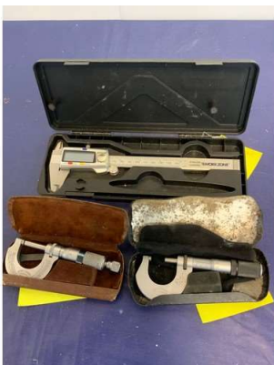
56. M - 2 X MOORE & WRIGHT MICROMETER CALIPERS & WORKZONE VERNIER CALIPER IN BOX