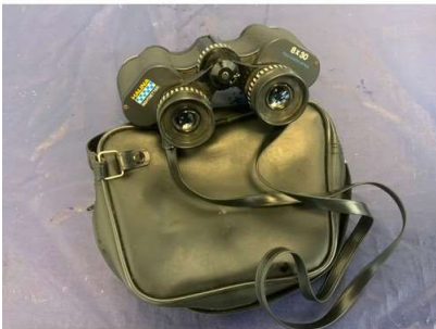
118. M - HALINA 8 X 30 BINOCULARS