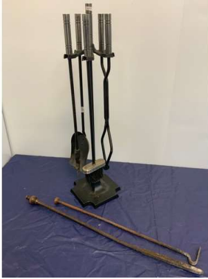
61. M - CAST FIRE IRON SET