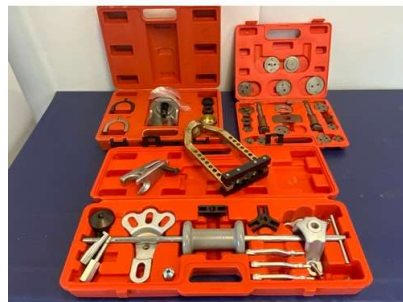
131. M - 3 CASED ENGINEERING KITS - BEARING PULLERS ETC