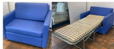
36. M - BUDDY COMMERCIAL GRADE - SEAT SINGLE SOFA BED - COST £1100