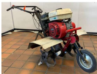
113A. V - MERRY TILLER PETROL ROTOVATOR WITH HONDA GX160 ENGINE