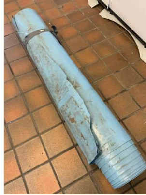
157. M - ROLL OF 1200 GAUGE DPM