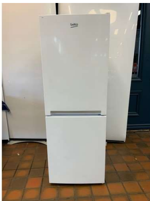
39. M - BEKO FRIDGE FREEZER (CXFG1552W)