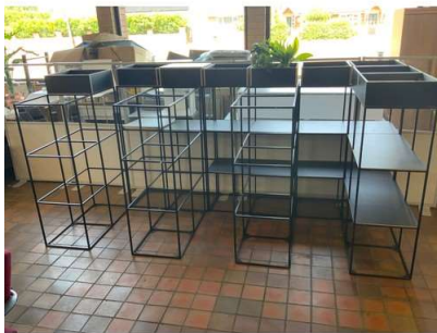
30. M - 7 X SECTIONS OF DISPLAY RACKING