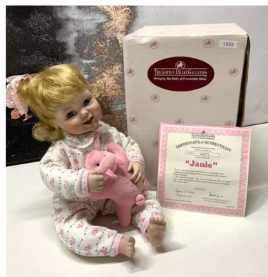
48C. M - THE ASHTON DRAKE GALLERIES PORCELAIN DOLL IN BOX - 'JANIE' - NO M6873' WITH COA