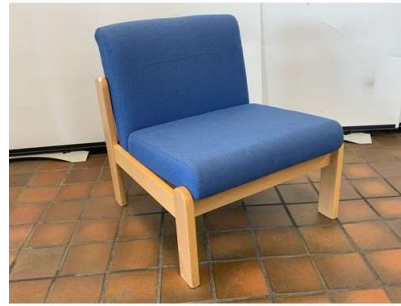
41. M - BLUE RECEPTION CHAIR