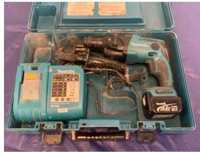
129. M - MAKITA 14.4V CORDLESS HAMMER DRILL BHR162 WITH CHARGER IN BOX