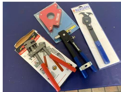
58. M - HOLE PUNCH/RIVET GUN/SEAL PULLER & WELDING MAGNET