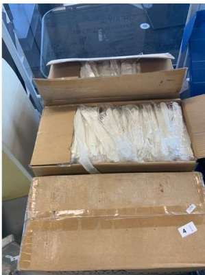
4. M - 3 X BOXES OF DISPOSABLE CUTTLERY SETS