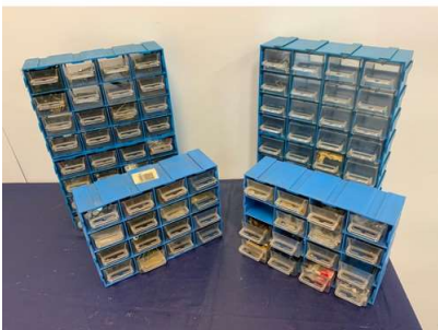
72. M - FOUR STORAGE BOXES OF SCREWS ETC