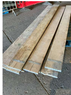
154. V - 9 X 10FT SCAFFOLD BOARDS