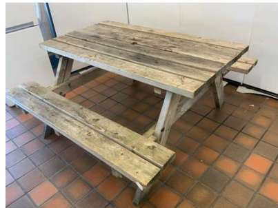
91. M - WOODEN PICNIC BENCH 4FT