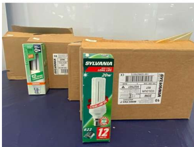
11. M - 40 X LOW ENERGY LIGHT BULBS BAYONETT