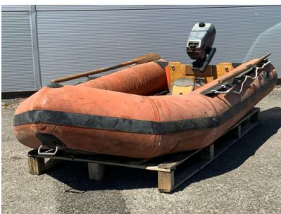
156. M - NOVURANIA POISEDEN 320 INFLATABLE RIB WITH EVINRUDE 4 HP ENGINE AND 4 OARS