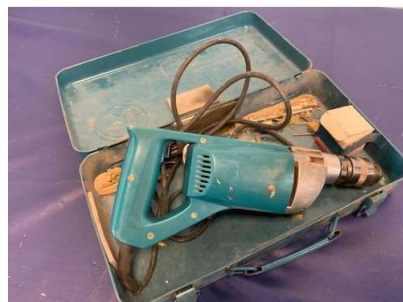
68. M - MAKITA 6806B 6mm TAPPER / HAMMER DRILL