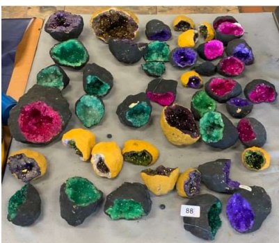
88. M - 1 MIXED COLOUR BOX OF CRYSTAL ROCKS & 1 BOX OF GREEN CRYSTAL ROCKS