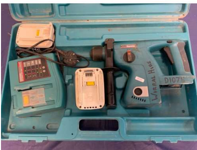
127. V - MAKITA BHR200 24V SDS DRILL