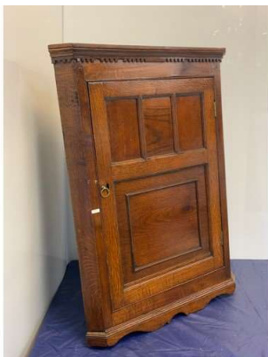
32. M - GEORGIAN OAK CORNER CABINET