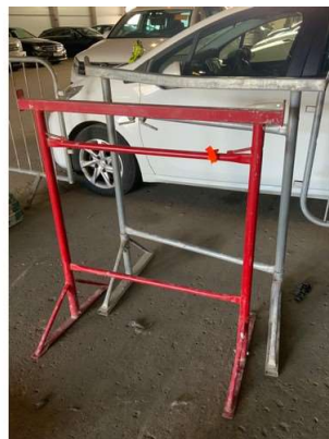
147. V - PR BUILDERS TRESTLES