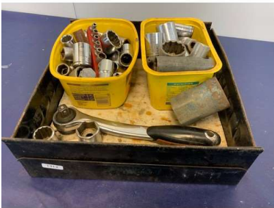
78. M - BOX OF ASS SOCKETS ETC