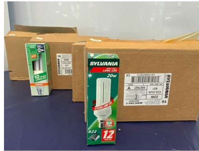
13. M - 40 X LOW ENERGY LIGHT BULBS BAYONETT