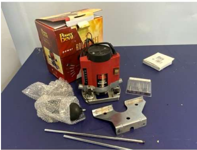
141. M - POWER DEVIL 240V ROUTER