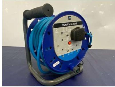
81. M - WORKPOWER 25M 4 GANG CABLE REEL - COST NEW £35