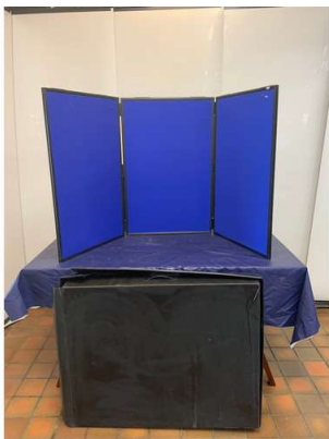
40. M - DOUBLE SIDED 3 PANE PUSH PIN BOARD IN BOX