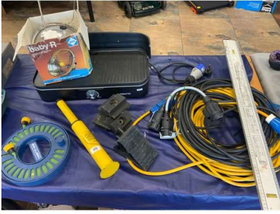
85. M - ASS CARAVAN ACCESSORIES- PORTABLE BBQ, EXTENSION CABLES, SPIRIT LEVEL, HOSE REEL HEAT LAMP ETC