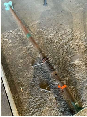
148. V - ACROP PROP