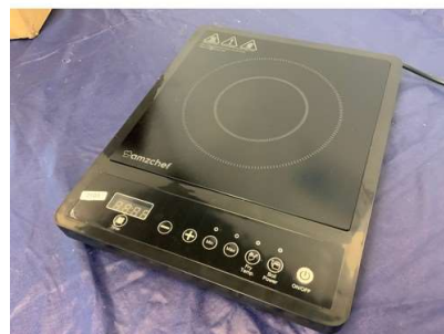
60. M - AMAZE CHEF SINGLE INDUCTION COOKER IN BOX 240V