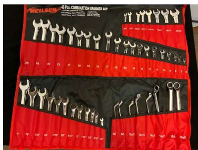
115. V - NEW NEILSON SPANNER SET 48PC SATIN FINISH CT0876