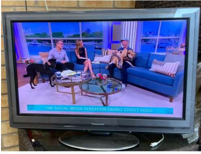
116. M - PANASONIC 32" LCD TV MODEL - TXL32D25BA RRP £269