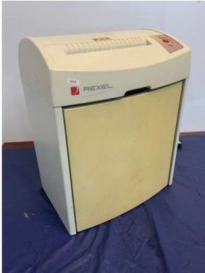
2. M - REXEL PAPER SHREDDER 220-240V A370414