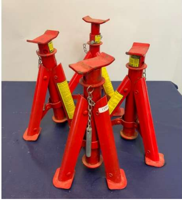
69. M - SET OF 4 KING CRAFT AXLE STANDS