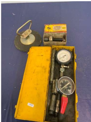
79. M - VINTAGE COMPRESSION TESTER, STEERING BALL JOINT PULLER & DENT PULLER TOOL