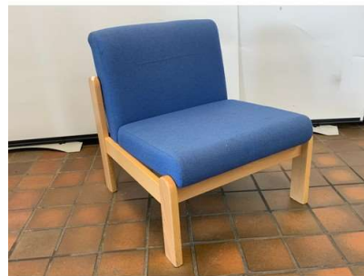
42. M - BLUE RECEPTION CHAIR