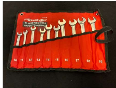
106. V - NEW NEILSEN 10PC FLEXI-HEAD COMBINATION RATCHET SPANNER SET CT3229