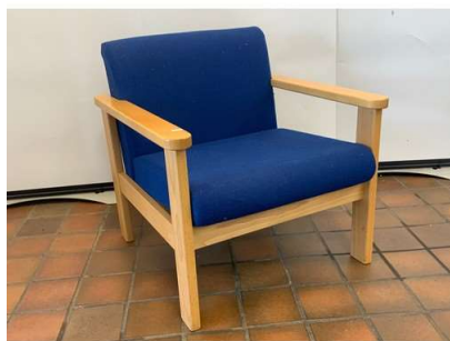
45. M - BLUE RECEPTION CHAIR WITH ARMS