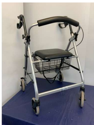
48. M - DAYS 252 LIGHTWEIGHT ROLLATOR MOBILITY AID WITH BASKET RRP £95