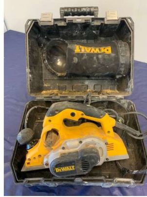
136. M - DEWALT 240V 8CM ELEC PLANER (D26500 TYPE 1)