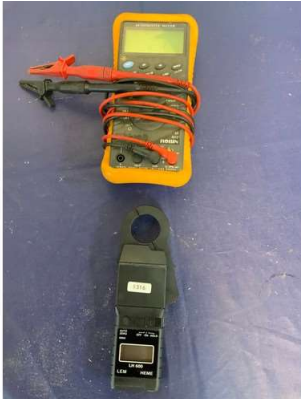
54. M - ROBIN AR40R DIGITAL MICROMETER & LEM LH 600 CLAMP METER