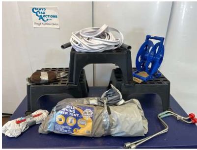
1. M - ASSORTMENT OF CARAVAN ACCESSORIES