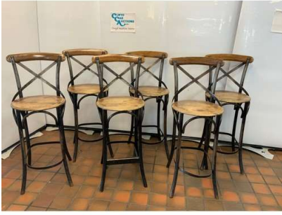
132. M - SET OF 6 RUSTIC METAL BAR STOOLS