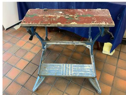
146. M - B&D WORKMATE