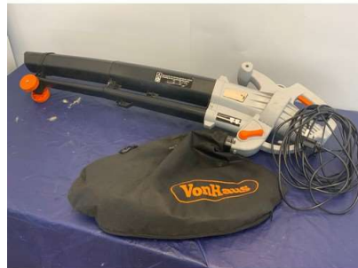
67. M - VONHAUS ELECTRIC GARDEN VAC 240V 2500105