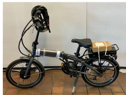
160. M - APOLLO L200 ELECTRIC BIKE , HELMET & CHARGER