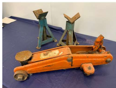
74. M - TOLLEY JACK & 2 X AXLE STANDS