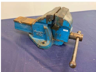
94. M - HEAVY DUTY VINTAGE NO 5 BENCH VICE