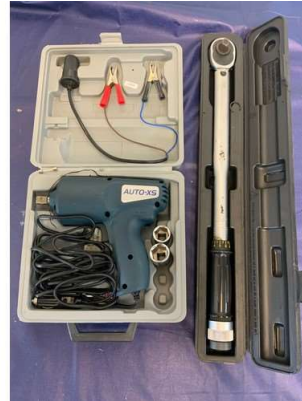
66. M - AUTO XS IMPACT WRENCH KIT & STURTEVANT RICHMONT 3SDR TORQUE WRENCH