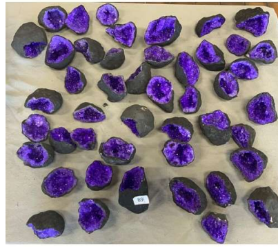
89. M - 2 BOXES OF PURPLE CRYSTAL ROCKS