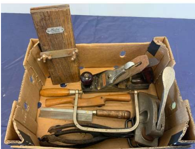
80. M - BOX OF EARLY WOOD WORKING TOOLS