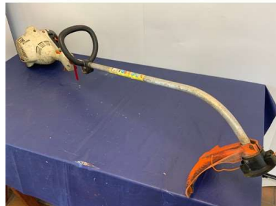
130. V - STIHL PETROL STRIMMER