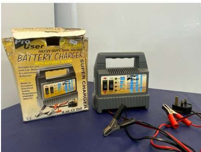
64. M - 8 AMP BATTERY CHARGER (6 OR 12V)