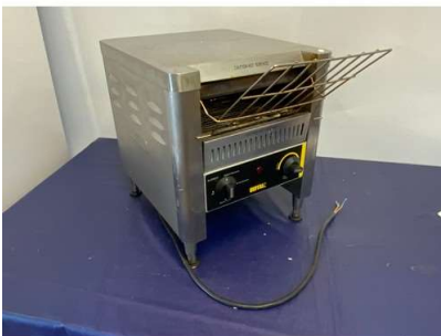
55. M - S/S BUFFALO DOUBLE SLICE CONVEYOR TOASTER