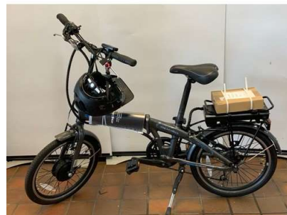
159. M - APOLLO L200 ELECTRIC BIKE , HELMET & CHARGER