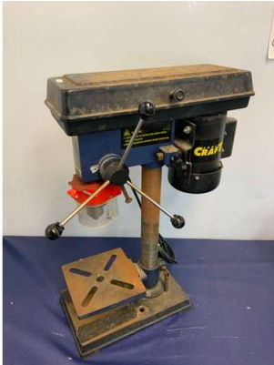
133. M - POWERCRAFT BENCH 500W PILLAR DRILL