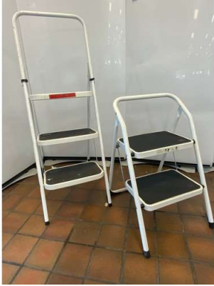
9. M - 2 & 3 TREAD KITCHEN STEP LADDERS