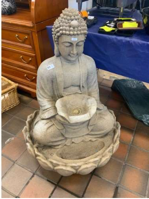
53. M - LARGE BUDDHA WATER FEATURE