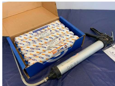
75. V - DRYZONE DP 81 DRY ZONE GUN - RRP £63.99 & BOX OF DRY ZONE CREAM (10 PACK PER BOX) RRP £194 PER BOX