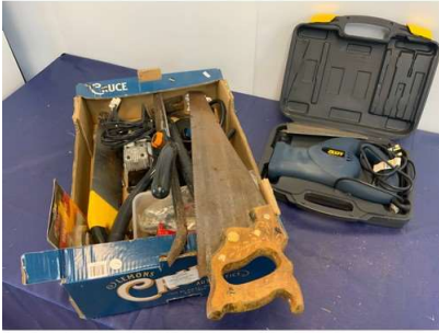
17. M - SUNDRY BOX OF TOOLS ETC