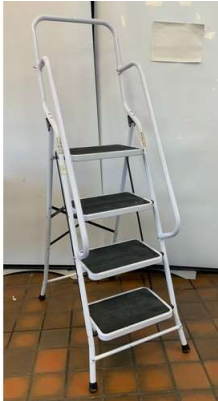
10. M - 4 TRED FOLDABLE STEP LADDERS WITH HANDLES