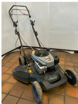
113. V - VICTA MASTER MULCHMASTER 560 MOWER WITH BRIGGS & STRATTON ENGINE