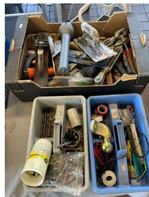
8. M - 3 SUNDRY BOXES