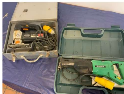
84. M - ELECTRONIC AEG 110V HIG SAW & HITACHI 110V RECIPROCATING SAW