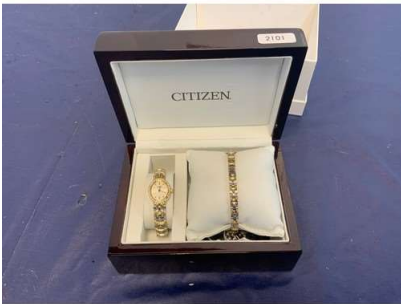
117. M - CITIZEN WATCH WITH CLASP BRACELET IN BOX EK5704 61A