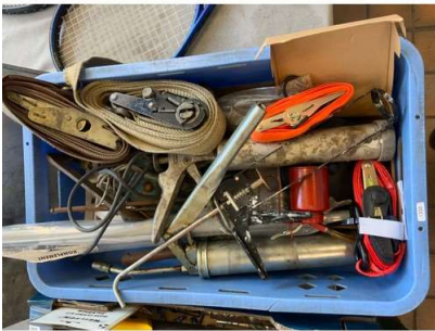
18. M - SUNDRY BOX OF TOOLS