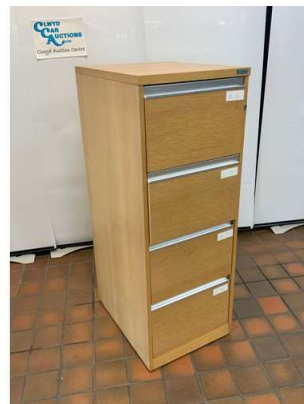
35. M - 4 DRAWER OAK EFFECT FILING CABINET