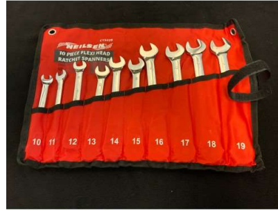
105. V - NEW NEILSEN 10PC FLEXI-HEAD COMBINATION RATCHET SPANNER SET CT3229