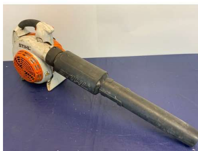
98. V - STIHL BG66C PETROL BLOWER