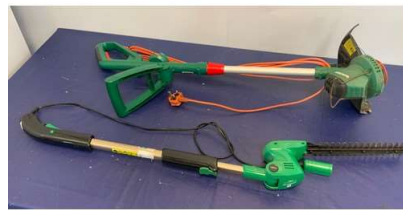
145. M - GARDENLINE CORDLESS HEDGE CUTTER & QUALCAST ELECTRIC TRIMMER