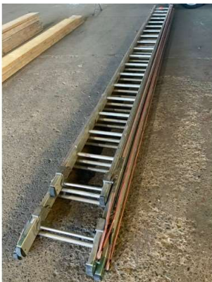
151. V - 16FT TRIPLE ALU ROPE LADDER