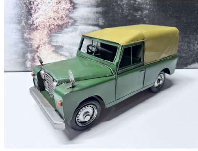
120. V - RETRO 4X4 GREEN JEEP MODEL VEHICLE