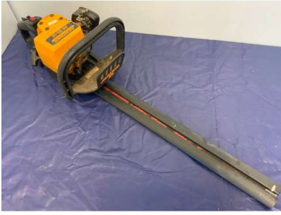
140. M - PARTNER MG55-12 PET HEDGE CUTTER