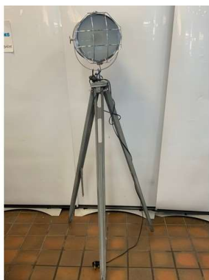
47. M - STUDIO LIGHT