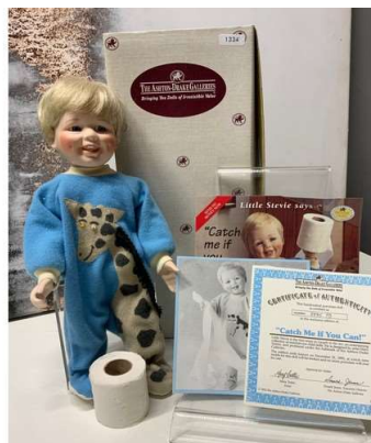
48A. M - THE ASHTON DRAKE GALLERIES PORCELAIN DOLL IN BOX - 'CATCH ME IF YOU CAN' - NO 28895 7B' WITH COA