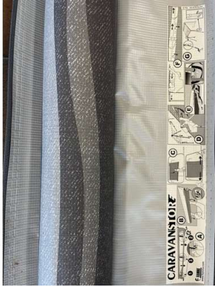
37. M - FIAMMA CARAVANSTORE ROLL OUT CANOPY - 11FT (3.5 METER) AWNING - COST NEW £286