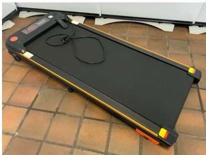
93. M - IC WALKING PAD TREADMILL RRP £105.99