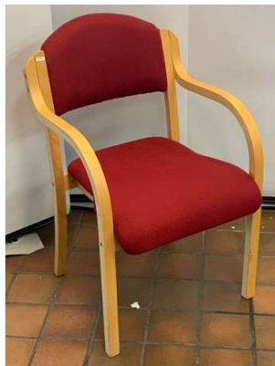
29. M - ZSH STACKABLE CONFERENCE / OFFICE / RECEPTION CHAIR RRP £ 135 EACH