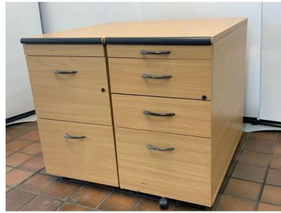
33. M - 2 UNDER DESK BEECH EFFECT DRAWER PEDESTALS