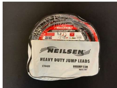
122. V - NEW NEILSEN 800 AMP HD JUMP LEADS 3M (CT0408)