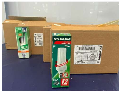
14. M - 40 X LOW ENERGY LIGHT BULBS BAYONETT