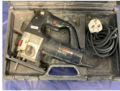
65. M - AEG 240V JIGSAW (BSP100X)