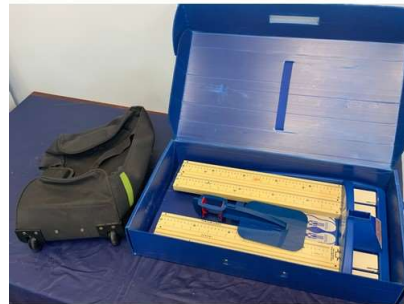
6. M - LEICESTER HEIGHT MEASURE IN BOX & TRAVEL BAG