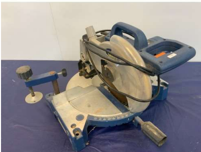
63. M - POWERCRAFT MITRE SAW