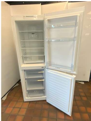
38. M - BOSCH 'NO FROST' FRIDGE FREEZER MODEL KGN34NW3AG - COST £529