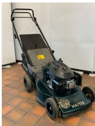
111. V - HAYTER SP PETROL LAWN MOWER