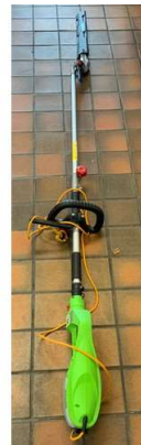
138. M - FLORABEST LONG REACH PETROL HEDGE CUTTER (FHL900D4)