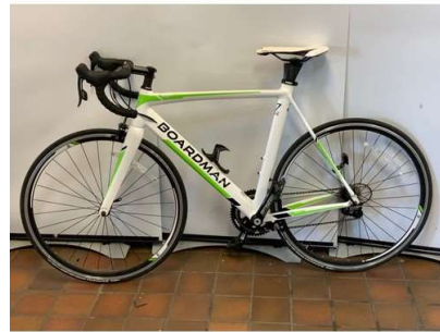
158. M - BOARDMAN TEAM TT ROAD BIKE LARG FRAME 58, 2011-2020 MODEL WHITE RRP USED PRICE £500