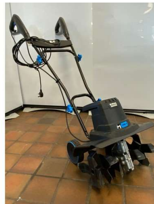
92. M - MACALLISTER 1400W MTIP1400-2 TILLER RRP £105.99