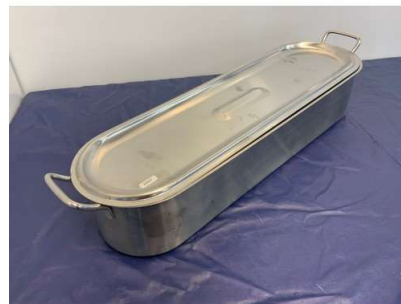
59. M - S/S FISH POACHER