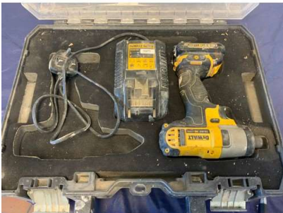
134. M - DEWALT 10V CORDLESS TEC GUN WITH CHARGER (DCF815)