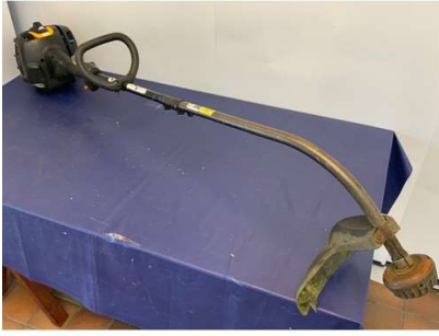
124. V - McCULLOCH T26CS 750W PETROL BRUSH CUTTER