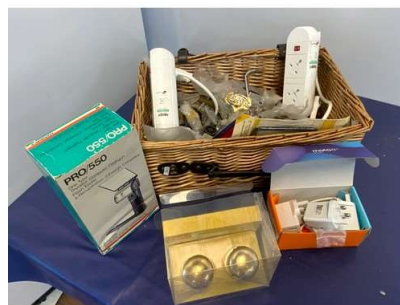
16. M - SUNDRY BASKET DOOR/DRAWER FURNITURE & PHOTO FLASH GUN ETC