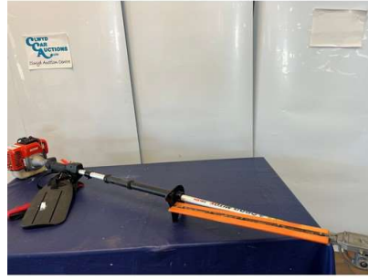
144. M - MITOX 28LH LONG REACH PETROL HEDGE CUTTER RRP £279