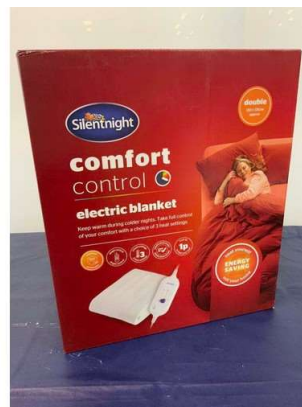
109. M - SILENTNIGHT COMFORT CONTROL ELECTRIC BLANKET DOUBLE RRP £27 ( P24270109 / C )