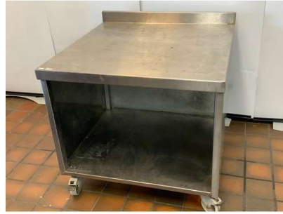
21. M - S/S WALL CUPBOARD 34"D x 34"W x 31"H