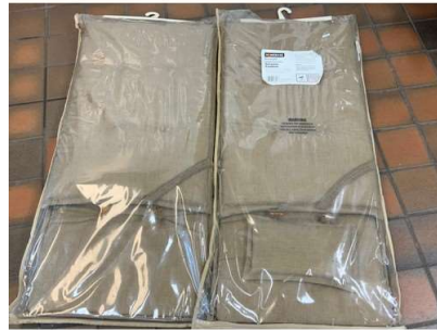
177. M - 2 HOMEBASE PREMIUM STEAMER CUSHIONS CAPPUCINO (NEW) RRP £46 EACH