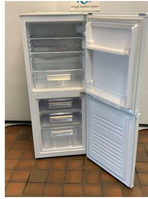
13. M - CURRYS ESSENTIALS FRIDGE FREEZER MODEL CE55CW18