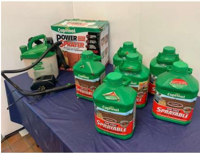
57. M - CUPRINOL 12V CORDLESS FENCE SPRAYER RRP £30 & 6 5L TUBS OF AUTUMN BROWN SPRAYABLE TIMBER PRESERVE £22 EACH TOTAL RRP £162