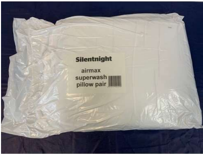
96. M - SILENTNIGHT AIRMAX SUPERWASH PILLOWS PAIR RRP £19.99 ( P24270109 / C )