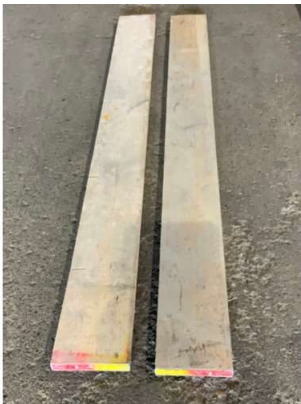
190. V - 2X 8FT SCAFF BOARDS