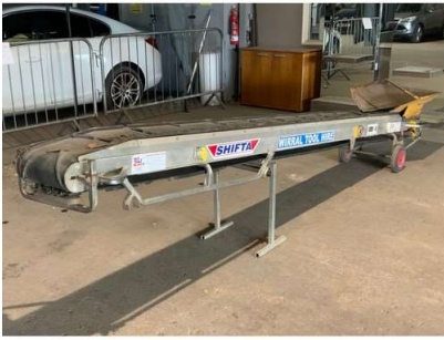
196. V - MACE SHIFTA 4M PORTABLE CONVEYOR 110V