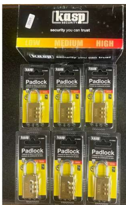
151. M - BOX OF 6 KASP PADLOCKS K11030C RRP 17.50 FOR 1 TOTAL RRP £105