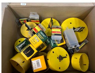
39. M - CK ELECTRICAL ASSORTED HOLE SAWS TOTAL RRP £392.51