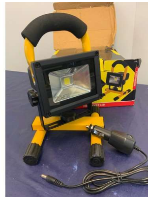
78. M - CK 10W LED FLOOD LIGHT