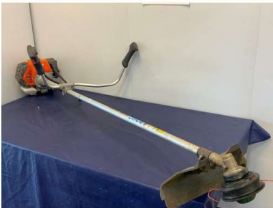
50. V - OLEOMAC BCH 400 T PETROL BRUSH CUTTER - COST NEW £417