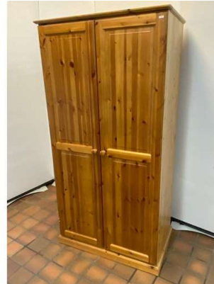
14. M - PINE DOUBLE WARDROBE