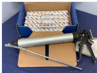
47. V - DRYZONE DAMP PROOF GUN RRP £63.99 + 5 TUBES OF DAMP PROOF CREAM RRPP £100 = TOTAL RRP £163.99