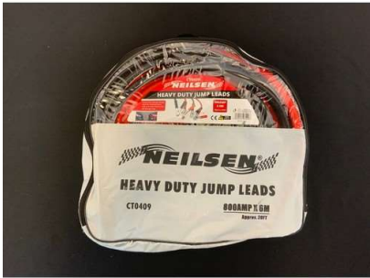
145. V - NEW NEILSEN 800 AMP HD JUMP LEADS 3M (CT0408)