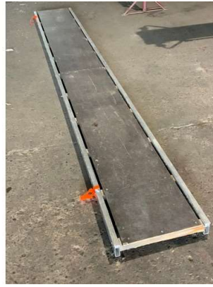
192. V - 12FT YOUNGMAN BOARD