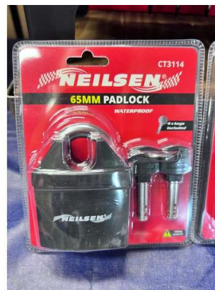
162. V - NEW NEILSEN 65mm WATERPROOF PADLOCK WITH 4 KEYS - CT3114