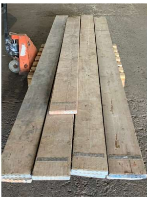
191. V - 8X 12FT SCAFFOLD BOARDS & 1X 10FT