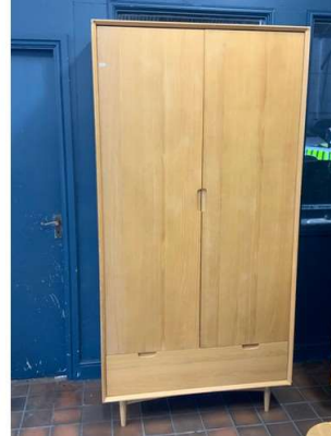
22. M - SOLID OAK GENTS WARDROBE -COST WHEN NEW £1199- Dimensions:

Width: 39 inch Height: 79 inch Depth 22.5 inch