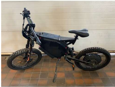
217. M - STEALTH BOMBER ELECTRIC BIKE COST £5000 (SOLD AS SEEN -NO CHARGER)