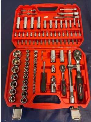
49. M - NEILSEN 94 PCS SOCKET SET