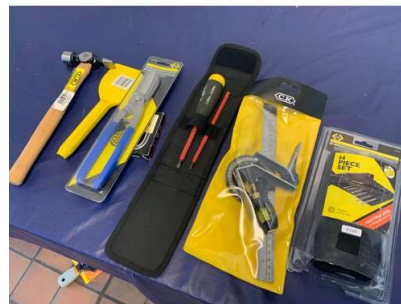
92. M - HAMMER, CHISEL, TIN SNIPS, SCREWDRIVER, COMBI SQUARE & DRILL BIT SET