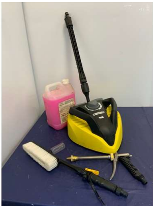
42. M - KARCHER PATIO CLEANER ATTACHMENT RRP £90 & TUB OF CAREFREE FLOOR MAINTAINER RRP £16