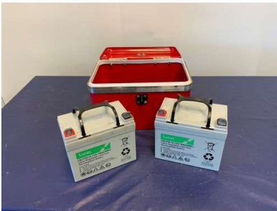
81. M - 2X MOBILITY SCOOTER BATTERY 12V36Ah np36-12 IN METAL BOX