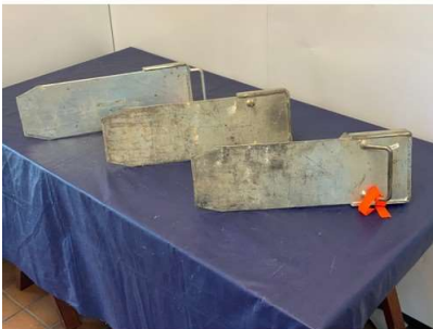
58. V - 3X STRONG BOYS