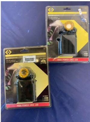
82. M - 2X LED HEAD TORCH