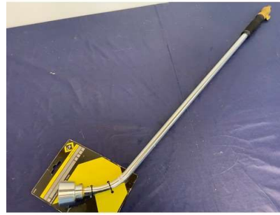
76. M - CK WATERING SYSTEMS ROSE SPRAY 900MM 36" SHOWER HOSE END COST NEW £40.04