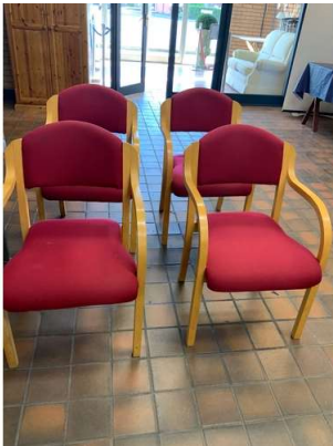
18. M - SET OF 4 RED UPHOLSTERED STACKING RECEPTION CHAIRS