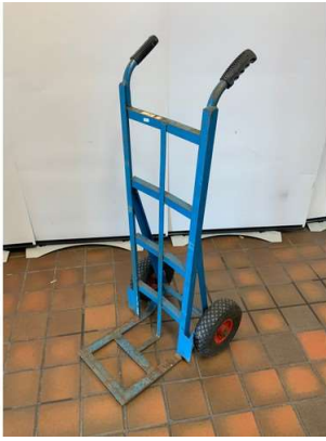
172. M - SACK TROLLEY