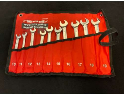
143. V - NEW NEILSEN 10PC FLEXI-HEAD COMBINATION RATCHET SPANNER SET CT3229