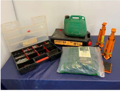
17. M - 2 FUEL CANS/PR AXLE STAND + STORAGE BOX OF NAILS/SCREWS, ABSORBENT MAT (MICROCHEM 4000)