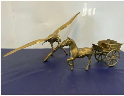
88. M - BRASS EAGLE + HORSE FIGURES