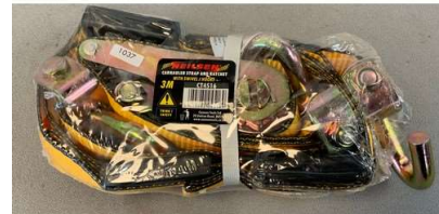
154. V - NEW NEILSON CAR HAULER STRAP & RATCHET 3M WITH SWIVEL 'J' HOOKS (CT4516)