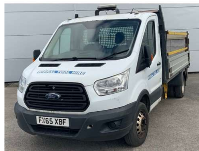
222. V - DIRECT COMPANY - 2015 FORD TRANSIT 350 LWB DROPSIDE PICK UP - REG NO 'FX65XBF' 202,433 MILES. MOT 23.02.2026. LAST OWNER SINCE 2019. WITH TAIL LIFT. 2 KEYS. 2 FORMER KEEPERS. PLUS VAT. CHASSIS NO WFODXTTGDFS14175