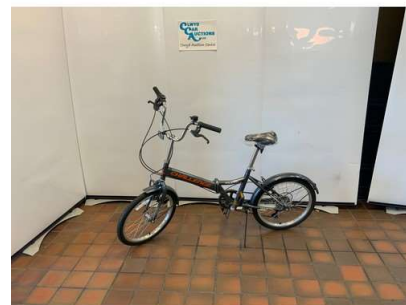
209. M - CHALLENGE HOLBORN FOLD UP BIKE (UNISEX) RRP £235