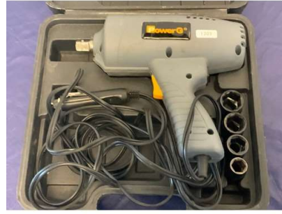
52. M - POWER G 12V IMPACT WRENCH - RRP £70