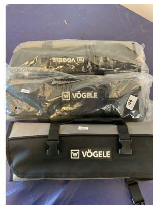
94. M - 3 X VÖGELE TOOL BAGS