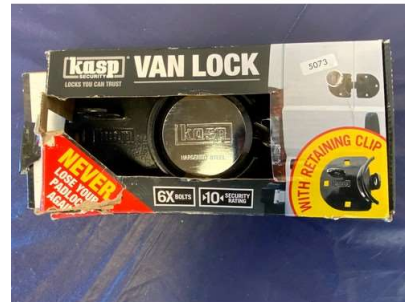
153. M - KASP VAN PADLOCK IN BOX RRP £73.80