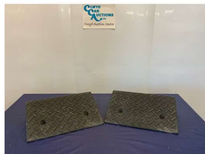
55. M - 2X CURB RAMPS