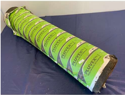
173. M - 8M ROLL OF HESSIAN BASED BITUMEN DAMP ROOF MEMBRANE - RRP £65