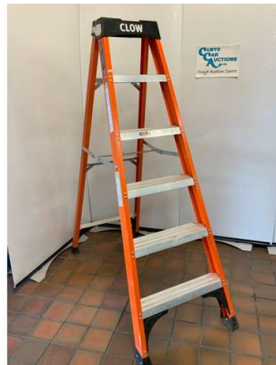
7. V - GRP FIBREGLASS 6 TREAD STEP LADDER (CLOW) COST NEW £127