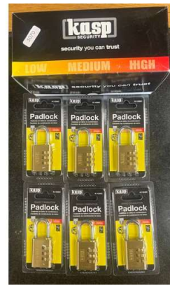
152. M - BOX OF 6 KASP PADLOCKS K11030C RRP 17.50 FOR 1 TOTAL RRP £105