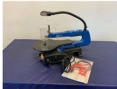
85. M - SCHEPPACH SCROLL SAW 2016 (NEW) 230V WITH SAWS + PACK RRP £179.99