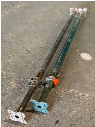
198. V - 2X ACRO PROPS