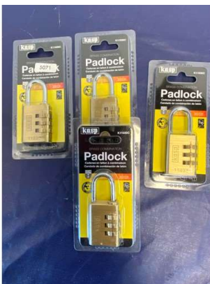
158. M - 4X KASP PADLOCK TOTAL RRP £70