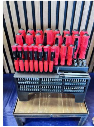
160. V - NEW NEILSEN 100 PIECE SCREWDRIVER BITS SET - CT2551