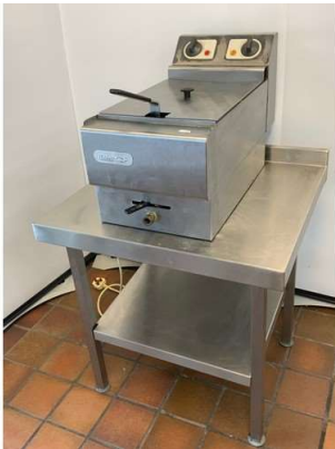
19. M - LINCAT SS SINGLE FRYER MODEL DF33 COST WHEN NEW £700 WITH 2FT SS TABLE