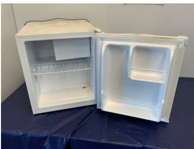
11. M - SILVER CREST TABLE TOP FRIDGE