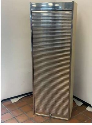
203. M - ROLL FRONT CABINET