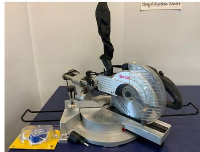
86. M - BOSUN 10" SLIDE COMPOUND MITRE SAW NEW IN BOX