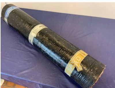
175. M - 8M ROLL OF HESSIAN BASED BITUMEN DAMP ROOF MEMBRANE