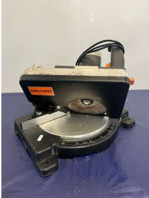
41. M - CHALLENGE CROSSCUT SAW - MODEL MMS5032 230V - COST WHEN NEW £100