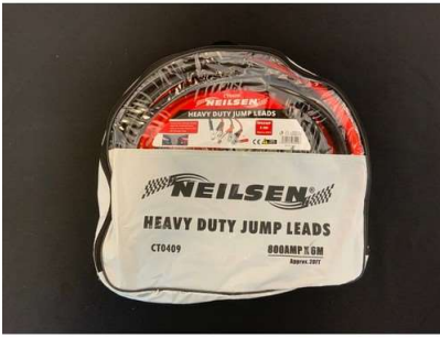
80. V - NEW NEILSEN 800 AMP HD JUMP LEADS 3M (CT0408)