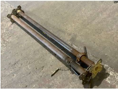
199. V - 2X ACRO PROPS