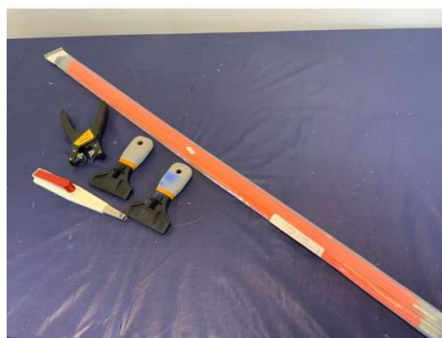
36. M - PACK OF CABLE WORM RODS/LINE STRIPPERS/ GAS LIGHTER + 2 SCRAPERS