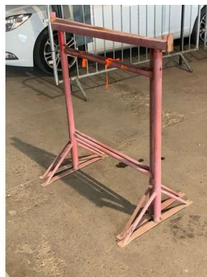
195. V - 2X BUILDERS TRESSELS