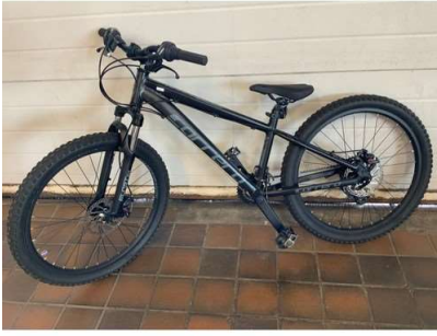
210. M - CARRERA BLAST JUNIOR MOUNTAIN BIKE 24 WHEEL RRP £345