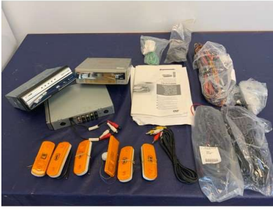
48. M - PANASONIC DV2000 MOBILE DVD/NAV SYSTEM + SIDE MARKER LIGHT