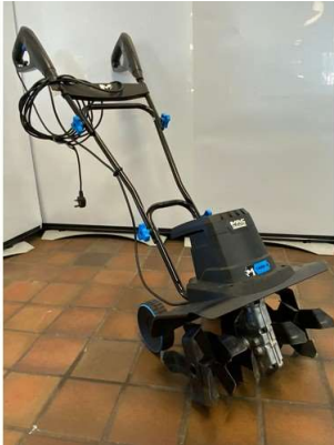
181. M - MACALLISTER 1400W MTIP1400-2 TILLER RRP £105.99