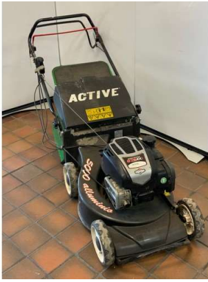
180. V - ACTIVE 5000 SELF PROPELLED PETROL MOWER (163cc) COST NEW £650