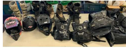
214. M - 11 X ASSORTED MOTORCROSS ITEMS INCLUDING - ANSWEAR M/C BOOTS WHITE SIZE EURO 29.5 APPROX RRP £90, 2 X SETS OF ONEAL M/C BLACK BOOTS SIZE 12 APPROX RRP £100 EACH, VENDRAMINI M/C BOOTS SIZE 5, 2 X THOR MX SENTINEL YOUTH PROTECTORS BODY ARMOUR APPROX RRP £65-£100 EACH, 1 X THOR MX SENTINEL BODY ARMOUR NO SIZE, GTS BRAT HAT HELMET SIZE 54 MEDIUM, SIRT BLACK HELMET NO SIZE, S-ONE HELMET COMPANY SAFETY HELMET SIZE XL