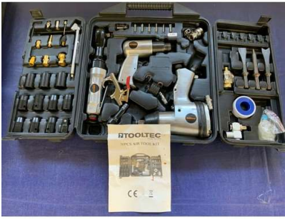
64. V - TOOLTEC 50 PCS AIR TOOL KIT