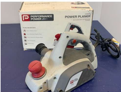
65. M - PERFORMANCE PLANER (NLH1020PP)