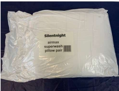
98. M - SILENTNIGHT AIRMAX SUPERWASH PILLOWS PAIR RRP £19.99 ( P24270109 / C )