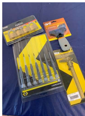
37. M - PADLOCK SET/ SCREWDRIVER SET, CALIPER & SCRAPER