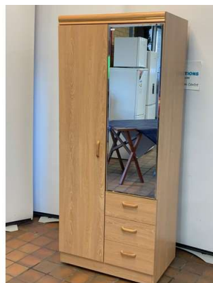
8. M - MIRRORED WARDROBE - Height 72.5" width 30" depth 20" - PRE LOVED