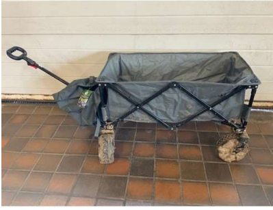
1. M - TIMBER RIDGE 4 WHEEL TROLLEY RRP £87.99