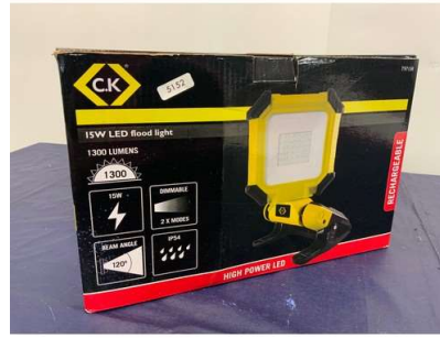
84. M - CK 15W LED PORTABLE WORK LIGHT 1300 LUMENS RRP £75