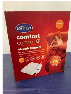
102. M - SILENTNIGHT COMFORT CONTROL ELECTRIC BLANKET DOUBLE RRP £27 ( P24270109 / C )