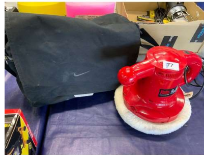
77. M - POWER DEVIL 240V CAR POLISHER