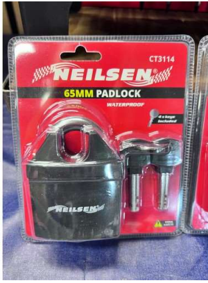
164. V - NEW NEILSEN 65mm WATERPROOF PADLOCK WITH 4 KEYS - CT3114