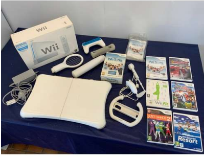
149. M - WII GAMES CONSOLE, BALANCE BOARD, CONTROLLERS & GAMES