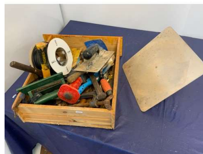
16. M - BOX OF BUILDERS TOOLS