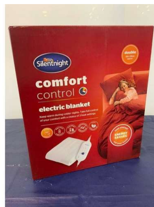
110. M - SILENTNIGHT COMFORT CONTROL ELECTRIC BLANKET DOUBLE RRP £27 ( P24270109 / C )