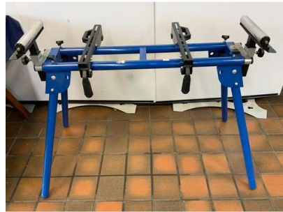
185. M - ARROW UK - MITRE SAW STAND RRP £80