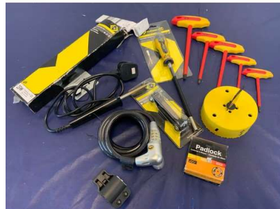
45. M - 5 X HEX DRIVES, FLEX SCREWDRIVER, 114MM HOLE SAW, PADLOCK & COMBI LOCK, HEX KEY SET & SOLDERING IRON