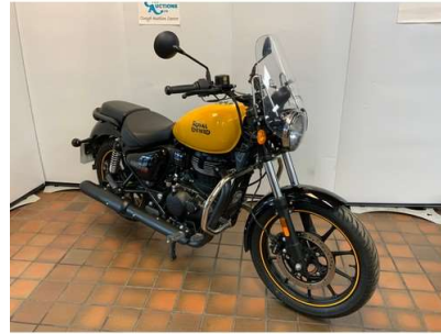
220. M - 2021 - ROYAL ENFIELD METEOR 350 MOTORBIKE REG - 'CX71WZC' 349cc 338.1 MILES - WARRENTED. ONE OWNER FROM NEW. WITH 2 KEYS & V5. CHASSIS NO ME3DJEMT5MV004103