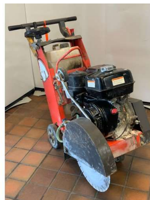
187. V - 18" PETROL ROAD SAW / TRENCH CUTTER WITH HONDA ENGINE (POSS CLIPPER) COST NEW APPROX £2895