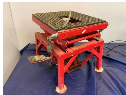
215A. M - HEAVY DUTY MOTORCROSS STAND (HYDRAULIC) - COST NEW £290