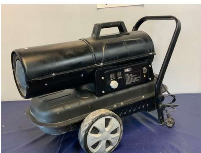
66. V - SEALEY (AB7081) INDIRECT KEROSENE / DIESEL HEATER RRP £383