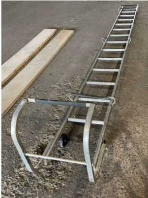
189. V - 4.2M ALUMINIUM ROOF LADDER - COST NEW £416