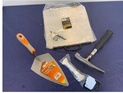
44. M - 1X TROWEL, 1X MASONRY HAMMER, 1 LINE, 1 PLASTER BOARD