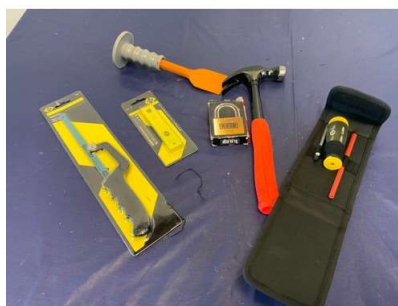
38. M - HAMMER, CHISLE, PADLOCK, SCREWDRIVER, TRIMMING KNIFE & HACKSAW