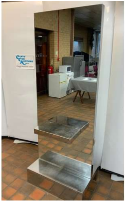
202A. M - FREE STANDING STEEL & MIRROR SALON WORK STATION H 7FT X 2'6 W (A/F)