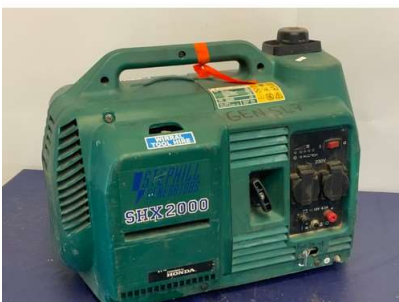
83. V - STEPHILL SHX 2000 PETROL GENERATOR 1.7 KVA RRP £589.99