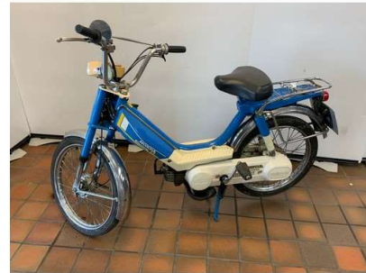
208. M - 1978 HONDA PA50 CAMINO DX 49CC MOPED - REGISTRATION GFM395T. 471 MILES, LAST OWNER SINCE 2007 WITH V5 DOCUMENT. MOT & TAX EXEMPT.