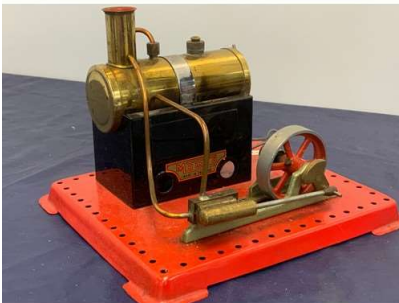
150. M - VINTAGE MAMOD STEAM ENGINE MODEL WITH BURNER - ONLINE PRICES £50 - £200