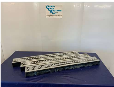
4. M - 3X DRAINAGE CHANNELS - COST £18 EACH