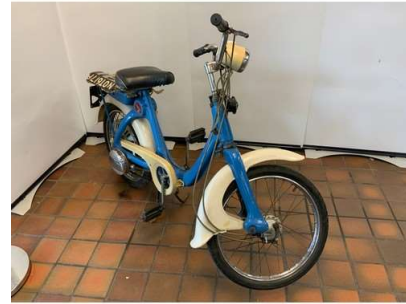
207. M - 1968 HONDA P50 49cc MOPED- REGISTRATION NOT617F, WITH ORIGINAL GREEN LOG BOOK, MOT & TAX EXEMPT