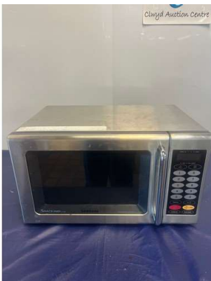
20. M - SAMSUNG SNACKMATE CM 1069 COMMERCIAL MICROWAVE OVEN - COST NEW £251