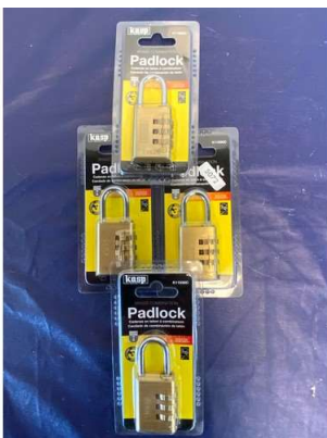
159. M - 4X KASP PADLOCK TOTAL RRP £70