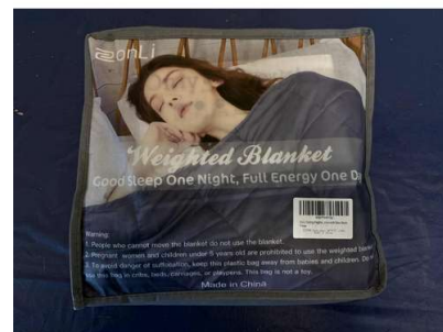
117. M - ZONLI WEIGHTED BLANKET 48" X 72" 15LB GREY RRP £80 (P24011879/IPB/03H)