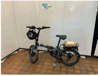
216. M - APOLLO ELECTRIC FOLDING BIKE WITH CHARGER & 3 KEYS RRP £849 WITH HELMET RRP £59.99