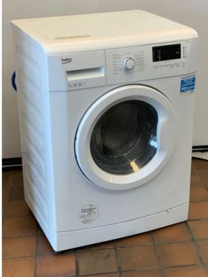
10. M - BEKO 7KG 1400 RPM WASHING MACHINE - WM74145W - COST WHEN NEW £249