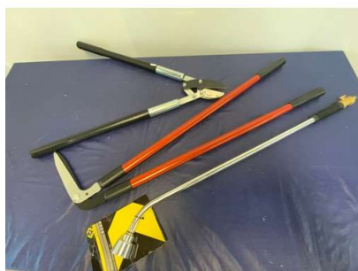
34. M - ANNUIL LOPPERS/EDGING SHEARS & LONG REACH WATERING ROSE