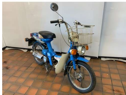
205. M - 1980 HONDA NC50 EXPRESS DELUXE 49CC MOPED AUTOMATIC. REGISTRATION - NNB692W. 5,608 MILES, 2 FORMER KEEPERS, V5 PRESENT, MOT & TAX EXEMPT.