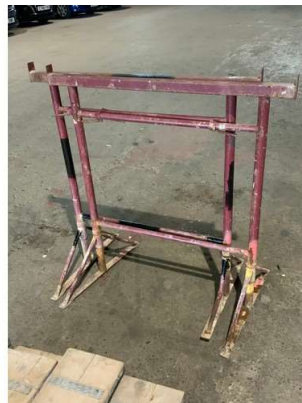
194. V - PR BUILDERS TRESSELS