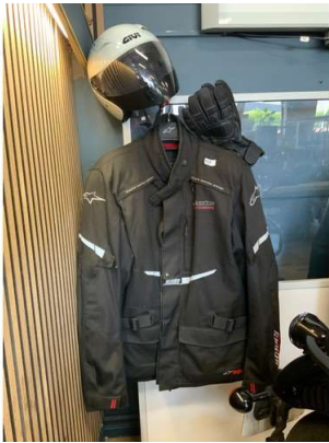
218. M - ALPINESTAR TECH-TOURING CLIMATE CONTROL ANDES TOURER MOTORBIKE JACKET - COST NEW £219.99, OPEN FACE GIVI 30.3 TWEET HELMET RRP £ 69.99 & MYX LEATHER & NYLON ALL SEASONS WATERPROOF GLOVES