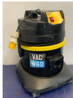
70. V - V TUF COMBAT GRIME WET & DRY 110V VAC (NO HOSE) COST NEW £280