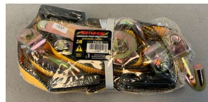
155. V - NEW NEILSON CAR HAULER STRAP & RATCHET 3M WITH SWIVEL 'J' HOOKS (CT4516)