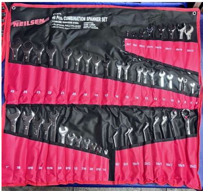
148. V - NEW NEILSEN 48 PIECE FULL POLISH FINISH SPANNER SET - CT0876