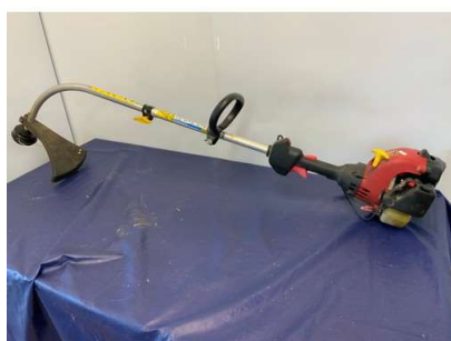
35. M - HOMELITE PETROL STRIMMER RRP £63