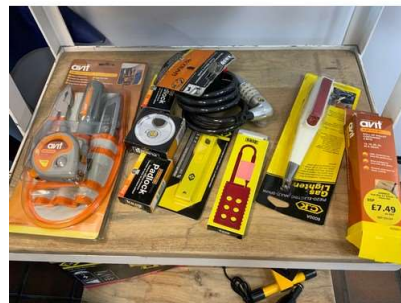
93. M - 3 PADLOCKS, SAFETY LOCK, COMBI LOCK, TOOL POUCH, 6 PIECE DRILL BIT SET + GAS LIGHTER