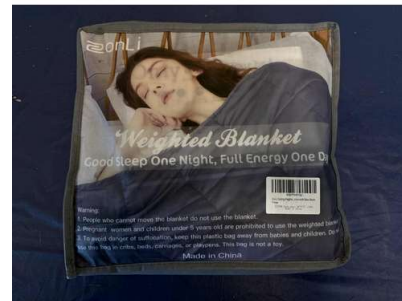
116. M - ZONLI WEIGHTED BLANKET 48" X 72" 15LB GREY RRP £80 (P24011879/IPB/03H)