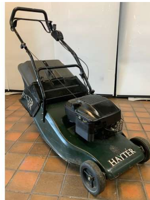
178. V - HAYTER 48 S/P ROLLER DRIVE MOWER - COST NEW £1099