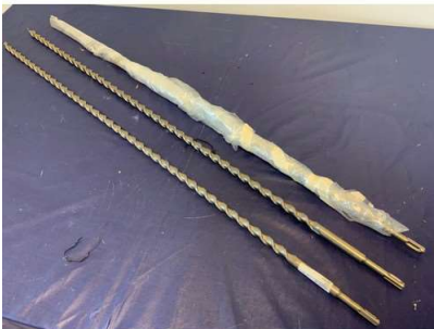
74. M - 3X EXTRA LONG DRILL BITS