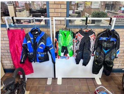
212. M - 8 YOUTH ITEMS OF MOTORCROSS CLOTHING INCLUDING - WULFSPORT JACKET AGE 11/12 APPROX RRP £40, IKON WATERPOOF RED TROUSERS SIZE SMALL, UFO MOTORCROSS TOP AGE 11/12, WULF SPORT ORANGE M/C TOP AGE 8-10 TROUSERS 24" APPROX RRP £50, ANSWEAR TROUSERS SIZE YOUTH 28, SUZUKI JACKET AGE 7-8