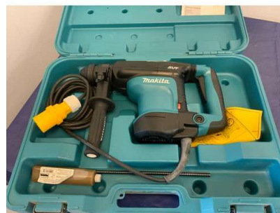
79. M - NEW MAKITA HR 3210C 110V SDS DRILL RRP £459.99