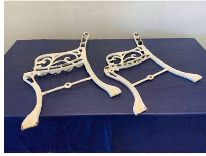
60. M - CAST BENCH ENDS WHITE