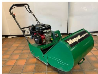
179. V - MASPORT OLYMPIC 400 PETROL CYLINDER MOWER (PETROL) COST NEW £1269