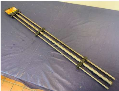
73. M - AVIT 3 PIECE MASONRY DRILL SET 1 METER RRP £28