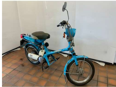
204. M - 1978 HONDA NC50 EXPRESS AUTOMATIC 49CC MOPED. REGISTRATION - OWM763S. 1,402 MILES, 3 FORMER KEEPERS, V5 PRESENT. MOT & TAX EXEMPT.