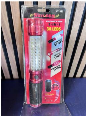
167. V - NEW NEILSEN 3 IN 1 LED WORK LIGHT & TORCH (30 LEDS) CT1822