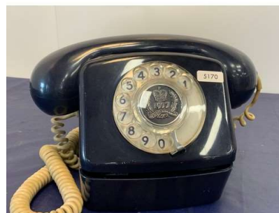
87. M - 1977 QUEENS COMMEMORATIVE SILVER JUBILEE PHONE IN BALMORAL BLUE