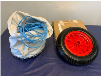
51. M - 1X BARROW WHEEL IN BOX WITH ATTACHMENTS & BAG OF 50M ROPE