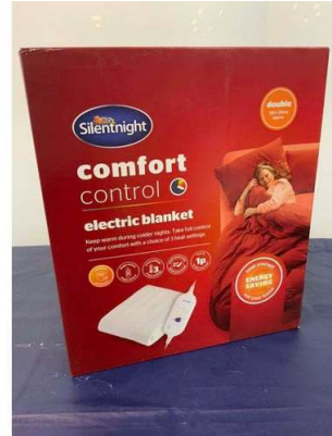
100. M - SILENTNIGHT COMFORT CONTROL ELECTRIC BLANKET DOUBLE RRP £27 ( P24270109 / C )