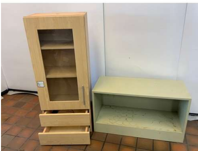
3. M - LIGHT OAK EFFECT CUPBOARD + CUPBOARD