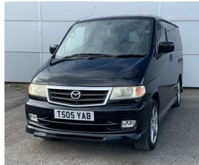
221. M - 1999 MAZDA BONGO - REG NO 'T505VAB' 2490cc - MOT 01.01.2026 - 156,881 MILES (NW) CHASSIS NO SGLW300417. 8 SEATS. NEW CAM BELT @139K, EW,CL,AIR COM,PAS,CD,ALLOYS.1 X KEY.