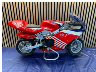
171. M - PETROL MINI MOTO POCKET BIKE - COST NEW APPROX £300-£400