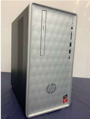
149A. M - HP PAVILION DESKTOP TOWER RYZEN 5 COST NEW RRP £815