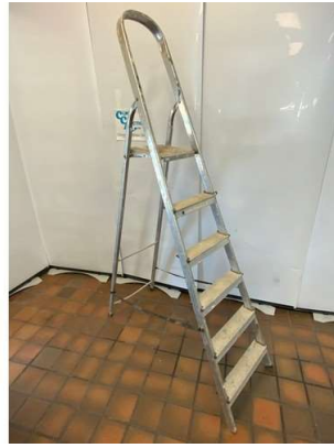
5. M - 6 TREAD ALUMINIUM STEP LADDER