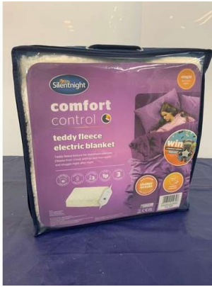
111. M - SILENTNIGHT COMFORT CONTROL TEDDY FLEECE ELECTRIC BLANKET SINGLE RRP £25.99 ( P24270109 / C )