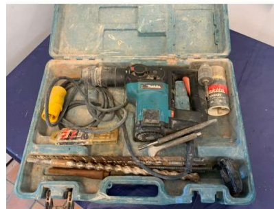
69. M - MAKITA HR 3000C 110V SDS DRILL