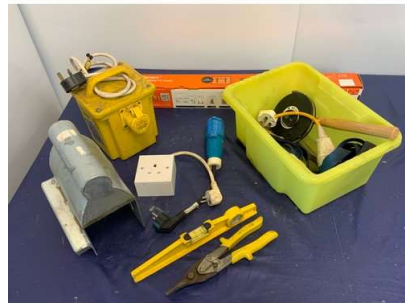
62. M - 110V TRANSFORMER + ASS TOOLS + SANDSTROM FLAT TO WALL TILTING TV MOUNT 42 - 47" UPTO 50KG