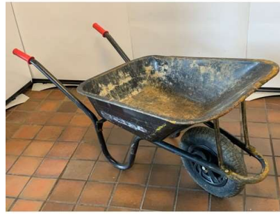
176. V - STEEL 90LTR WHEEL BARROW