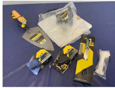
91. M - PLASTER'S HAWK/TROWEL & 2X CHALK LINES, STRING LINE, + POINTING TROWEL