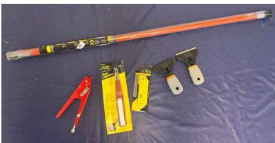
75. M - PACK OF CABLEWORN RODS, TIE WRAP TRIMMER, GAS LIGHTER, 2 SCRAPERS & TRIMMING KNIFE