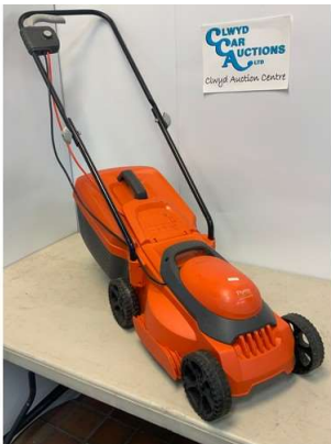
182. M - FLYMO SIMPLE COMPACT 300 ELECTRIC MOWER RRP £84.99