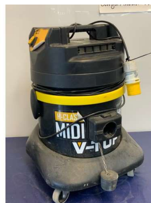
71. V - V TUF H CLASS MIOI H14 VACUUM 1400W 110V -(NO HOSE) COST NEW £546