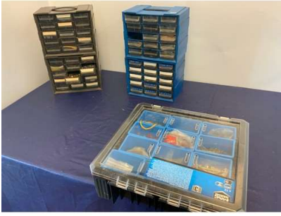
56. M - 5 X STORAGE BOXES OF SCREWS ETC