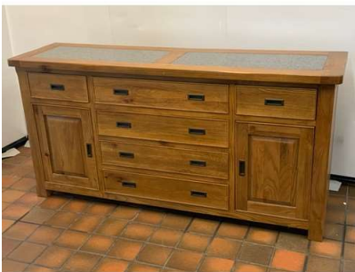
89. M - OAK KITCHEN DRESSER WITH GRANITE INSERT - COST NEW APPROX £800