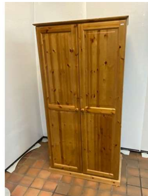
15. M - PINE DOUBLE WARDROBE