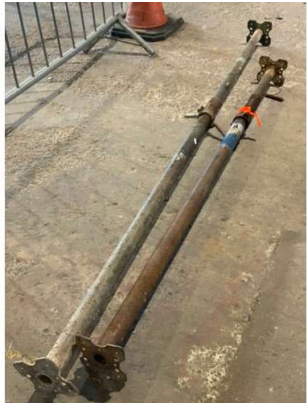
200. V - 2X ACRO PROPS