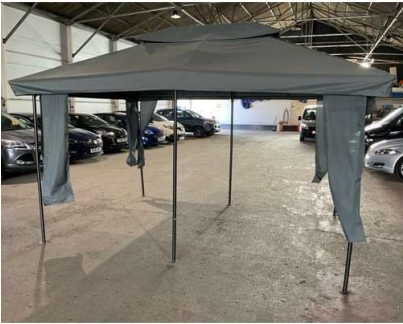
201. V - DAKOTA FIELDS ARPI 4M X 3M METAL PATIO GAZEBO RRP £193.99