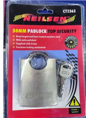
169. V - NEW NEILSEN TOP SECURITY 50MM PADLOCK (CT2363)