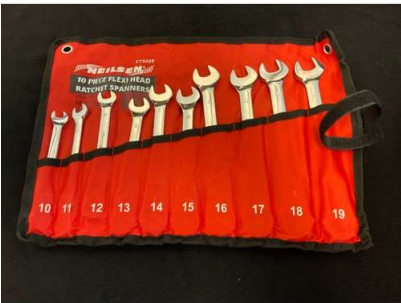
143A. V - NEW NEILSEN 10PC FLEXI-HEAD COMBINATION RATCHET SPANNER SET CT3229