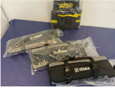
95. M - 3X VOGELE TOOL BAGS & CK TOOL BELT