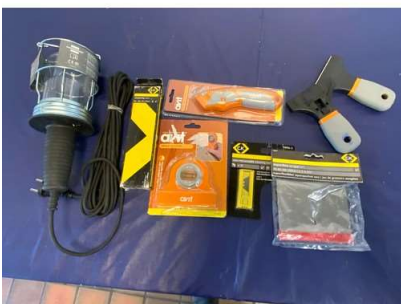
43. M - WORK LIGHT, STANLEY BLADES WITH KNIFE, 2 SCRAPERS, FLEX SHARPENING STONE