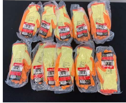
168. V - 12 X CRINKLE LATEX COATED WORK GLOVE SIZE: 10" XL SINGLE (CT4970)