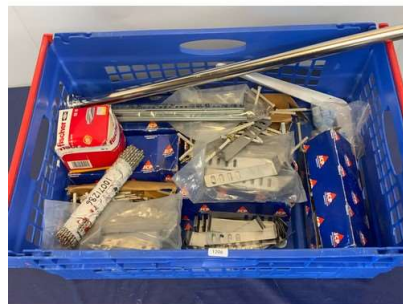
46. M - SUNDRY BOX WALL TIES & FIXINGS