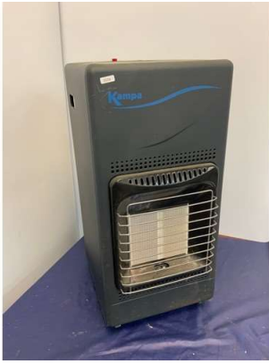
9. M - KAMPA GAS HEATER & GAS BOTTLE