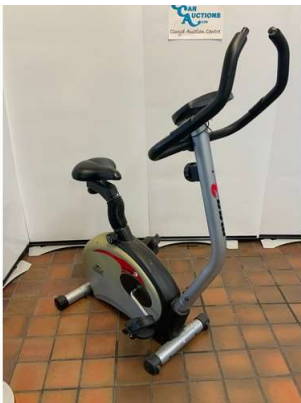
183. M - CRANE MAG 3 MAGNETIC EXERCISE BIKE