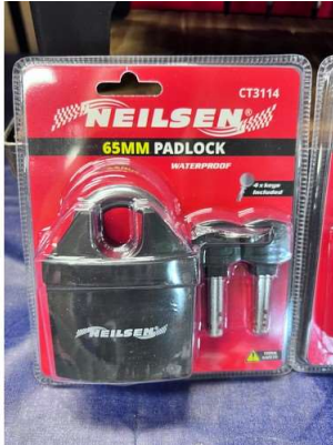
165. V - NEW NEILSEN 65mm WATERPROOF PADLOCK WITH 4 KEYS - CT3114