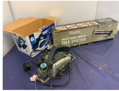
68. M - NEW TOOL POWER PLANER + HARRIS HEAVY DUTY 400MM TILE CUTTER