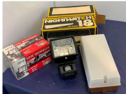
63. M - 3 LIGHT FITTINGS