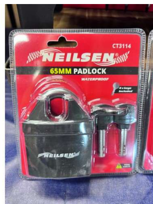
163. V - NEW NEILSEN 65mm WATERPROOF PADLOCK WITH 4 KEYS - CT3114