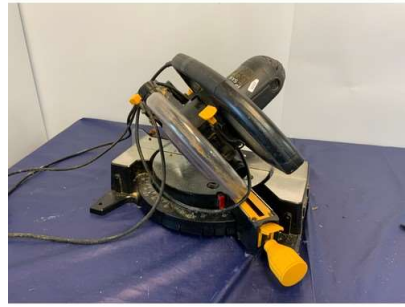
184. M - PRO MITRE SAW