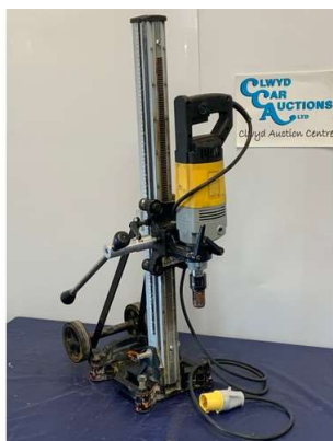
33. V - SEALEY DCD110V 110V CORE DRILL ON STAND - 2300W - COST WHEN NEW £383