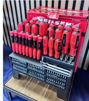
161. V - NEW NEILSEN 100 PIECE SCREWDRIVER BITS SET - CT2551