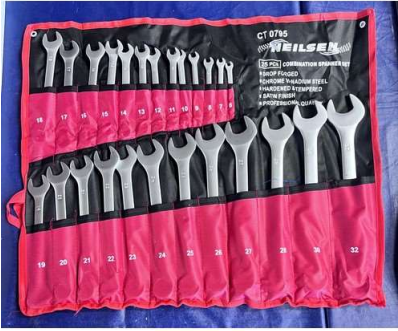
142. V - NEW NEILSEN 25 PIECE SATIN FINISH SPANNER SET - CT0795