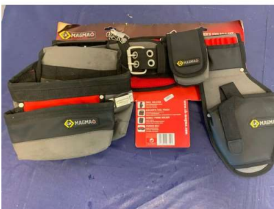
90. M - MAGMA TOOL BELT RRP £49.14