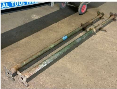
197. V - 2X ACRO PROPS