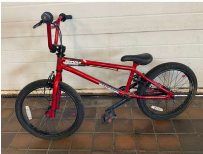
211. M - MONGOOSE ARTICLE BMX