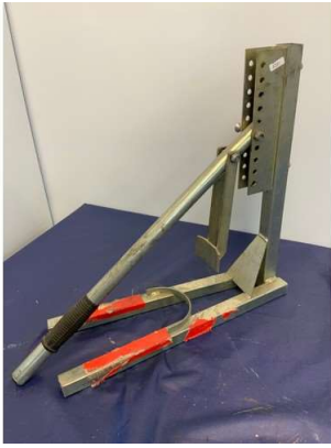
188. M - GO CART TYRE CHANGER / BEAD BREAKER - RRP £60