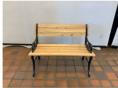
53. M - 2 SEATER WOODEN GARDEN BENCH