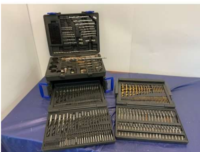
67. M - NUTOOL SCREWDRIVER AND DRILL BIT SET