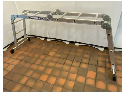
6. M - SUPERTOOL ALUMINIUM MULTI LADDER - COST WHEN NEW £189