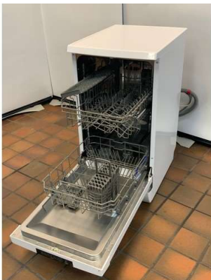
12. M - TEKNIX SLIMLINE DISHWASHER MODEL TFD455W RRP £329