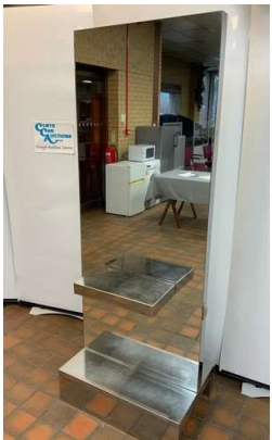
202. M - FREE STANDING STEEL & MIRROR SALON WORK STATION H 7FT X 2'6 W