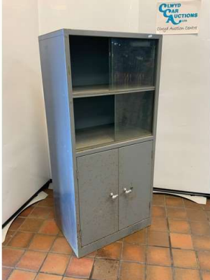
2. M - 2 DOOR STEEL CABINET WITH GLASS DOORS