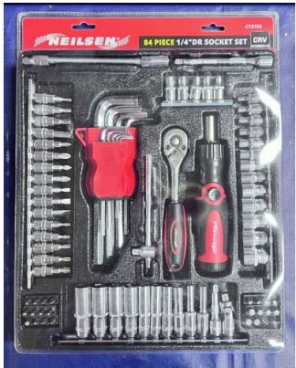
146. V - NEW NEILSON 84 PIECE 1/4 INCH DRIVE SOCKET SET - CT3752