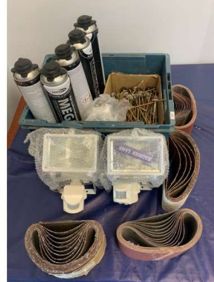
61. M - 6 BOXES PASLODE (F16 STRAIGHT BRADS & 5 CANS OF PU ADHESIVE & 30 X OF ROOFING FIXING & 2 HALOGEN LIGHTS