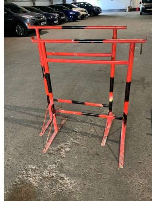
193. V - PR BUILDERS TRESSELS