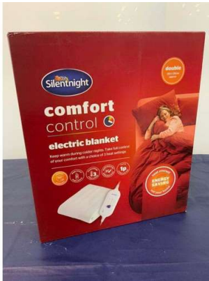
104. M - SILENTNIGHT COMFORT CONTROL ELECTRIC BLANKET DOUBLE RRP £27 ( P24270109 / C )