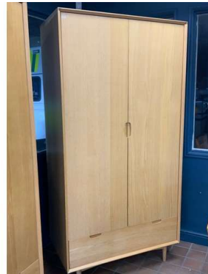
23. M - SOLID OAK GENTS WARDROBE -COST WHEN NEW £1199- Dimensions:

Width: 39 inch Height: 79 inch Depth 22.5 inch