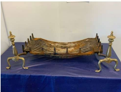
59. M - CAST IRON FIRE GRATE