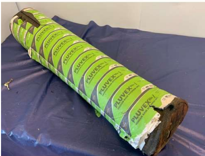
174. M - 8M ROLL OF HESSIAN BASED BITUMEN DAMP ROOF MEMBRANE RRP £65