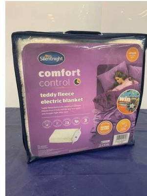
115. M - SILENTNIGHT COMFORT CONTROL TEDDY FLEECE ELECTRIC BLANKET SINGLE RRP £25.99 ( P24270109 / C )