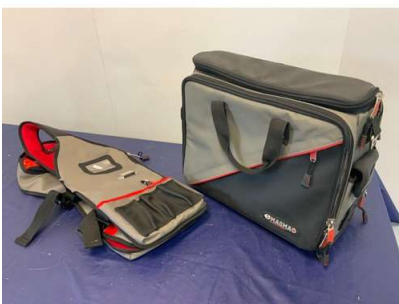
90A. M - MAGMA TOOL BAG + TOOL VEST (A/F)