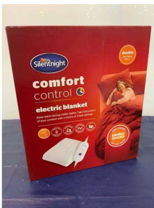
106. M - SILENTNIGHT COMFORT CONTROL ELECTRIC BLANKET DOUBLE RRP £27 ( P24270109 / C )