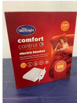
108. M - SILENTNIGHT COMFORT CONTROL ELECTRIC BLANKET DOUBLE RRP £27 ( P24270109 / C )