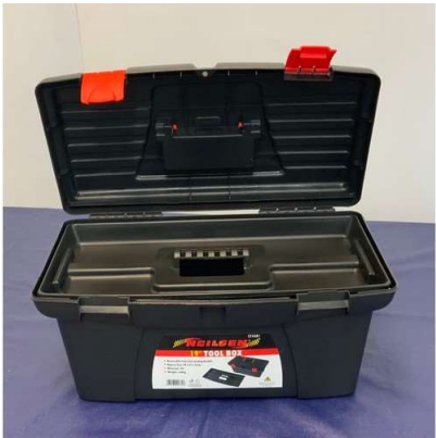
144. V - NEW NEILSON 19" TOOL BOX (CT4381)