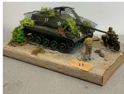
134. M - US ARMY TANK WIT FIGURES ON BIKE