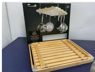
154. M - NEW MASTER CLASS WOODEN POT RACK RRP £119.99