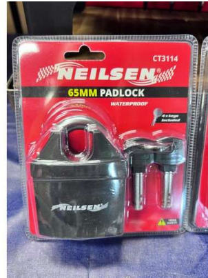
132. V - NEW NEILSEN 65mm WATERPROOF PADLOCK WITH 4 KEYS - CT3114