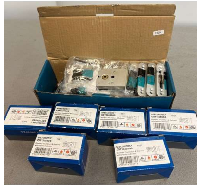
5. M - BOX OF FURO SPEC LOCKS