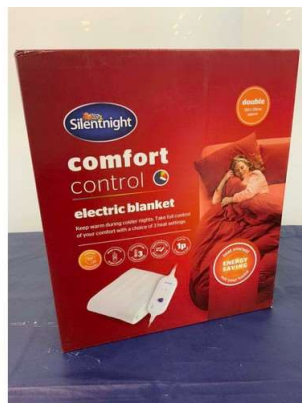
139. M - SILENTNIGHT COMFORT CONTROL ELECTRIC BLANKET DOUBLE RRP £27 ( P24270109 / C )