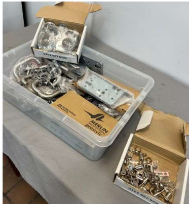
9. M - SUNDRY BOX OF HANDLES & LOCKS