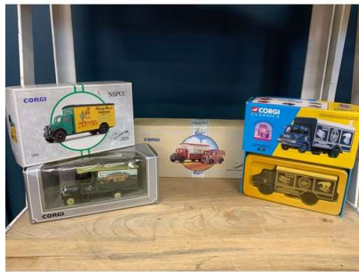
106. M - 4 CORGI HERITAGE VANS ( INC NSPCC,WILSONS KENDAL MINT CAKE, KENSINGTON PALACE & FOX)