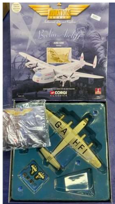
107. M - CORGI AVIATION AVRO YORK