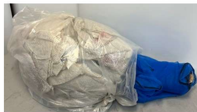
13. M - QUANTITY OF SCAFFOLD NETTING