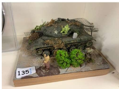
135. M - US ARMY TANK WITH FIGURES