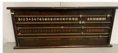
45. M - VICTORIAN MAHOGONY SNOOKER SCOREBOARD