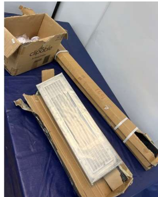
12. M - BOX OF HAND RAIL BRACKETS & DRAFT EXCLUDERS & VENT