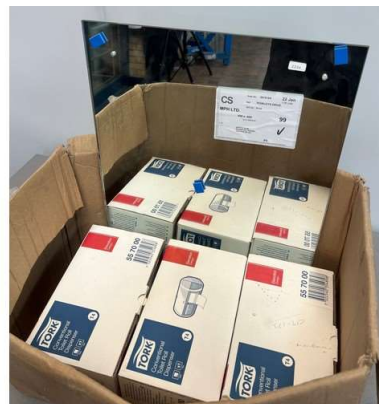
14. M - 3 X TOILET ROLL DISPENSERS & MIRROR