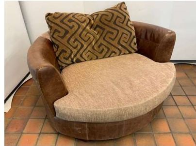
20. M - LARGE LEATHER SNUGGLE CHAIR