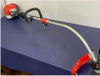
61. V - MITOX 28NT SELECT PETROL STRIMMER