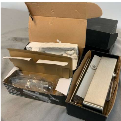
4. M - 5 BOXES OF DOOR CLOSERS