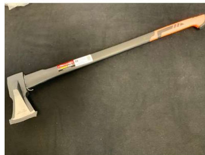
67. V - NEW NEILSON 200G AXE WITH FIBERGLASS HANDLE CT2534