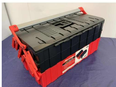
116. V - NEW NEILSEN TOOL BOX PLASTIC 5 TRAYS (5055282064672) CT6467