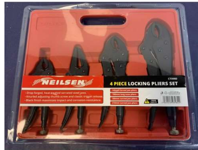
66. V - NEW NEILSEN LOCKING PLIERS - 4 PIECE SET - CT0980