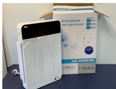
82. M - 'NEW' ION AIR PURIFIER WITH REMOTE CONTROL