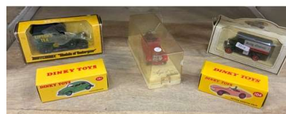
112. M - 2 VINTAGE VANS & 3 CARS ( INC LIPTONS TEA, DAILY EXPRESS, JAGUAR, ASTON MARTIN & VW)