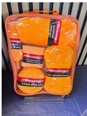
79. V - NEW NEILSEN 9 PIECE CAR WASH CLEANING TOOL KIT - CT6225