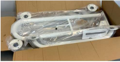
1. M - 8 X DISABLED GRAB HANDLES