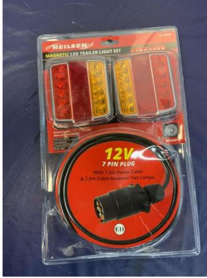
128. V - NEW NEILSEN MAGNETIC LED TRAILER LIGHT SET - CT4926