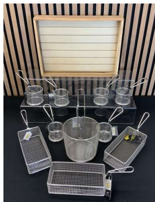
152. M - NEW 10 ASSORTED S/S WIRE BASKETS & WOODEN TRAY TOTAL RRP £176.54