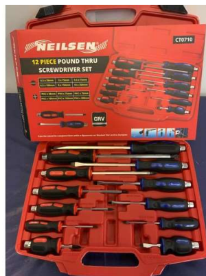
117. V - NEW NEILSEN SCREWDRIVER SET - 12 PIECE FLAT/PHILIPS COMBINATION - CT0710