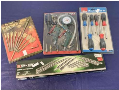
55. M - PARKSIDE 11PCS SDS BIT SET,AMTECH 8 PICS WOOD BIT SET, HILKA 6 PCS SCREWDRIVER SET, PARKSIDE AIRTOOL ACCESSORY KIT