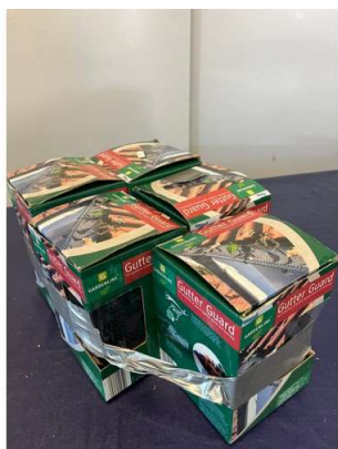
48. M - 5X GARDENLINE GUTTER GUARDS RRP £20 PER BOX