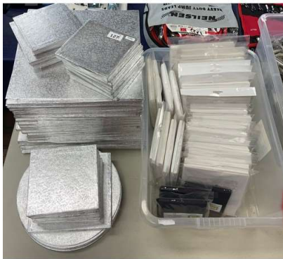
10. M - NEW ASSORTMENT OF CAKE BOARDS ROUND AND SQUARE, ASSORTMENT OF VARIOUS CELEBRATION NAPKINS