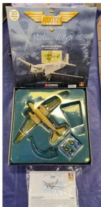
108. M - CORGI AVIATION DOUGLAS C47-A SKYTRAIN