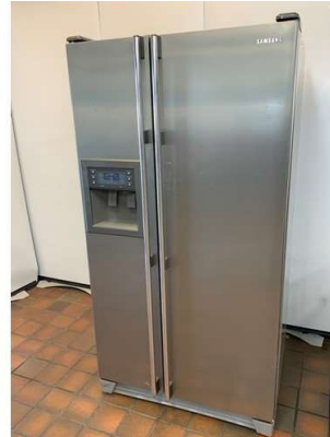
22. M - SAMSUNG DOUBLE DOOR COOLING FRIDGE FREEZER - MODEL RS210GRS - COST WHEN NEW £1000+