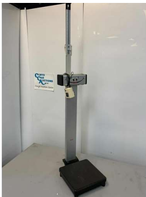
10A. M - SECA PEADIATRIC MEASURING SYSTEM - COST WHEN NEW £537