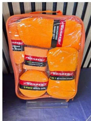
80. V - NEW NEILSEN 9 PIECE CAR WASH CLEANING TOOL KIT - CT6225