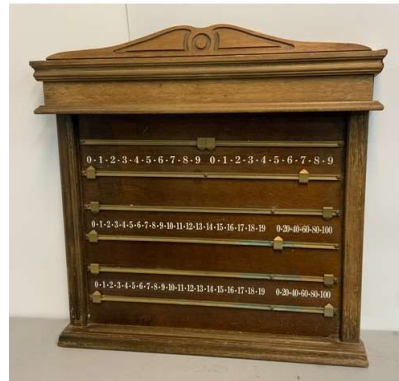
44. M - EDWARDIAN OAK SNOOKER SCOREBOARD