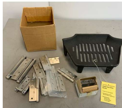
6. M - BOX ASS HINGES & CAST IRON FIRE GRATE