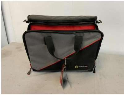
54. M - MAGMA TOOL BAG