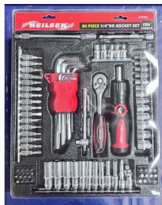
119. V - NEW NEILSON 84 PIECE 1/4 INCH DRIVE SOCKET SET - CT3752