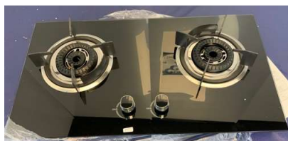
49. M - BLACK TEMPERED GLASS 2 RING LPG COOKTOP -MODEL HM56001 - RRP £372