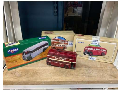
110. M - 3 CORGI BUSES (INC RHOSLYN MOTORS, GREY-GREEN COACHES & C & G AYRES)