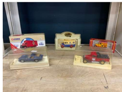
111. M - 4 HERITAGE VANS & CAR (INC CAMERON BREWERY, ADT, COLEMANS )