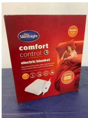
137. M - SILENTNIGHT COMFORT CONTROL ELECTRIC BLANKET DOUBLE RRP £27 ( P24270109 / C )