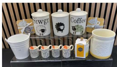
151. M - NEW 12 ASSORTED KITCHEN INCLUDING SHEEP CADDIES & HONEY POT RRP £25 EACH TOTAL RRP £137.95