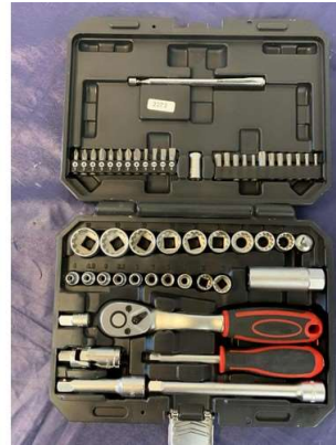
58. M - POWERFIX 53 PIECE TOOL KIT