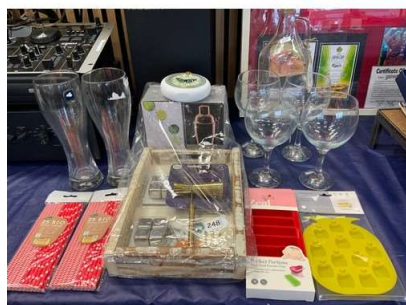
163. M - NEW 17 BAR & COCKTAIL ITEMS & TRAY TOTAL RRP £140.39