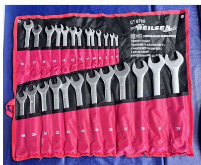
76. V - NEW NEILSEN 25 PIECE SATIN FINISH SPANNER SET - CT0795