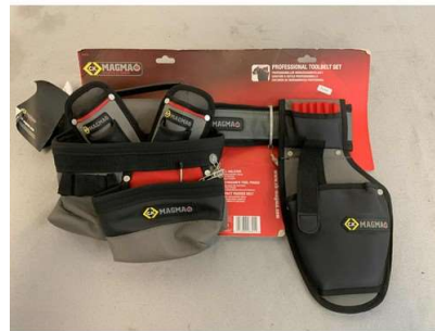
133. M - MAGMA TOOL BELT