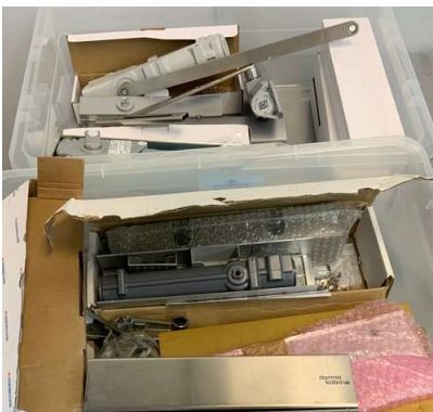
3. M - 2 BOXES ASS DOOR CLOSER PARTS