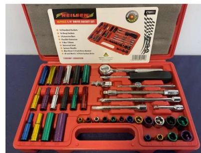
60. V - NEW NEILSEN SOCKET SET - 40 PIECE 1/4 IN DRIVE - CT0911