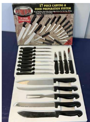
53. M - SAMURAI 17 PCS KITCHEN KNIFE SET