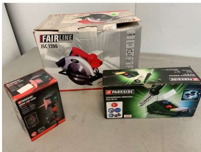
56. M - FAIRLINE CIRCULAR SAW (JSC 1200) PARKSIDE (PLS 48CI) SOLDERING SATATION, PARKSIDE (OKLL7C3) CROSS LINE LASER LEVEL