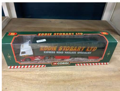
113. M - CORGI EDDIE STOBART TRUCK