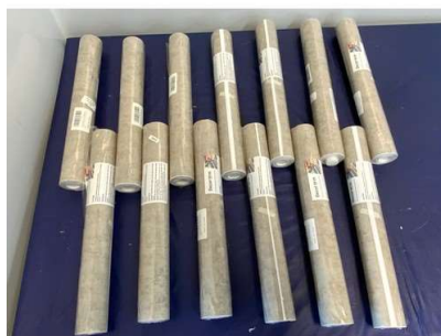
52. M - BOX OF DECOROOM STICKY BACK VINYL WALL COVERING RRP £5.99 PER ROLL