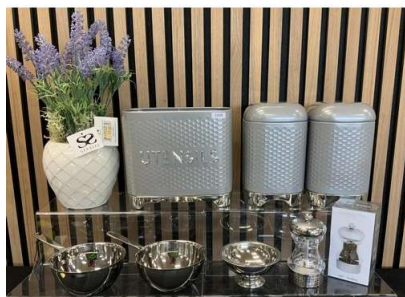
149. M - NEW 8 ASSORTED ITEMS INCLUDING LAVENDER POT, S/S ITEMS & SALT & PEPPER MILL TOTAL RRP £133.45