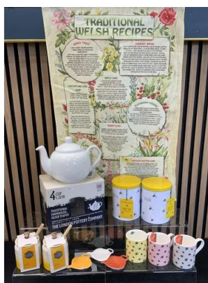
150. M - NEW 12 ASSORTED KITCHEN ITEMS INCLUDING WHITE TEAPOT, 2 X HONEYPOTS & BEE MUGS TOTAL RRP £132.81