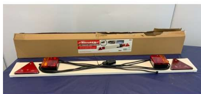
114. V - NEW NEILSON TRAILER LIGHT BOARD - 4FT WITH 5M CABLE (CT4927)