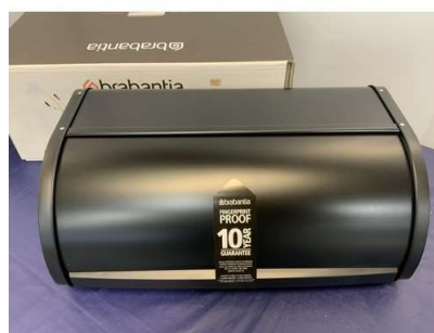
153. M - NEW BARBARANTIA BLACK ROLL TOP BREAD BIN RRP £55