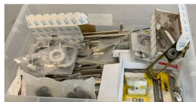
8. M - SUNDRY OF DOOR HANDLES LOCKS ETC