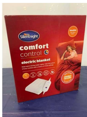
140. M - SILENTNIGHT COMFORT CONTROL ELECTRIC BLANKET DOUBLE RRP £27 ( P24270109 / C )