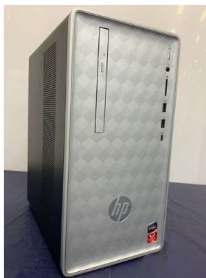
51. M - HP PAVILION DESKTOP TOWER RYZEN 5 COST NEW RRP £815