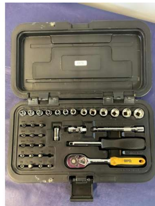
59. M - TORQ 35 PIECE TOOL KIT SECOND HAND COST £52