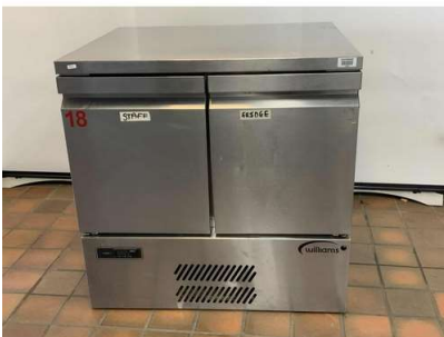
18. M - WILLIAMS H10CT R1 DOUBLE DOOR UNDERCOUNTER S/S FRIDGE 280LTRRRP NEW PRICE £2644.00