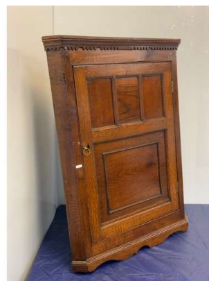
15. M - GEORGIAN OAK CORNER CABINET