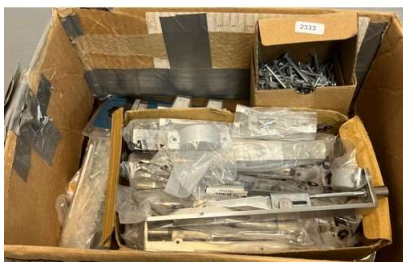
11. M - SUNDRY BOX OF LOCKS, NAILS ETC