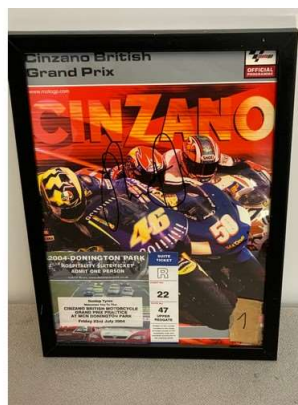
166. M - SIGNED PROGRAM MOTO GP SHANE BYRNE