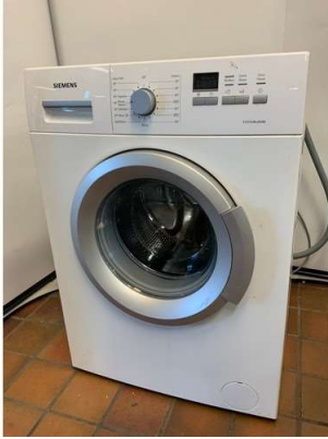
16. M - SIEMENS EXTRAKLASSE 6KG WASHING MACHINE 1200 SPIN - COST WHEN NEW APPROX £450