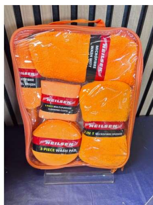
81. V - NEW NEILSEN 9 PIECE CAR WASH CLEANING TOOL KIT - CT6225