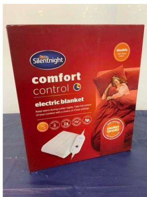
138. M - SILENTNIGHT COMFORT CONTROL ELECTRIC BLANKET DOUBLE RRP £27 ( P24270109 / C )