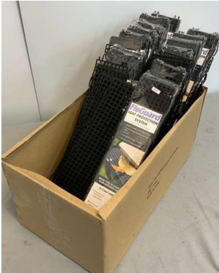
2. M - BOX OF 17 GUTTER GUARDS