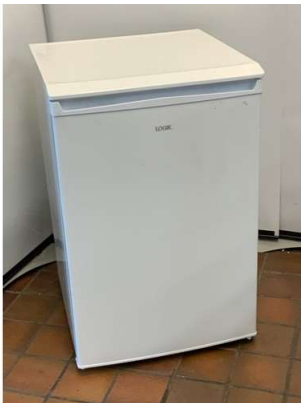
17. M - LOGIK UNDER COUNTER FREEZER - LUF55W233 - COST WHEN NEW £159