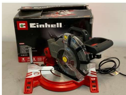
77. M - EINHILL CROSS CUT MITRE SAW - AS NEW