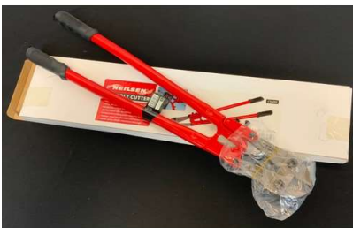
63. V - NEW NEILSON 30" RED BOLT CUTTER (CT0297)