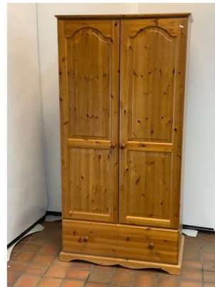
21. M - PINE GENTS DOUBLE ROBE