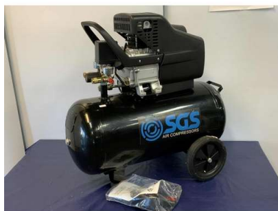
47. M - SGS 50 LITRE 2-5HP COMPRESSOR (SC50H) UNUSED RRP £229.99