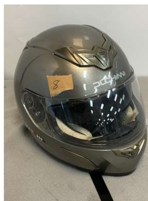
168. M - DUCHINNI D909 MOTORBIKE HELMET AS NEW