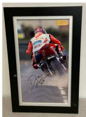
167. M - SIGNED DEAN HARRISON TT PHOTO