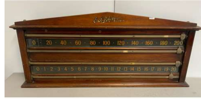
43. M - RILEY MAHOGONY SNOOKER SCORE BOARD