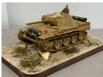
136. M - GERMAN TANK WITH FIGURES