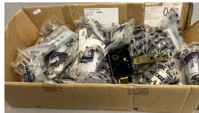
7. M - BOX OF ASS LOCKS ETC