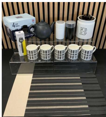
162. M - NEW 12 ASSORTED BLACK & WHITE KITCHEN ITEMS INCLUDING BLACK TEAPOT TOTAL RRP £137.00