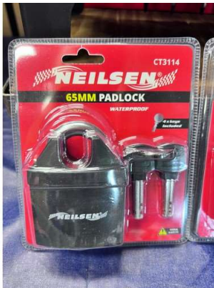
129. V - NEW NEILSEN 65mm WATERPROOF PADLOCK WITH 4 KEYS - CT3114