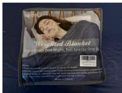
61. M - ZONLI WEIGHTED BLANKET 48" X 72" 15LB GREY RRP £80 (P24011901/IPB/03J)