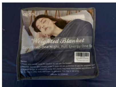
60. M - ZONLI WEIGHTED BLANKET 48" X 72" 15LB GREY RRP £80 (P24011901/IPB/03J)