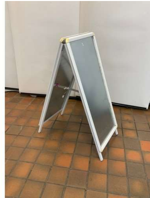
69. M - ALUMINUM A-BOARD PAVEMENT SIGN - COST WHEN NEW APPROX £100