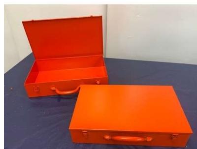
87. M - 2 X METAL TOOL BOXES