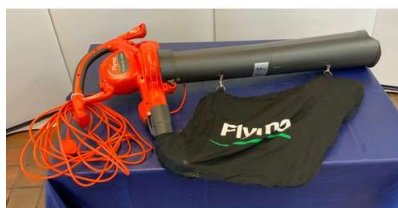
124. M - FLYMO ELECTRIC POWER VAC LEAF BLOWER & VAC 3000V - COST NEW £79