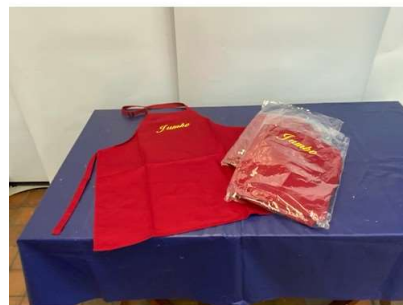
32. M - 20 X NEW APRONS