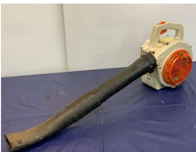
91. V - STIHL BG75 PETROL BLOWER