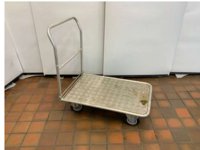
23. M - STAINLESS STEEL FLATBED CART / TROLLEY - COST WHEN NEW £218