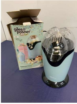
49. V - GILES & POSNER POPCORN MAKER RRP £20