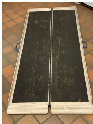
44. M - RAMP CENTRE 350KG PORTABLE ALU RAMPS RRP £245