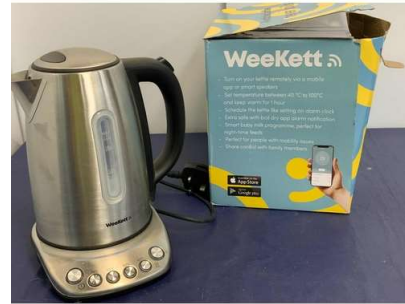
54. V - WEEKETT SMART KETTLE RRP £59.99