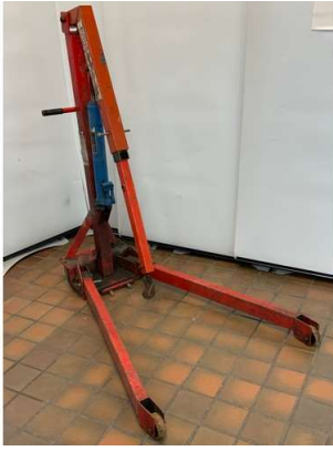
25. M - SEALEY SPC1000 1 TONNE FOLDING ENGINE CRANE - COST NEW APPROX £1000