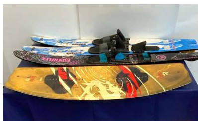
45. M - PAIR OF WATER SKIS - JOBE PRIDE & PULSAR ST 200, MONO SKI & A WAKE BOARD