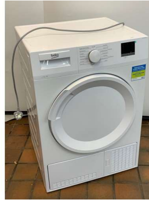
21. M - BEKO 7KG CONDENSER TUMBLE DRYER - MODEL DTLCE70051W -COST WHEN NEW £249