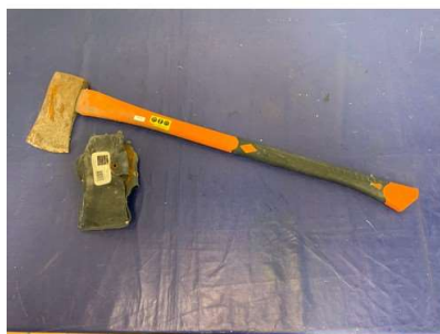
118. M - B&Q AXE