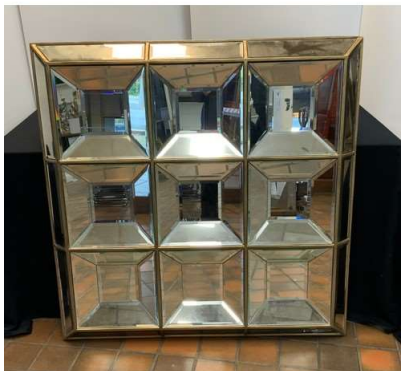
35. M - MULTI BEVELLED MIRROR A/F -COST NEW £700