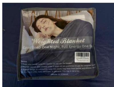
64. M - ZONLI WEIGHTED BLANKET 48" X 72" 15LB GREY RRP £80 (P24011901/IPB/03J)