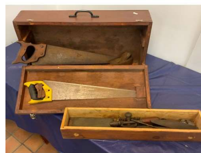
95. M - JOINERS BOX & TOOLS