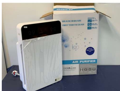
42. M - 'NEW' ION AIR PURIFIER WITH REMOTE CONTROL