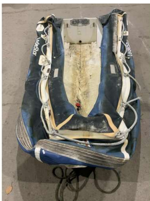
146. M - LODESTAR RIGID INFLATABLE BOAT (RIB)