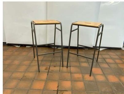
31. M - 2 X WOODEN & METAL VINTAGE HIGH STOOLS