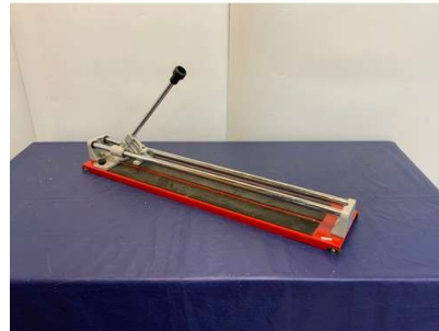
77. M - PROFESSIONAL TILE CUTTER