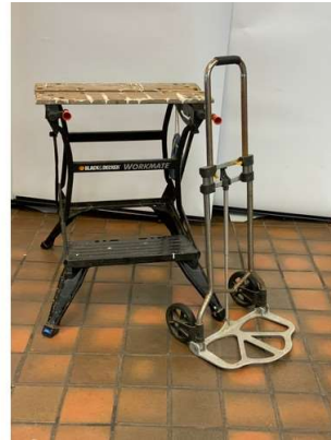
6. M - WORKMATE & TROLLEY