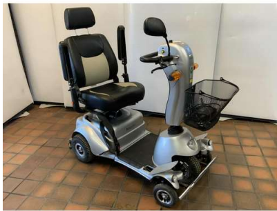
98. M - QUINGO PLUS 8MPH MOBILITY SCOOTER 5 WHEELS ROAD PAVEMENT TURNING CIRCLE IN SILVER WITH CHARGER S/N AE150300233 (NEEDS NEW BATTERY) COST WHEN NEW £1399