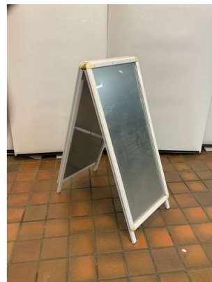
70. M - ALUMINUM A-BOARD PAVEMENT SIGN - COST WHEN NEW APPROX £100