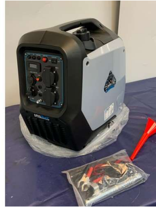
100. M - NEW GORILLA 3500W GP3500i PETROL INVERTER SUITCASE GENERATOR - RRP £499