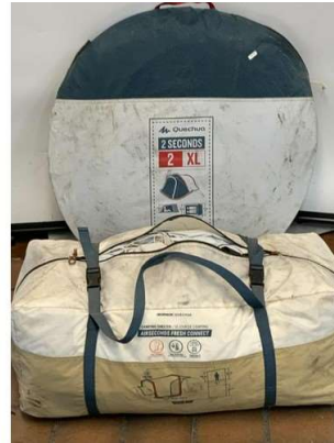
14. M - QUECHUA QUICK TENT & LARGE TENT