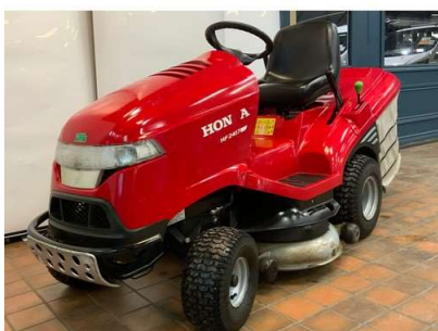
123. V - HONDA HF 2417 HME PREMIUM GARDEN TRACTOR - 101 CM (40") MACHINE WITH HYDROSTATIC DRIVE - COST WHEN NEW £5000