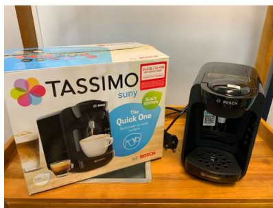
47. V - BOSCH TASSIMO THE QUICK ONE COFFEE MACHINE RRP £119