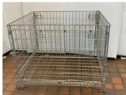
143. M - PALLET CAGE