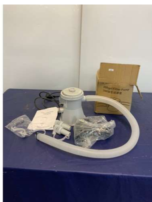
122. M - ELECTRIC SWIMMING POOL FILTER CLEANING PUMP KIT - RRP £42