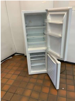
18. M - ESSENTIALS BCD171 FRIDGE FREEZER