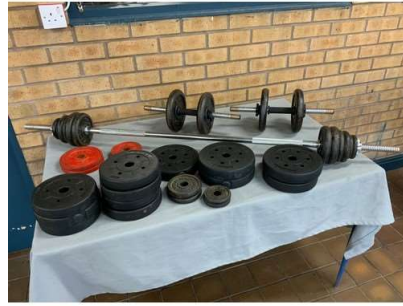
13. M - ADJUSTABLE DUMBBELL AND BARBELL WEIGHT SET