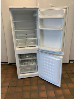
17. M - HOTPOINT FRIDGE FREEZER (FIRST EDITION)R600A COST WHEN NEW £349