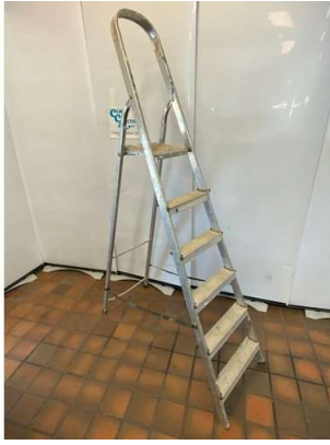
1. M - 6 TREAD ALUMINIUM STEP LADDER