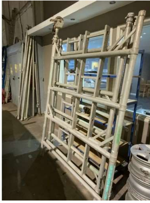
136. M - SCAFFOLDING 1.5M WIDE