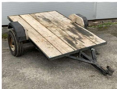
151. M - 5FT X 4FT FLAT PLANT TRAILER