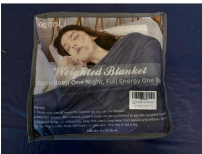
68. M - ZONLI WEIGHTED BLANKET 48" X 72" 15LB GREY RRP £80 (P24011901/IPB/03J)