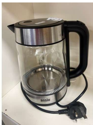
57. V - ANSIO CORDLESS CLEAR KETTLE RRP £29.97