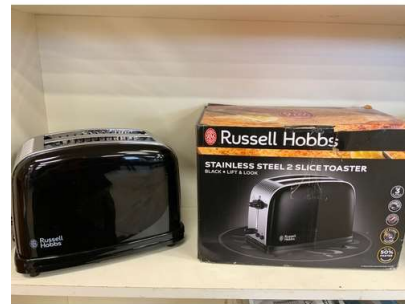
55. V - RUSSELL HOBBS S/S & BLACK 2 SLICE TOASTER IN BOX RRP £35