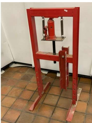
28. M - 6 TONNE BEARING PRESS