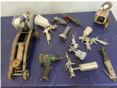
11. M - QUANTITY OF AIR TOOLS/JACK & PULLEY