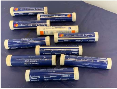
9. M - 10 X TUBES OF LITHIUM GREASE - RRP APPROX £5 PER TUBE