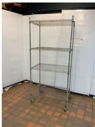
43. M - MOBILE SHELVING UNTI ON CASTERS - COST NEW £100-£300