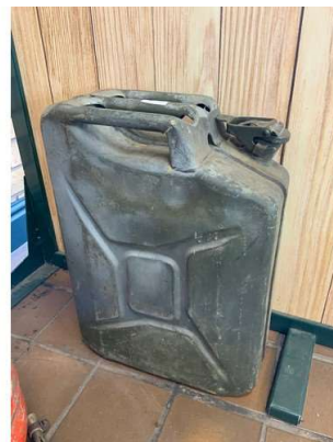
8. M - VINTAGE GERRY CAN