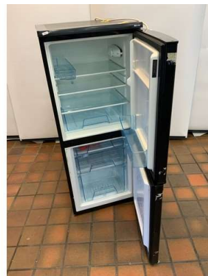
16. M - LEC FRIDGE FREEZER - SERIAL NO D8025278301