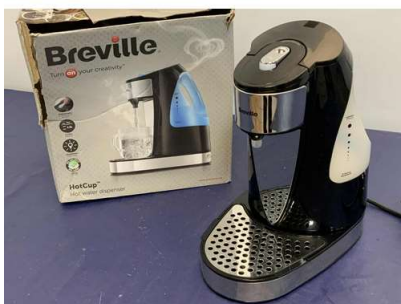
52. V - BREVILLE HOTCUP HOT WATER DISPENSER RRP £47.99