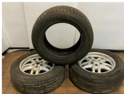
150. M - 2 LANDROVER WHEELS & 3 TYRES 255/60/18