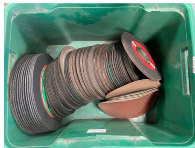
7. V - BOX OF ASSERTED GRINDING DICS