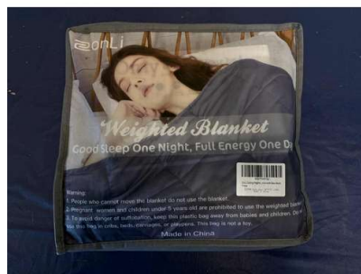
63. M - ZONLI WEIGHTED BLANKET 48" X 72" 15LB GREY RRP £80 (P24011901/IPB/03J)