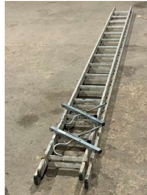
141. M - YOUNGMAN DOUBLE ALU LADDER & HOOKS