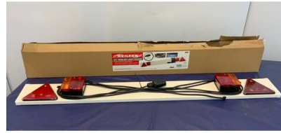
76. V - NEW NEISLON TRAILER LIGHT BOARD - 4FT WITH 5M CABLE (CT4927)