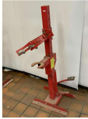
29. M - HYDRAULIC SPRING COMPRESSOR 1 TONNE