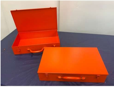
88. M - 2 X METAL TOOL BOXES