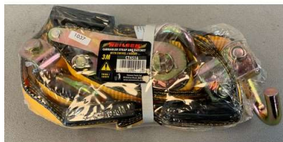
116. V - NEW NEILSON CAR HAULER STRAP & RATCHET 3M WITH SWIVEL 'J' HOOKS (CT4516)