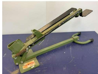
78. M - ECKMAN LOG SPLITTER