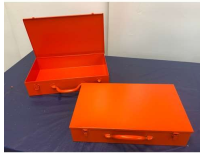
84. M - 2 X METAL TOOL BOXES