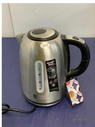
59. V - RUSSELL HOBBS QUIET BOIL S/S KETTLE - RRP £44.99