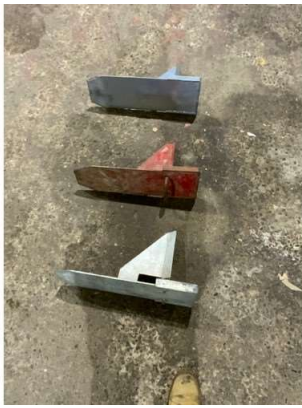
144. M - 3 X STRONG BOYS