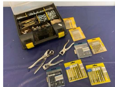
93. M - BOX OF NUTS & BOLTS ETC