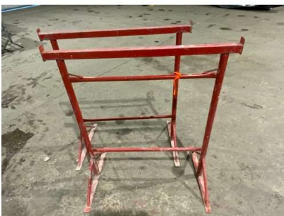
139. V - PR BUILDERS TRESSLES