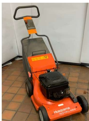
126. V - HUSQVARNA ROYAL 48S 4HP BRIGGS & STATTON PETROL PUSH MOWER - 48CM CUTTING WIDTH