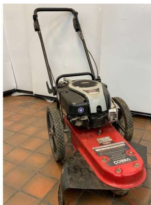
125. M - COBRA 750 EX PETROL WHEELED BRUSHCUTTER / TRIMMER - WT566100 - COST WHEN NEW £440