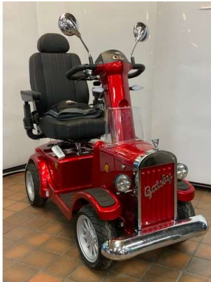
97. M - 2025 EDEN GATSBY MOBILITY SCOOTER - ROAD LEGAL - WITH V5 & KEYS - REG NO 'Q681WRS' ONE OWNER FROM NEW - NEVER BEEN USED. CHASSI NO; GE202502005 - COST NEW £2995