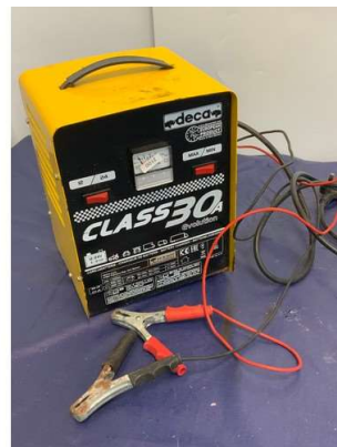
102. M - DECA CLASS 30A - 12V - 24V PORTABLE BATTERY CHARGER - COST NEW £164