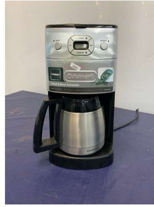
53. M - CUSINART GRIND & BREW AUTMATIC COFFEE MAKER WITH THERMAL CARAFE COST WHEN NEW £185