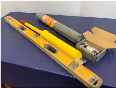
10. M - DEWALT SPIRIT LEVEL, POINTING GUN & SMALL ROLL NETTING & DOOR HANDLE