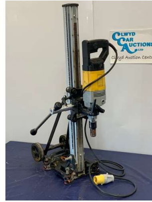
92. V - SEALEY DCD110V 110V CORE DRILL ON STAND - 2300W - COST WHEN NEW £383