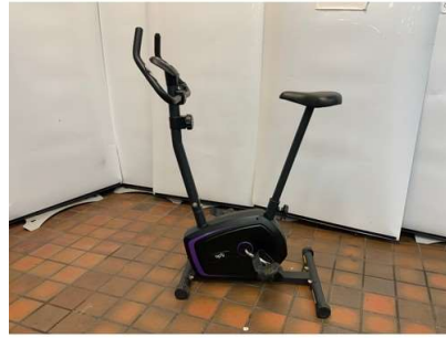
5. M - OPTI EXERCISE BIKE APPPROX RRP £130