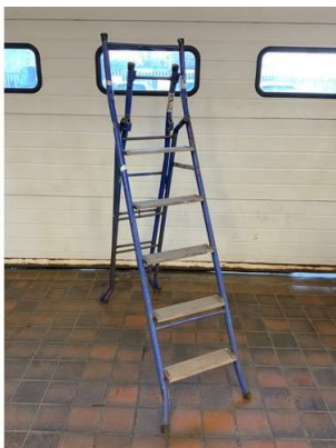
4. M - FOLDING ALU LADDER