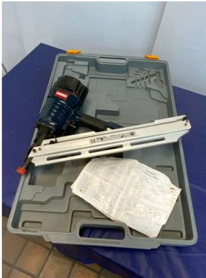
73. M - ROCKWORTH AIR FRAMING NAILER IN CASE