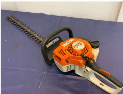
89. M - STIHL HS45 PETROL HEDGE CUTTER