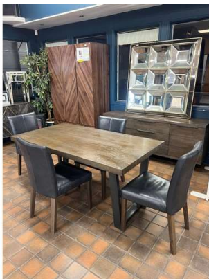
36. M - JOHN LEWIS OAK EFFECT CALIA DINING TABLE & 4 CHAIRS & SIDEBORD TOTAL RRP £2544