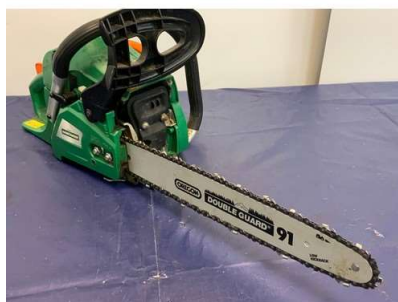
119. M - HAWKSMOOR 41cc 75716 PETROL CHAINSAW