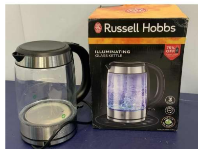
56. V - RUSSELL HOBBS ILLUMINATING GLASS KETTLE RRP £36