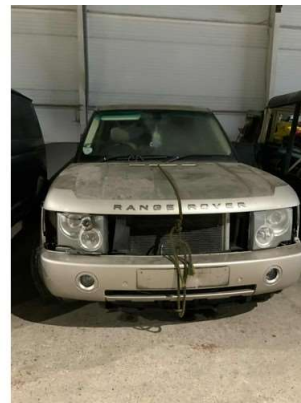
157. M - EARLY 2000'S THIRD GENERATION LAND ROVER RANGE ROVER (L322)- NO KEYS - NO V5 - PLEASE SEE PHOTOS OF ENGINE - NON RUNNER SOLD AS SEEN