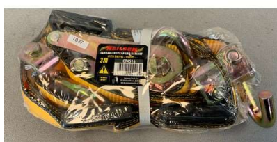
117. V - NEW NEILSON CAR HAULER STRAP & RATCHET 3M WITH SWIVEL 'J' HOOKS (CT4516)