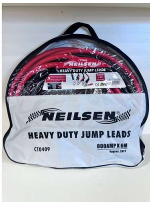
82. V - NEW NEILSEN 800 AMP HD JUMP LEADS 6M - CT0409