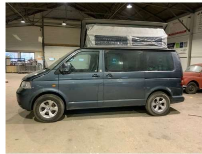
156. M - 2005 VOLKSWAGEN TRANSPORTER T30 TDI 4-M SWB - 2460cc, DIESEL, MANUAL REGISTRATION GJ55EEP . 2 KEYS - CHASSIS NO WV2ZZZ7HZ6X005130 - NO V5 - LOTS OF SERVICE HISTORY - NON RUNNER SOLD AS SEEN