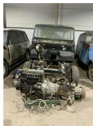
158. M - LANDROVER DEFENDER & ENGINE & GEARBOX - NO REGISTRATION, NO KEYS - NO V5 - NON RUNNER SOLD AS SEEN