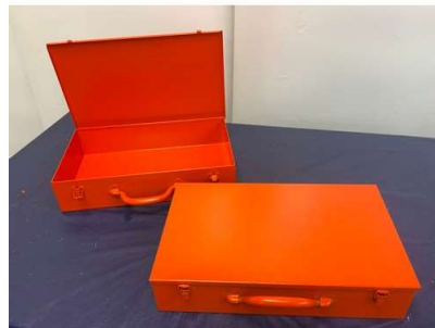
85. M - 2 X METAL TOOL BOXES