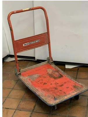
30. M - CLARKE FLAT BED TROLLEY