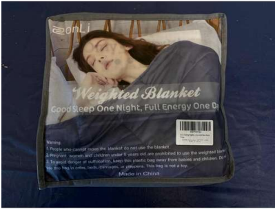
65. M - ZONLI WEIGHTED BLANKET 48" X 72" 15LB GREY RRP £80 (P24011901/IPB/03J)