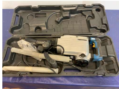
38. M - WORKZONE DEMOLITION 240V BREAKER - ZIG-DS-65D SIMILAR RRP £235