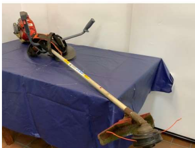
120. M - EFCO STARK 2500T PETROL BRUSH CUTTER