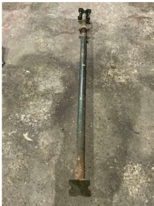
145. M - ACRO PROP