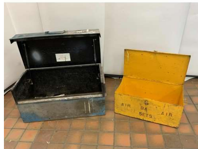
15. M - STEEL LOCKABLE TOOL VAUNT & LARGE STEEL TOOL VAULT