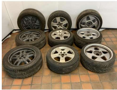
148. M - 9 VARIATIONS OF ALLOY WHEELS & TYRES