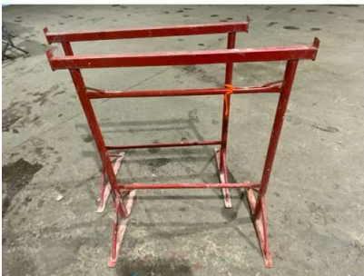
138. V - PR BUILDERS TRESSLES