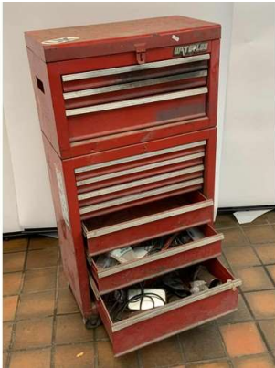
26. M - WATERLOO 10 DRAWER TOOL CHEST