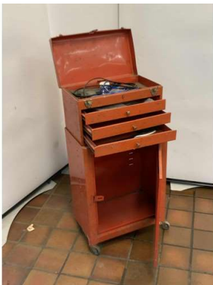
27. M - CLARKE 3 DRAWER TOOL CHEST/CABINET