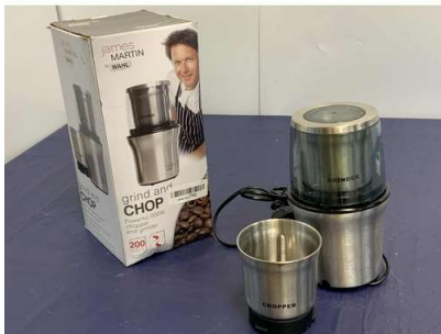
51. V - WAHL JAMES MARTIN CHOP AND GRIND FOOD PROCESSOR RRP £29.99