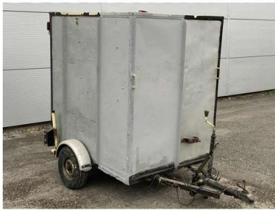
152. M - 5FT X 4FT BOX TRAILER AND CONTENTS