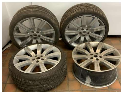
149. M - SET OF 4 WHEELS & 3 TYRES FOR RANGE ROVER 265/35/R22