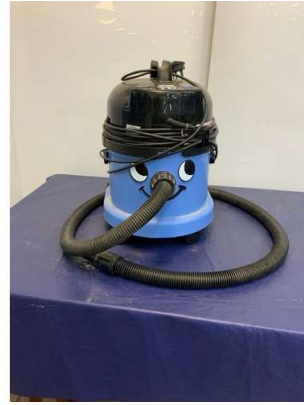
68A. M - NUMATIC CHARLES WET & DRY VAC CLEANER