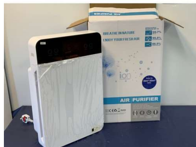
40. M - 'NEW' ION AIR PURIFIER WITH REMOTE CONTROL