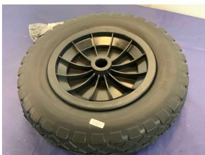
121. M - WHEEL BARROW WHEEL