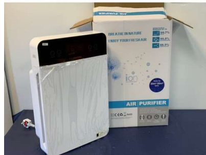
39. M - 'NEW' ION AIR PURIFIER WITH REMOTE CONTROL