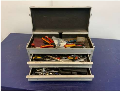
72. M - TOOL BOX & TOOLS