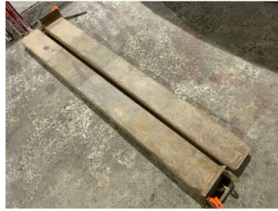
140. V - PAIR OF FORKLIFT EXTENSION FORKS