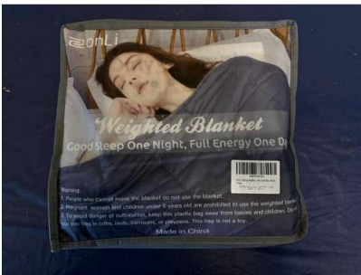
66. M - ZONLI WEIGHTED BLANKET 48" X 72" 15LB GREY RRP £80 (P24011901/IPB/03J)