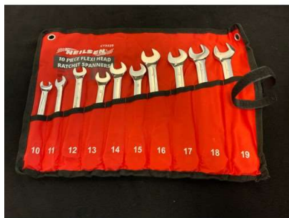
112. V - NEW NEILSEN 10PC FLEXI-HEAD COMBINATION RATCHET SPANNER SET CT3229