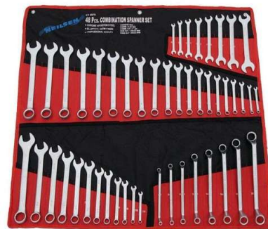
101. V - NEW NEILSEN 48 PIECE FULL POLISH FINISH SPANNER SET - CT0876