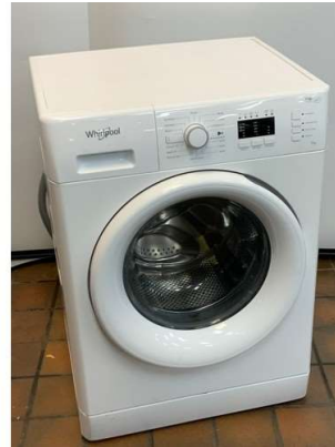
22. M - WHIRLPOOL FRESHCARE+ 7KG WASHING MACHINE - COST WHEN NEW £329