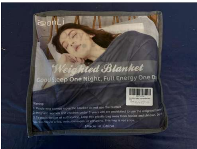
67. M - ZONLI WEIGHTED BLANKET 48" X 72" 15LB GREY RRP £80 (P24011901/IPB/03J)