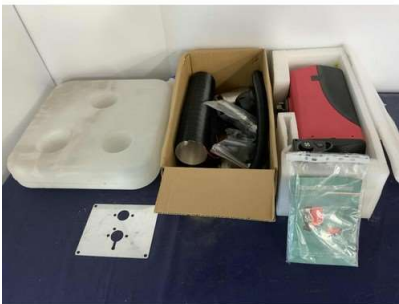
74. M - 5KW - 8KW 12V AIR DIESEL VEHICLE HEATER SET 4 HOLES. RRP £82.99