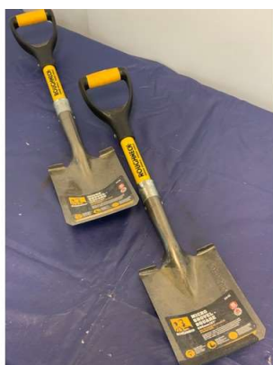
114. M - 2 X ROUGHNECK SHOVELS