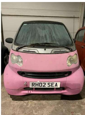
154. M - 2003 SMART CITY PULSE 61 AUTO- 698cc 2 DOOR COUPE PETROL REGISTRATION RH02SEA WITH KEY - CHASSIS NO WME4503322J027994 - NO V5 - NON RUNNER SOLD AS SEEN