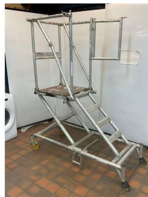
24. V - YOUNGMAN ADJUSTA MINIT PODIUM STEP PLATFORM - COST NEW £1007