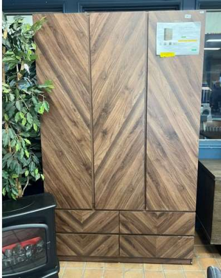
34. V - CATANIA 3 DOOR ,4 DRAWER WARDROBE RRP £329.99