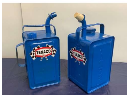
113. M - 2 X VINTAGE FUEL CANS