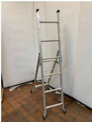
3. M - ALU STAIR LADDER