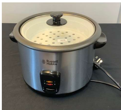
48. V - RUSSELL HOBBS RICE COOKER & STEAMER MODEL 19750 - RRP £39.99