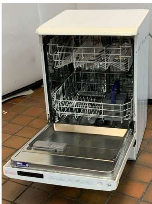
20. M - BEKO DISHWASHER - DSNF 1534 W RRP £295