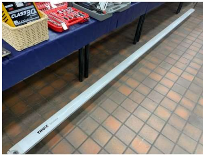
96. M - THULE OMNISTAR ROLL ONT VAN, MOTORHOME AWNING