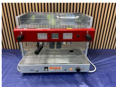
115. M - BRASILIA FIRENZE 2 GROUP ESPRESSO GROUP COFFEE MACHINE WITH DUAL STEAM WANDS & HOT WATER TAP - COST WHEN NEW £1500