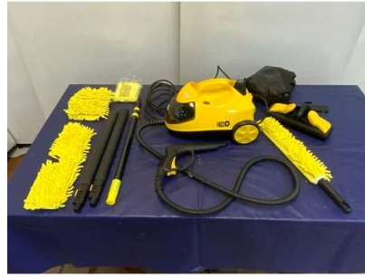
37. M - LITTLE YELLO STEAMER & ACCESSORIES