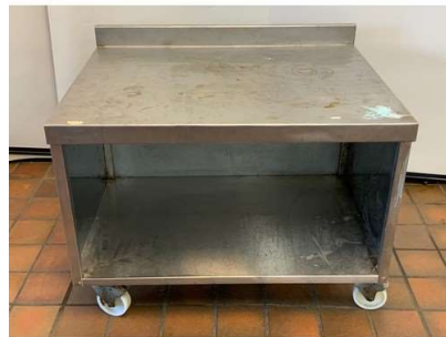
142. M - S/S CUPBOARD/TROLLEY