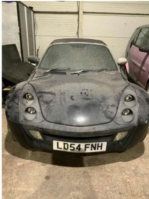
153. M - 2004 SMART ROADSTER COUPE 80 AUTO RH PETROL - 698cc 2 DOOR, REG NO ' LD54FNH ' CHASSIS NO WME4523342L021695 WITH KEY & V5. SH 13 STAMPS, LAST RECORDED MILEAGE 2018 101,269 MILES - NON RUNNER SOLD AS SEEN