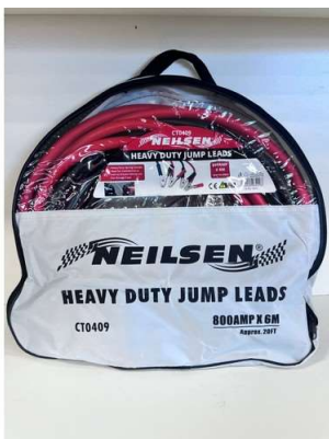
83. V - NEW NEILSEN 800 AMP HD JUMP LEADS 6M - CT0409