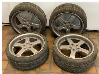
147. M - SET OF 4 - 5 STUD ALLOYS WHEELS & TYRES 235/35/19