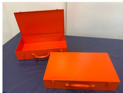
86. M - 2 X METAL TOOL BOXES