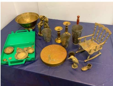
12. M - QUANTITY OF BRASS WEIGHTS ETC