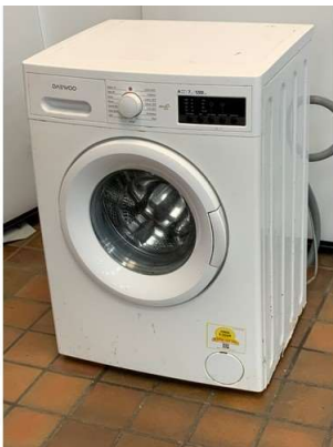
19. M - DAEWOO 7KG WASHING MACHINE - DWDFV2221 COST APPROX WHEN NEW £270