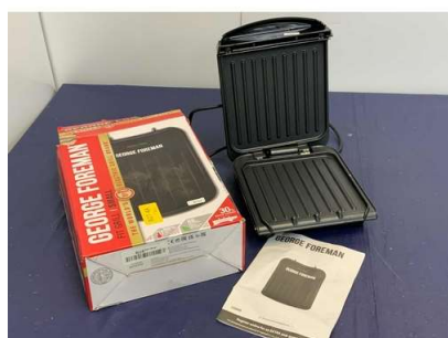
58. V - GEORGE FOREMAN FIT GRILL/SMALL RRP £19.99