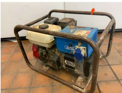
75. V - STEPHILL 2700HMS INDUSTRIAL PETROL GENERATOR