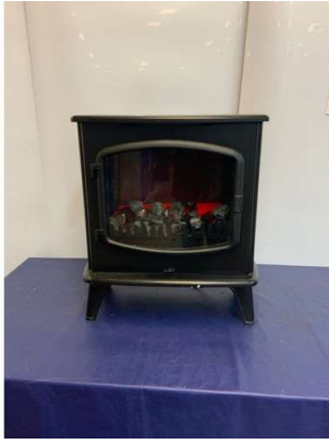
33. M - VALOR ELECTRIC LOG FIRE