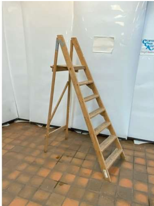
2. M - WOODEN STEP LADDER