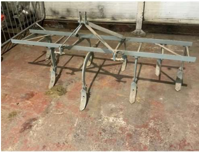
142. M - FERGUSON CULTIVATOR