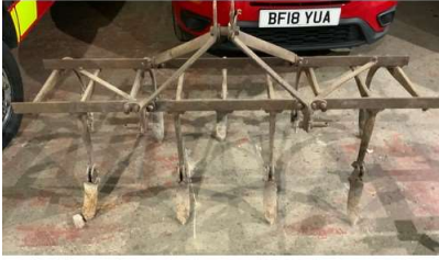
141. M - FERGUSON CULTIVATOR