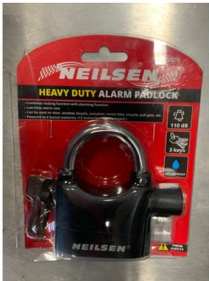
82. V - NEW NEILSEN HEAVY DUTY ALARM PADLOCK (CT3870)