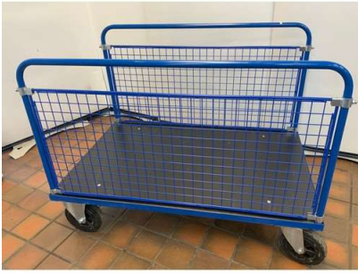
117. M - BLUE MESIT SIDE TROLLEY - RRP £292