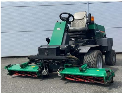
146. V - 2007 RANSOME MOWING MACHINE, 90" CYLINDER, REGISTRATION - ' AU56HRA ' DIESEL KABUTO ENGINE WITH V5 DOCUMENTS. - 1709.2 HOURS