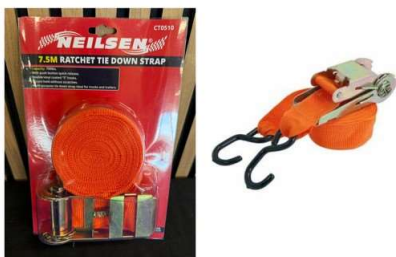
77. V - NEW RATCHET TIE DOWN STRAP - 7.5M (CT0510)