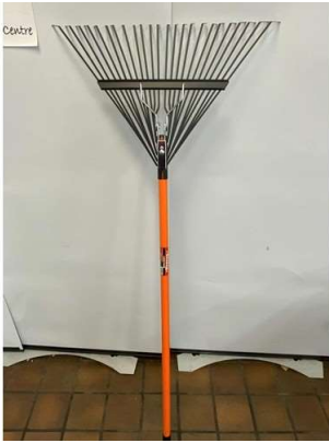
106. V - NEW NEILSEN LAWN RAKE - CT4281