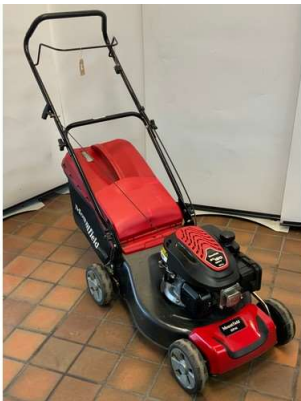
120. V - MOUNTFIELD CSL 484 HP46 PETROL PUSH MOWER 46CM CUTTING WIDTH, 60LTR GRASS COLLECTOR. COST NEW £289