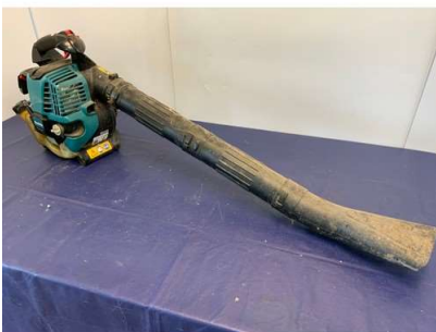
112. M - MAKITA BHX 2500 PETROL BLOWER RRP £949