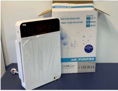
41. M - 'NEW' ION AIR PURIFIER WITH REMOTE CONTROL