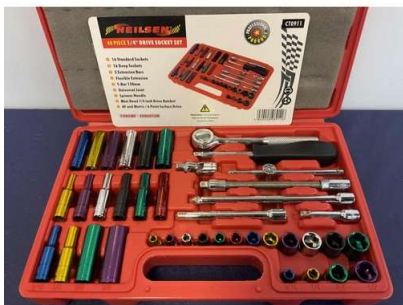
161. V - NEW NEILSEN SOCKET SET - 40 PIECE 1/4 IN DRIVE - CT0911