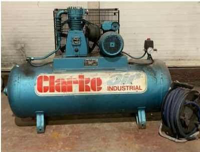
138. M - CLARKE SINGLE PHASE WORKSHOP COMPRESSOR & AIR HOSE MODEL SE16C150 COST OF NEW MODEL £1001.94