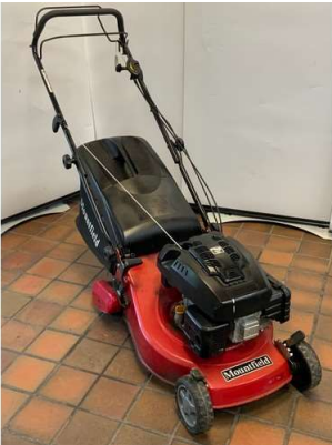
123. V - MOUNTFIELD RM45 SP ROLLER DRIVE PETROL MOWER - 140cc - COST WHEN NEW £449