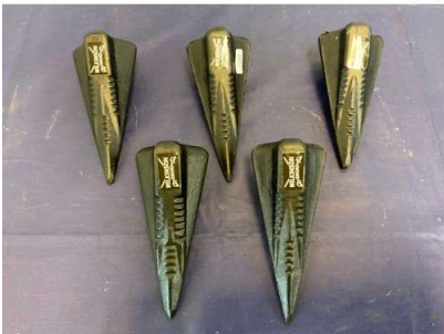
84. V - 5 X WILKINSON SWORD 16CM GRENADE WOOD SPLITTER - RRP £17.99 EACH - TOTAL RRP £89.95