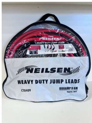
65. V - NEW NEILSEN 800 AMP HD JUMP LEADS 6M - CT0409