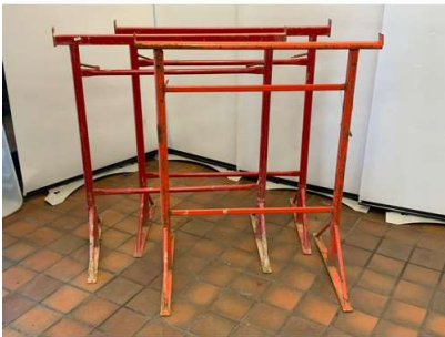
136. V - 3 BUILDERS TRESTLES