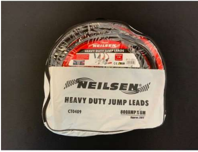
25. V - NEW NEILSEN 800 AMP HD JUMP LEADS 3M (CT0408)