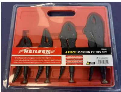
23. V - NEW NEILSEN LOCKING PLIERS - 4 PIECE SET - CT0980