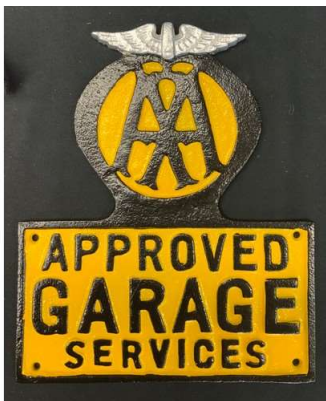
167A. V - AA CAST WALL SIGN 29CM