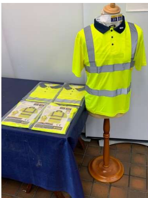
104. M - 5 X HYVIS YELLOW POLO SHIRTS SIZE M TOTAL RRP APPROX £65-70