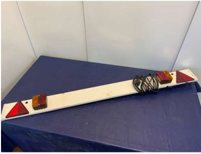
109. M - 5FT TRAILER LIGHT BOARD