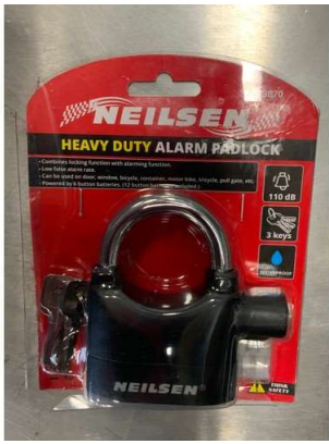
81. V - NEW NEILSEN HEAVY DUTY ALARM PADLOCK (CT3870)