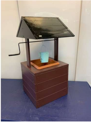
45. M - WOODEN GARDEN WELL