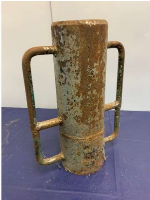
135. M - POST KNOCKER