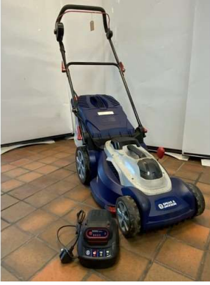
121. V - SPEAK AND JACKSON CORDLESS II-ion LAWN MOWER - COST WHEN NEW £330