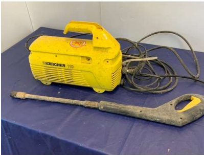
6. M - KARCHER 110 PRESSURE WASH COST WHEN NEW APPROX £85