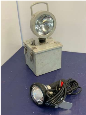
18. M - VINTAGE PORTABLE LAMP & HANDHELD MARINE SPOTLIGHT