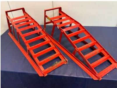
116. M - PAIR OF CAR RAMPS