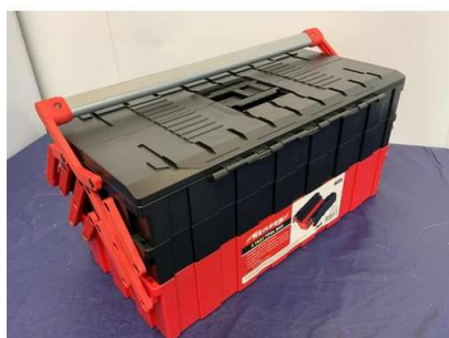
75. V - NEW NEILSEN TOOL BOX PLASTIC 5 TRAYS (5055282064672) CT6467