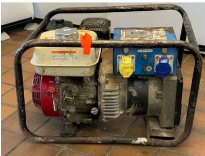
43. V - STEPHILL 2.7KVA 2KW GENERATOR 110V & 240V