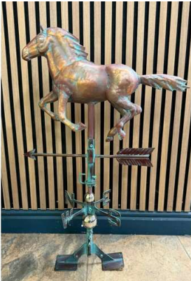
167. V - NEW 3D HORSE WEATHERVANE 98CM