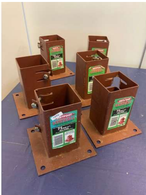
8. M - 6 X 75MM META POSTS TOTAL COST NEW APPROX £85-90