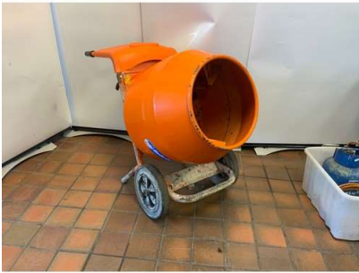
118. M - BELLE MINIMIX 150 PETROL MIXER - COST WHEN NEW £850+