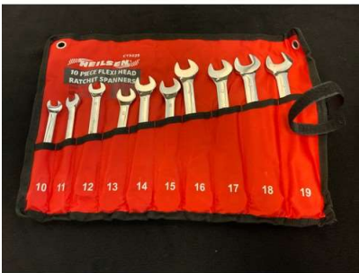
155. V - NEW NEILSEN 10PC FLEXI-HEAD COMBINATION RATCHET SPANNER SET CT3229