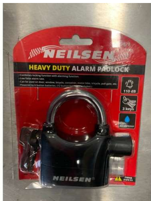
80. V - NEW NEILSEN HEAVY DUTY ALARM PADLOCK (CT3870)