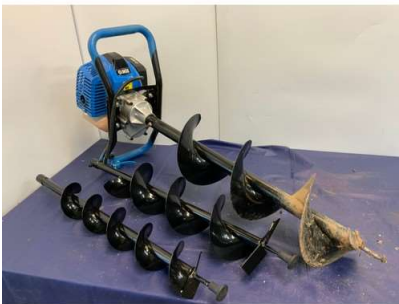
107. M - SGS PETROL HOLE AUGER MODEL GPA520 COST NEW £160