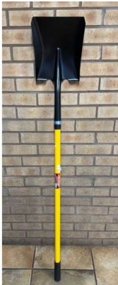
27. V - NEW NEILSEN SQUARE SHOVEL - 58" WITH FIBRE GLASS HANDLE & RUBBER GRIP (CT1149)