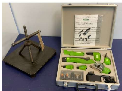
32. M - HANDY MULTI JIGSAW TOOL & AUSTIN MINI CLUTCH TOOL