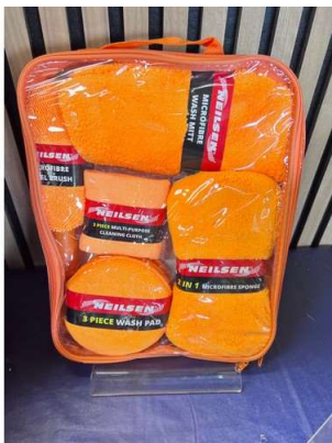
74. V - NEW NEILSEN 9 PIECE CAR WASH CLEANING TOOL KIT - CT6225