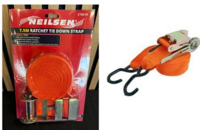
78. V - NEW RATCHET TIE DOWN STRAP - 7.5M (CT0510)