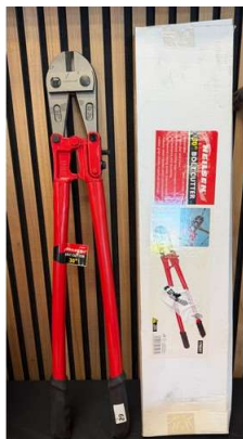
29. V - NEILSON 30" RED BOLT CUTTER (CT0297)