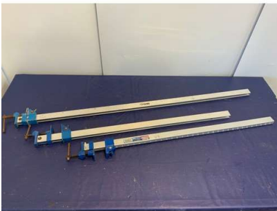
110. M - 3 SASH CLAMPS