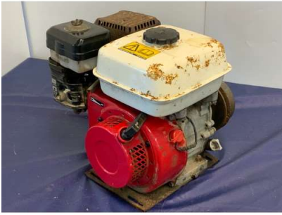
17. M - HONDA GX PETROL ENGINE