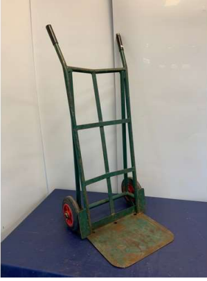
129. M - SACK TRUCK