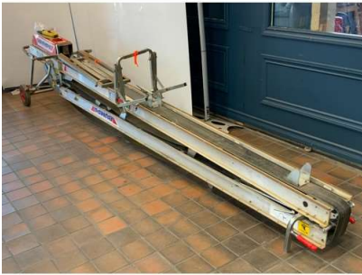
130. V - BUMPA 8M ELECTRIC HOIST 2019 S/N -1437419 - COST WHEN NEW £4400