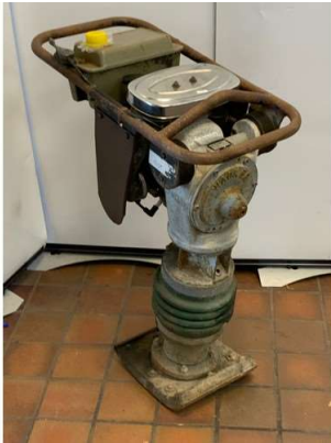
46. M - 'JUMPING JACK' TRENCH WACKER - COST WHEN NEW £2300