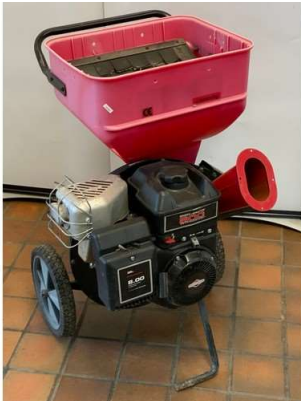
119. V - BRIGGS & STRATTON 800 INTEK SERIES PETROL CHIPPER COST WHEN NEW APPROX £850-1100