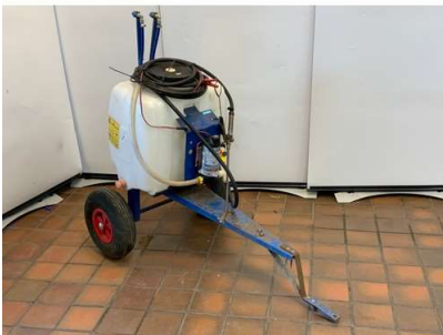
148. M - TOWABLE TRAILED SPRAYER 12V - 30-40 LITRE - COST WHEN NEW APPROX £680