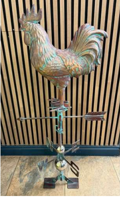
166. V - NEW 3D ROOSTER WEATHERVANE 114cm