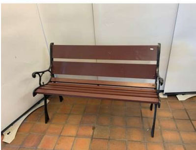
44. M - 5FT GARDEN BENCH