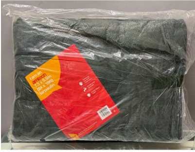
97. V - NEW 24 X 18 TARPAULIN SHEET - GREEN (S4930)