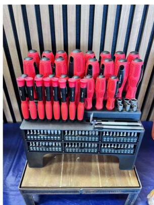
159. V - NEW NEILSEN 100 PIECE SCREWDRIVER BITS SET - CT2551