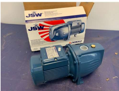
20. M - PEDROLLO JSW 18 ELECTRIC WATER PUMP COST NEW £308