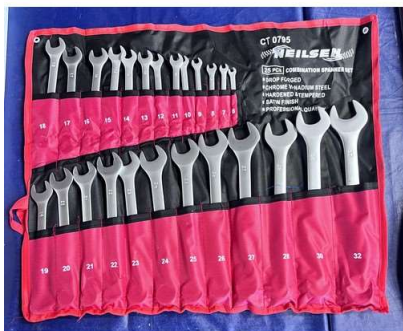
157. V - NEW NEILSEN 25 PIECE SATIN FINISH SPANNER SET - CT0795