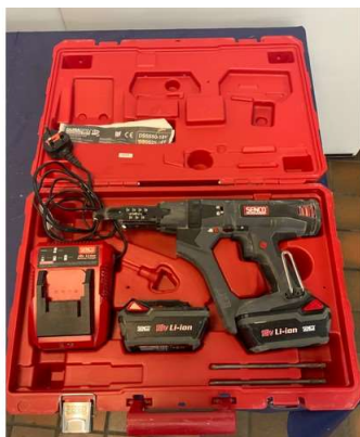
31. M - SENCO DS5550 DRYWALL 18V AUTOFEED CORDLESS SCREWDRIVER -COST WHEN NEW £534