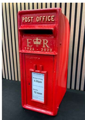
162. V - NEW ER 1926-2022 CAST POST BOX RED 57CM WITH KEY