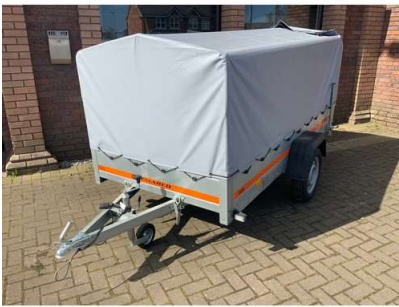
143. M - TEMARED ECO 8X4 TIPPING LIGHTWEIGHT TRAILER WITH COVER. COST NEW APPROX £1500