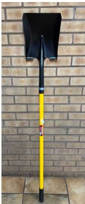
28. V - NEW NEILSEN SQUARE SHOVEL - 58" WITH FIBRE GLASS HANDLE & RUBBER GRIP (CT1149)