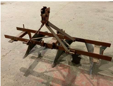
140. M - 2 ROW RIDGER