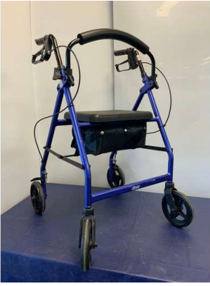
153. M - DRIVE MEDICAL 4 WHEEL WALKER WITH SEAT/STORAGE WITH LOCKING BRAKES COST NEW £61.99