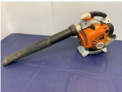
111. V - STIHL BG86X PETROL BLOWER RRP £329.99