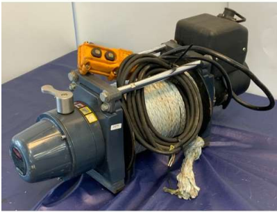
26. M - KINGONE TDS -12.0 WINCH 1200LB 12VDC HOIST - COST WHEN NEW £700-£950