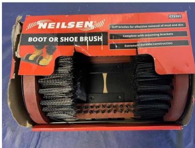
63. V - NEW NEISLEN SHOE BRUSH CT3101