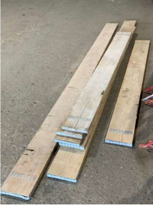
137. V - 7 X SCAFFOLD BOARDS - MIXED LENGTHS