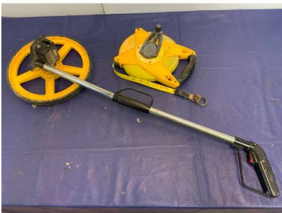
19. M - SURVEYORS MEASURING WHEEL & 200FT TAPE MEASURE