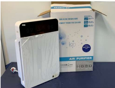
42. M - 'NEW' ION AIR PURIFIER WITH REMOTE CONTROL