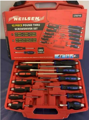
154. V - NEW NEILSEN SCREWDRIVER SET - 12 PIECE FLAT/PHILIPS COMBINATION - CT0710