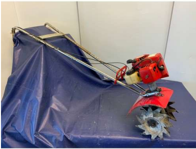
114. M - MANTIS PETROL CULTIVATOR COST NEW APPROX £550