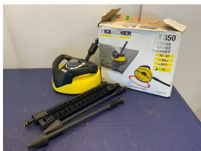
30. M - KARCHER T350 PARIO CLEANER ATTACHEMENT COST NEW APPROX £100