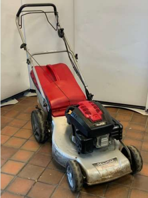
122. V - MOUNTFIELD SP533 SELF PROPELLED 51CM CUTTING WIDTH WITH COLLECTION BOX COST APPROX £400