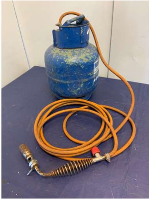
5. M - PORTABLE SOLDERING TORCH SET WITH CALOR GAS BUTANE CYLINDER