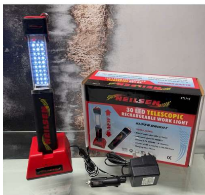
67. V - NEW 30 LED TELESCOPIC RECHARGEABLE WORK LIGHT (CT1742)