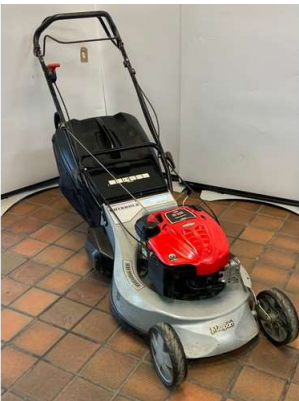
124. V - MASPORT ROTAROLA SP ROLLER DRIVE PET MOWER 54CM CUT,18-62MM CUTTING HEIGHT WITH 65 LTR COLLECTION. RRP £1049