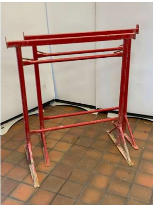
132. V - 2 BUILDERS TRESTLES