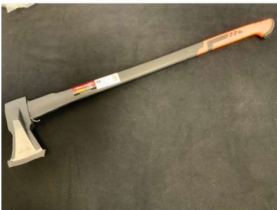
83. V - NEW NEILSON 200G AXE WITH FIBERGLASS HANDLE CT2534