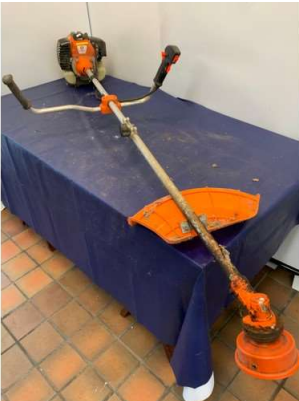
115. M - PETROL BRUSH CUTTER(PARKER) MODEL PGBC-5200 APPROX COST NEW £80-110