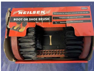
64. V - NEW NEISLEN SHOE BRUSH CT3101