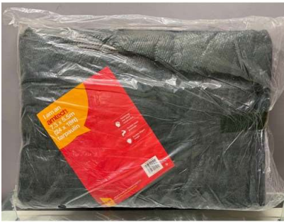
98. V - NEW 24 X 18 TARPAULIN SHEET - GREEN (S4930)