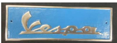
164. V - VESPA ALU PLAQUE 43CM