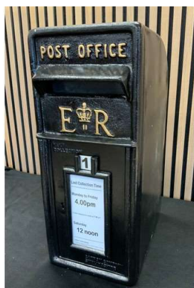
163. V - NEW ER ROYAL MAIL CAST POST BOX - BLACK 57CM - WITH KEY