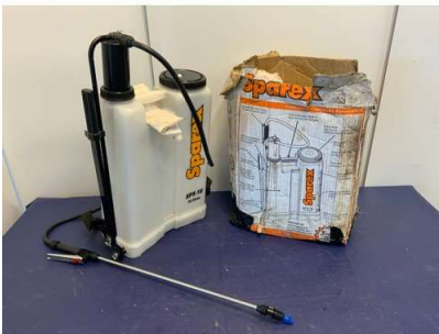
7. M - SPAREX SPX 16 - 16 LTR BACK PACK SPRAYER - COST NEW £126