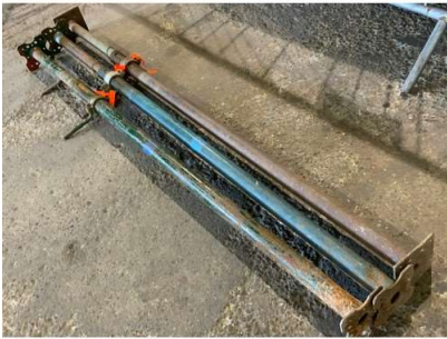
134. V - 3 X ACRO PROPS