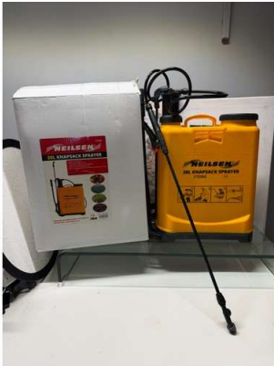
99. V - NEW NEILSEN 20 LITRE GARDEN SPRAYER WITH CARRY STRAPS, HEAVY DUTY TRIGGER CONTROL (CT2352)