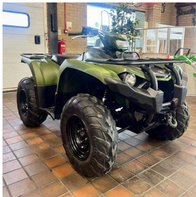
147. M - 2022 YAMAHA KODIAK 450 DIFFLOCK 4X4 QUAD - FITTED WINCH - 1157.4 HOURS - NO VAT