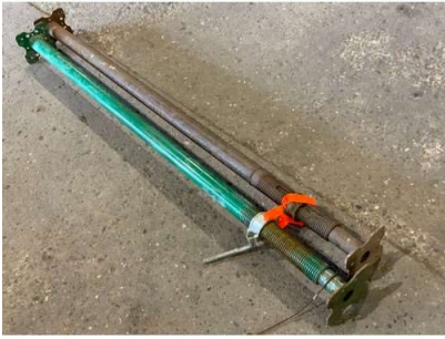
133. V - 2 X ACRO PROPS