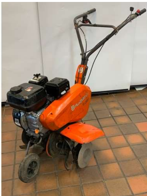
144. V - HUSQVARNA TF325 PETROL TILLER CULTIVATOR - COST WHEN NEW £ 459