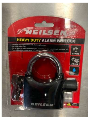
79. V - NEW NEILSEN HEAVY DUTY ALARM PADLOCK (CT3870)