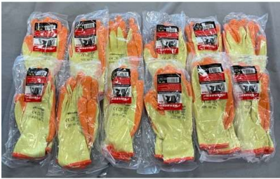
34. V - NEW NEILSEN 12 X CRINKLE LATEX COATED WORK GLOVE SIZE: 10" XL SINGLE (CT4970)