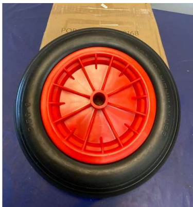
108. M - SOLID WHEEL BARROW WHEEL