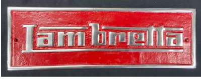
165. V - LAMBRETТА PLAQUE 43CM