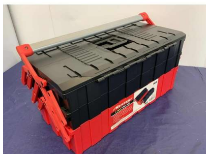
76. V - NEW NEILSEN TOOL BOX PLASTIC 5 TRAYS (5055282064672) CT6467