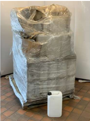
139. V - PALLET OF PLASTIC 15 LT WATER STORAGE CONTAINERS