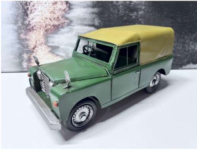
202. V - RETRO 4X4 GREEN JEEP MODEL VEHICLE