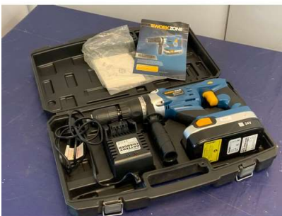
105. M - WORKZONE 24V CORDLESS DRILL IN CASE COST NEW £30