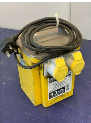
12. M - 3.3KVA 110V TRANSFORMER