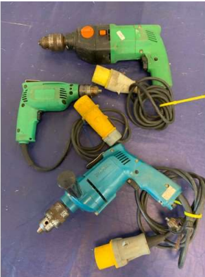
2. M - HITACHI 110V DRILL / PISTOL GRIP DRILL & MAKITA 110V DRILL