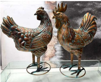
192. V - PAIR OF AGED COPPER VERDIGRIS FINISH 3D ROOSTER & HEN STATUES ON HEAVY METAL BASE - 48cm