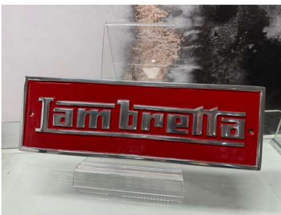
181. V - LAMBRETTA PLAQUE 43CM