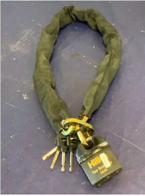
106. M - HILKA LOCK & CHAIN 1M COST NEW £36.25