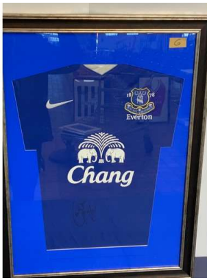
174. M - SIGNED EVERTON SHIRT - DUNCAN FERGUSON - 4TH OCTOBER 2025