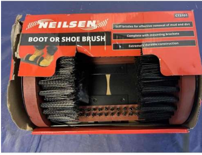
158. V - NEW NEILSEN SHOE BRUSH CT3101