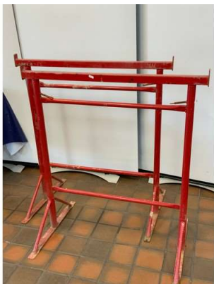
77. V - PR BUILDER TRESTLES