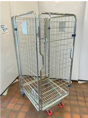
69. M - LARGE CAGED TROLLEY -COST WHEN NEW £150 - £300