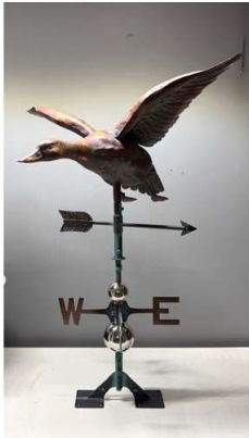
183. V - COPPER FLYING DUCK / GOOSE WEATHERVANE - 99cm