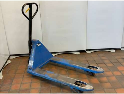
71. M - HANDIPAL BLUE PALLET TRUCK - 2500KG