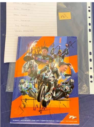
204. M - SIGNED PROGRAM T/T 2024