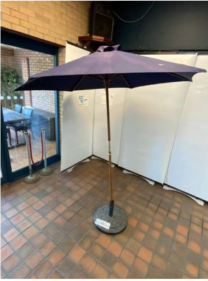
66. M - BLUE PARASOL (NO STAND)