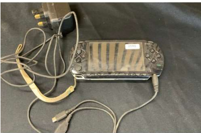
16. M - PSP GAMING CONSOLE WITH CHARGER - COST WHEN NEW £179