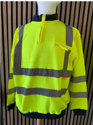
136. M - HI-VIZ QUARTER ZIP YELLOW & BLACK SWEATSHIRT - SIZE XL