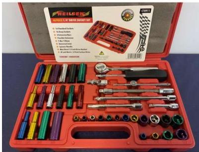
92. V - NEW NEILSEN SOCKET SET - 40 PIECE 1/4 IN DRIVE - CT0911