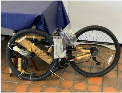
175. M - 24" HYPER SHOC FULL SUSPENSION BIKE cost new £300