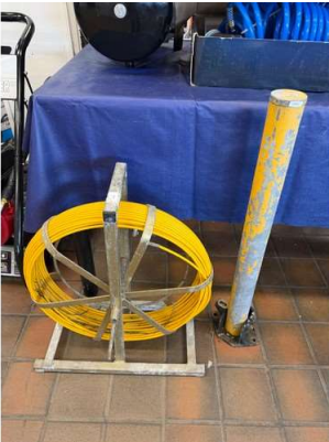
15. M - COIL OF DUCT ROD FISH TAPE ON REEL & SECURITY POST