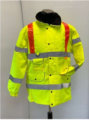
114. M - HI VIS YELLOW COAT SIZE M COST NEW APPROX £50-60