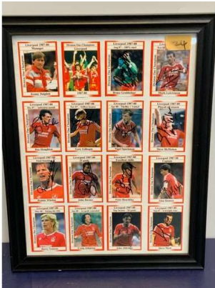
195. M - SIGNED LIVERPOOL CARD - 1987/88