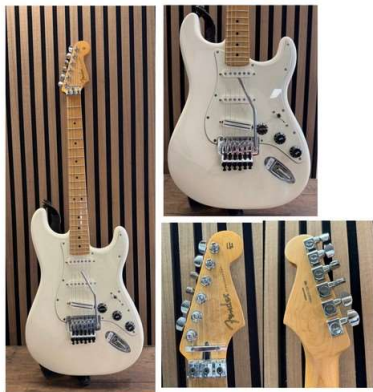
213. M - 2019 FENDER PIAYER STRATOCASTER®, MAPLE FINGERBOARD, POLAR WHITE MODEL 0144502515 - SERIAL NUMBER MX18189842 - IN CASE - COST WHEN NEW £689