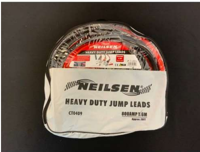
161. V - NEW NEILSEN 800 AMP HD JUMP LEADS 3M (CT0408)