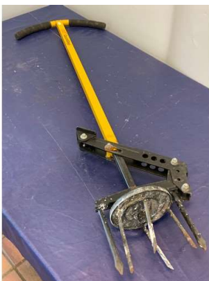
19. M - ALKO QUICK STEP GARDEN WEEDER / CULTIVATOR