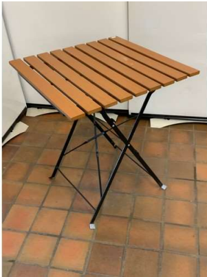
211. M - FOLDING TABLE