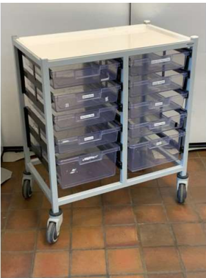
27. M - PORTABLE TROLLEY - COST WHEN NEW £750 -£1500