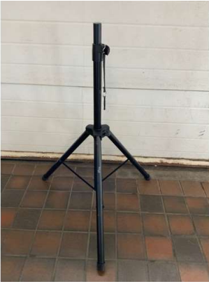
64H. M - STAGG SPEAKER STAND