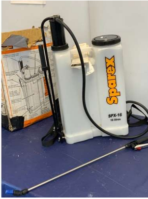
29. M - SPAREX BACK PACK SPRAYER