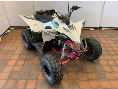
225. M - 2019 QUADZILLA SPIDER 110 JUNIOR ATV FEATURING 111CC 4 STROKE ENGINE, FULLY AUTOMATIC WITH REVERSE & ELECTRIC START. COST WHEN NEW £1299