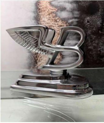
190. V - FLYING BENTLEY 'B' MASCOT