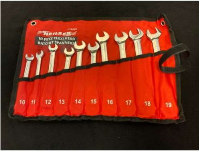
84. V - NEW NEILSEN 10PC FLEXI-HEAD COMBINATION RATCHET SPANNER SET CT3229