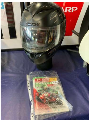
208. M - SIGNED MOTORBIKE HELMET - BSB 2019, SEPT WITH PROGRAMME & TICKET