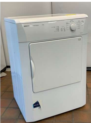
24. M - BEKO 6KG SENSOR DRYER - MODEL DRVS 62W - COST WHEN NEW APPROX £240