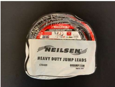
160. V - NEW NEILSEN 800 AMP HD JUMP LEADS 3M (CT0408)