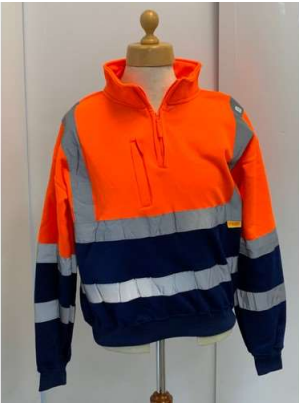
135. M - HI VIS ORANGE SWEATSHIRT 1/4 ZIP SIZE L COST NEW APPROX £23