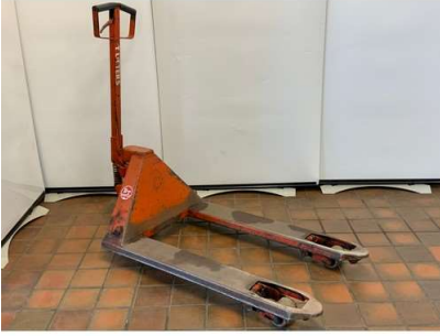
70. M - BT LIFTERS ORANGE PALLET TRUCK