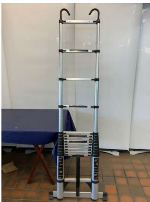
20. M - TELESCOPIC ALU LADDER