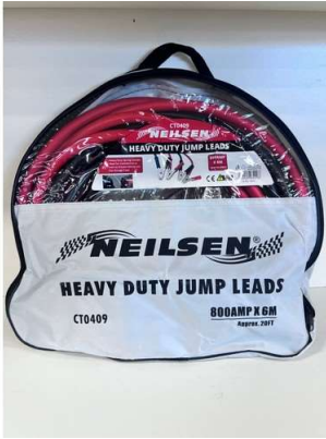
94. V - NEW NEILSEN 800 AMP HD JUMP LEADS 6M - CT0409