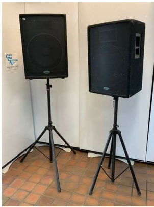
41. M - PAIR OF MPX2CD McGREGOR AMPLIFICATION ON STANDS - COST WHEN NEW £650