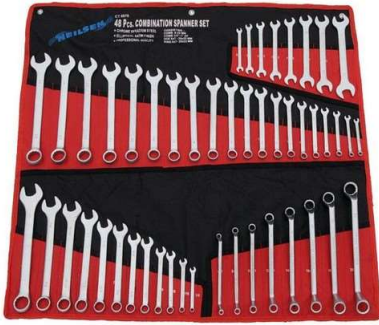
98. V - NEW NEILSEN 48 PIECE FULL POLISH FINISH SPANNER SET - CT0876