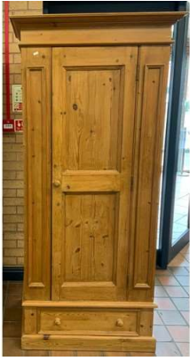
33. M - PINE SINGLE ROBE