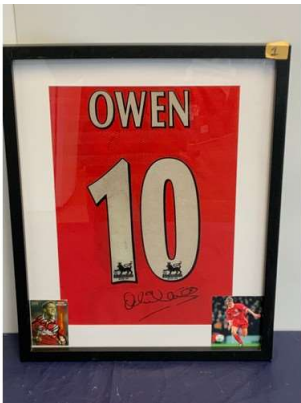
188. M - SIGNED LIVERPOOL SHIRT - MICHAEL OWEN - SIGNED AT HAWARDEN PRIMARY SCHOOL 2010/2011