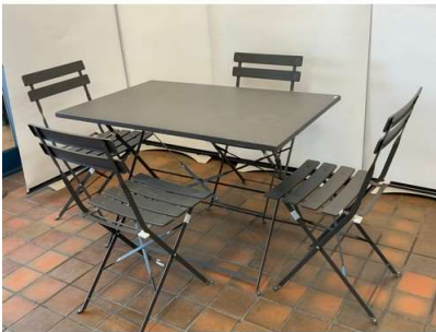
65. M - METAL BISTRO GARDEN TABLE & 4 CHAIRS - COST WHEN NEW APPROX £180