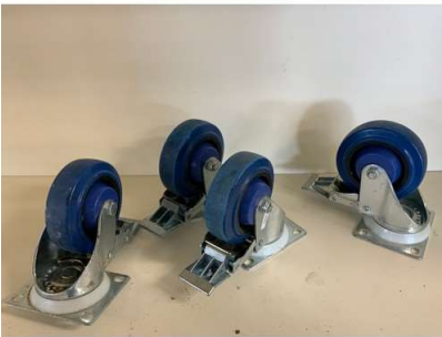
4. M - 4 X HD INDUSTRIAL SWIVEL CASTORS - COST NEW APPROX £14 EACH