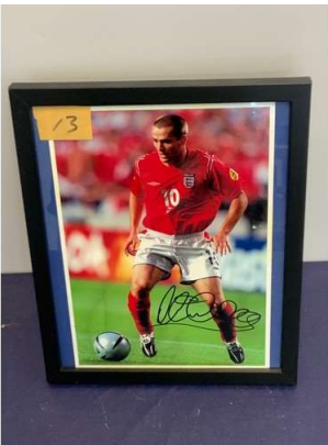
203. M - SIGNED PHOTO - MICHAEL OWEN