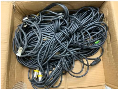
64J. M - BOX OF MICROPHONE LEADS