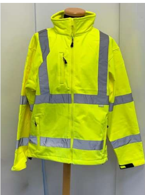
129. M - HI VIS SOFTSHELL YELLOW COAT SIZE S RRP APPROX £45