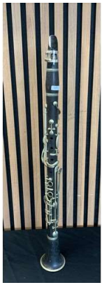
206. M - Jérôme Thibouville-Lamy (JTL) CLARINET - PRE 1950'S - MADE OF WOOD - SIMILAR ONLINE £450