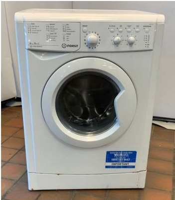
26. M - INDESIT 6KG WASHER / 5KG DRYER MODEL IWDC6125 - COST WHEN NEW £359