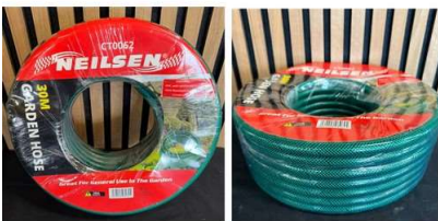
165. V - NEILSON GARDEN HOSE 30 METRE (CT0062)