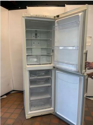
35. M - HOTPOINT AIRTEC EVOLUTION FRIDGE FREEZER - MODEL EXPL1810 -COST WHEN NEW £379