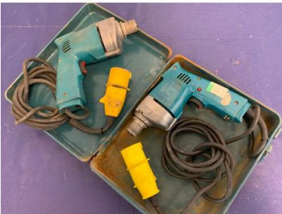
3. M - 2 X 110V MAKITA TEC GUNS