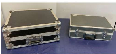
44. M - 2 X ALUMINIUM BOUND FLIGHT CASES (AMERICAN AUDIO BEHRINGER) + VANGUARD)