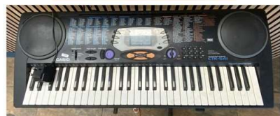
43. M - CASIO CTK 541 ELECTRONIC KEYBOARD WITH STAND - COST WHEN NEW IN 1990'S APPROX £200