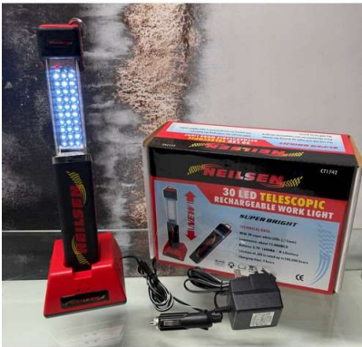
103. V - NEW 30 LED TELESCOPIC RECHARGEABLE WORK LIGHT (CT1742)