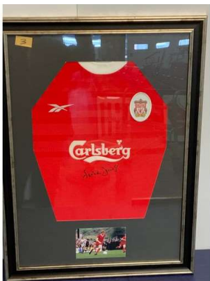
185. M - SIGNED LIVERPOOL SHIRT - DAVID FAIRCLOUGH