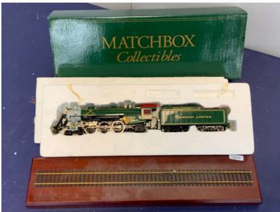
200. M - DECORATIVE TRAIN