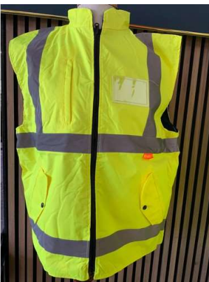
121. M - HI VIZ BODY WARMER - SIZE XL