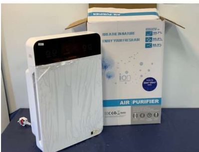
141. M - 'NEW' ION AIR PURIFIER WITH REMOTE CONTROL