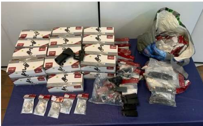
7. M - QUANTITY OF TRACK LIGHTING WITH FITTINGS (26 x THREE CIRCUIT UNITY 1 LED MAINS LIGHT IN BOX COST NEW £60-£80 EACH TOTAL ££1560-£2080 & ACCESSORIES)