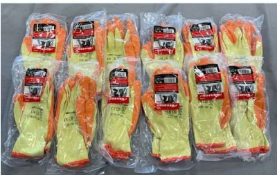
86. V - NEW NEILSEN 12 X CRINKLE LATEX COATED WORK GLOVE SIZE: 10" XL SINGLE (CT4970)