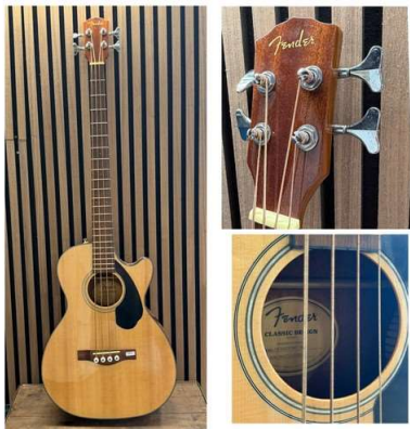
216. M - 2021 FENDER CD-60SCE DREADNOUGHT ACOUSTIC GUITAR - WALNUT - SERIAL NUMBER IWA21112109 - IN CASE - COST WHEN NEW £285