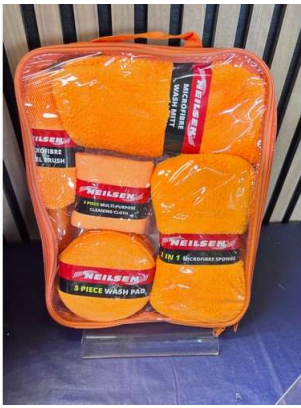
154. V - NEW NEILSEN 9 PIECE CAR WASH CLEANING TOOL KIT - CT6225