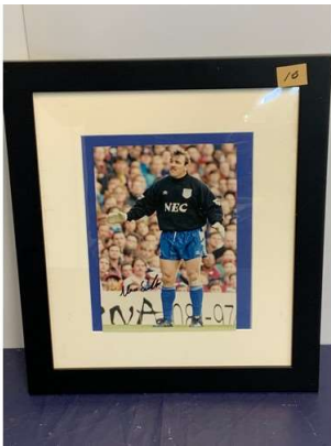
179. M - SIGNED PHOTO - NEVILLE SOUTHALL