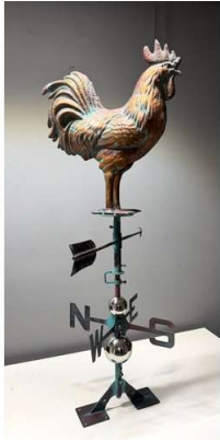
198. V - NEW 3D ROOSTER WEATHERVANE 114cm