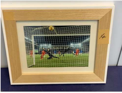
194. M - SIGNED EVERTON VS LIVERPOOL PHOTO - ALISSON LIVERPOOL