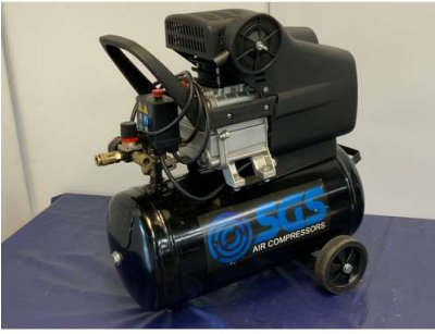
83. M - SGS 24L 240V COMPRESSOR - MODEL CE24