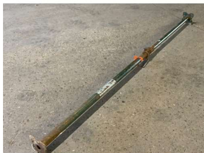
79. V - ACROP PROP