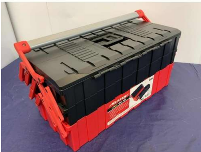
164. V - NEW NEILSEN TOOL BOX PLASTIC 5 TRAYS (5055282064672) CT6467