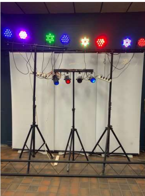
36. M - 3 SETS OF STAGE/DISCO LIGHTING ON STANDS APPROX COST WHEN NEW £618-£880