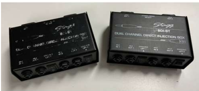
64I. M - 2 X STAGG SDI-ST DUAL CHANNEL DIRECT INJECTION BOX COST CEW £24.99 EACH