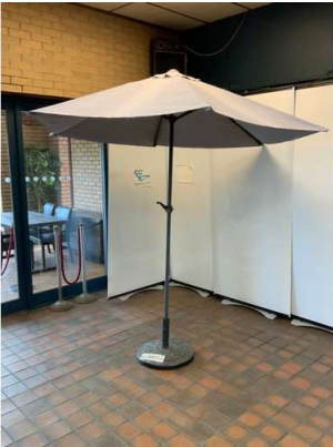
67. M - GREY PARASOL (NO STAND)