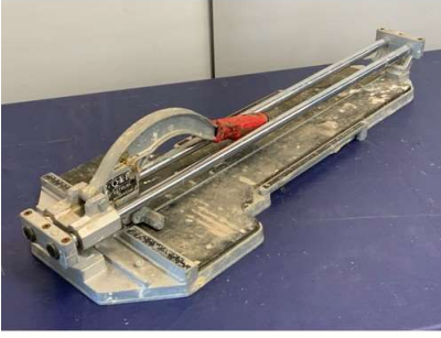
13. M - TILE SAW