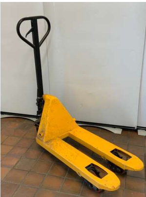
73. M - YELLOW PALLET TRUCK - 2500KG