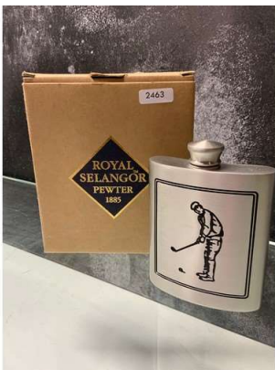
201. M - ROYAL SELANGOR PEWTER 1885 HIP FLASK - NEW