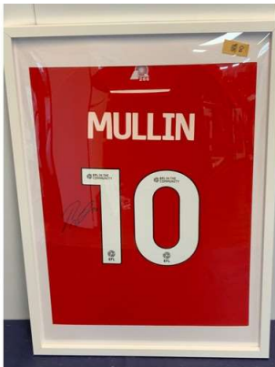
176. M - SIGNED WREXHAM SHIRT - PAUL MULLIN