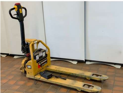
72. M - 2019 CAT ELECTRIC PALLET TRUCK - 48V WITH KEYS - MODEL NPPL12MPIP & CHARGER (IN WORKING OR BUT STICKS AT TIMES) COST WHEN NEW £1250