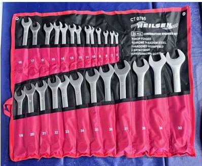
100. V - NEW NEILSEN 25 PIECE SATIN FINISH SPANNER SET - CT0795