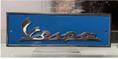
182. V - VESPA ALU PLAQUE 43CM