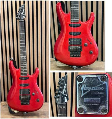
214. M - VINTAGE APPROX 1988 - IBANEZ 540R ELECTRIC RADIUS SERIES GUITAR IN JEWEL RED - SERIAL NUMBER 801473 IN CASE