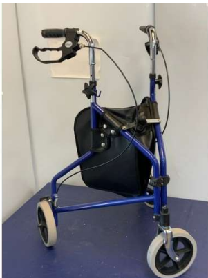
8. M - DRIVE BLUE THREE WHEEL STEEL TRI-WALKER ROLLATOR WITH BAG - COST NEW £66