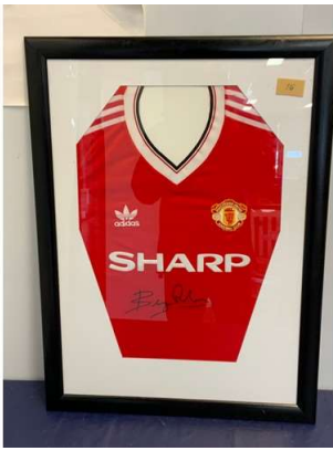
210. M - SIGNED MAN UTD SHIRT - BRYAN ROBSON - 9th MAY -CHESTER