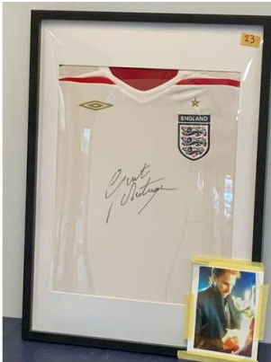
199. M - SIGNED ENGLAND SHIRT - GARETH SOUTHGATE WITH PHOTO