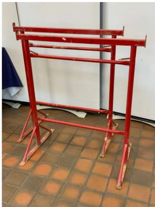
76. V - PR BUILDER TRESTLES