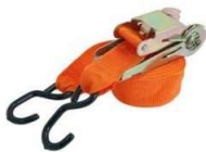
156. V - NEW RATCHET TIE DOWN STRAP - 7.5M (CT0510)