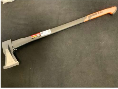
162. V - NEW NEILSON 200G AXE WITH FIBERGLASS HANDLE CT2534