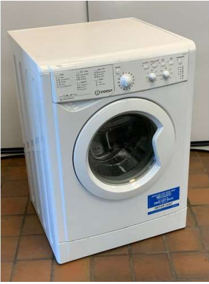
25. M - INDESIT IWC81252 WASHING MACHINE - COST WHEN NEW £270