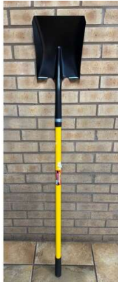
150. V - NEW NEILSEN SQUARE SHOVEL - 58" WITH FIBRE GLASS HANDLE & RUBBER GRIP (CT1149)