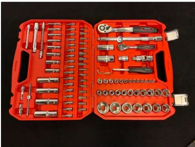
109. V - NEW NEILSON SOCKET SET - 94 PC - 1/4-1/2 INCH DRIVE & ACCESORIES CT0697