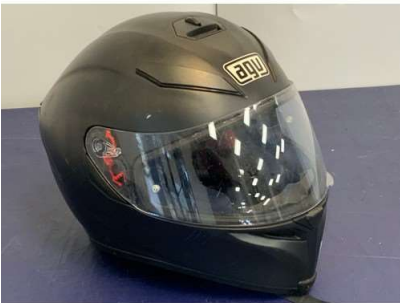
112. M - AGV K5 MOTORCYCLE HELMET (ML)