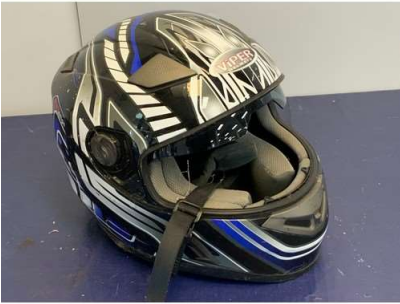
111. M - VIPER ECR 22-05 MOTORCYCLE HELMET (XS)