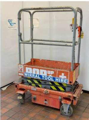
23. V - ELECTRIC POP UP PLUS MINI SCISSOR LIFT - COST WHEN NEW £5k-£6k