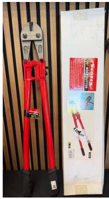
91. V - NEILSON 30" RED BOLT CUTTER (CT0297)