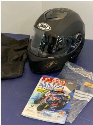
207. M - SIGNED MOTORBIKE HELMET - BSB - 2019 WITH PRO TICKET - 6TH MAY