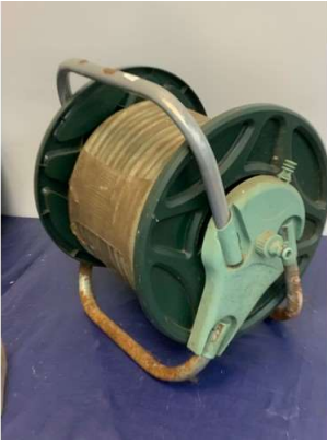
1. M - HOSE & REEL