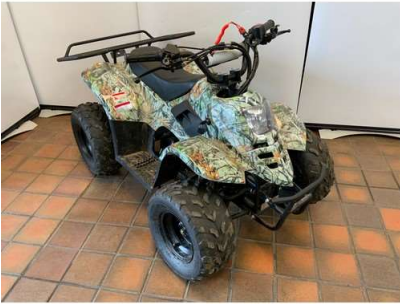
224. M - HAWKMOTO BOULDER 110CC KIDS QUAD - HUNTING CAMO COST NEW £695