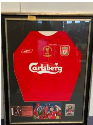
197. M - LIVERPOOL SHIRT - 2005 - STEVEN GERRARD (2005) - NAME ON THE BACK WITH SIGNED PHOTO