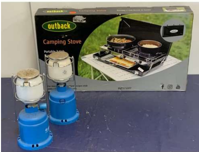
28. M - CAMPING STOVE & 2 X GAS LIGHTS