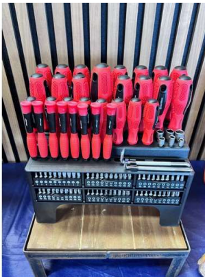
95. V - NEW NEILSEN 100 PIECE SCREWDRIVER BITS SET - CT2551