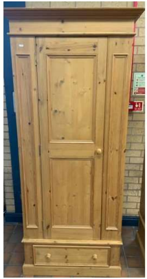
34. M - PINE SINGLE ROBE