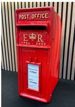
180. V - NEW ER 1926-2022 CAST POST BOX RED 57CM WITH KEY