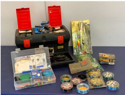
11. M - ZAG 19" TOOL BOX WITH FISHING TACKLE