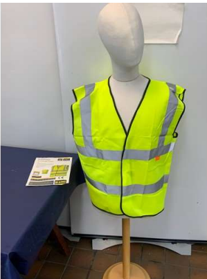
140. M - 10 x YELLOW HI VIS WAISTCOATS SIZE XXL TOTAL RRP APPROX £30-40