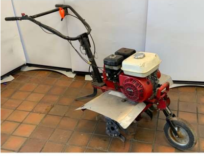
222. V - CAMON C2000 ROTOVATOR COST NEW £1400