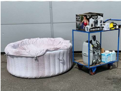
68. M - 4 PERSON LAZY SPA CANCUN WITH HEATER, PUMP & LOTS OF ACCESSORIES