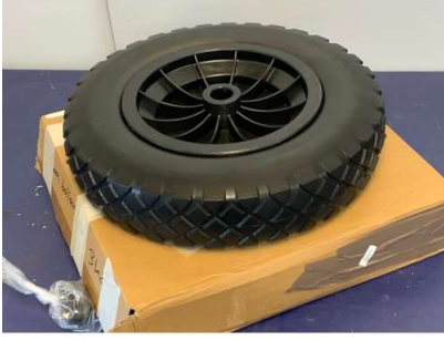
5. M - NEW WHEEL BARROW WHEEL