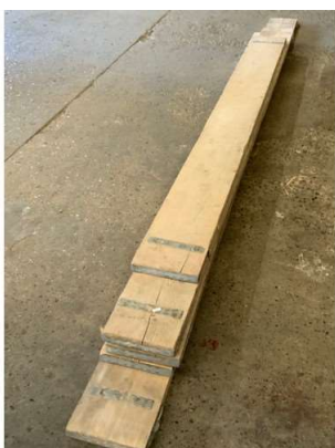
78. V - 5 X SCAFFOLD BOARDS VARIOUS LENGTHS