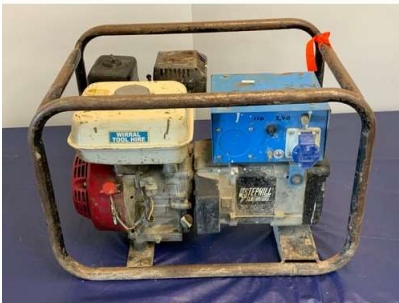
104. V - STEPHILL PETROL GENERATOR - 110/240V - MODEL NAC26B2/B