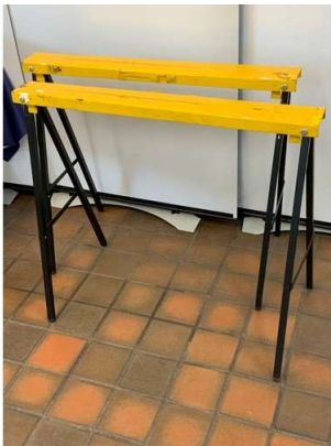
18. M - PR FOLDING TRESSLE SAWHORSES