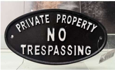
191. V - PRIVATE PROPERTY - NO TRESPASSING CAST SIGN -25cm