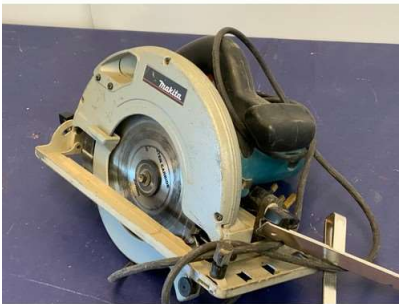
97. M - MAKITA 240V CIRCULAR SAW COST WHEN NEW APPROX £140