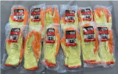
85. V - NEW NEILSEN 12 X CRINKLE LATEX COATED WORK GLOVE SIZE: 10" XL SINGLE (CT4970)