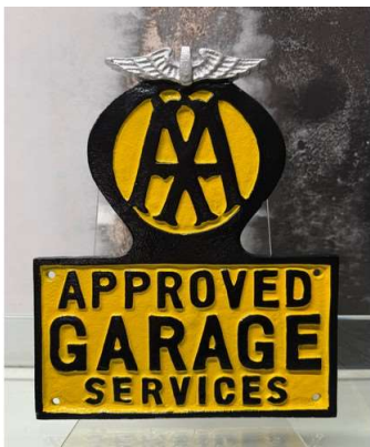
177. V - AA CAST WALL SIGN 29CM