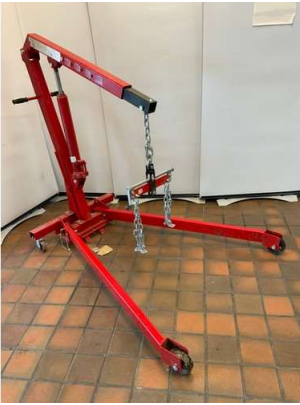
223. M - WARRIOR 1 TON HYDROLIC ENGINE HOIST - COST WHEN NEW APPROX £900