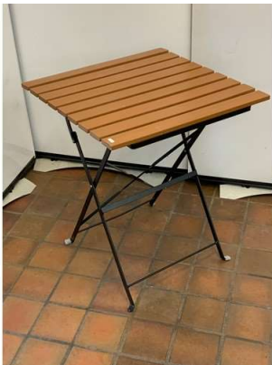
212. M - FOLDING TABLE