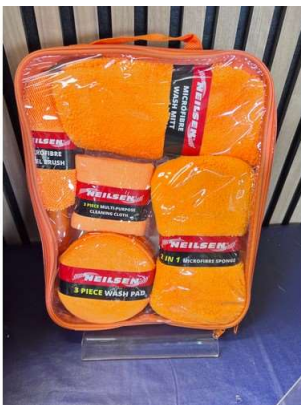
153. V - NEW NEILSEN 9 PIECE CAR WASH CLEANING TOOL KIT - CT6225