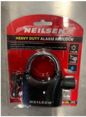
170. V - NEW NEILSEN HEAVY DUTY ALARM PADLOCK (CT3870)