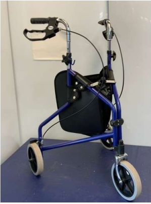
9. M - DRIVE BLUE THREE WHEEL STEEL TRI-WALKER ROLLATOR WITH BAG - COST NEW £66