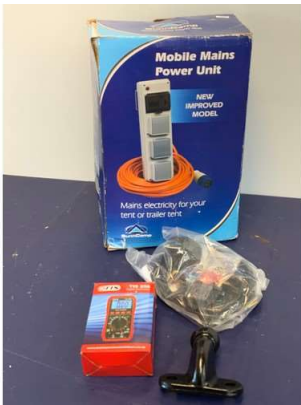
30. M - MAINS LEAD FOR CARAVAN, TOW BAR & ELECTRICS