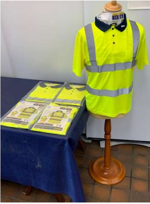
138. M - 6 X HYVIS YELLOW POLO SHIRTS SIZE XL TOTAL RRP APPROX £65-70