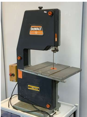
32. M - DEWALT 240V TABLE TOP BAND SAW - MODEL BS1310