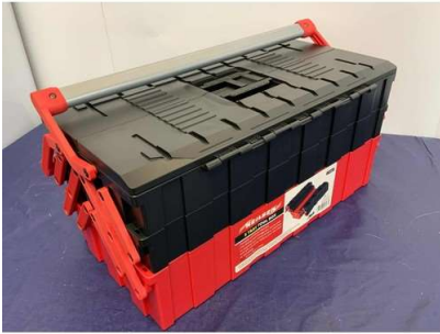
163. V - NEW NEILSEN TOOL BOX PLASTIC 5 TRAYS (5055282064672) CT6467