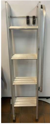
21. M - ALU LOFT LADDER