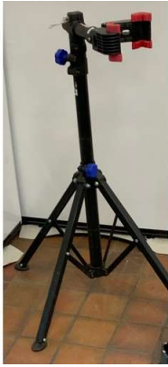
17. M - TOTAL BLEED RIDEWRAP TRIPOD BIKE REPAIR STAND - COST APPROX £39