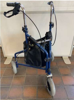
10. M - BLUE THREE WHEEL STEEL TRI-WALKER ROLLATOR WITH BAG - COST NEW £66