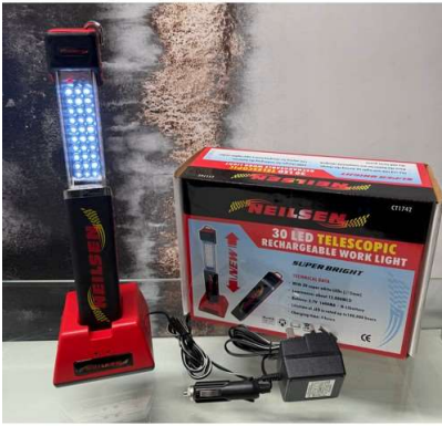
102. V - NEW 30 LED TELESCOPIC RECHARGEABLE WORK LIGHT (CT1742)