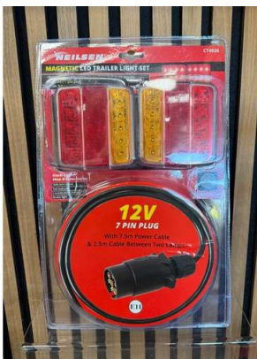
152. V - NEW NEILSEN MAGNETIC LED TRAILER LIGHT SET - CT4926