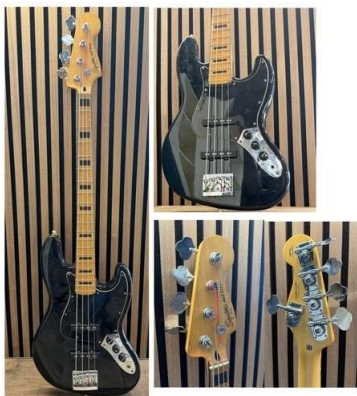
217. M - FENDER CLASSIC VIBE JAZZ '70'S JAZZ BASS IN BLACK - MAPLE FINGERBOARD - SERIAL NUMBER: IC070728500 -IN CASE- COST WHEN NEW £435