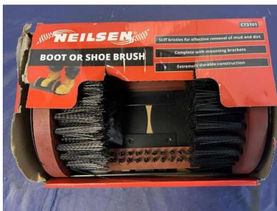
157. V - NEW NEILSEN SHOE BRUSH CT3101