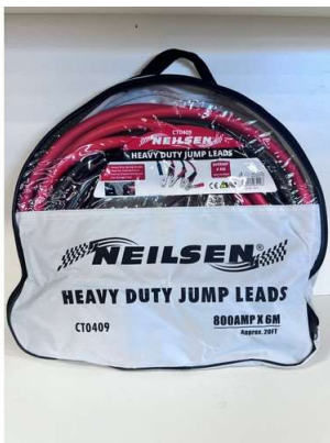
93. V - NEW NEILSEN 800 AMP HD JUMP LEADS 6M - CT0409