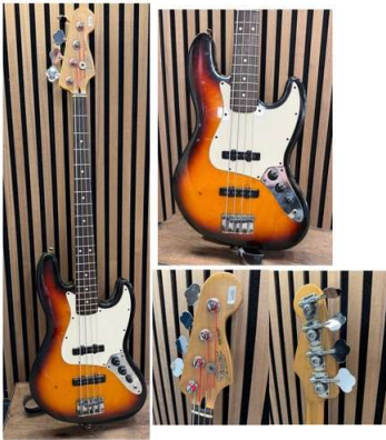
215. M - FENDER STANDARD JAZZ BASS GUITAR SERIAL NUMBER MZ2025617 IN THREE COLOUR SUNBURST FINISH APPROX 2002-2003. IN CASE - USED ONLINE PRICES £450-£550