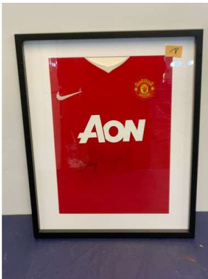
196. M - SIGNED MAN UTD SHIRT - GARY NEVILLE