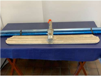
14. V - EASY FLOAT- CONCRETE BULL FLOOR FLOAT - COST WHEN NEW £357