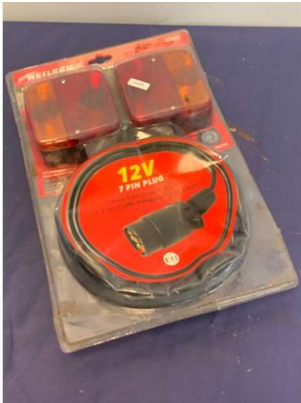
6. M - NEILSEN 12V MAGNETIC LIGHT