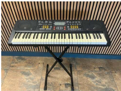
42. M - FREEDOM KB-668 ORGAN ON STAND - NO LEAD