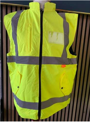
122. M - HI VIZ BODY WARMER - SIZE XL