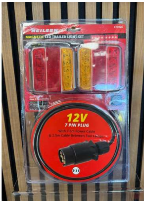
151. V - NEW NEILSEN MAGNETIC LED TRAILER LIGHT SET - CT4926