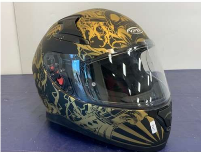
113. M - VIPER ECR 22-05 MOTORCYCLE HELMET (M)