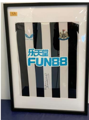
209. M - SIGNED NEWCASTLE SHIRT - PETER BEARDSLEY - 29th APRIL - CHESTER