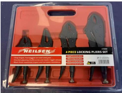
159. V - NEW NEILSEN LOCKING PLIERS - 4 PIECE SET - CT0980