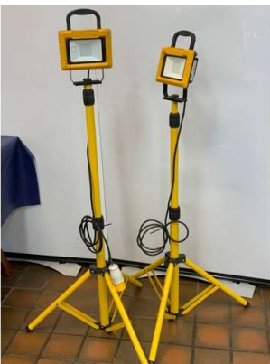
144. V - 2 X 110V LED WORK LIGHTS