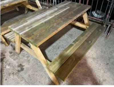
122. M - 4FT WOODEN GARDEN/PUB TABLE