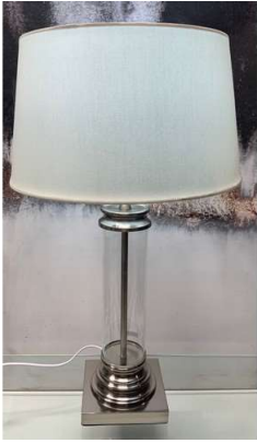
53. V - ASLAN TABLE LAMP RRP £115.99 (BULBS NOT INCLUDED)