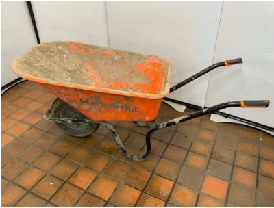
123. M - HAEMMERLIN ORANGE WHEEL BARROW - 120 LITRE - HEAVY DUTY