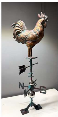
114. V - NEW 3D ROOSTER WEATHERVANE 114cm