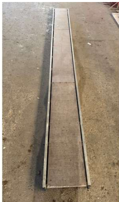
128. V - 16FT YOUNGMAN BOARD