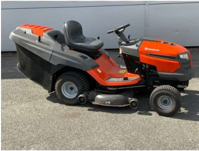
162. V - HUSQUAVARNA CTM 194 19HP RIDE ON MOWER WITH COLLECTION, HYDRO TRANSMISSION WITH KEY