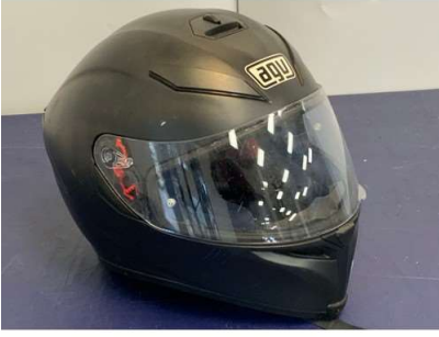
97. M - AGV K5 MOTORCYCLE HELMET (ML)