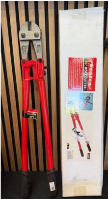
90. V - NEILSON 30" RED BOLT CUTTER (CT0297)