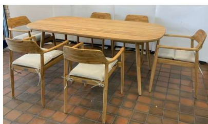
115. V - HIMMELMANN 6 - PERSON WOOD PATIO DINING SET WITH OVAL TABLE , CUSHIONS INCLUDED RRP £2259.99