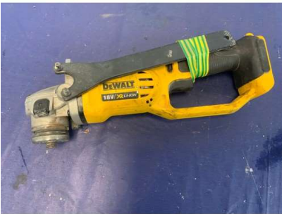
36. M - DEWALT CORDLESS ANGLE GRINDER (NO BATTERY) 18V - MODEL DCG412