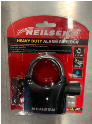
71. V - NEW NEILSEN HEAVY DUTY ALARM PADLOCK (CT3870)