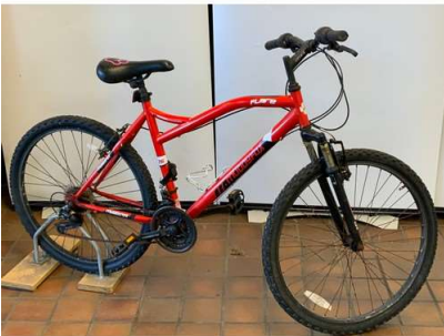
95. M - MUDDY FOX FLARE 26" MOUNTAIN BIKE