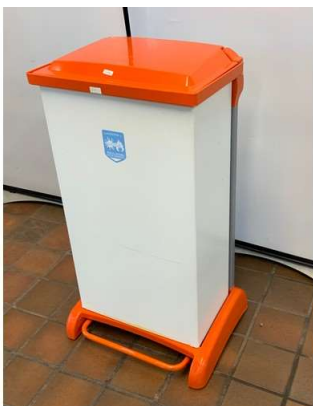
11. M - WYBONE 80 LITRE ORANGE PEDDLE BIN