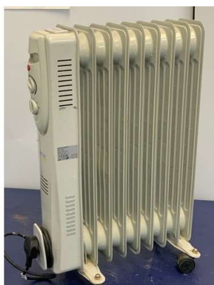
117. V - ARTIC 240V OIL FILLED RADIATOR