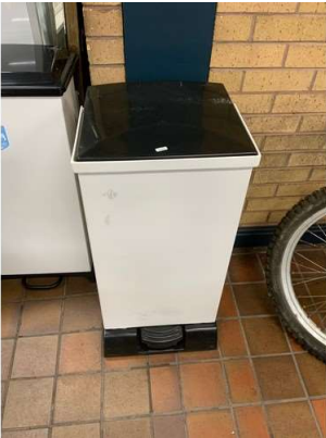
18. M - BLACK PLASTIC LID PEDDLE BIN