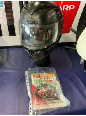
98. M - SIGNED MOTORBIKE HELMET - BSB 2019, SEPT WITH PROGRAMME & TICKET