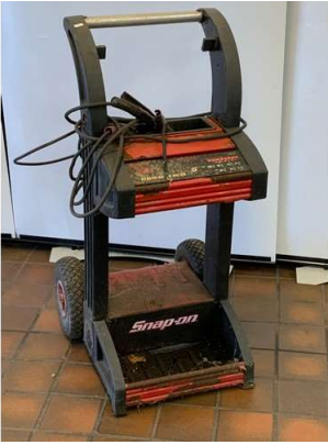
41. M - SNAP-ON EEBC500 BATTERY CHARGER PLUS COMPUTER SMART