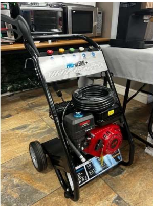
43. V - NEW PRO CLEAN+ 7.0HP HIGH PERFORMANCE PETROL PRESSURE WASHER (CT1757) OIL NEEDED