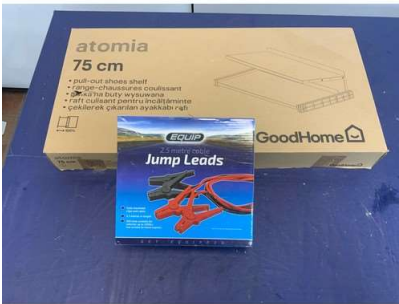
60. M - EQUIP 2.5 METRE JUMP LEADS & ATOMIA 75cm SHOE SHELF