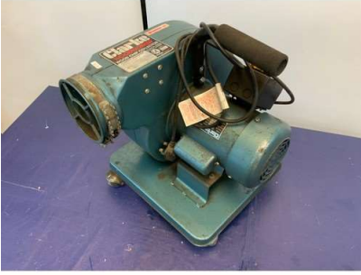
33. V - CLARKE WOODWORKER ELECTRIC WOOD CHIP COLLECTOR (FW100)