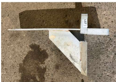
137. V - STRONG BOY