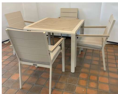
52. V - ARUBA OUTDOOR 4 SEATER DINING SET RRP £719.98