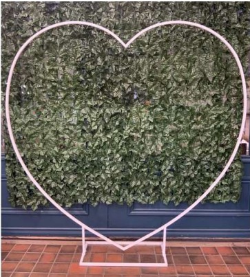
142. V - 220CM W X 220CM H IRON GARDEN ARCHES IN WHITE RRP £42.99