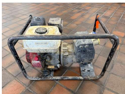
154. V - 2.7 KVA GENNY