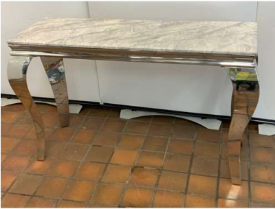
54. M - CHROME & MARBLE HALL TABLE