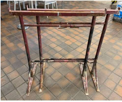
126. V - PR BUILDER TRESTLES