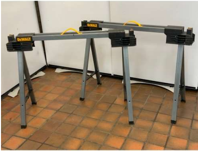
58. M - PR DEWALT TRESTLES