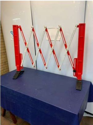
146. M - EXPANDABLE SAFETY BARRIER