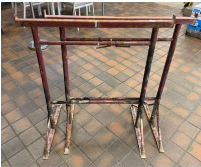
127. V - 2 X BUILDERS TRESTLES