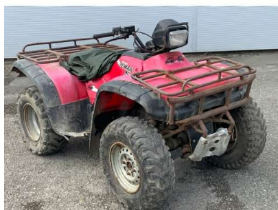
156. M - HONDA TRX450 FOREMAN ALL-TERRAIN QUAD