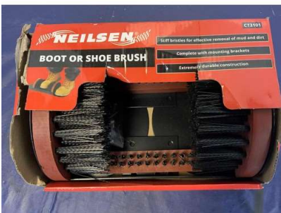
88. V - NEW NEISLEN SHOE BRUSH CT3101