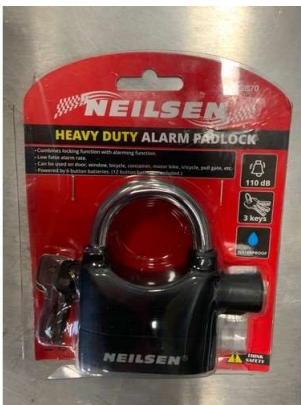
72. V - NEW NEILSEN HEAVY DUTY ALARM PADLOCK (CT3870)