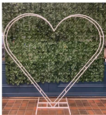
51. V - CHARNISHA 207CM W X 70CM D METAL ARBOUR IN WHITE RRP £75.99