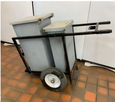
7. M - DOUBLE BINS WITH STREET BARROW