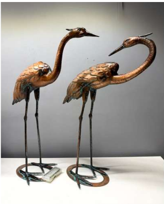
55. V - PAIR OF AGED COPPER 3D CRANES ON HEAVY METAL BASE - 77.5cm