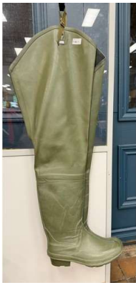
45. M - PAIR OF GREEN CEBO WADERS - SIZE 10