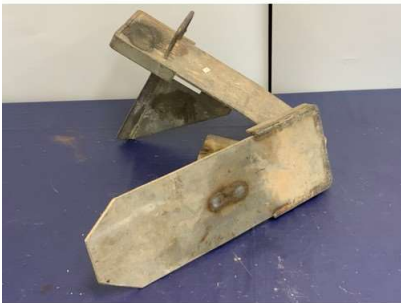
63. V - PR STRONG BOYS