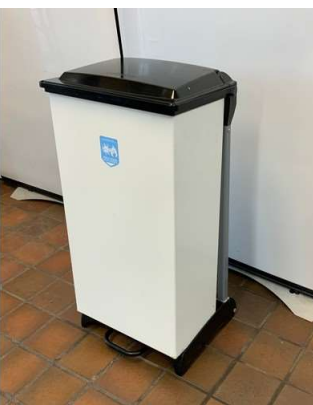
12. M - WYBONE 80 LITRE BLACK PEDDLE BIN