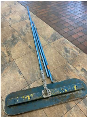
1. M - CONCRETE FLOAT