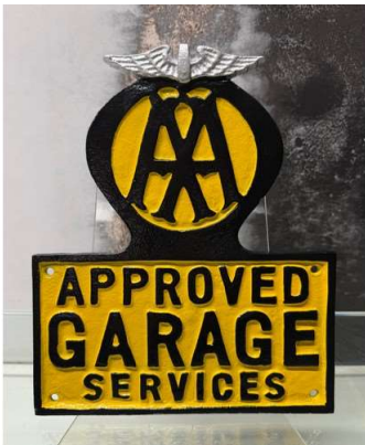
74. V - AA CAST WALL SIGN 29CM