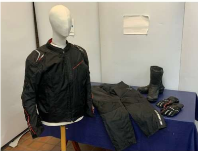
96. M - OXFORD ESTORIL 2.0 MOTORCYCLE JACKET SIZE 3XL & LEGGINGS & RST BOOTS SIZE 9, GLOVES