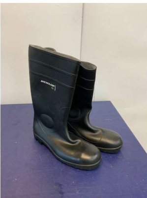
92. M - PAIR OF SIZE 11 DUNLOP WELLINGTON BOOTS