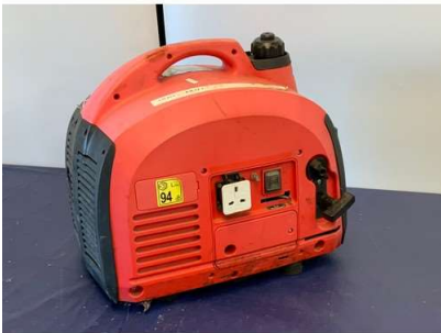
39. M - SWISS KRAFT PETROL GENERATOR (SK1800) 2KVA