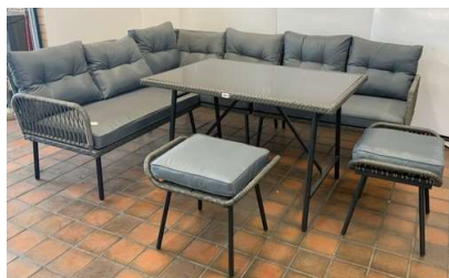
49. V - RATTAN SOFA SET RRP £375.99