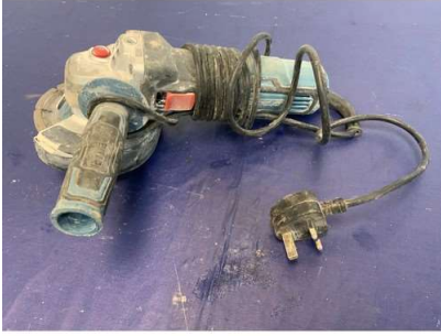
37. M - ERBAUER ELEC ANGLE GRINDER 24W - ERB977GRD