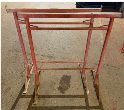
133. V - 2 X BUILDER TRESTLES