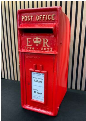
99. V - NEW ER 1926-2022 CAST POST BOX RED 57CM WITH KEY