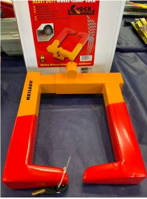
89. V - NEW NEILSEN HEAVY DUTY WHEEL CLAMP LOCK - CT4898