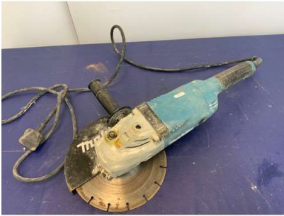
38. M - WORK ZONE 240V JIGSAW