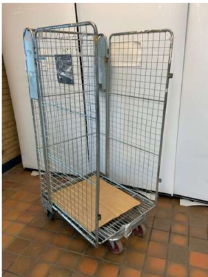
3. M - 3 SIDED MOBILE CAGE - NO DOOR