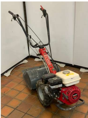
159. V - BENASSI REVERSO MC2300 PETROL DRIVEN CULTIVATOR