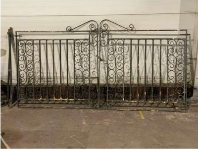
118. M - PR OF WROUGHT IRON GATES 8FT OPEN