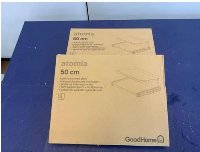
59. M - 2 X ATOMIA 50cm - PULL OUT SHOE SHELVES