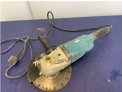
35. M - MAKITA 9" ANGLE GRINDER - 240V - MODEL GA9020S