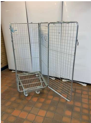
6. M - MOBILE CAGE