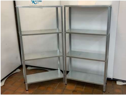
61. M - PAIR OF DISPLAY SHELVES