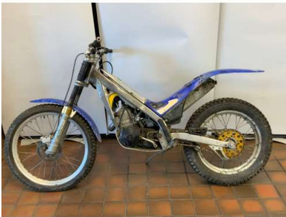
148. M - GAS GAS TRAILS BIKE