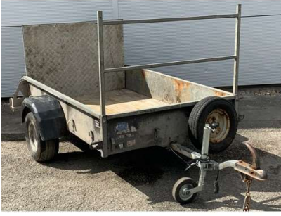
141. M - IVOR WILLIAMS SINGLE AXLE PLANT TRAILER 8FT X 5FT