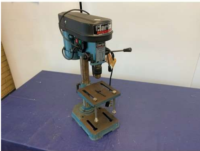
40. M - CLARKE METAL WORKER PILLAR DRILL CDP5DD