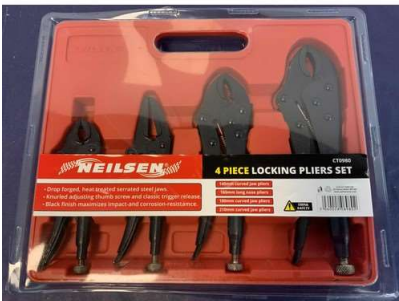
87. V - NEW NEILSEN LOCKING PLIERS - 4 PIECE SET - CT0980