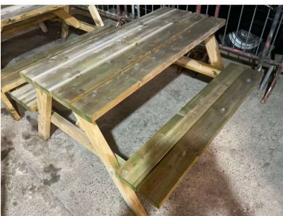
121. M - 4FT WOODEN GARDEN/PUB TABLE