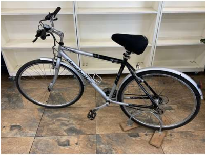
94. M - CLAUD BUTLER AL7005 CLASSIC BIKE