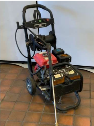
42. M - DTO 170D PETROL PRESSURE WASH