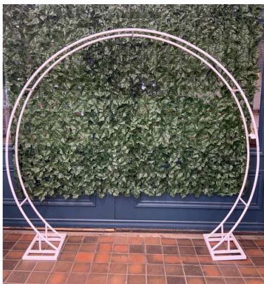
48. V - BEVINS IRON ARBOUR IN CLEAR RRP £66.99