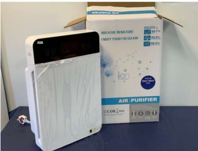
100. M - 'NEW' ION AIR PURIFIER WITH REMOTE CONTROL