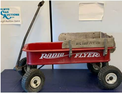
161. M - RADIO FLYER 4 WHEEL CREATIVITY CART