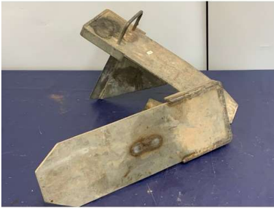
62. V - PR STRONG BOYS