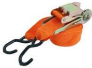
79. V - NEW RATCHET TIE DOWN STRAP - 7.5M (CT0510)