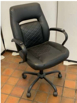
2. M - OFFICE CHAIR