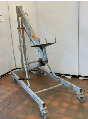
147. V - ETRAMO BEAM LIFTER - COST WHEN NEW APPROX £2000