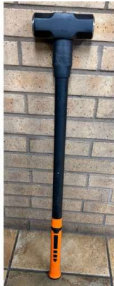
86. V - NEW SLEDGEHAMMER - 6 LB - HANDLE BONDED TO BODY HIGH QUALITY UNBREAKABLE FIBREGLASS CORE (CT1294)