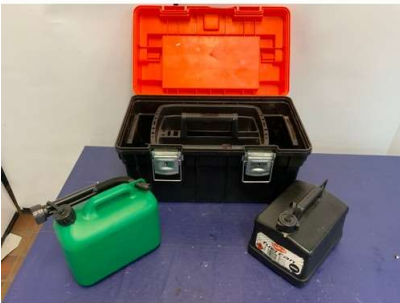
19. M - 2 X 5L FUEL CANS & 1 LARGE PLASTIC TOOL BOX