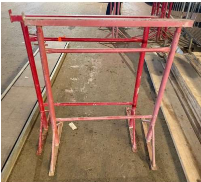
132. V - 2 X BUILDER TRESTLES