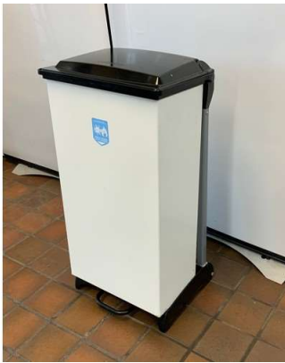
13. M - WYBONE 80 LITRE BLACK PEDDLE BIN