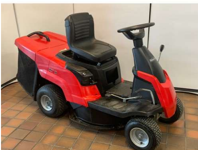
160. V - MOUNTFIELD 827H COMPACT RID EON MOWER - HYDROSTATIC TRANSMISSION, 6 CUTTING POSITIONS 30-76cm - WITH KEY COST WHEN NEW £2129+vat