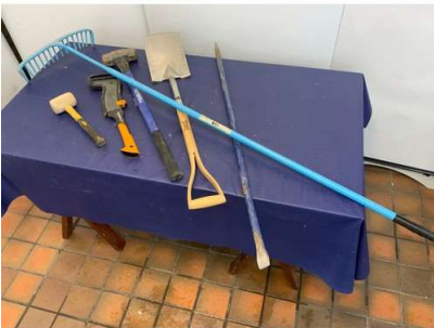
124. M - 6 GROUNDWORK TOOLS - WILKINSON SWORD SHOVEL, FAITHFUL SLEDGE HAMMER, FISKARS WOODXPERT BRUSH HOOK, HD RAKE, CLUB HAMMER & CROW BAR