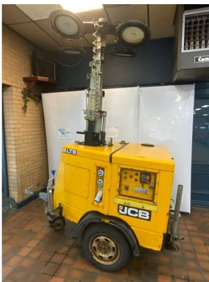
164. V - 2013 JCB LT9 9-METER, HYDRAULIC TELESCOPIC LIGHTING TOWER - 360° ROTATION - COST WHEN NEW APPROX £11K - SERIAL NUMBER 1696641