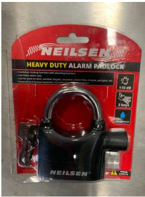
73. V - NEW NEILSEN HEAVY DUTY ALARM PADLOCK (CT3870)