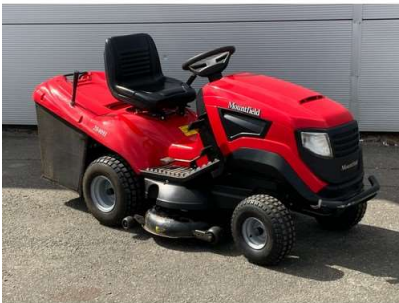
163. V - MOUNTFIELD 2040H PETROL RIDE ON MOWER HYDRO TRANSMISSION WITH COLLECTION, WITH KEY