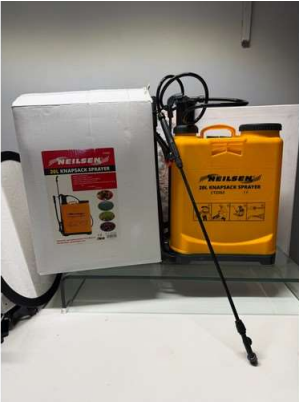
93. V - NEW NEILSEN 20 LITRE GARDEN SPRAYER WITH CARRY STRAPS, HEAVY DUTY TRIGGER CONTROL (CT2352)