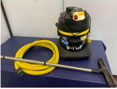
57. V - V-TUF 21 LITRE WET & DRY VAC