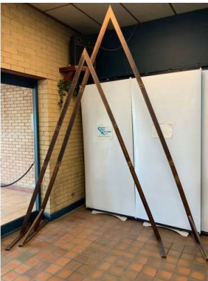
143. V - 210CM W X 80CM D SOLID WOOD ARBOUR IN BROWN RRP £113.99