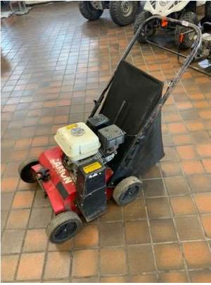
145. V - CAMON LS42 PETROL LAWN SCARIFIER WITH HONDA GX160 ENGINE