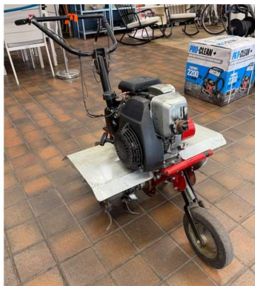
153. V - CAMON ROTOVATOR MERRY TILLER WITH HONDA GX160 PETROL ENGINE