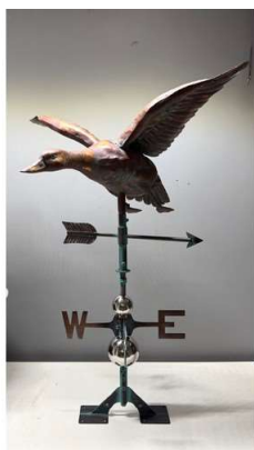
50. V - COPPER FLYING DUCK / GOOSE WEATHERVANE - 99cm