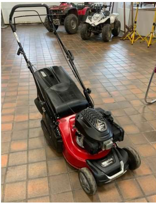
157. V - MOUNTFIELD SP PTEROL MOWER S421R PD WITH COLLECTION