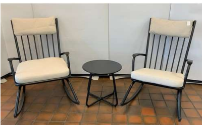
56. V - 2- PERSON SEATING GROUP WITH CUSHIONS & CHRISTOS SIDE TABLE RRP £278.98