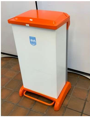
9. M - WYBONE 80 LITRE ORANGE PEDDLE BIN