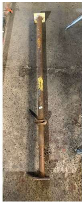
130. V - ACRO PROP