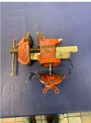
20. M - RECORD 74 BENCH VICE