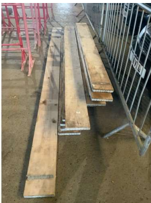
129. V - 14 X SCAFFOLD BOARDS