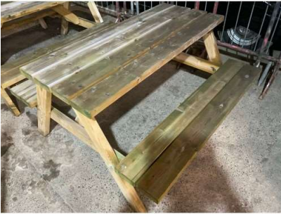
119. M - 4FT WOODEN GARDEN/PUB TABLE