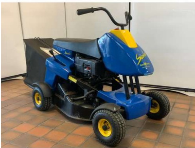
158. V - WOLF- GARTEN SCOOTER SV4 RIDE ON MOWER WITH COLLECTION WITH KEY cost when new approx £1100