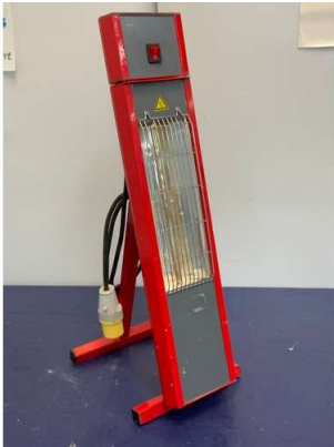
111. V - 110V ELITE HEAT 1900 HALOGEN HEATER