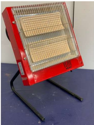
112. V - ELITE HEAT CERAMIC HEATER - 2800W - MODEL EHC240