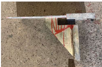
136. V - STRONG BOY