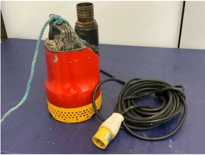
34. V - 110V SUMP WATER PUMP