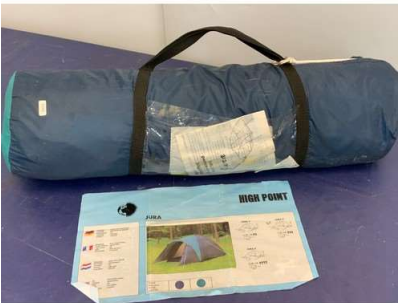
91. M - HIGH POINT DOME NYLON TENT