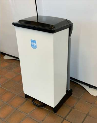
17. M - WYBONE 80 LITRE BLACK PEDDLE BIN