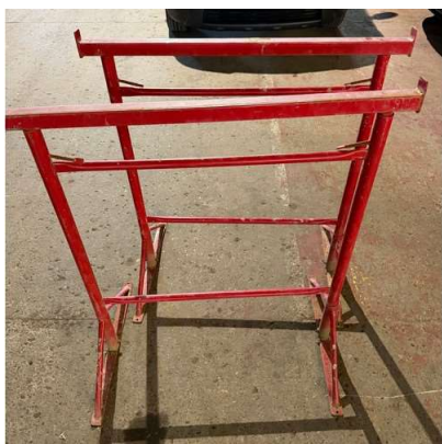
135. V - 2 X BUILDER TRESTLES