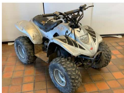
155. M - APACHE 100CC JUNIOR QUAD BIKE