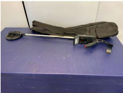
64. M - METAL DETECTOR WITH BAG - 9V